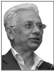
■ C P Gajurel

The first president of the Republic of Nepal notified the Communist Party of Nepal (Maoist) to 'form the government of national consensus' within seven days. Until this moment, the CPN-M had carried out a thorough discussion with most of the parties, big and small, that are represented in the CA to arrive at a consensus in forming the government. There has been comprehensive discussion among the four major parties; the CPN-M, the Nepali Congress (NC), the CPN-UML, and the Madhesi Janadhikar Forum (MJAF) for the last three days. The meeting has decided to form a task group from all the four parties to prepare a draft of consensus regarding the 'policy and programme' of the future government. Until this moment arrives, the parties have a common understanding that 'in principle,' the government should be headed by the CPN-Maoist. It is well-accepted that the Maoist party has the right to form the new government by virtue of being the single largest party in the CA. Therefore, this understanding cannot be considered as a significant development in the process of forming the government.