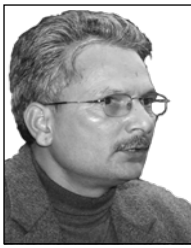
■ Baburam Bhattarai

Today, the history of Nepal will be written in gold. We have ended the epoch of the rule of feudalist monarchy, and entered into the era of Federal Democratic Republic. Unfortunately, for four months we were unable to elect our chariot driver for the new era. At the moment, we can hear the cries and excuses of the defeated. We know that the old train driver who drove the train for many years had become too old to drive. But he refused to hand over the authority to the new younger driver. Instead, he tried to pull the train back.