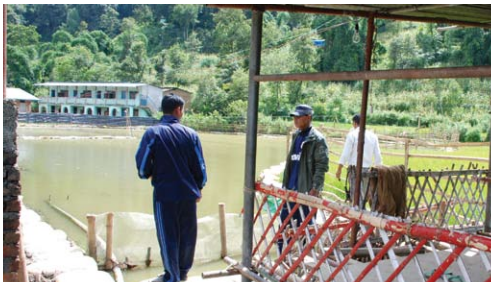
YCL cadres standing by a collective fishpond in Kathmandu

In the context of changing the structural form