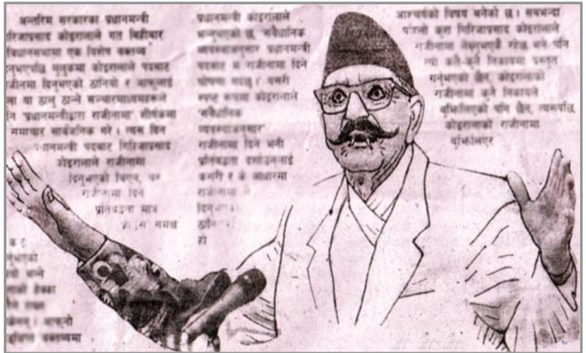
The real face of Koirala? 'Ghatana Ra Bichar', a Nepali Congress leaning newspaper published this cartoon on 2nd July reporting that Koirala will show his real face.

pretends it is a democratic party; if so, it should accept defeat and step aside and let the victorious Maoist form the new government. To be so greedy for power is to ridicule democracy. The NC has been punished by the people; it is not in a position to preach about democracy to anyone else. The NC should look in the mirror, and ask itself about its own democratic credentials. Who are the NC to tell the Maoist what to do