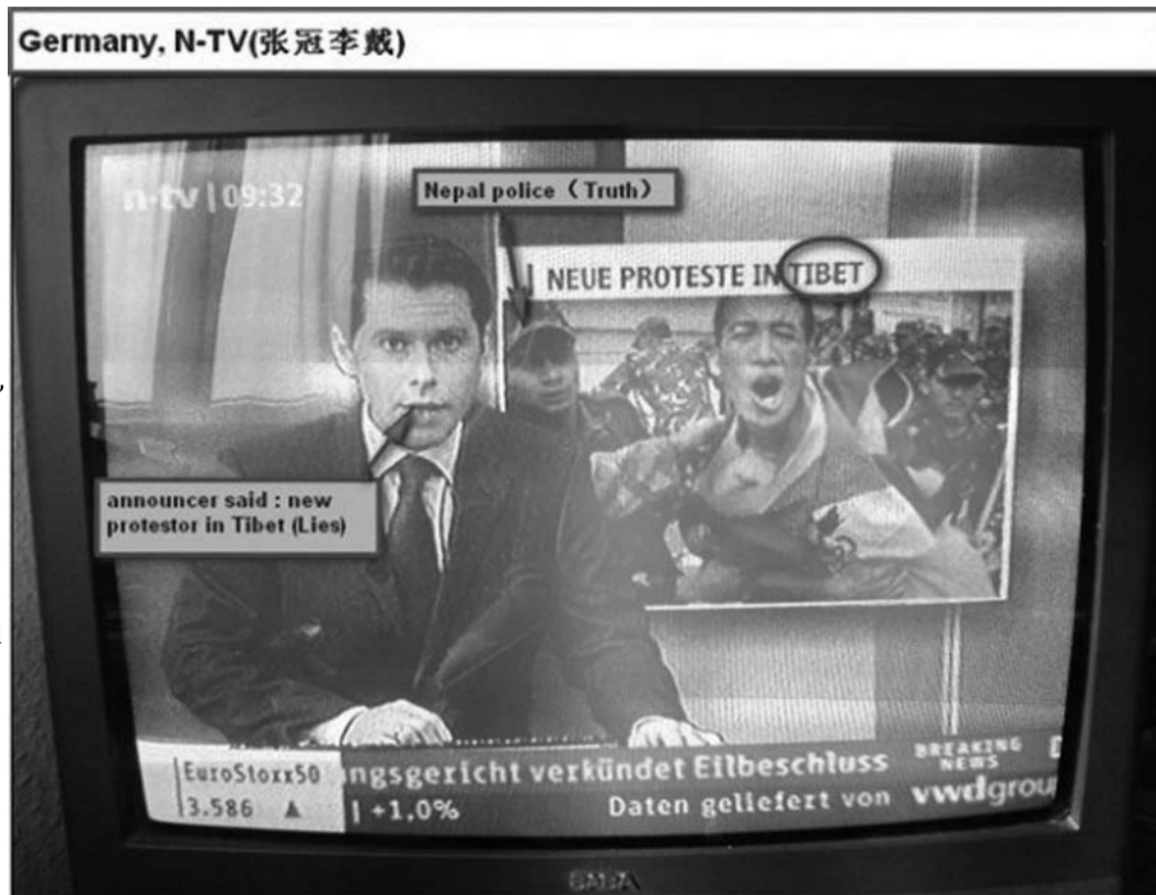
Some international media mis-reported the Tibetan unrest. The above German N-TV portrayed incidents in Nepal as happening in Tibet.

Some Nepal media are also supporting the Tibetan protests. A large media house, that has connections with Indian big business, places much emphasis on these protests, as do the international media such as CNN. Countries like the US are interfering in Nepal to attack China. The US state department made a statement: 'to ensure humane treatment of peaceful protesters'. The US still believes that it has some kind of moral legitimacy to make these kinds of demands, but the US not have any moral legitimacy left anywhere in the world to make such demands; after all, look at Afghanistan, Iraq, the treatment of prisoners in Abu Gharaib, Guantanamo bay etc.