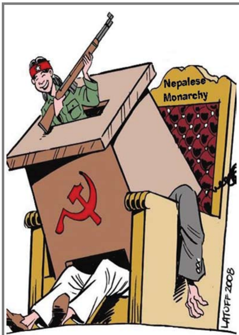
This cartoon was published in Greek Revolutionary Newspaper "ARISTORA!" on May 30, 2008.

replaced the Monarchy. The NC, with the backing of expansionist and the assistance of so-called Madhesi leaders is trying to ambush the patriotic, democratic and leftist forces along with the Maoist. The real democratic, progressive and leftist forces have two options; either to surrender or prepare to fight for a pro-people and independent Republic. Only the second option can save revolution and national sovereignty.