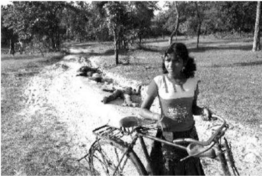
A girl walks past dead bodies of policemen

He said the naxalites took positions from a vantage point and opened fire on the police party without giving them any chance to fight back. The Maoists took away one LMG, an AK 47 rifle, five SLRs, two Insas rifles and two 303 rifles. The Maoists were also aware of the fact that the police party ventures out of Pamedu village on either the second or third of every month to receive the "barthan party"