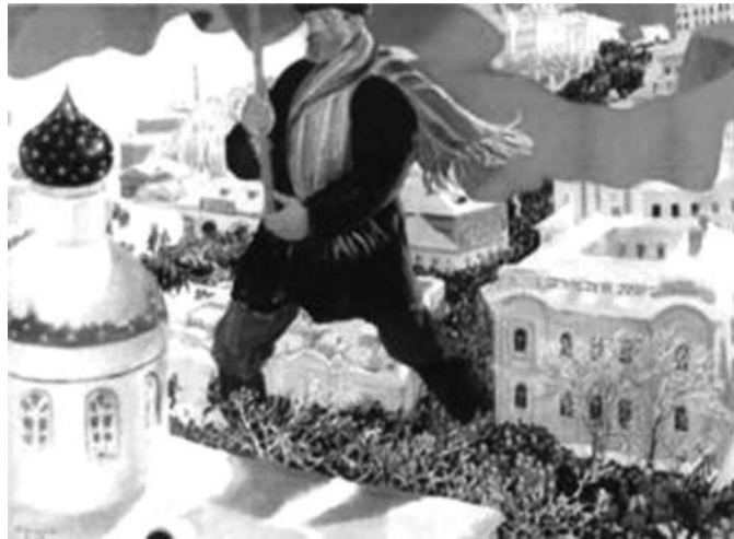
A poster from the Russian Socialist Revolution

Communist leaders V I Lenin and J V Stalin, one third of the world was liberated. After the death of Stalin and Mao, there was stagnation in socialist progress.