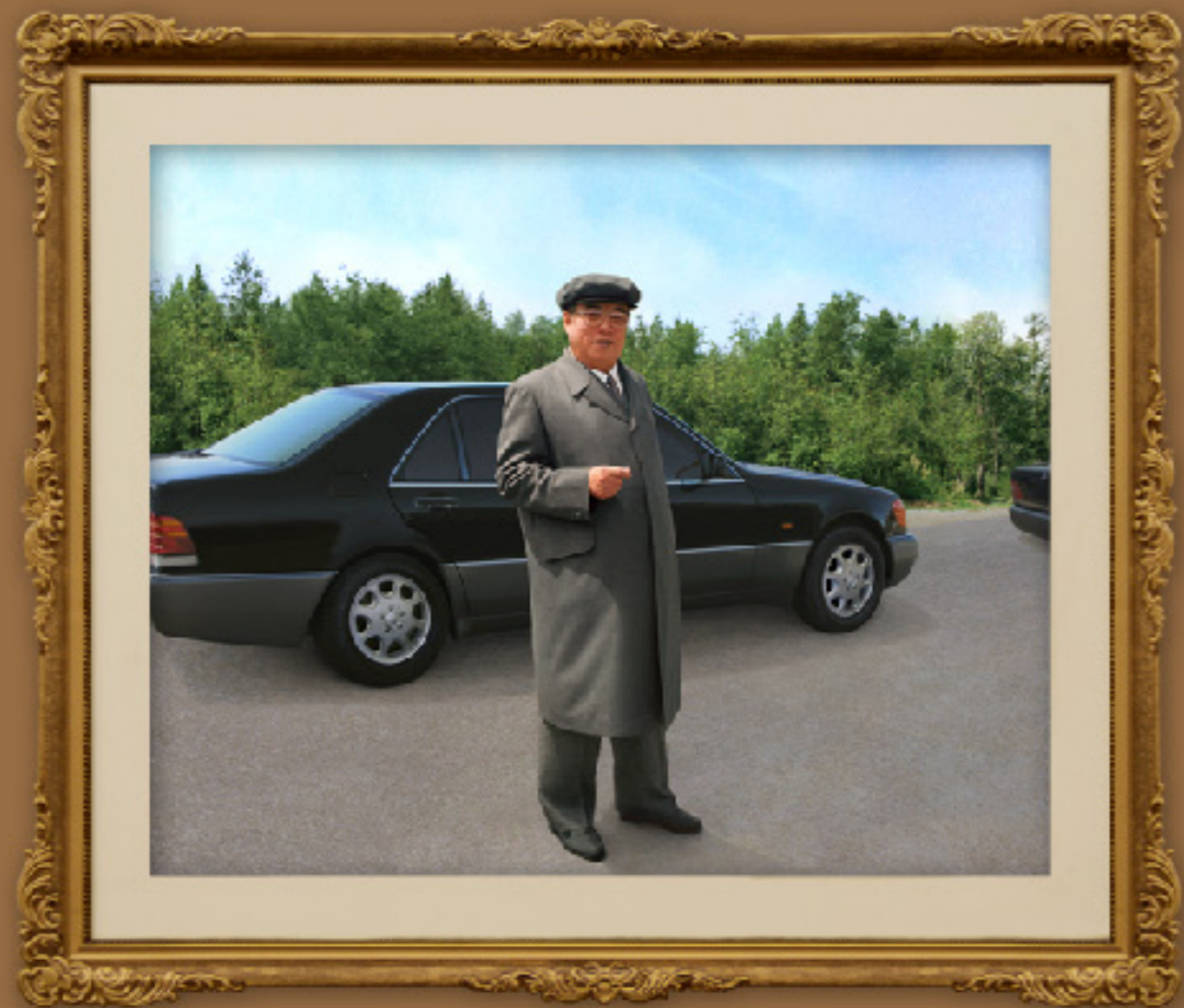
Car used by President Kim Il Sung in the last period of his life