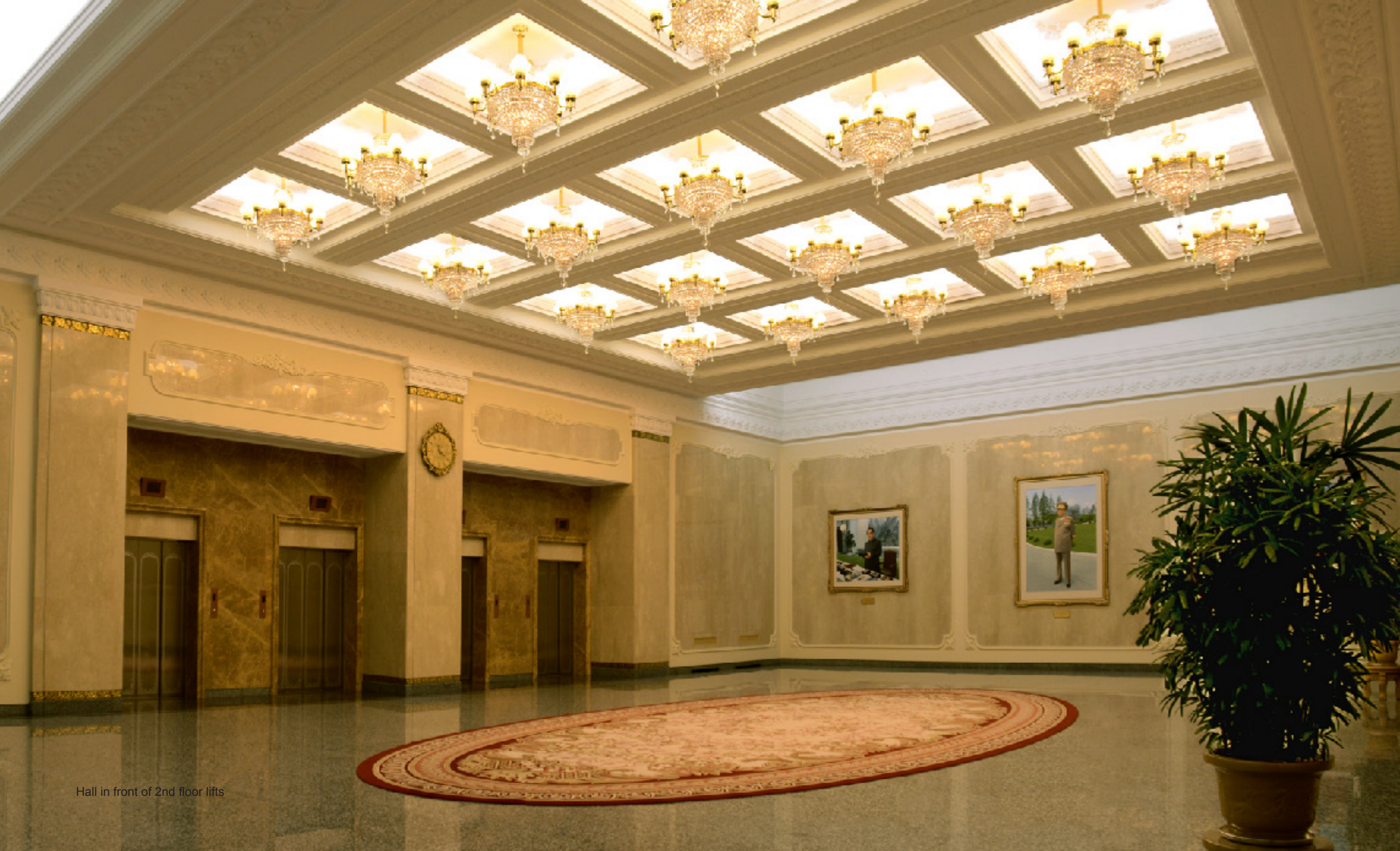
Hall in front of 2nd floor lifts