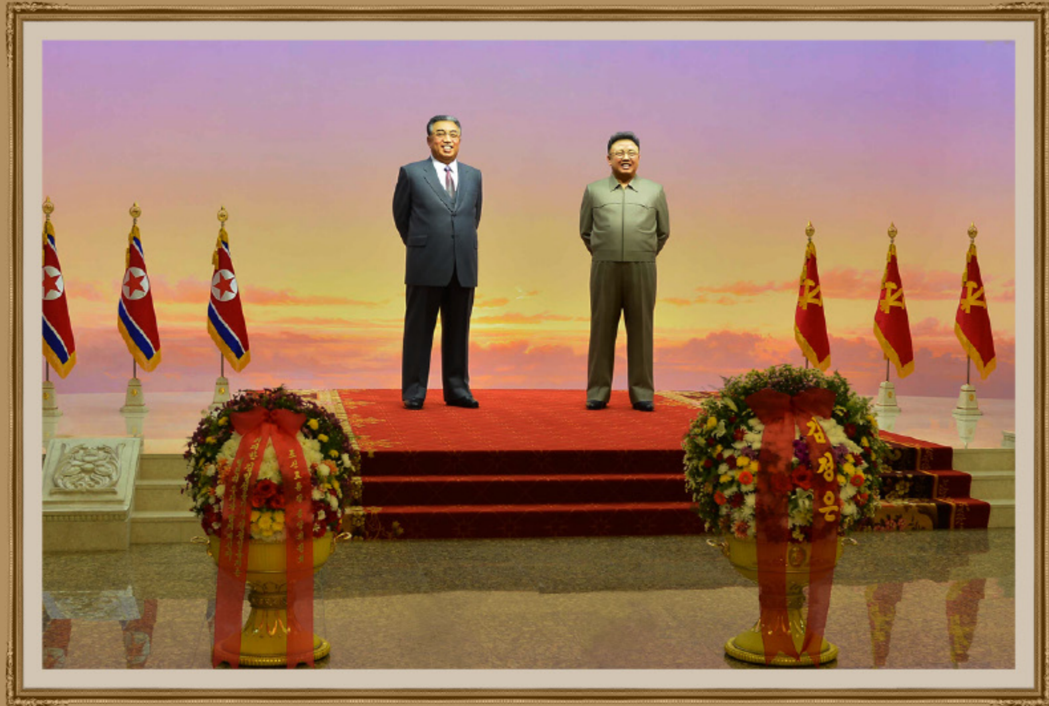
Statues of President Kim Il Sung and Chairman Kim Jong Il