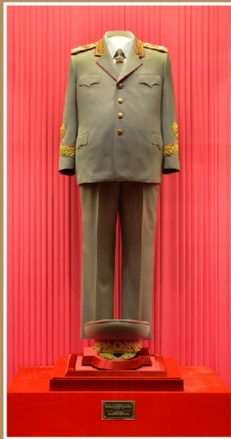
Uniform of Generalissimo of the DPRK