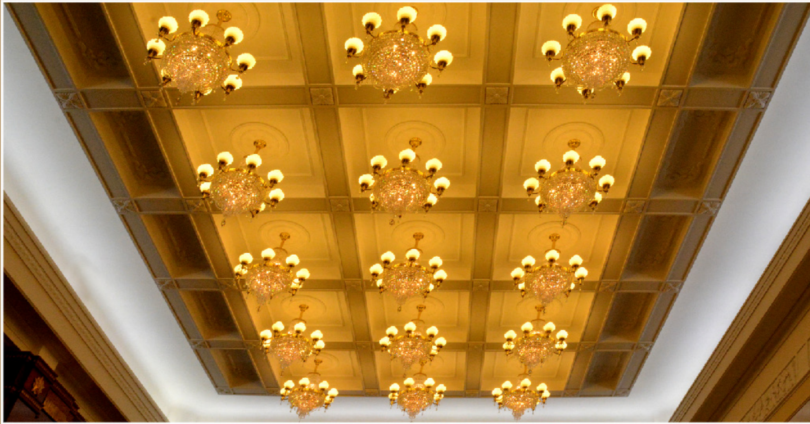
Chandeliers over the grand staircase