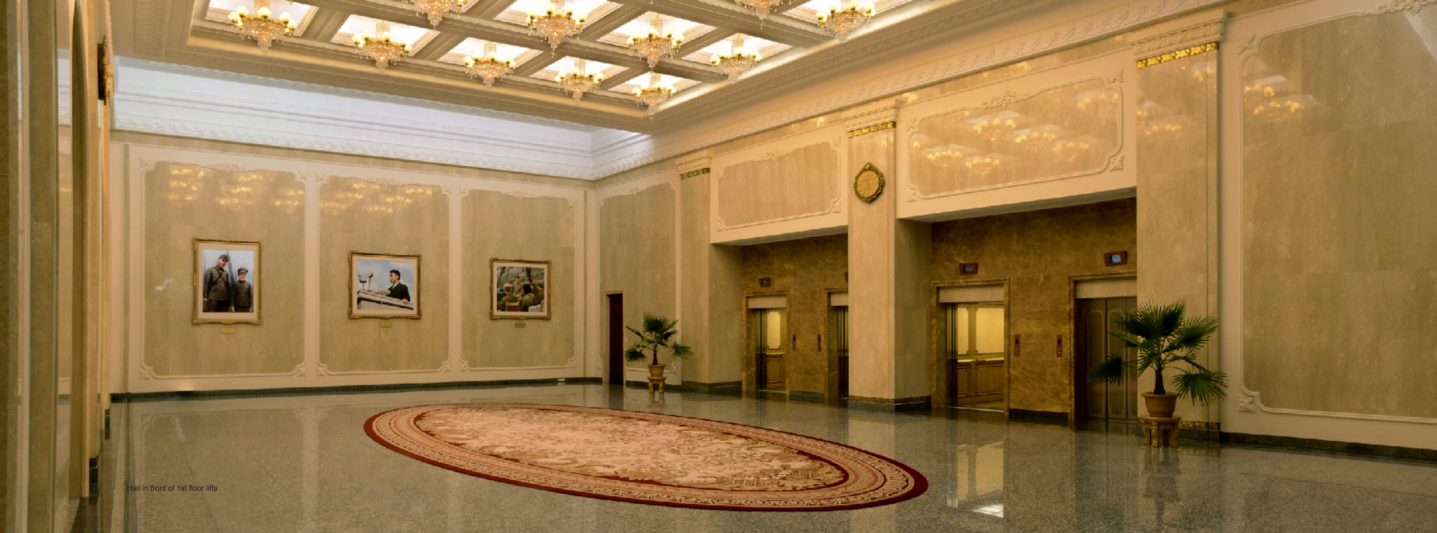
Hall in front of 1st floor lifts