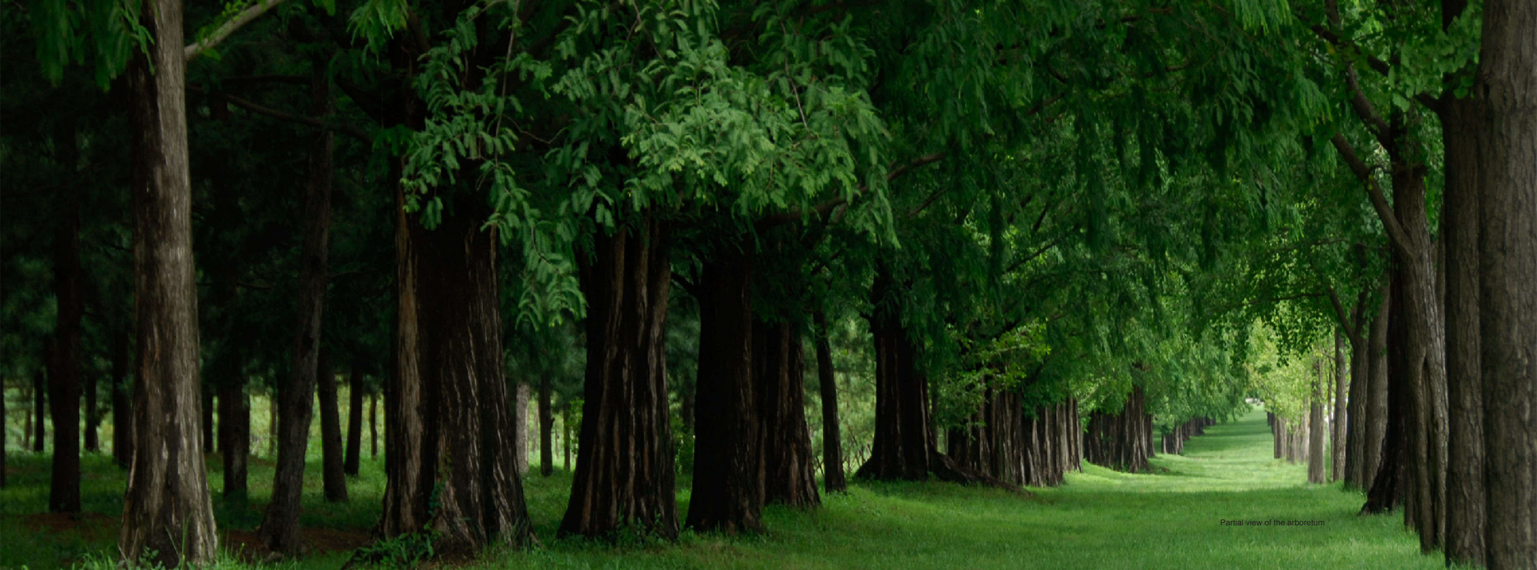
Partial view of the arboretum