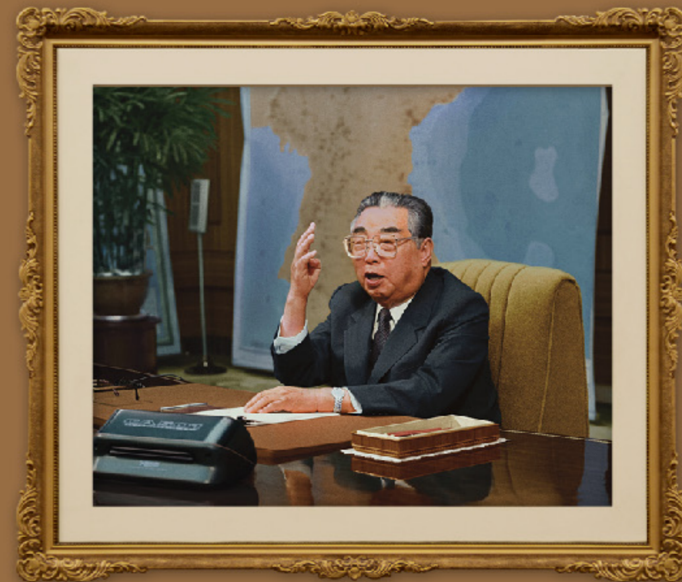
President Kim Il Sung presides over a consultative meeting of senior officials in the economic sector (July 6, 1994)