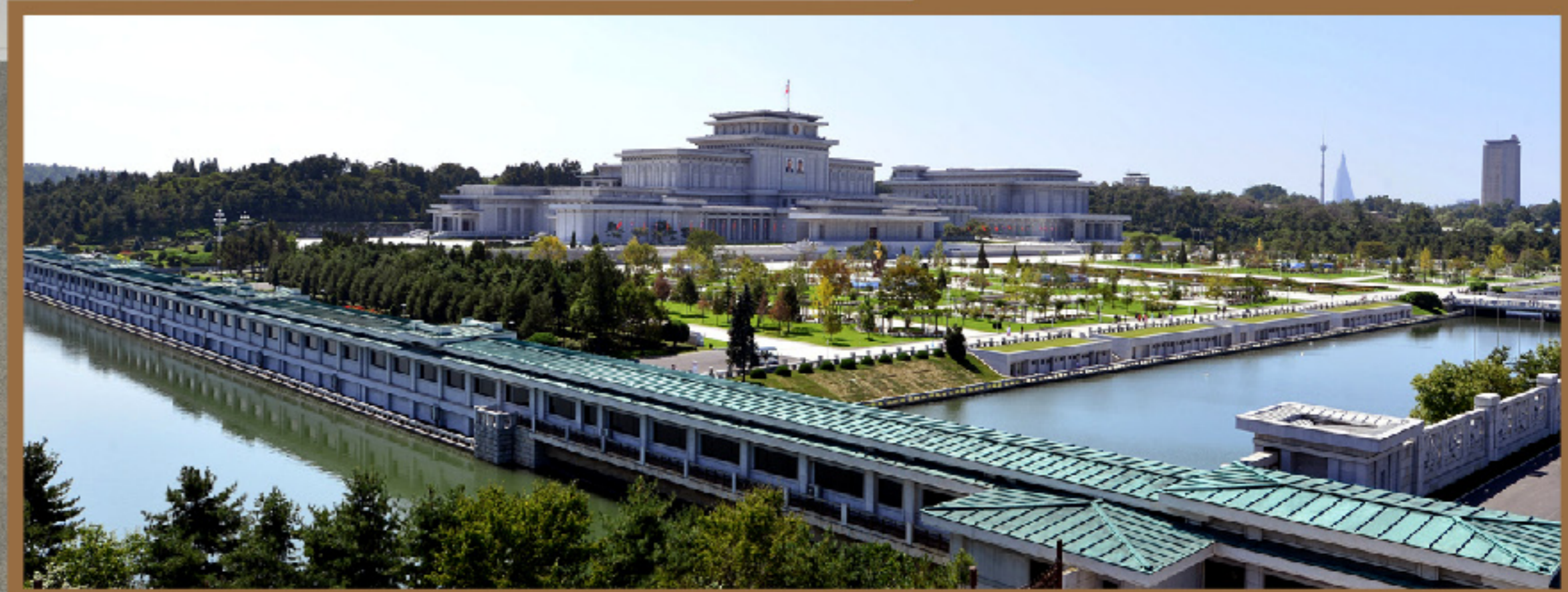
Travelator in the access corridor

The access corridor has been so designed that the Korean people yearning for their great leaders can visit the Kumsusan Palace of the Sun all the year round, irrespective of climatic conditions.