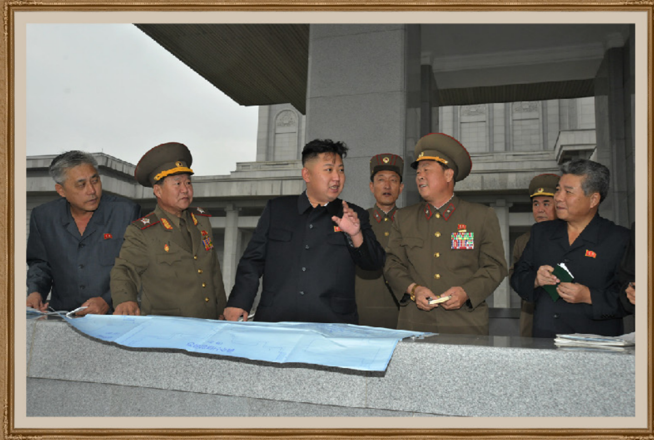
Supreme leader Kim Jong Un specifies the direction and ways for laying out the Kumsusan Palace of the Sun splendidly as befits the sacred place of the sun