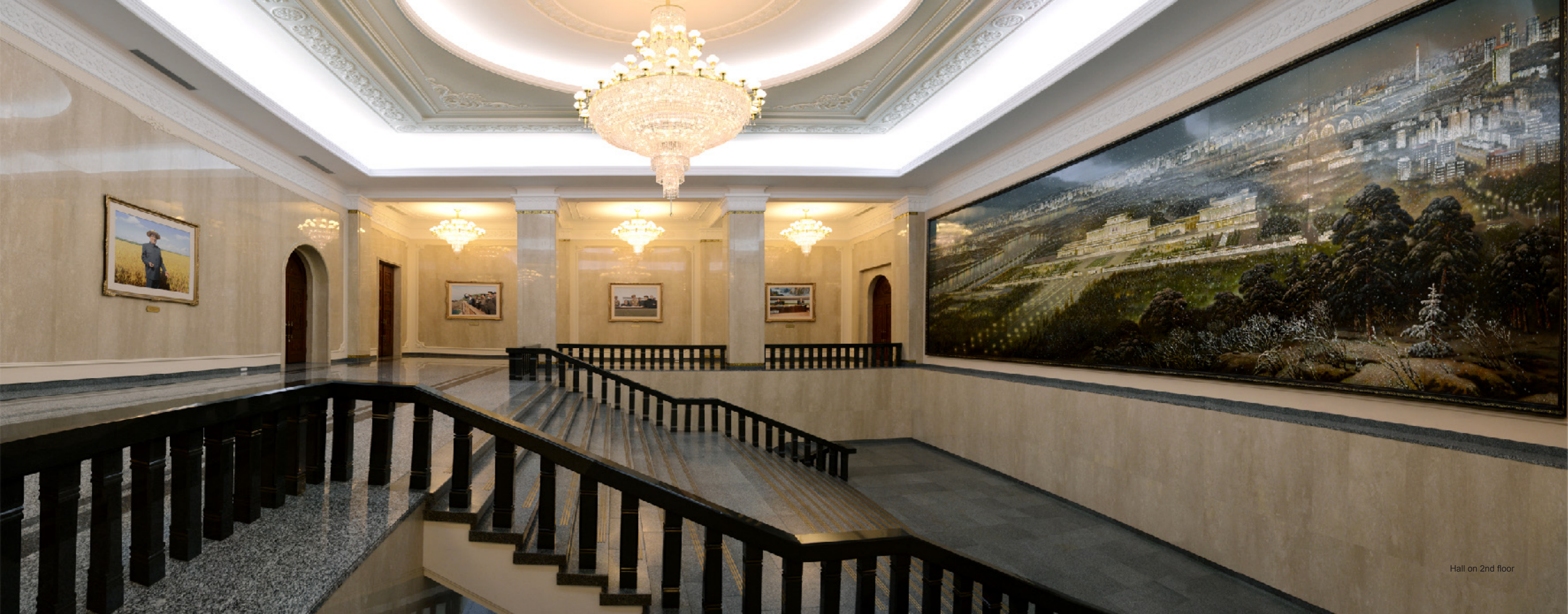
Hall on 2nd floor