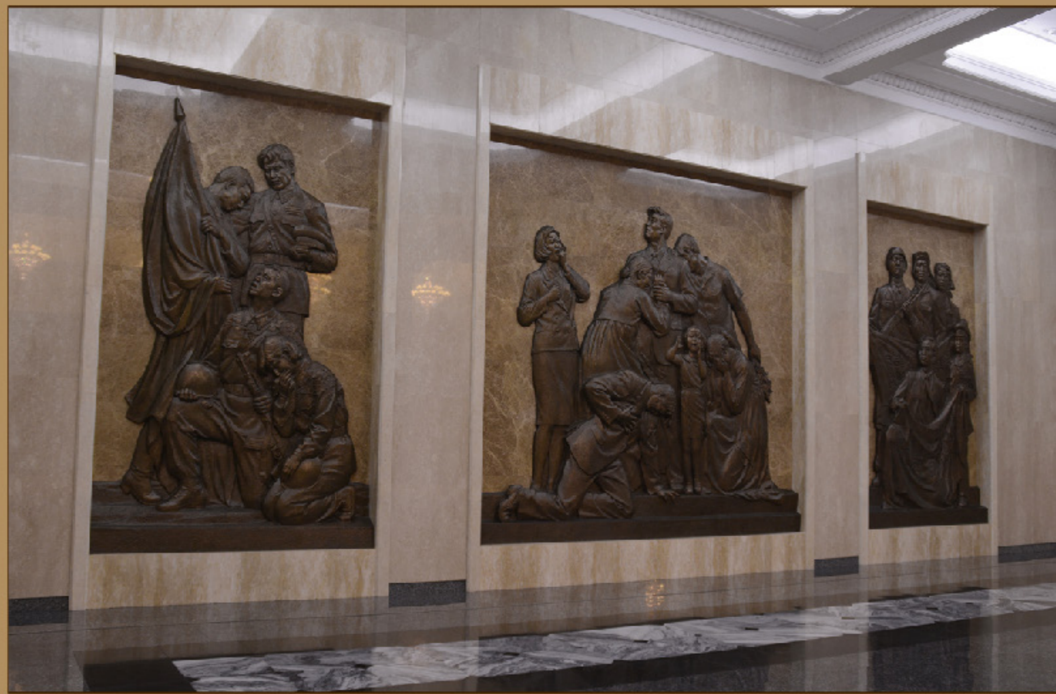
Bronze relief sculptures in the Hall of Lamentation