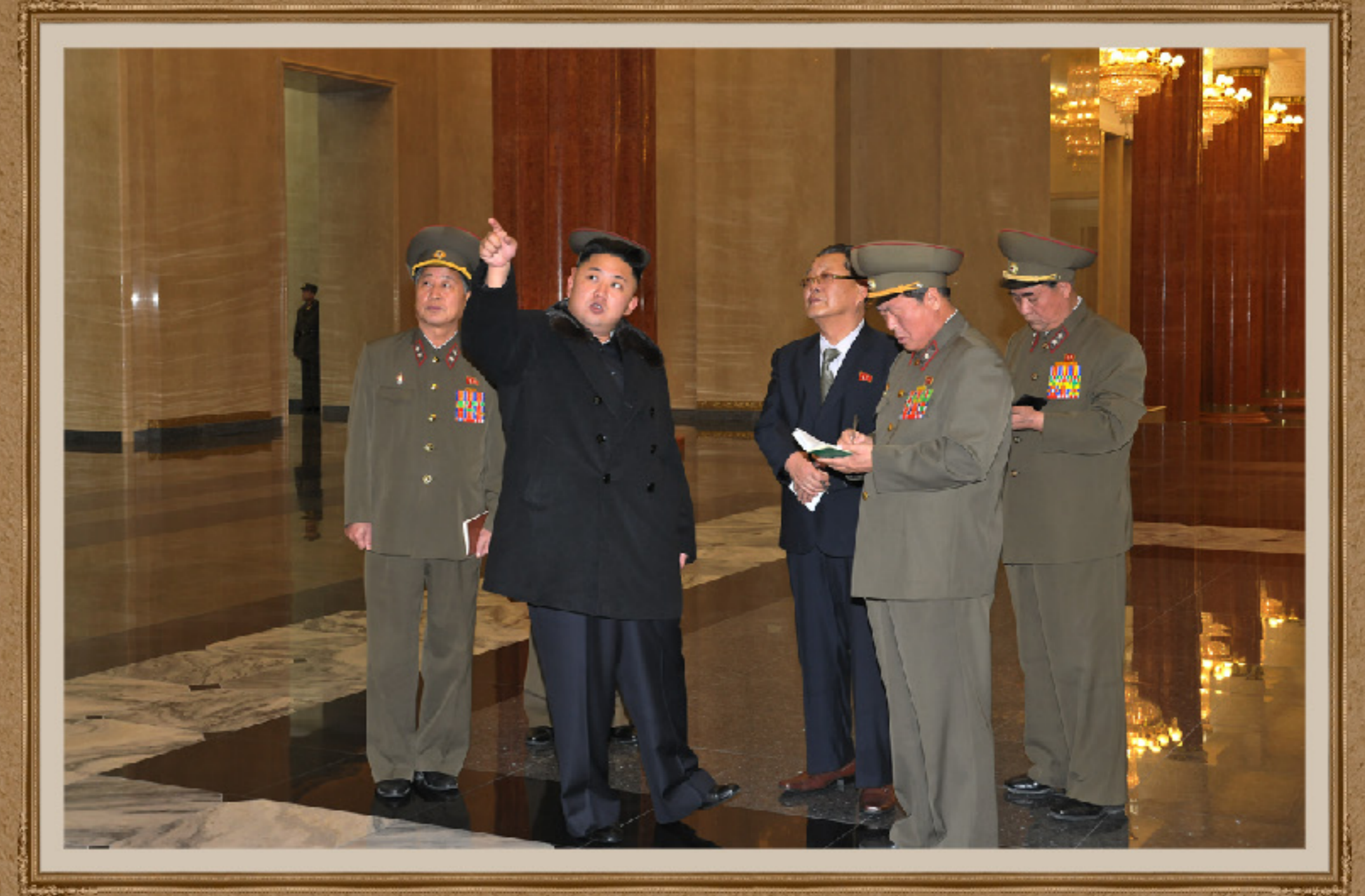
Kim Jong Un guides the work of laying out the Kumsusan Palace of the Sun splendidly as befits the sacred place of the sun