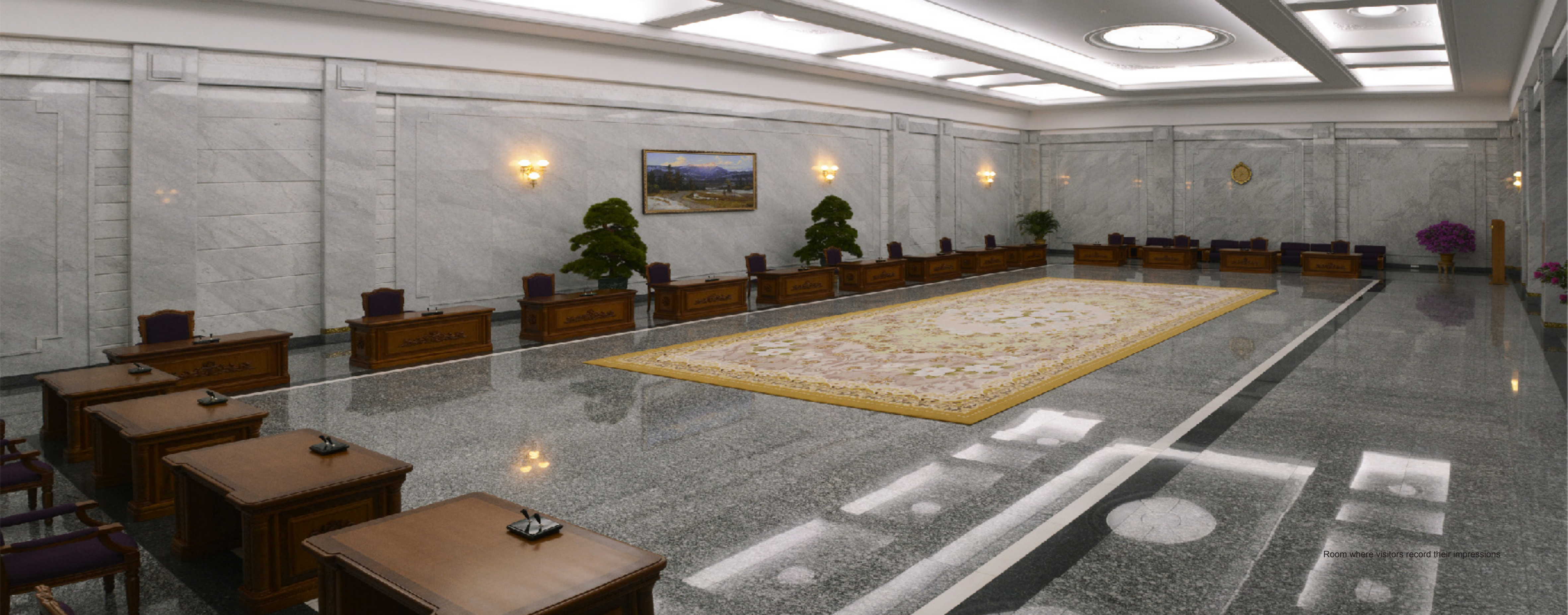
Room where visitors record their impressions