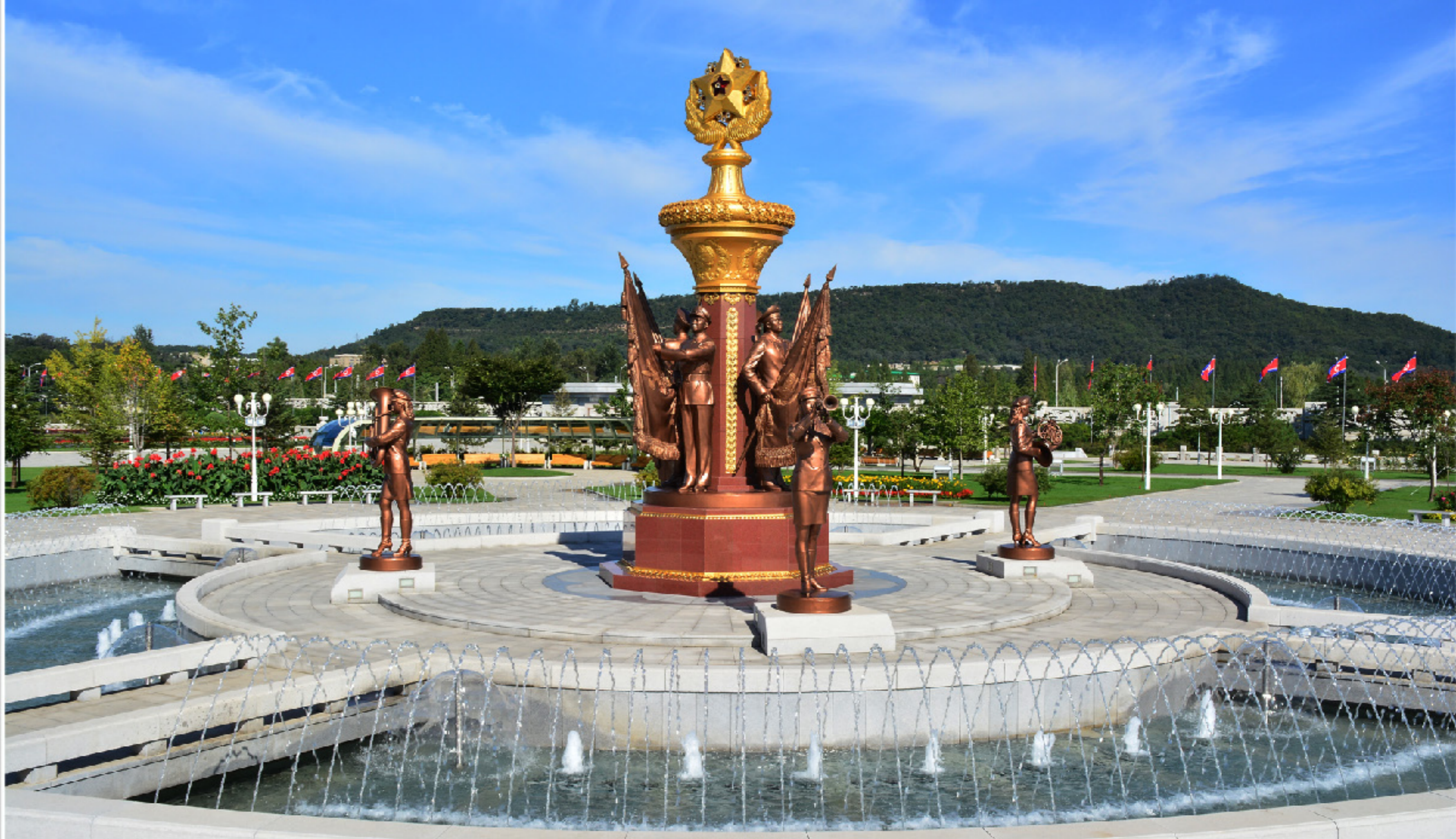
Group sculptures in the plaza park