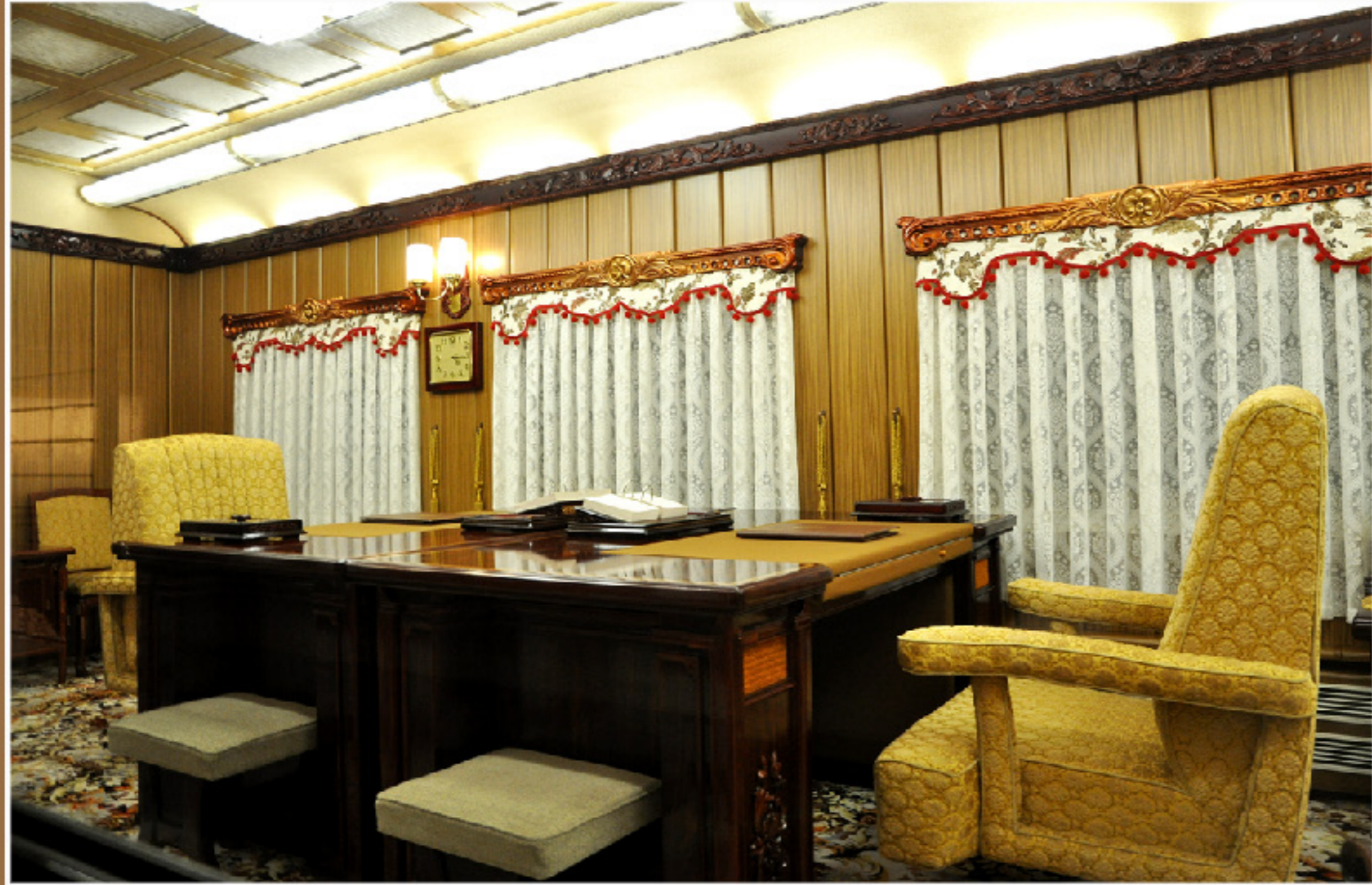
Office in the carriage used by President Kim Il Sung