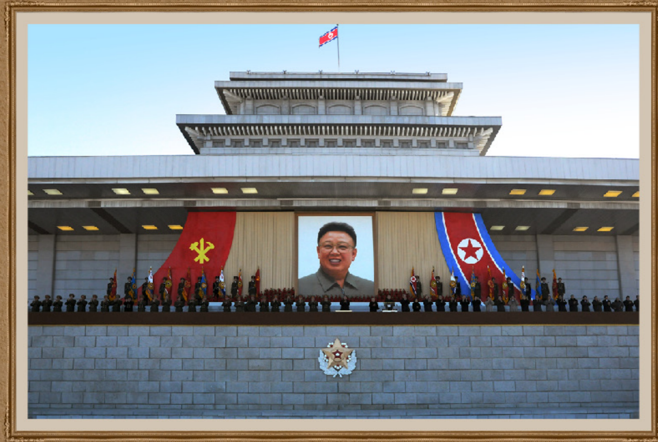
On February 16, Juche 101 (2012), at the Kumsusan Palace of the Sun Plaza, the joint resolution on renaming the Kumsusan Memorial Palace the Kumsusan Palace of the Sun has been made public, followed by a military ceremony of the ground, naval and air forces of the Korean People's Army