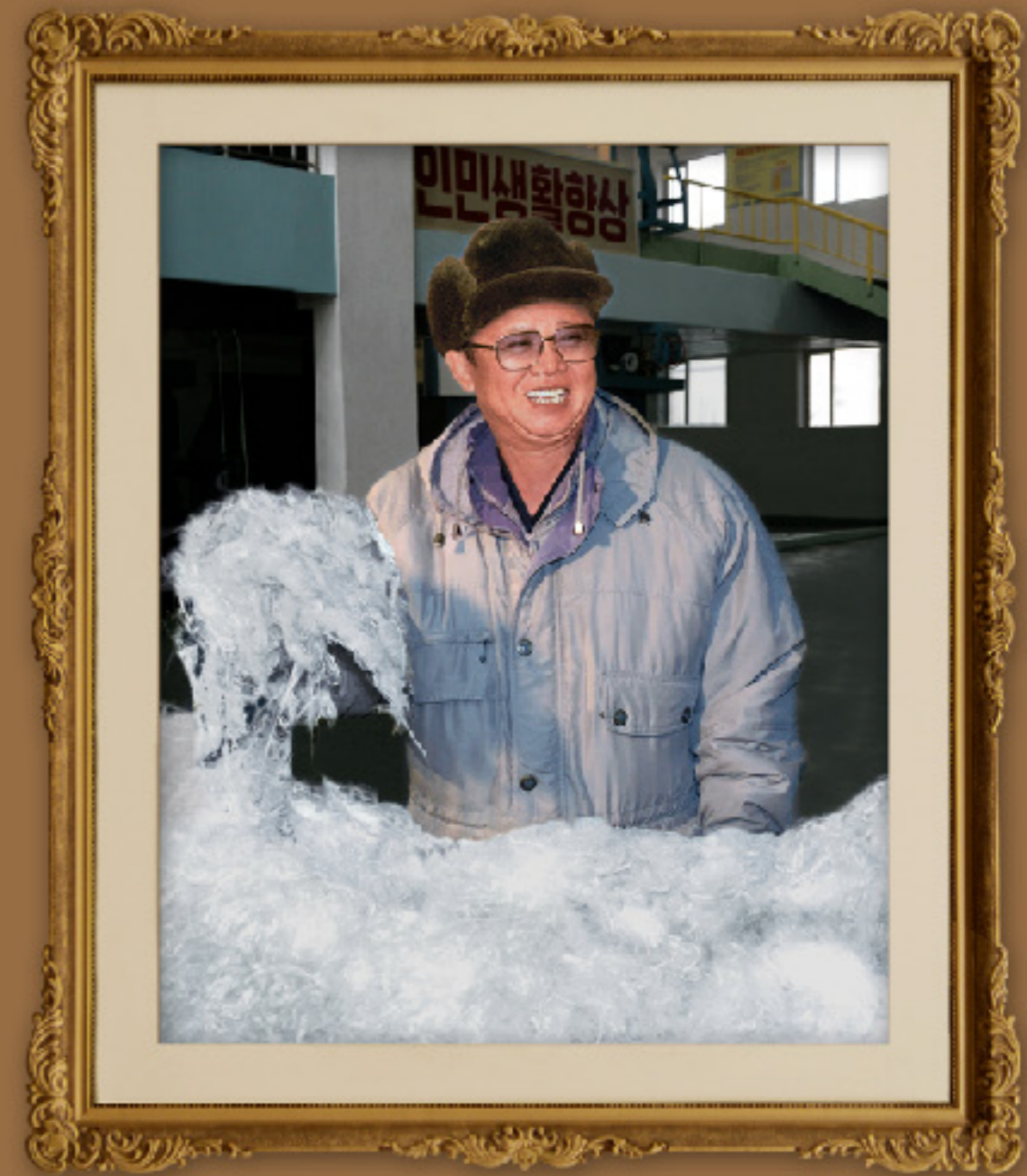
Chairman Kim Jong Il sees vinalon cotton (February 9, 2010)