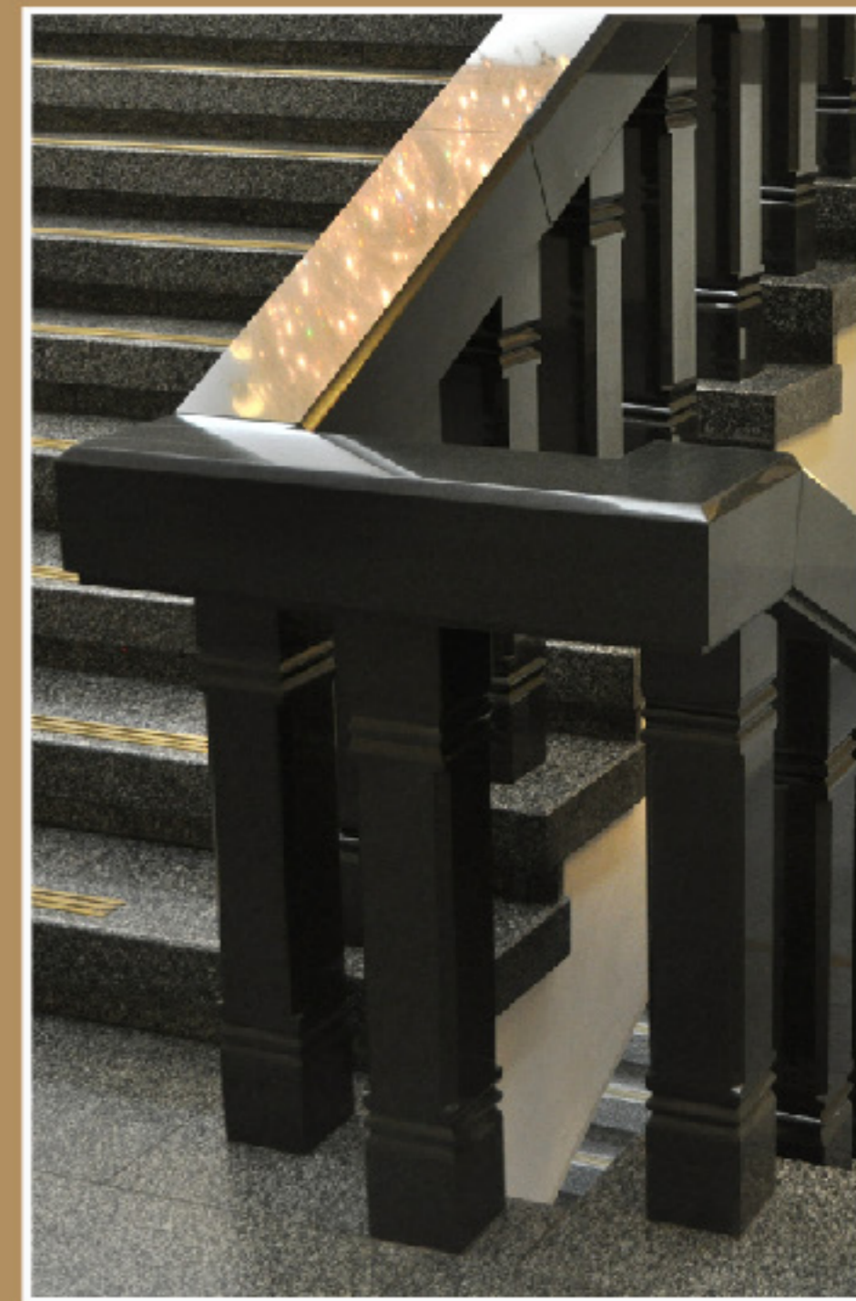
Central division and handrail of the grand staircase