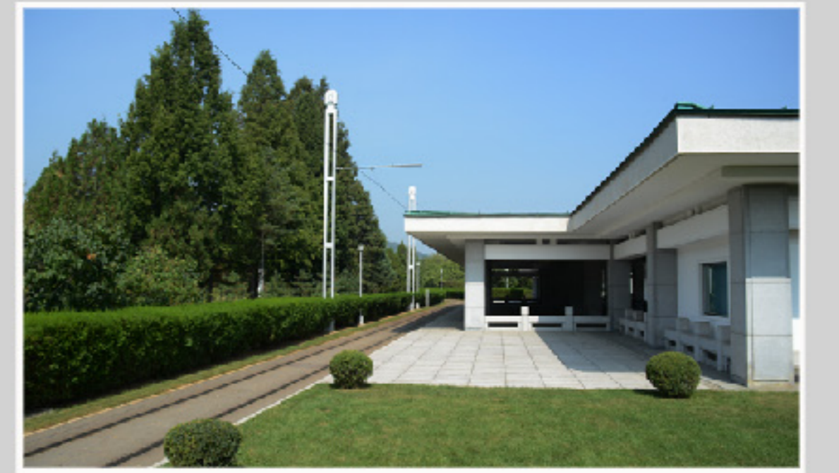
Tram for visitors to the palace