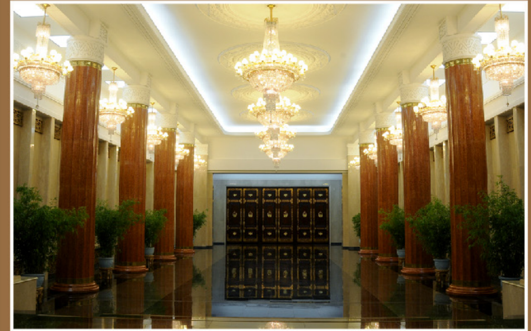
Hall of Lamentation

The Hall of Lamentation tells of the grief and great loss the Korean and world progressive peoples felt for the sudden death of President Kim Il Sung and Chairman Kim Jong Il.