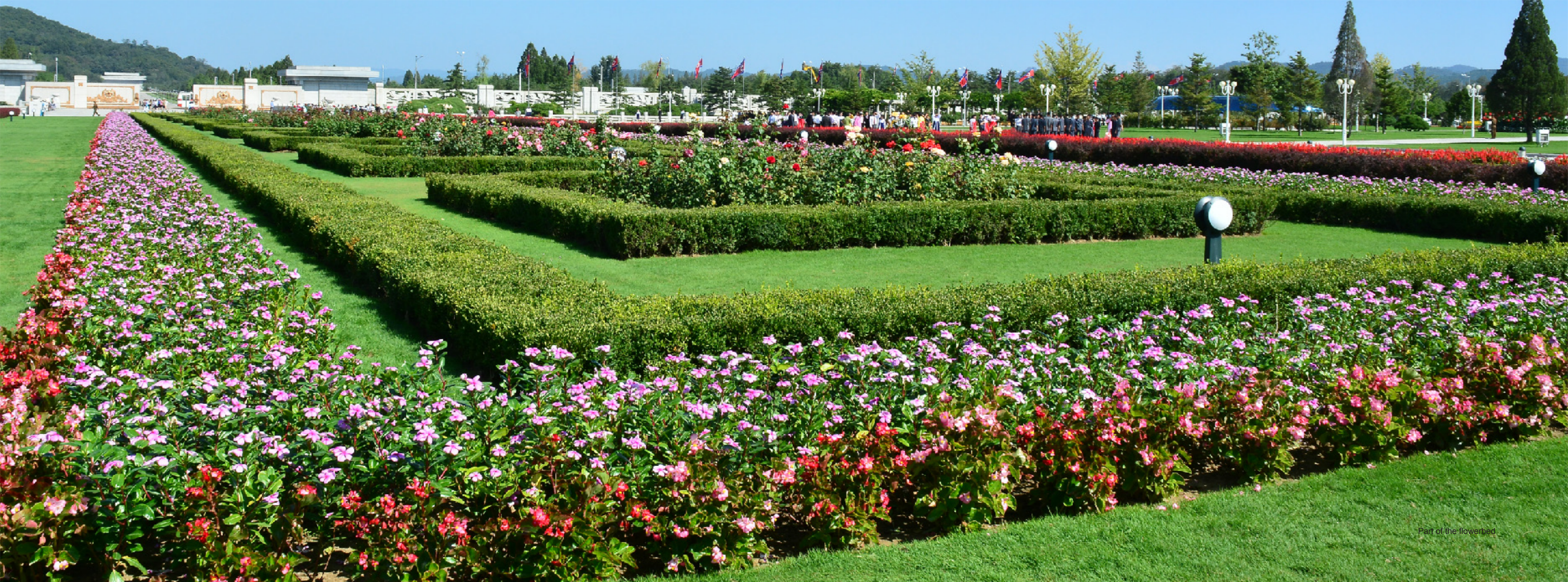
Part of the flowerbed