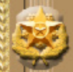
Room where orders, medals and honorary title certificates conferred on Chairman Kim Jong Il are preserved

Though he passed away, the world progressive peoples are awarding him orders, medals and honorary titles out of their boundless reverence.