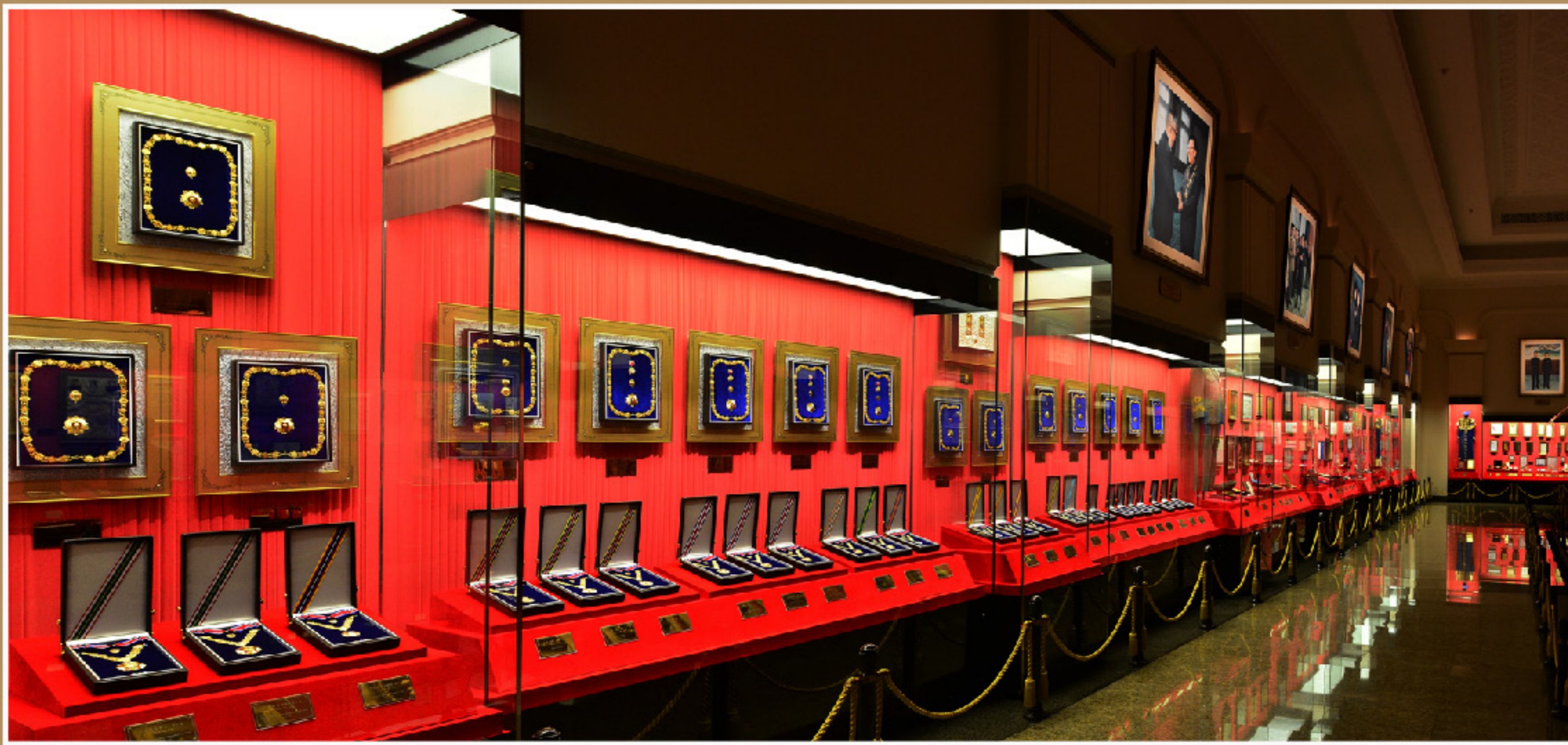
Part of orders, medals and honorary title certificates awarded to Chairman Kim Jong Il