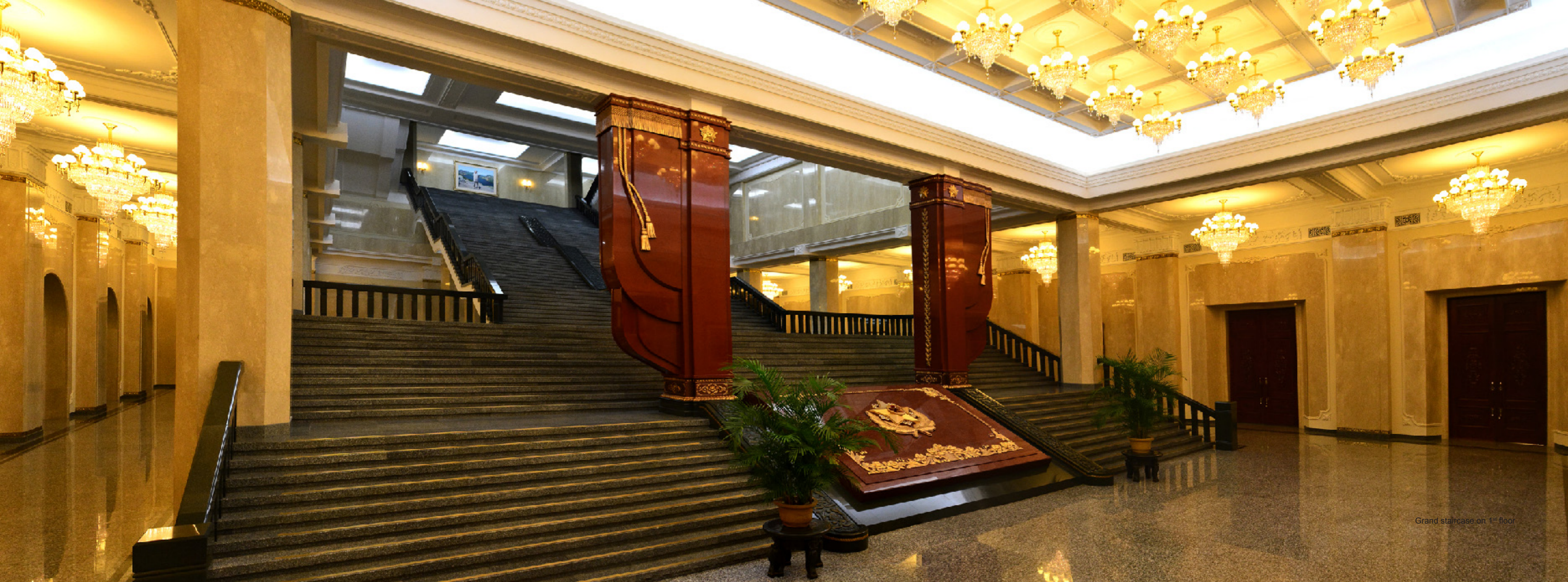
Grand staircase on 1 st floor