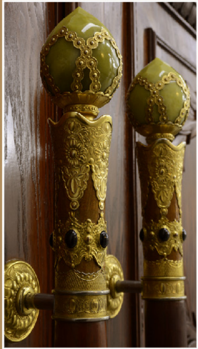
Ornamented door handle