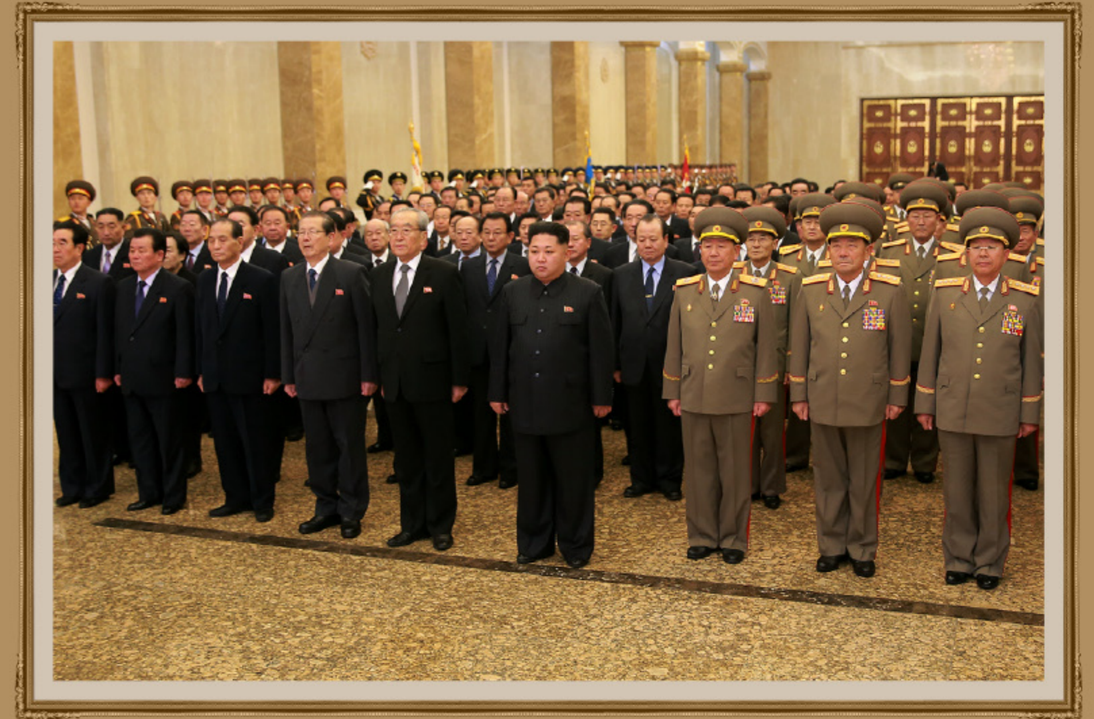
Supreme leader Kim Jong Un, together with senior Party and army officials, pays tribute to President Kim Il Sung and Chairman Kim Jong Il in front of their statues