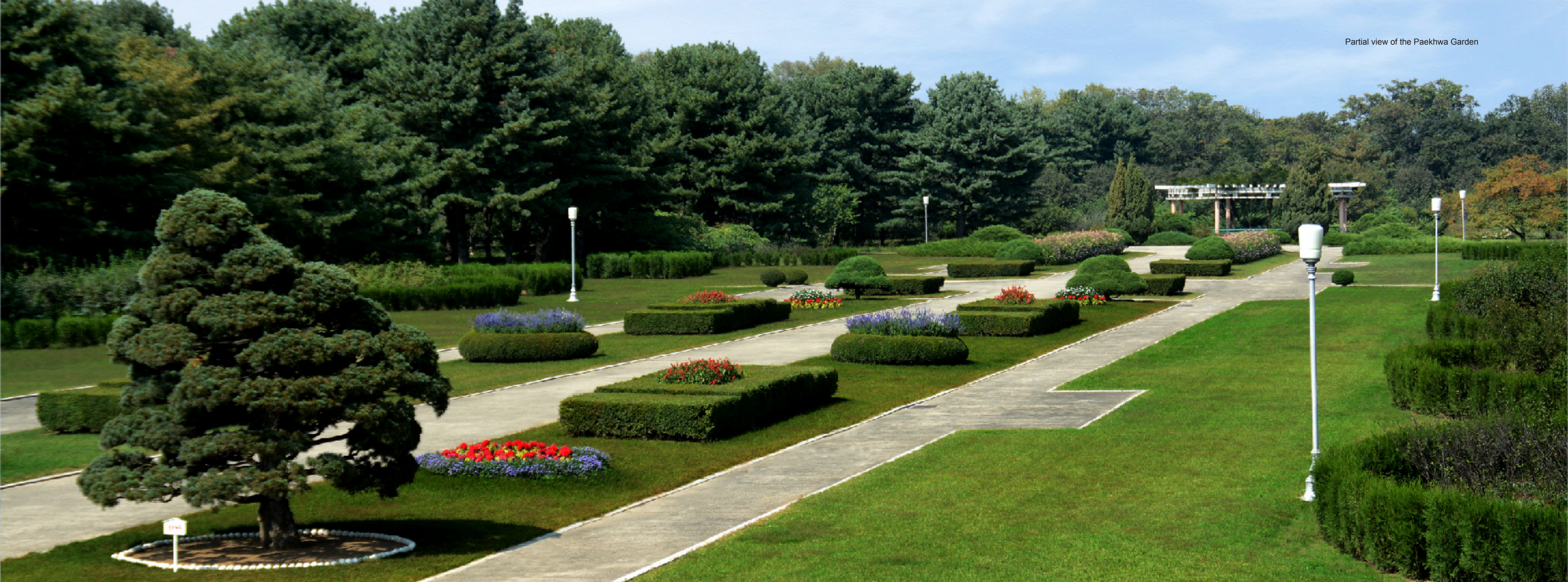
Partial view of the Paekhwa Garden