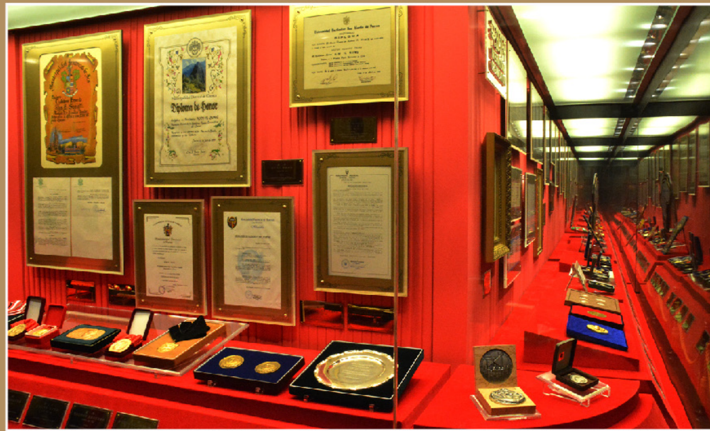
Part of orders, medals and honorary title certificates awarded to President Kim Il Sung