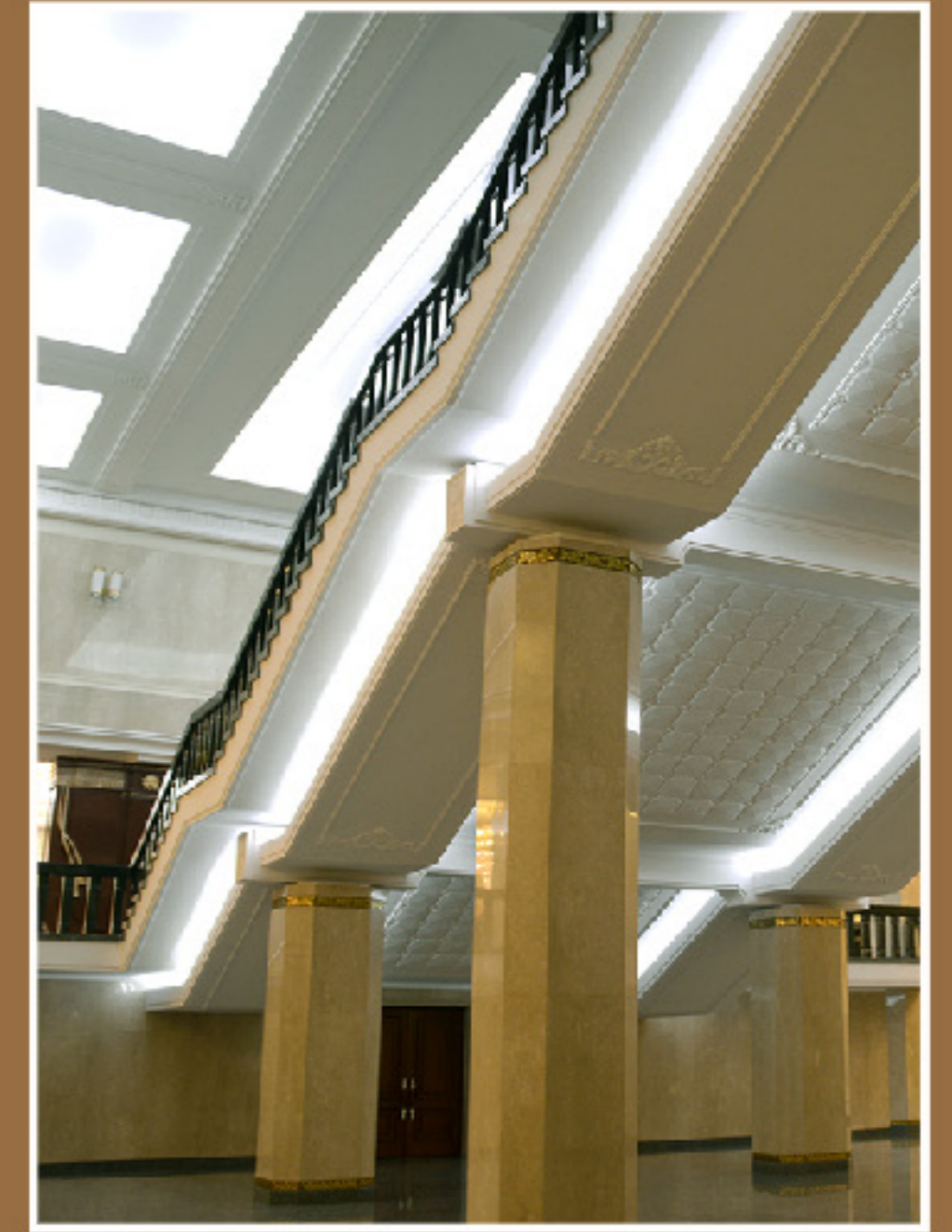
Grand staircase seen from below