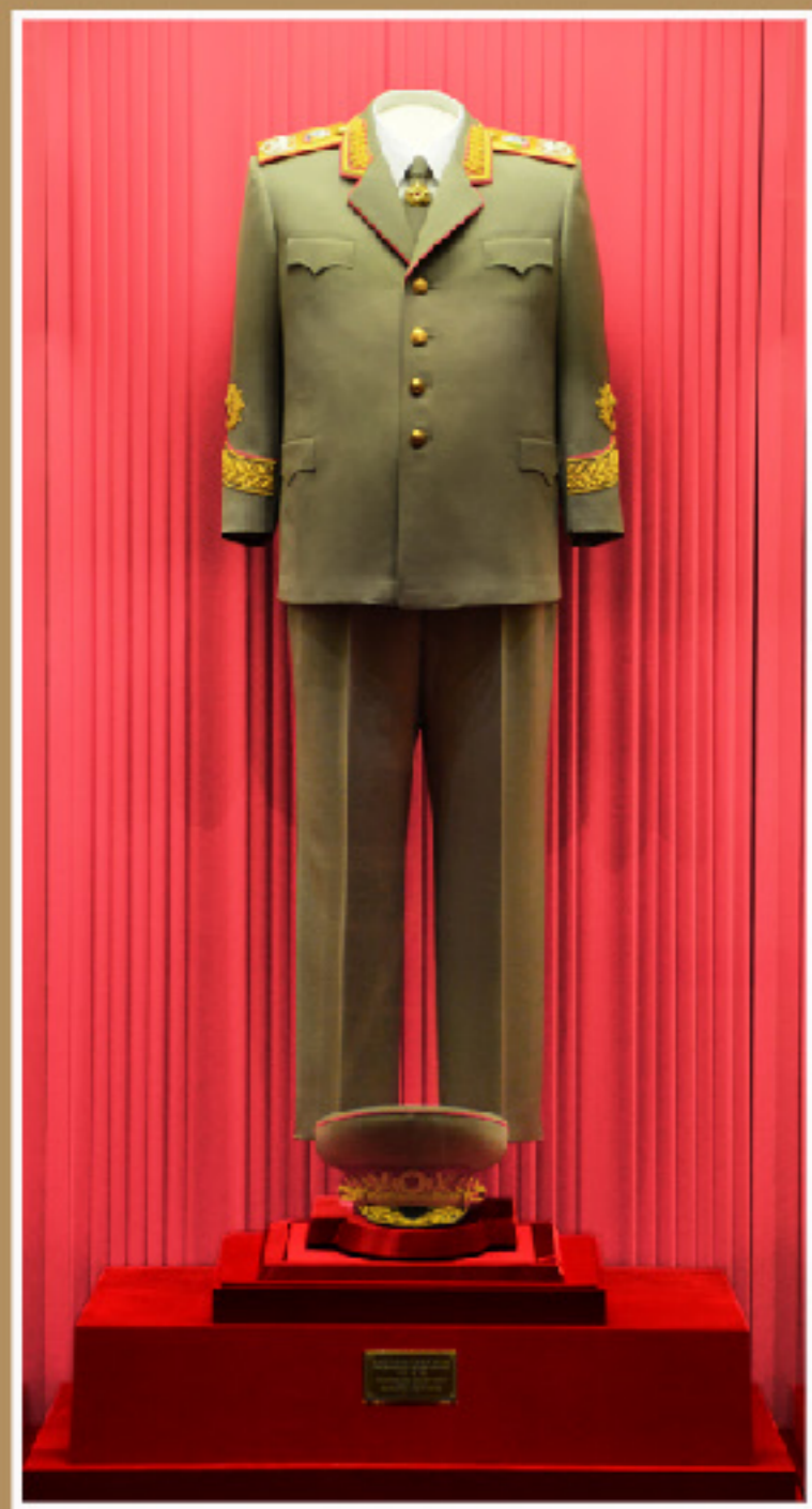
Uniform of Generalissimo of the DPRK