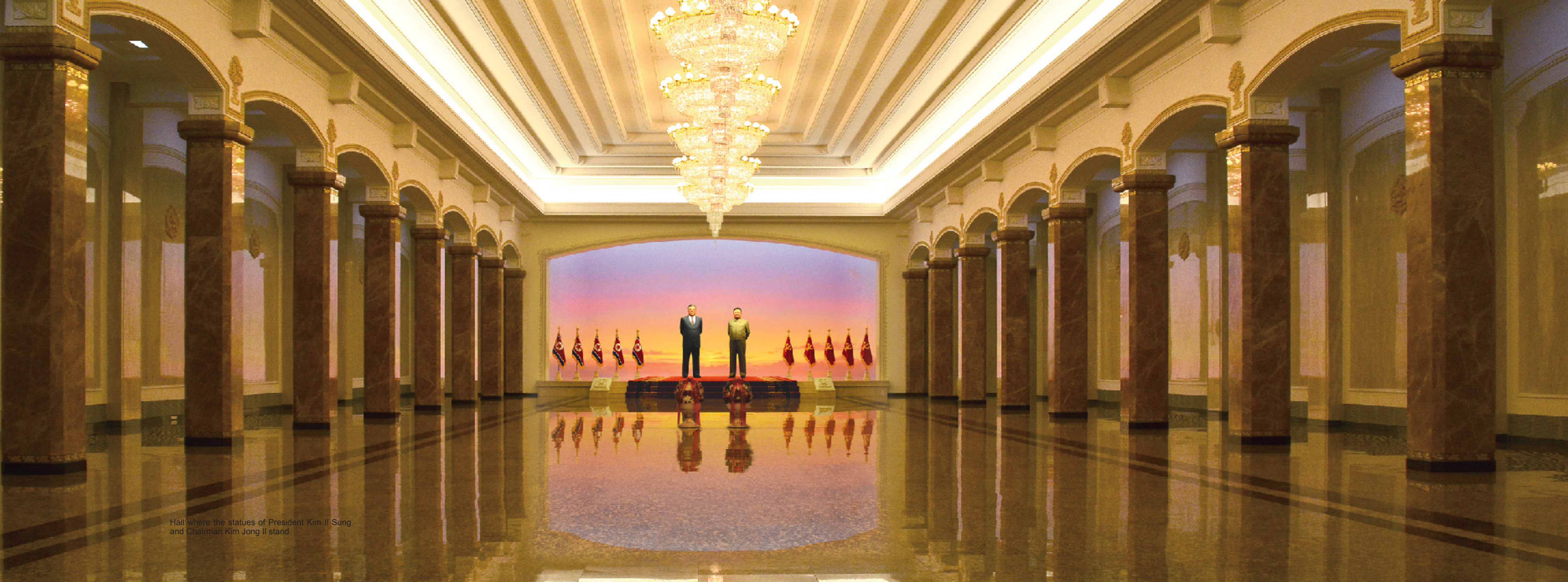
Hall where the statues of President Kim Il Sung and Chairman Kim Jong Il stand