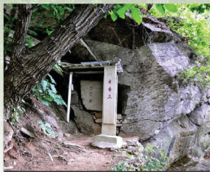
A place of meeting