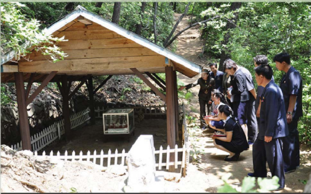
A camping site

The Jonsan Revolutionary Battle Site is one of the secret camps in the secret base in Anju area, South Phyongan Province in the west of the DPRK, in the grim days of the anti-Japanese armed struggle in the first half of the 20th century. In June 27 (1938), 7 years before the ruin