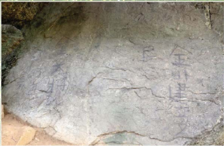
Natural rocks and trees bearing slogans