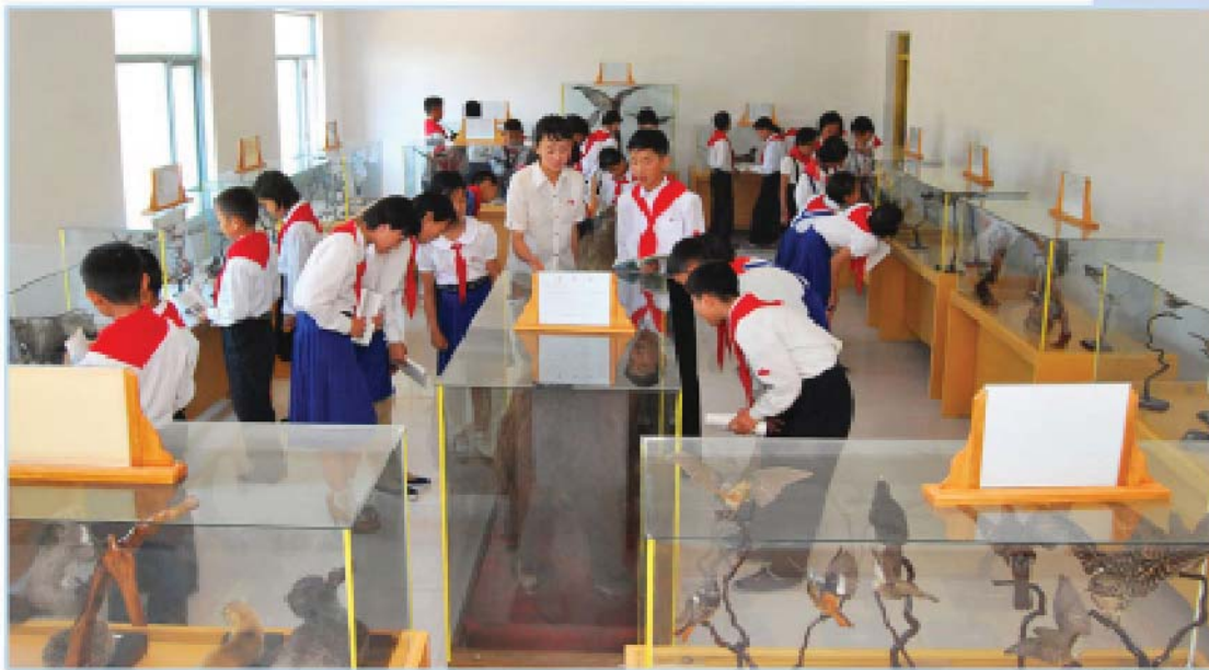
Ryongnim Senior Middle School in Ryongnim County