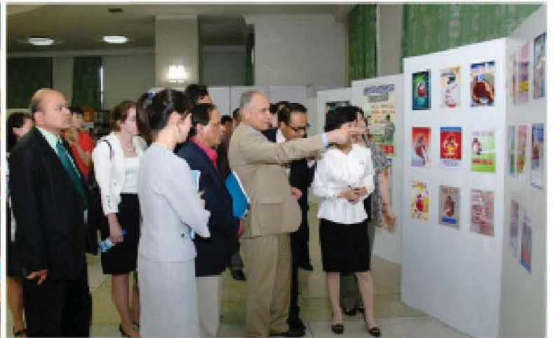
An event held to mark World No-Tobacco Day at the Grand People's Study House