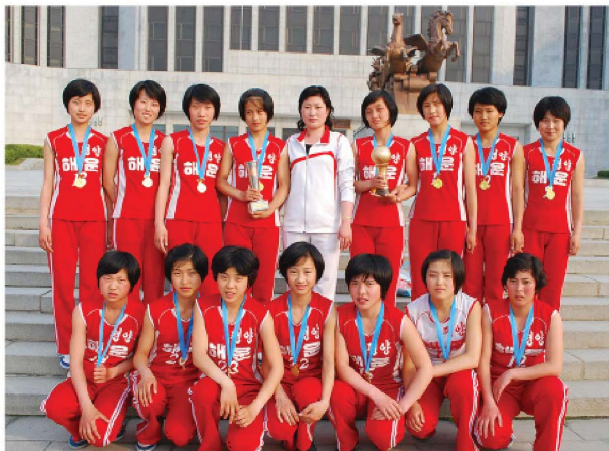
Volleyball players from the Haeun Senior Middle School in Phyongchon District win in the women's volleyball event for the senior middle school sector in the Jongilbong Prize National Schoolchildren's Games in Juche 103 (2014)

But this led her to redouble her efforts. She first organized the group involving girls sensitive to sports and with appropriate physical constitution. Then she began to teach them accurate basic techniques one by one. She made strong demands on the girls so that they would execute their training tasks without fail every day, and