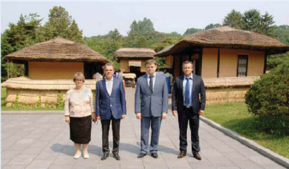
Delegation of the Supreme Prosecutor's Office of the Russian Federation visits President Kim Il Sung's birthplace at Mangyongdae