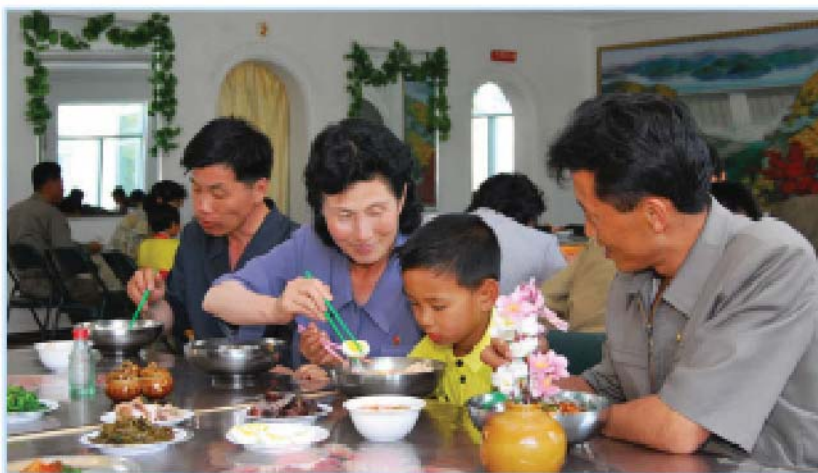
At a noodle house