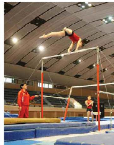
Gyms renovated for convenience for