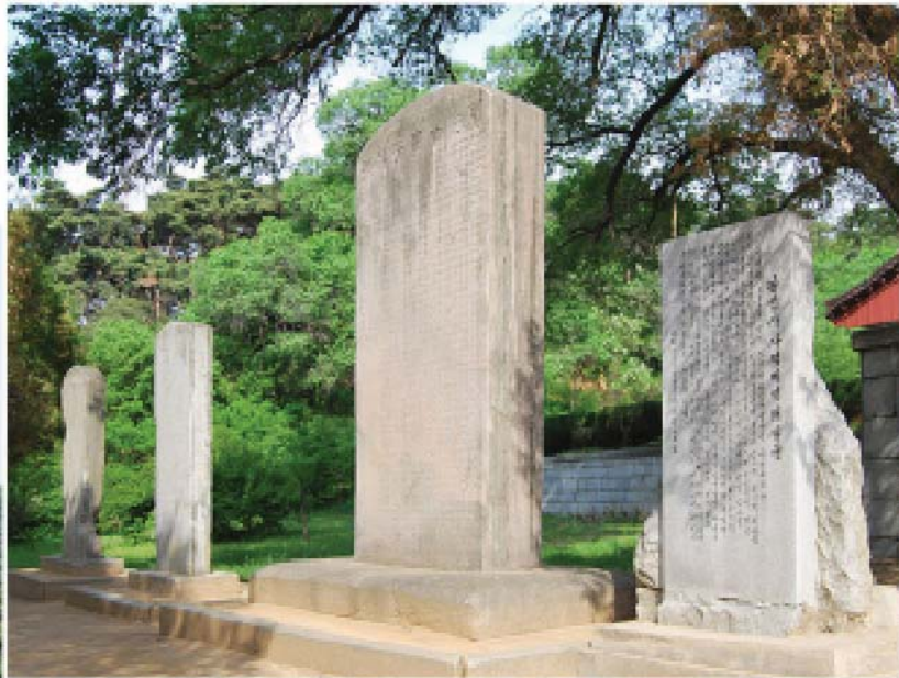
Monument to Kwangbop Temple