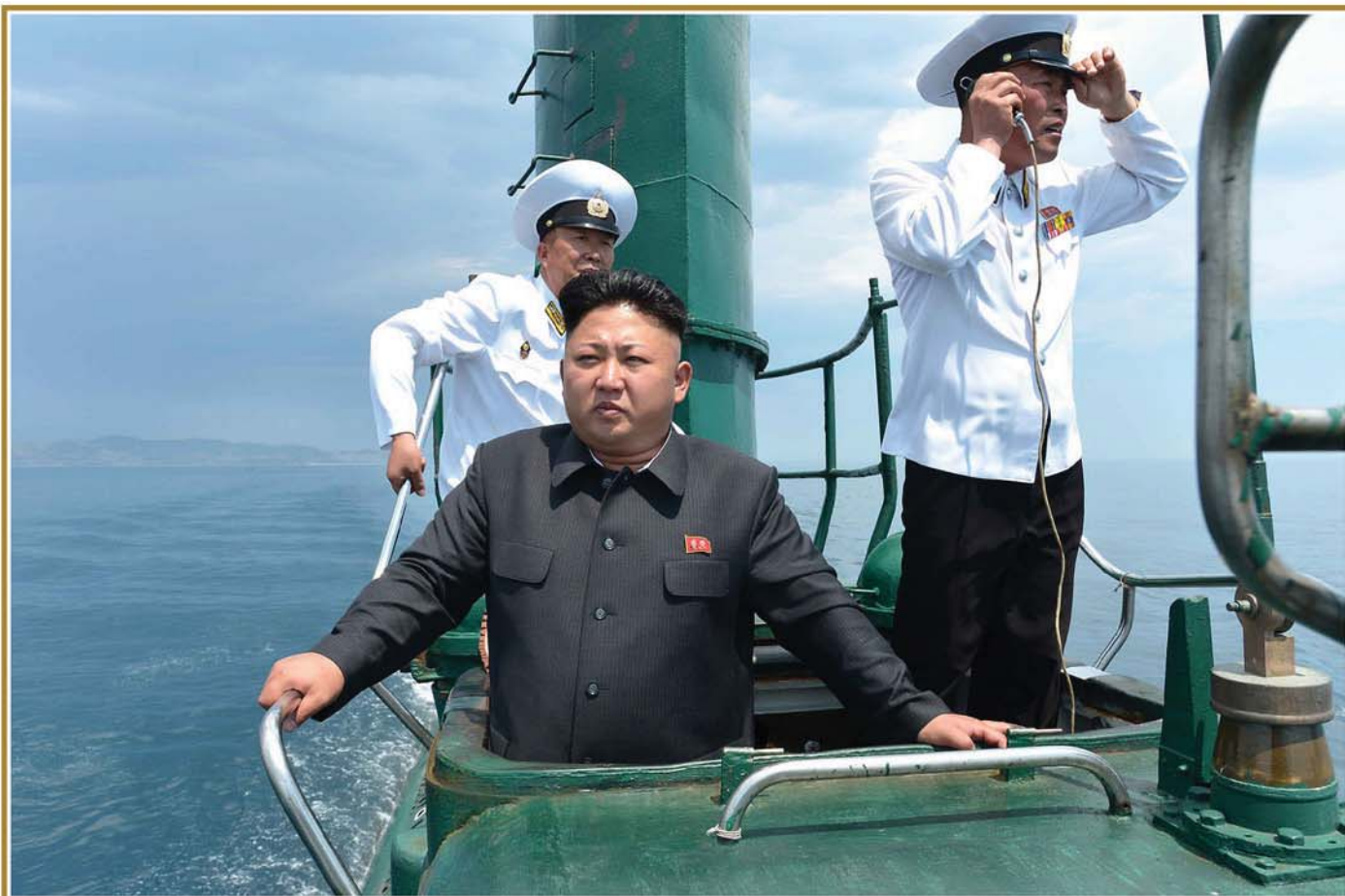
unit in June Juche 103 (2014)