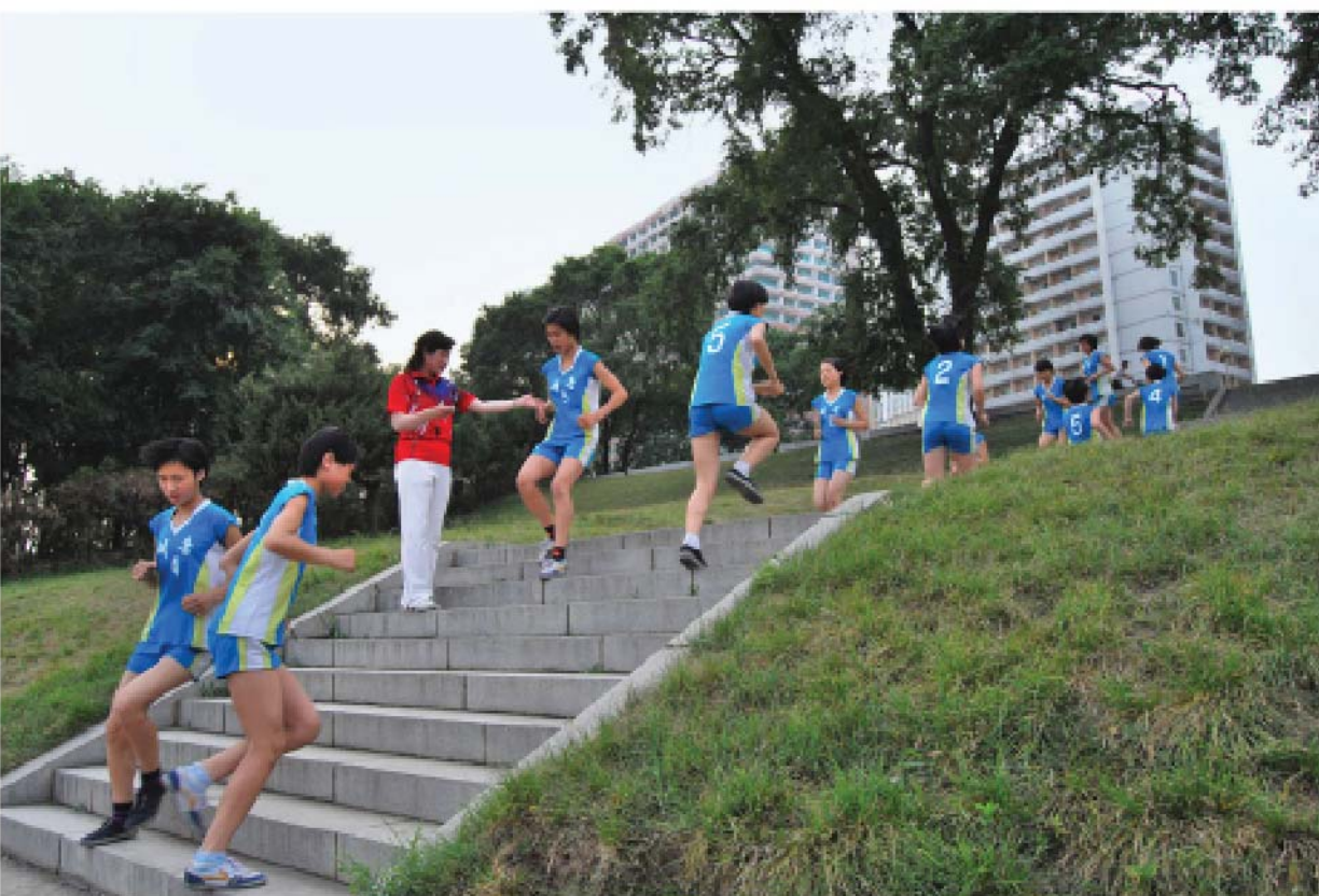
With a high goal in training

They have defended the championship until now.