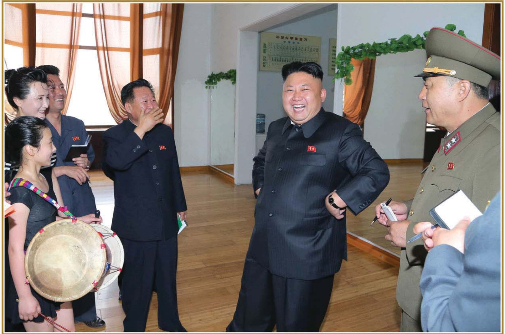
Kim Jong Un visits the Mangyongdae Schoolchildren's Palace in May Juche 103 (2014)