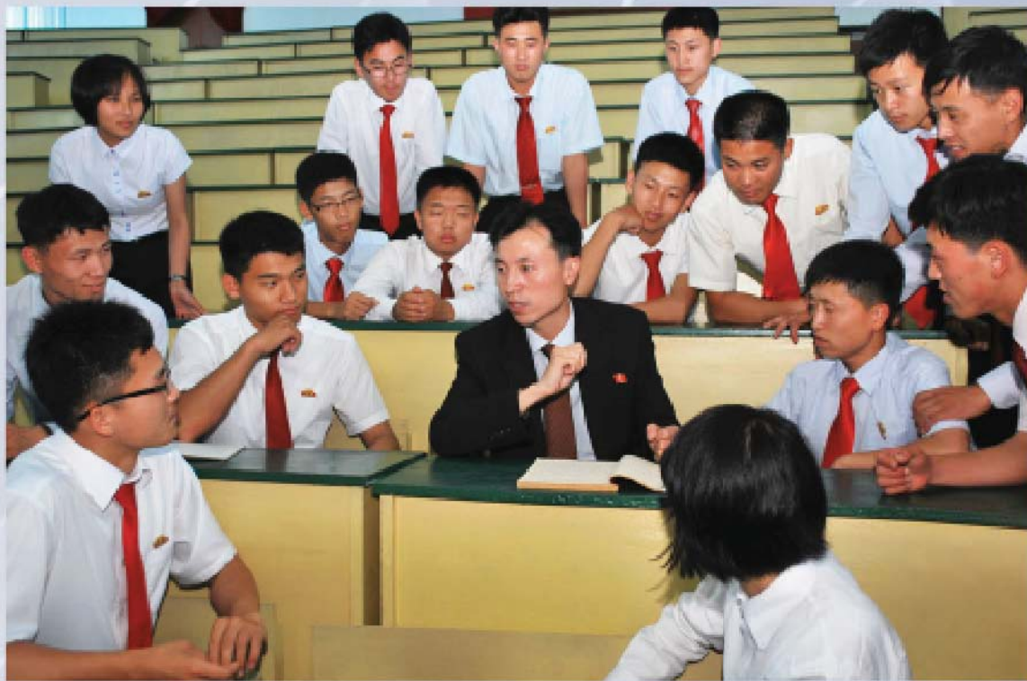
devotes himself body and soul to the education of students to train them both for theory and practice

Students. After finishing the postgraduate course he became a lecturer at his alma mater. At that time he felt proud of being a lecturer at Kim Il Sung University, the highest institute of science and education, and made up his mind to repay his gratitude for the socialist system by producing scientific research results, the system that had fostered his dream in his boyhood and made him enjoy the benefit of free education and give full play to his talent.