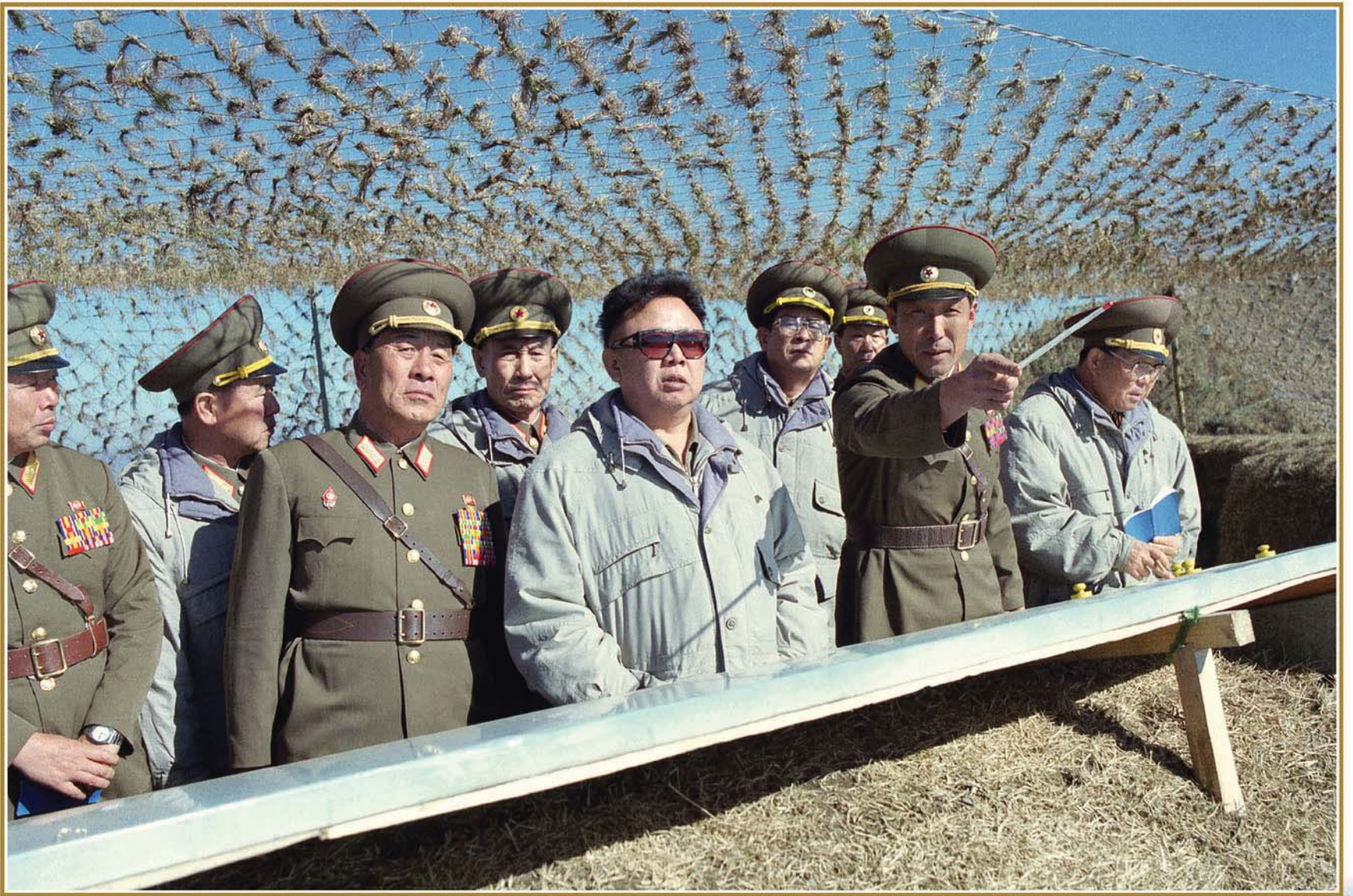
Kim Jong Il at a frontline post in November Juche 87 (1998)