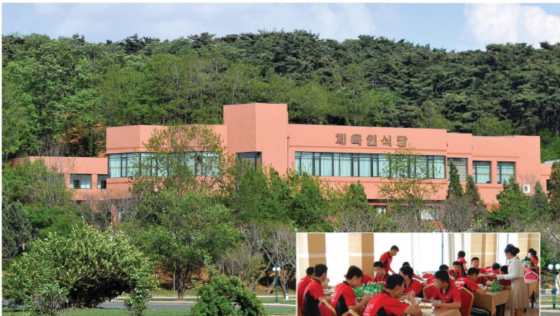
Restaurant for Sportspersons