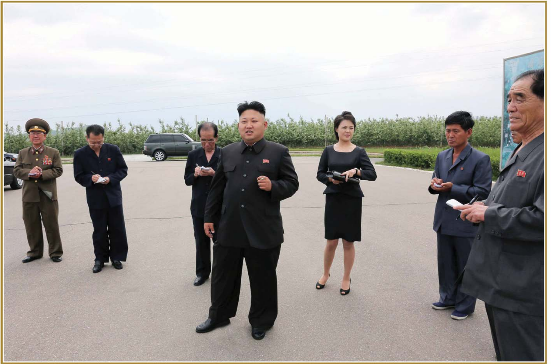
Kim Jong Un looks round the Taedonggang Combined Fruit Farm in June Juche 103 (2014)