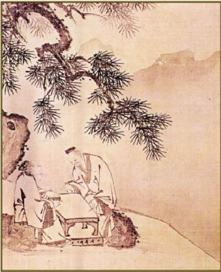
Old painting "Old people playing paduk "