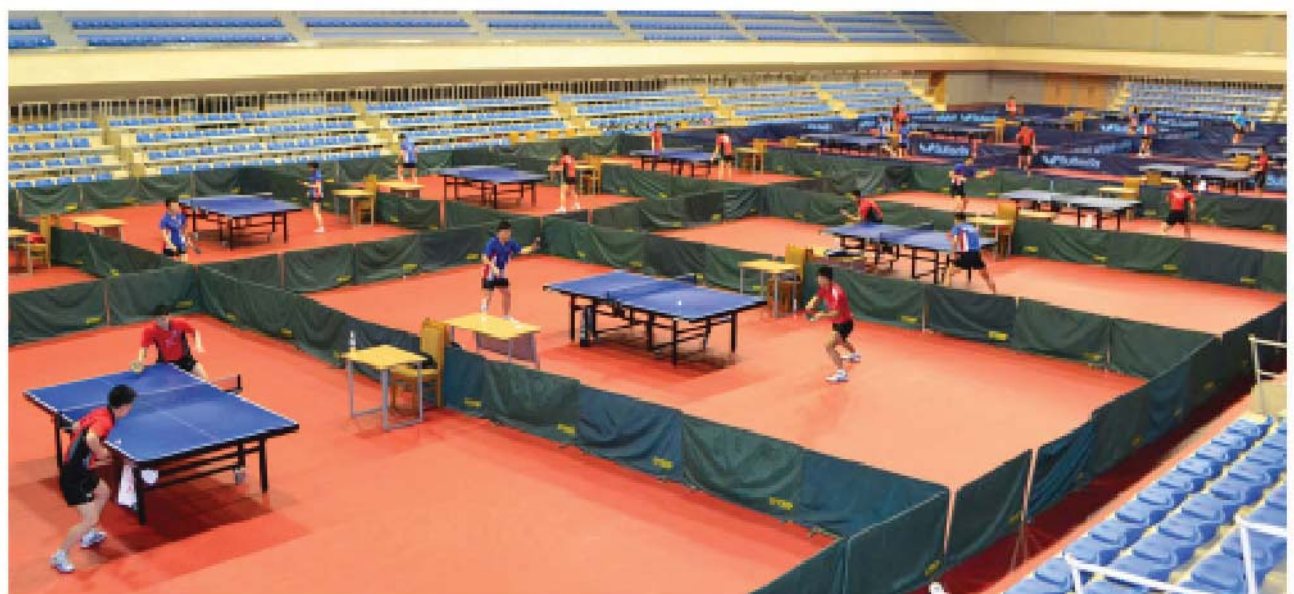
playing and watching games and training