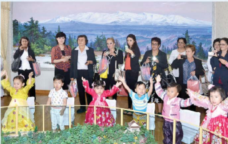
Delegation of the Workers' Party of Mexico looks round Kim Jong Suk Nursery