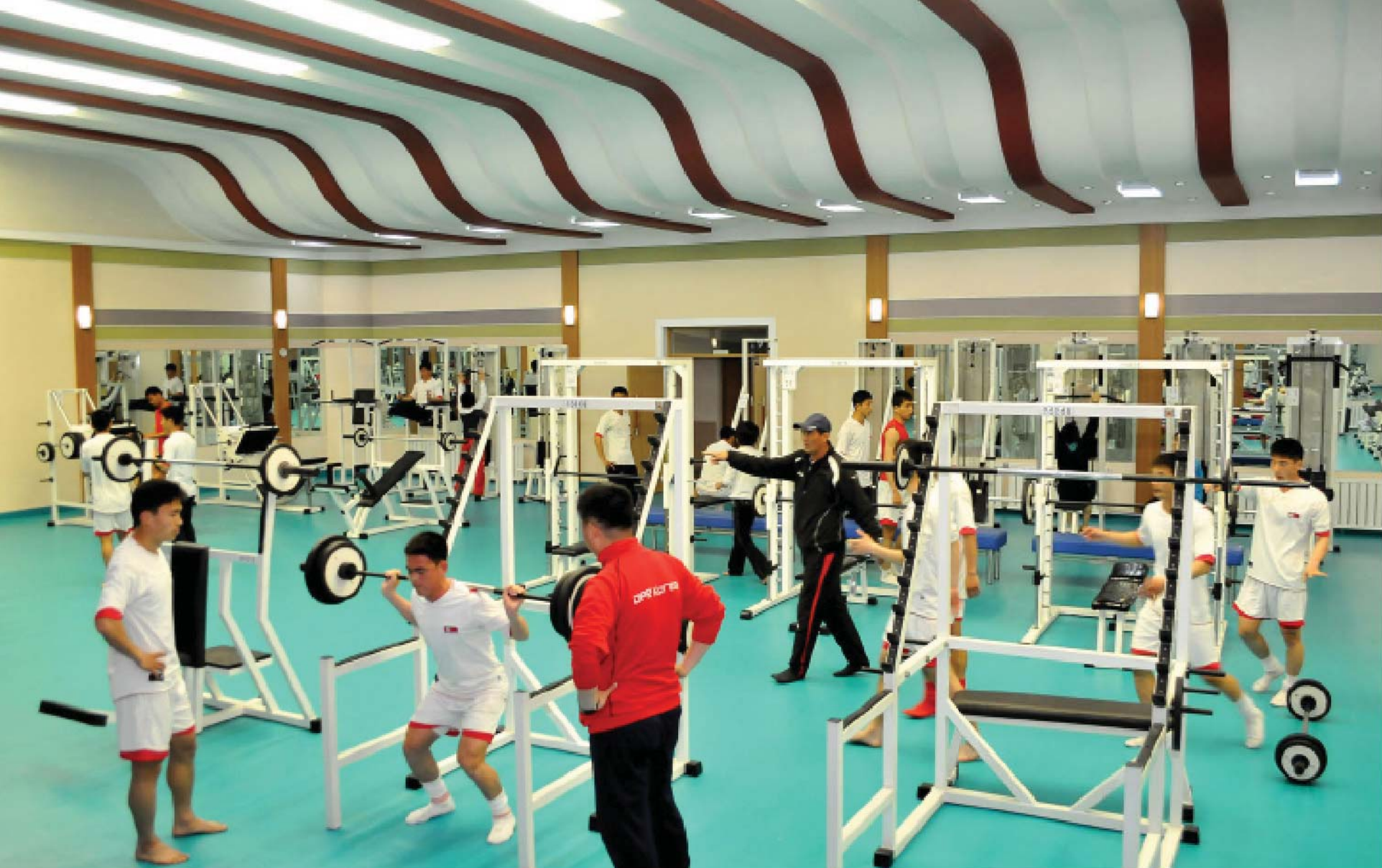
Physical Training Centre