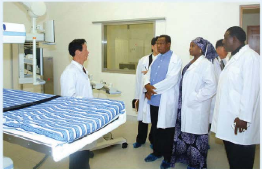
Secretary of the Borno State Government of Nigeria and his party on a visit to the Breast Tumour Institute of Pyongyang Maternity Hospital