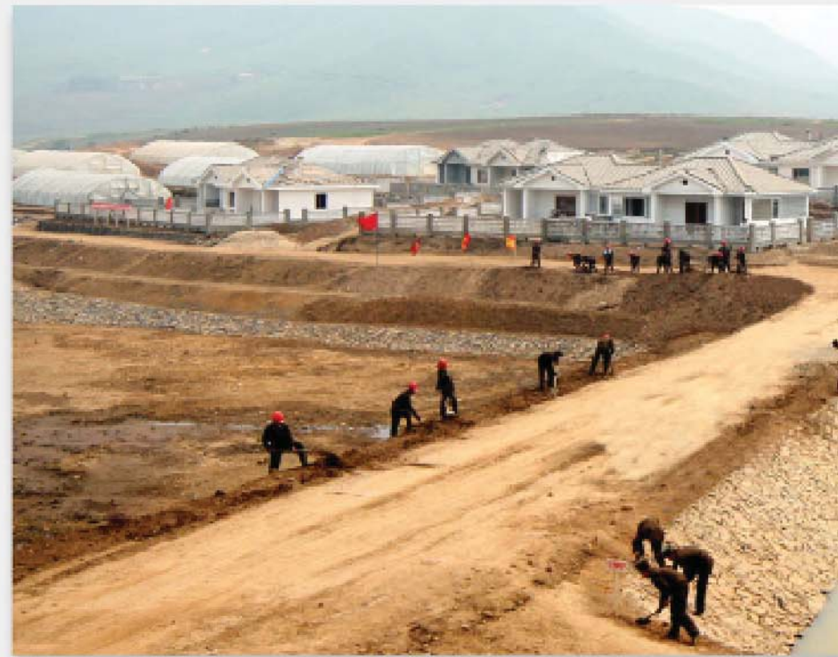
Construction of livestock institute, cattle houses

Besides, villages with cattle houses, dairy production bases, and cosy dwelling houses are under construction. One of them