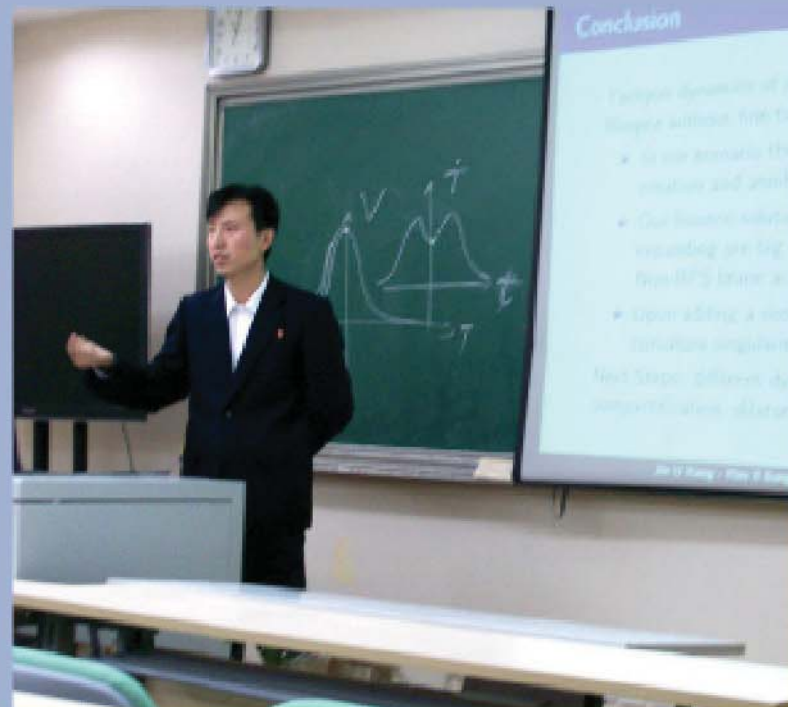
At an international academic seminar