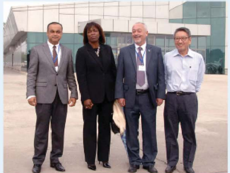
Executive director of the World Food Programme and his party