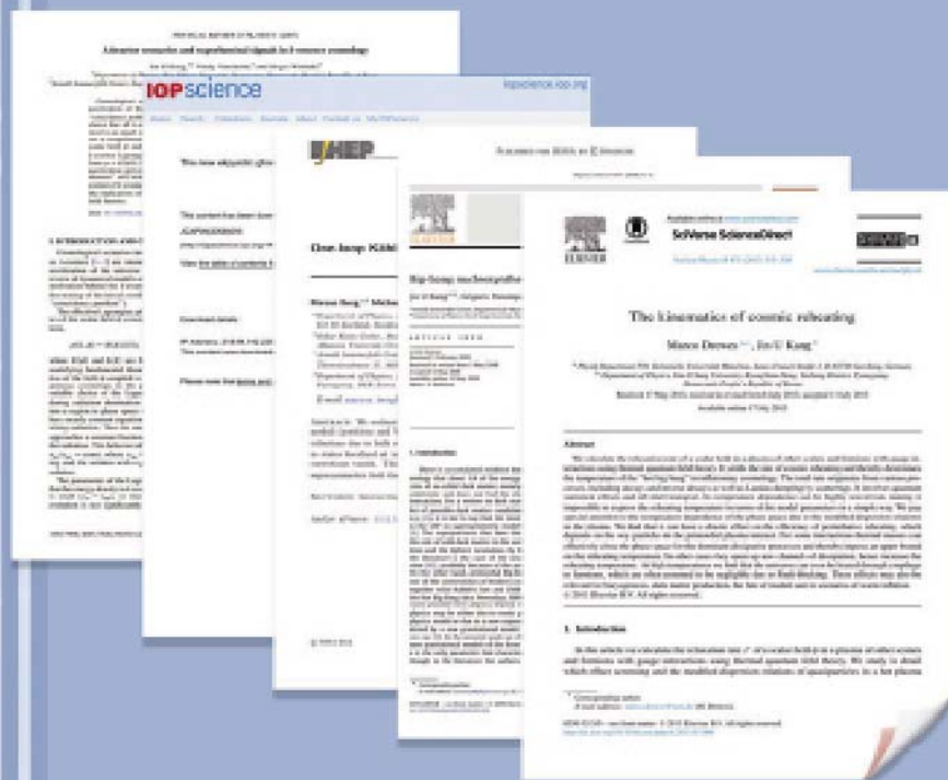
His treatises carried on international physics magazines