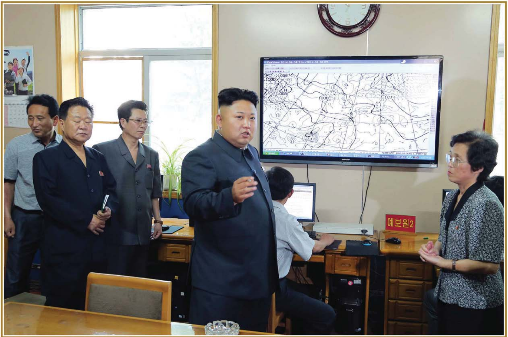
Kim Jong Un gives field guidance at the Hydro-meteorological Service in June Juche 103 (2014)