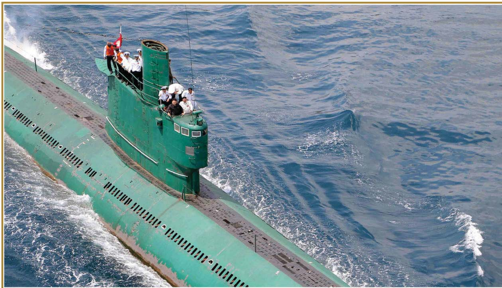
Kim Jong Un inspects a KPA Navy