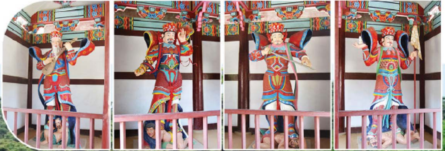
Sculptures of the Four Devas