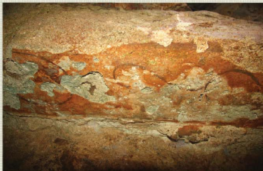
Part of the mural paintings on the ceiling