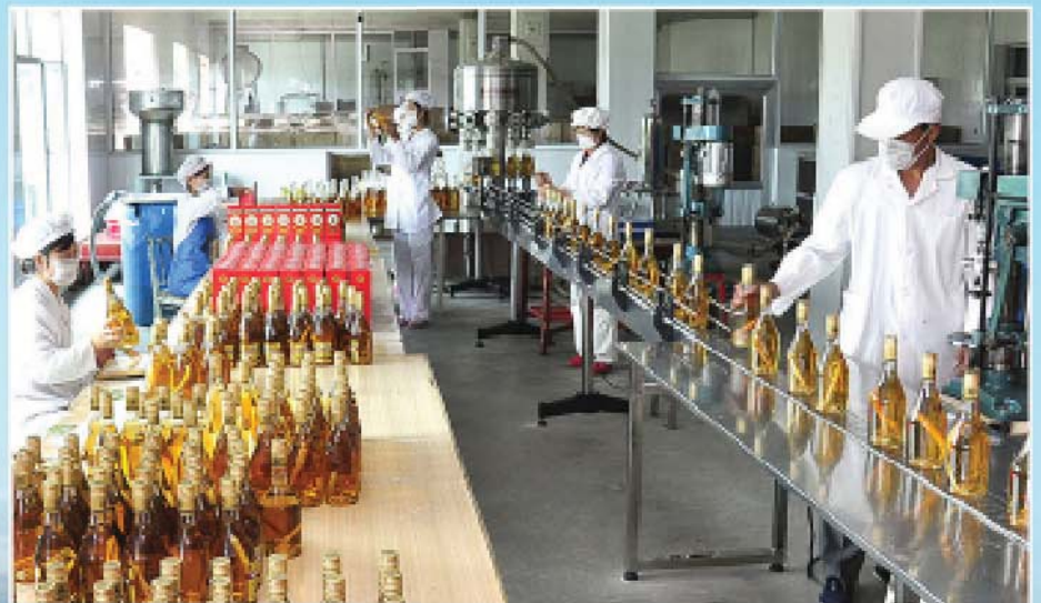
Kaesong Insam Processing Factory