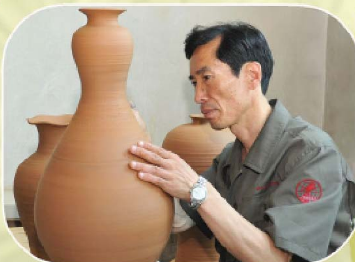
Grape-patterned and gourd-shaped teapot by Merited Artist U Chol Ryong, winner of bronze prize for ceramics