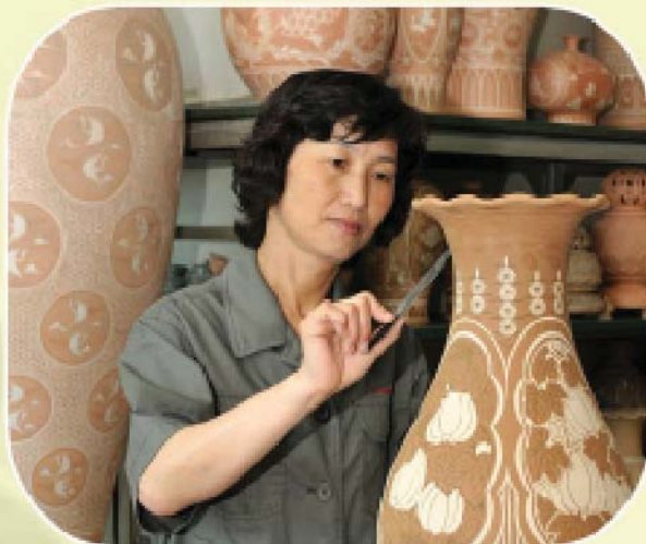
Carp-patterned openwork vase by U Pok Dan, winner of top creation prize