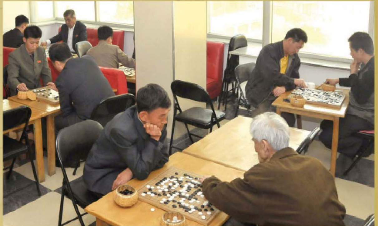
Paduk (go) has become a Koreans' favourite folk game and their national sporting event