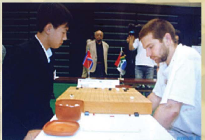
Many amateurs have won international paduk games