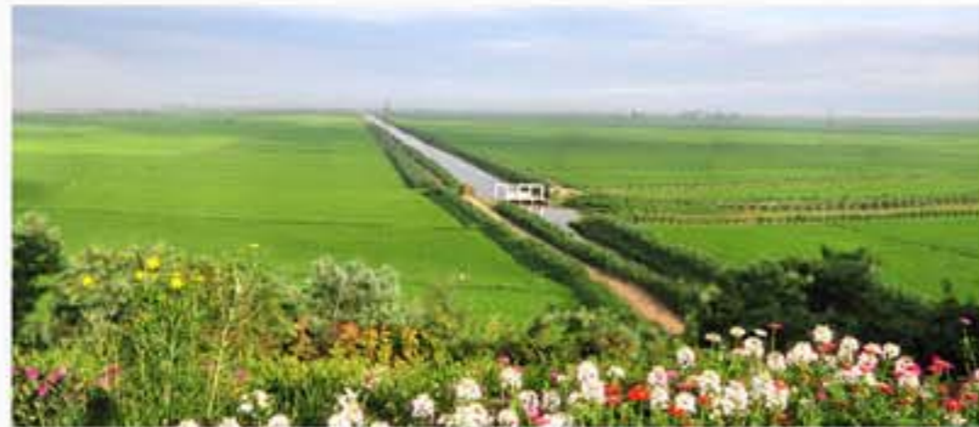
Land has been turned into standardized fields