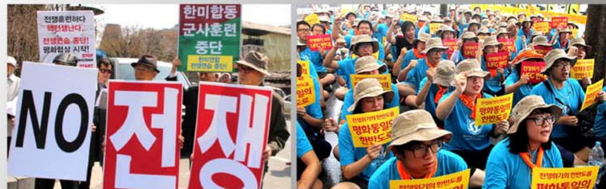
Against north-targeted war game

Article : Choe Kwang