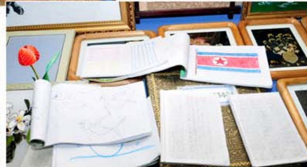
Trial products exhibition