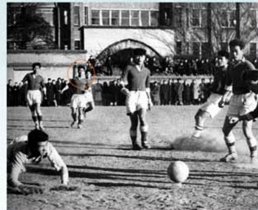
While studying at Tokyo Korean Middle and High School affiliated to the General Association of Korean Residents in Japan, he was active as the kingpin, captain of the school's football team in Juche 44 (1955)