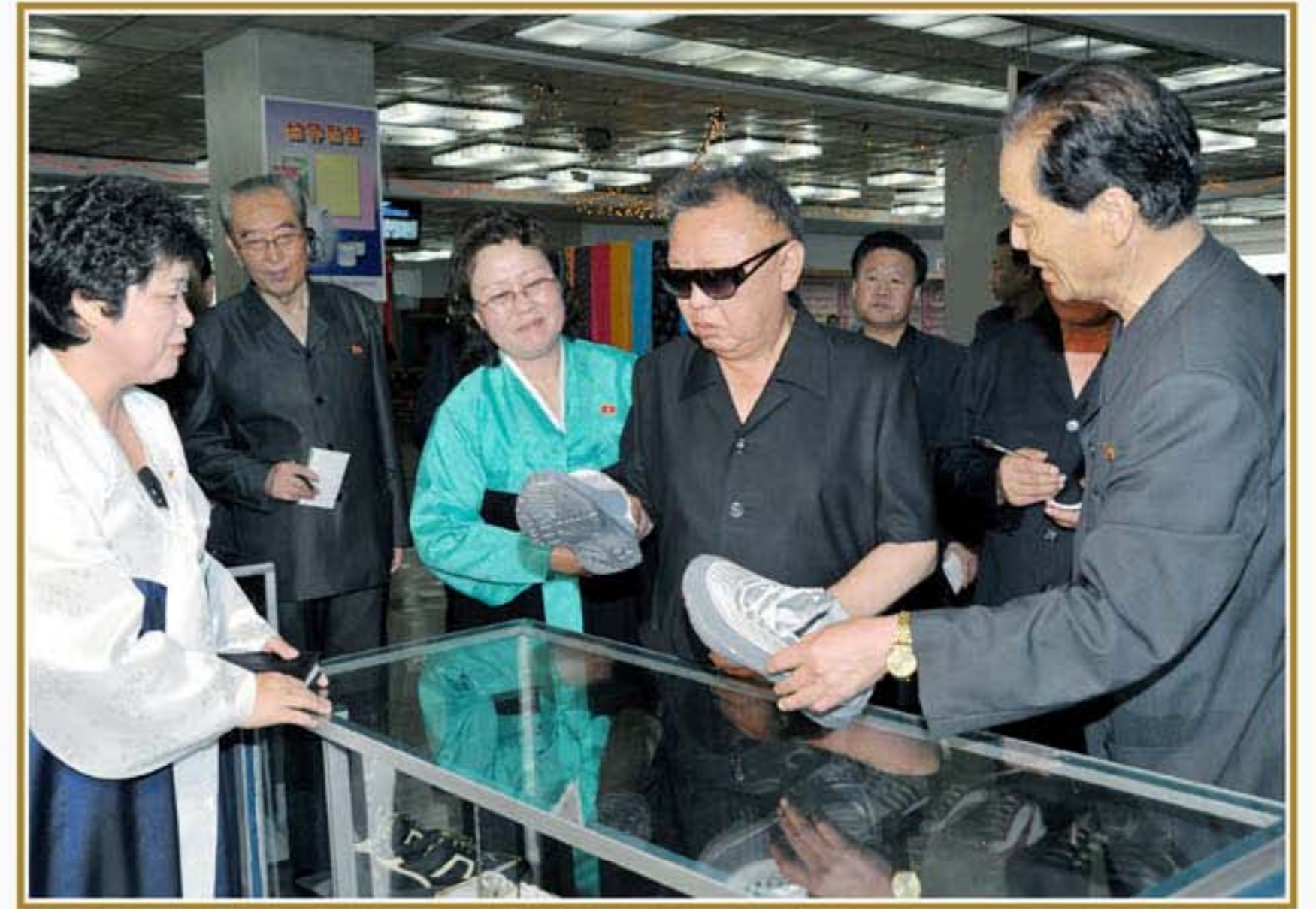
Kim Jong Il guides the work of the light-industry sector in July Juche 100 (2011)