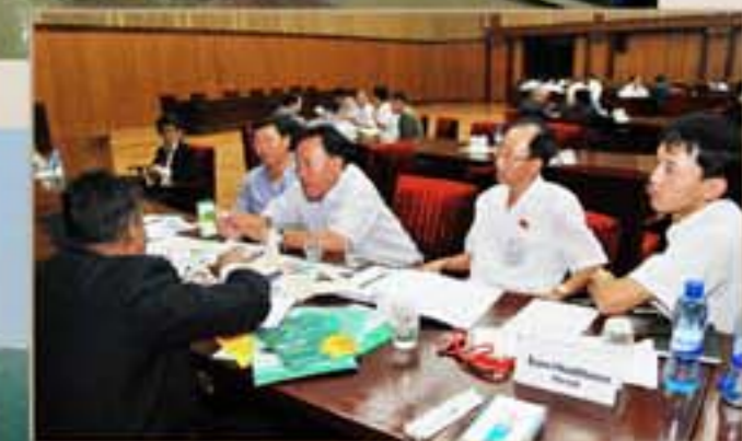
Work is in full swing for developing SEZs