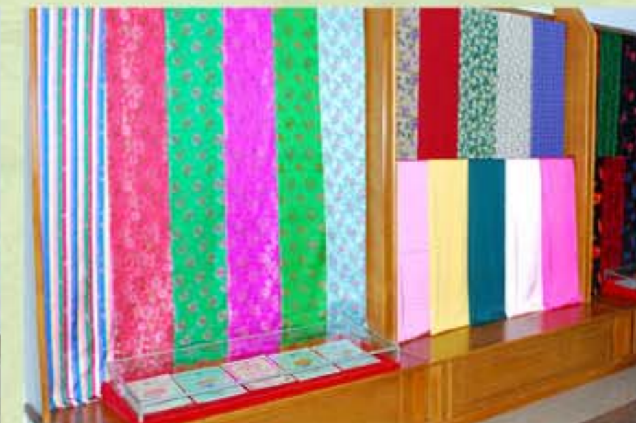
Some of the products of the mill