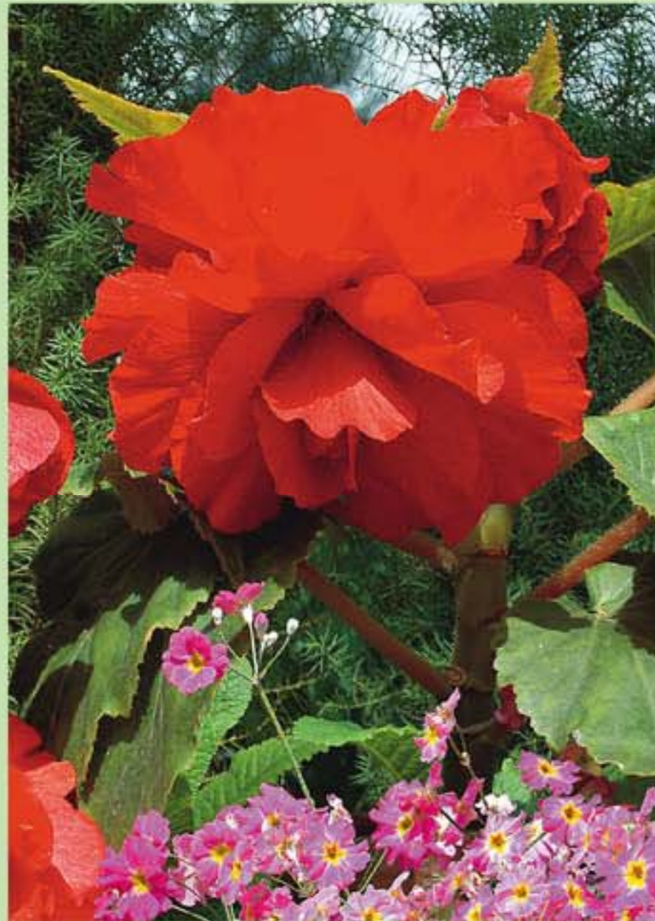
Kimjongilia, immortal flower