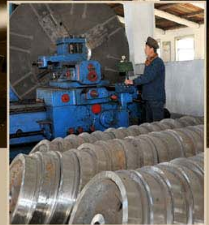
Producing more accessories for coal mines (at the Tokchon Coal-mining Machine Factory)

All the officials and miners of the Tokchon Area Coal-mining Complex are making efforts to bring about innovations in coal production, true to the call of Kim Jong Un, who noted in his New Year Address that a great heyday should be ushered in the revolution and construction by quickening the heroic march with enthusiasm and confidence in victory in this hope-filled year.