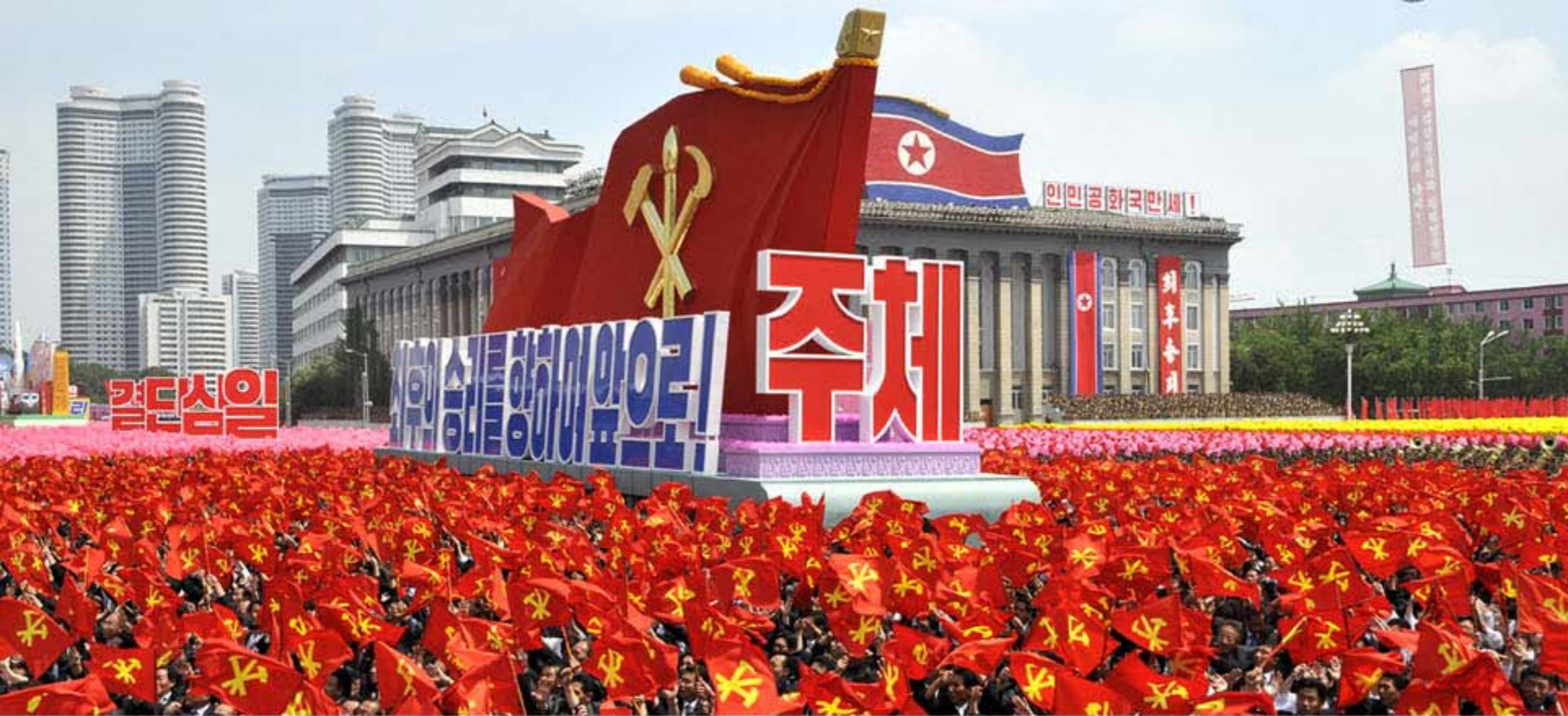
The Party, army and people are united single-heartedly behind their leader