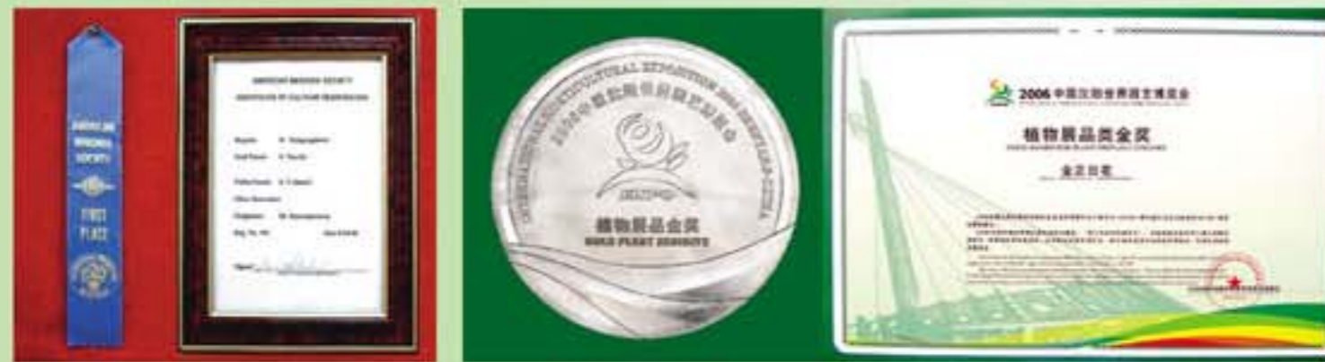
Kimjongilia is awarded gold and top prizes at the international flower shows