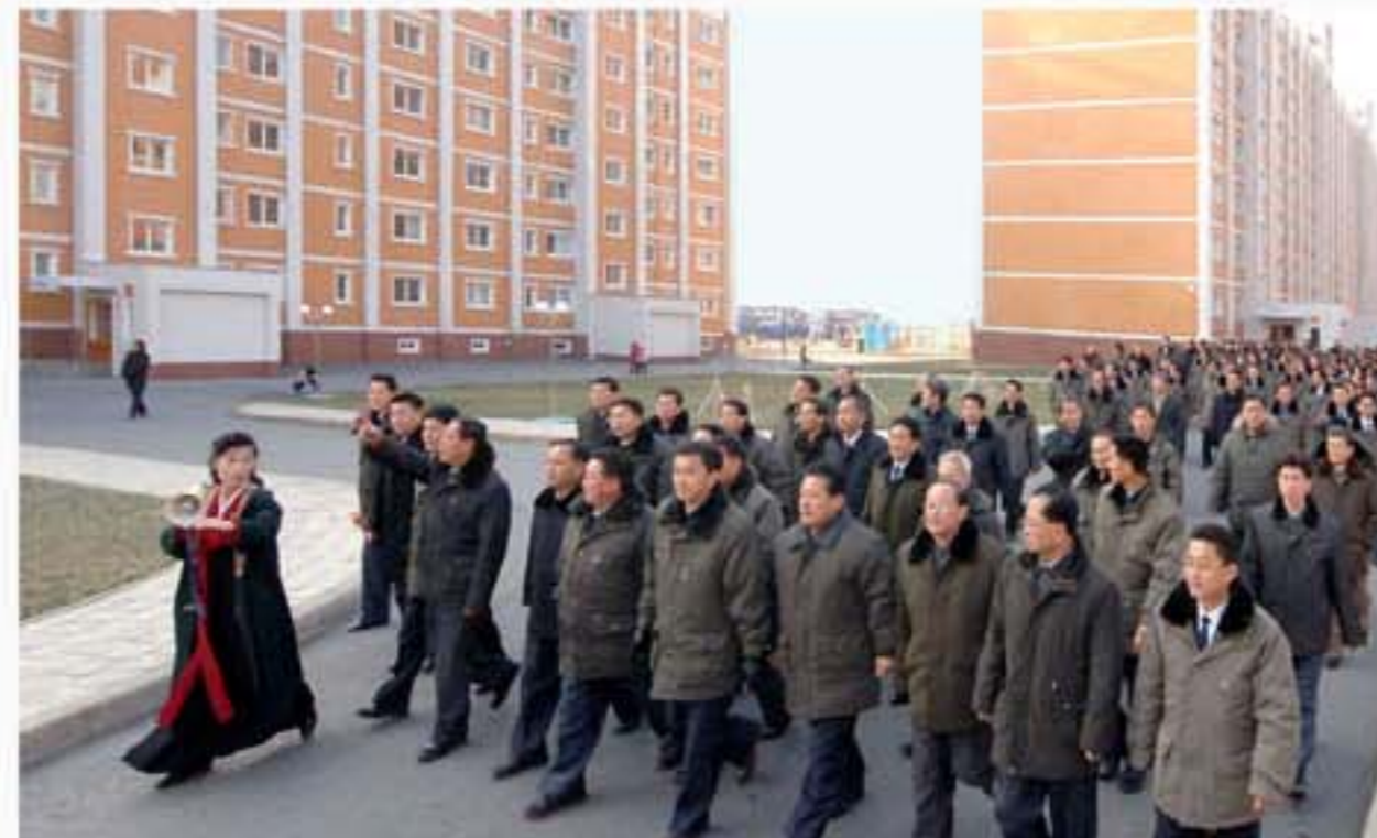
Participants look round different places of Pyongyang