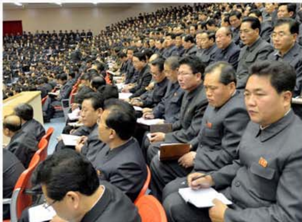
Collective and sectoral training courses are held