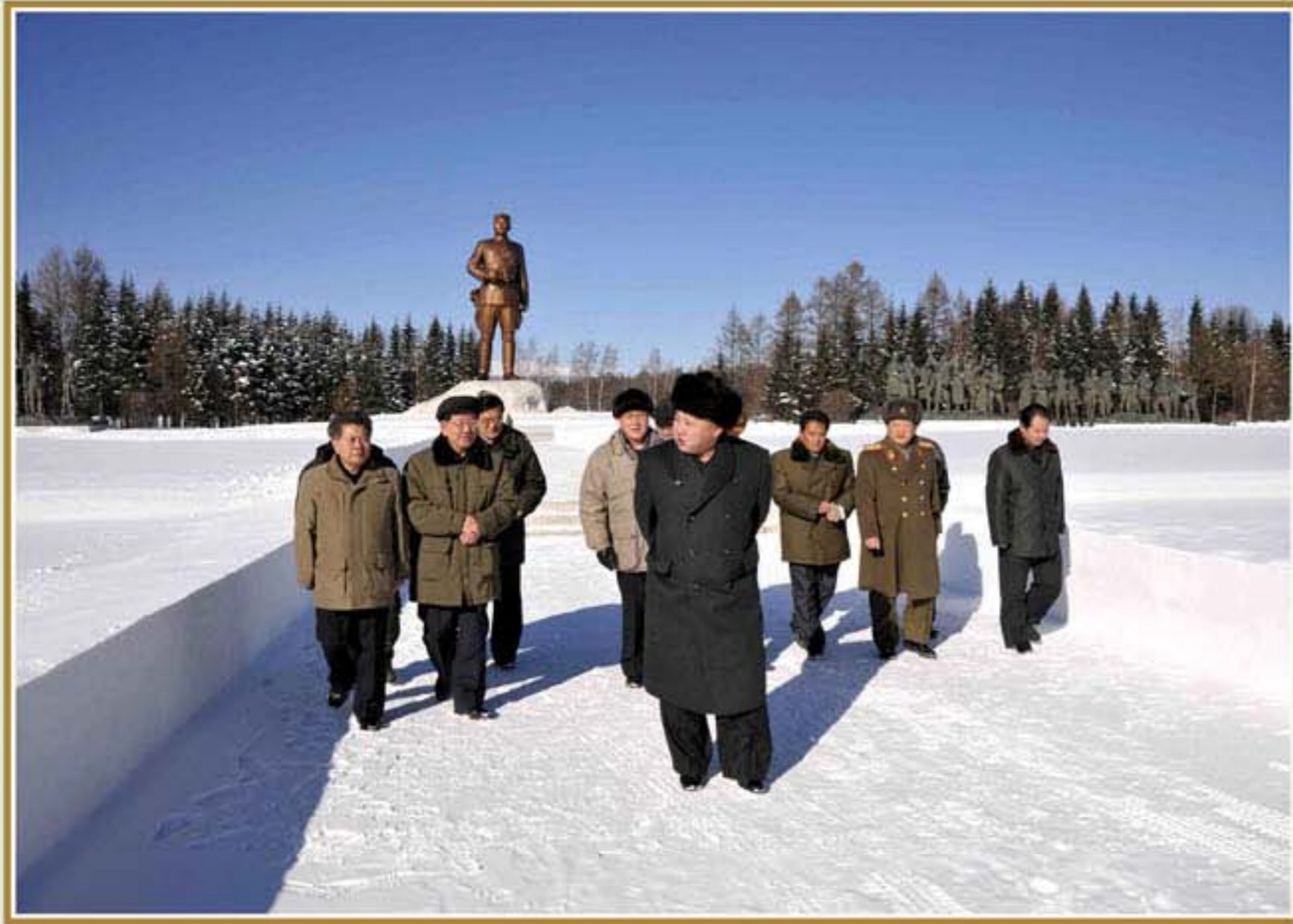
Kim Jong Un inspects the Samjiyon Revolutionary Battle Site in November Juche 102 (2013)