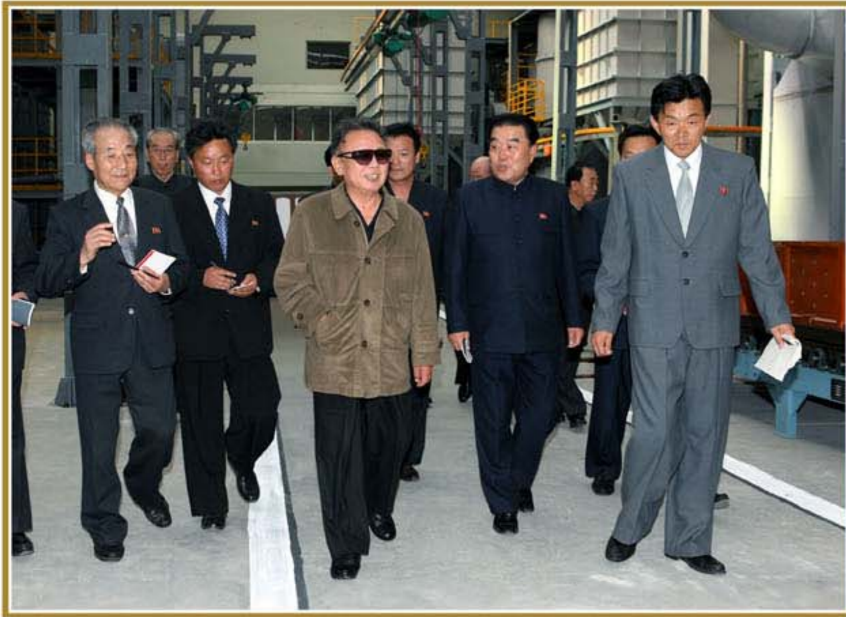
Kim Jong Il gives on-site guidance at the Ryongsong Machine Complex in May Juche 99 (2010)