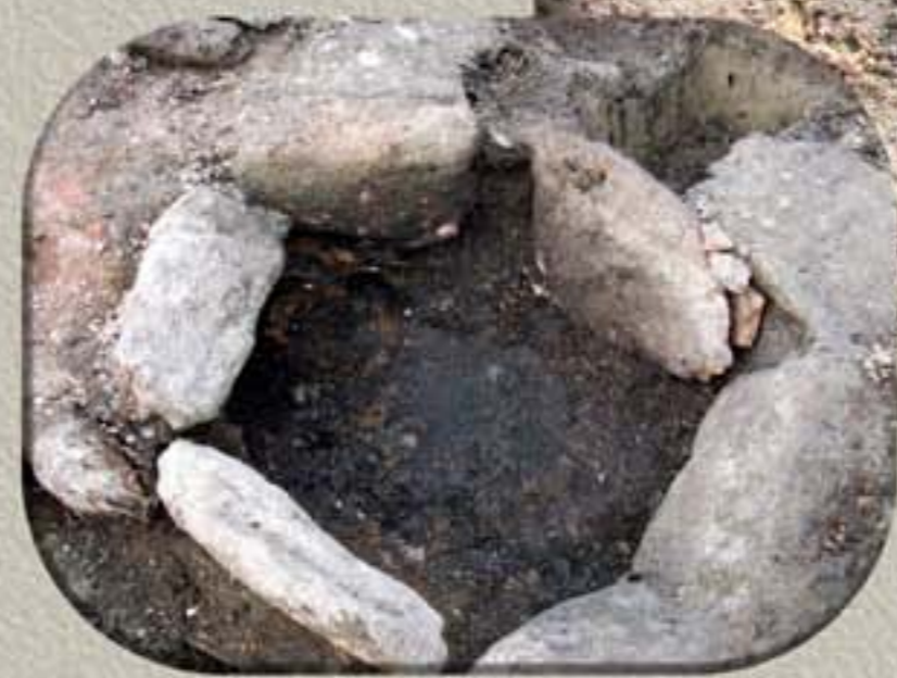
Salt kiln site and wok site

Recently a research group of the history faculty of Kim Il Sung University unearthed a big salt kiln site in the period of Koguryo (277 BC – AD 668) in the Wonup area, Onchon County, Nampho.