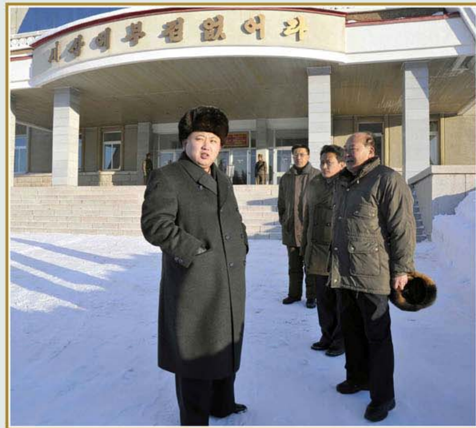
Kim Jong Un looks round the Samjiyon Schoolchildren's Palace in November Juche 102 (2013)