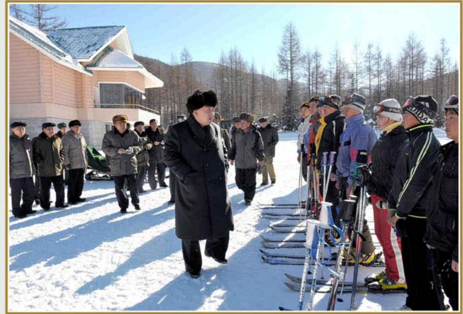
Kim Jong Un meets the skiers of the Sajabong Sports Team under training in November Juche 102 (2013)