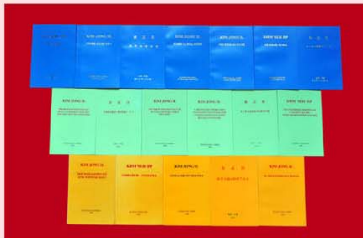
Kim Jong Il wrote many works, including Socialism Is a Science

This year marks the 40 th anniversary of the publication of the immortal work of the great leader Kim Jong Il, titled, On Some Immediate Tasks Facing the Party's Ideological Work for Modelling the Whole Society on Kimilsungism .