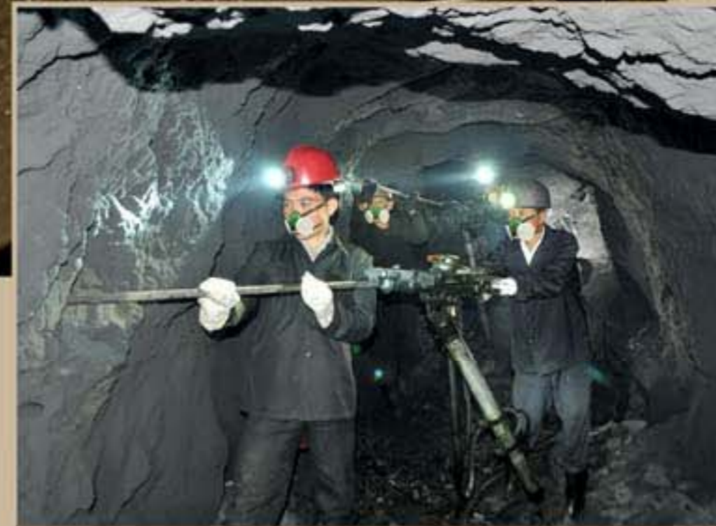
Giving precedence to tunnelling (at the Hyongbong Coal Mine)