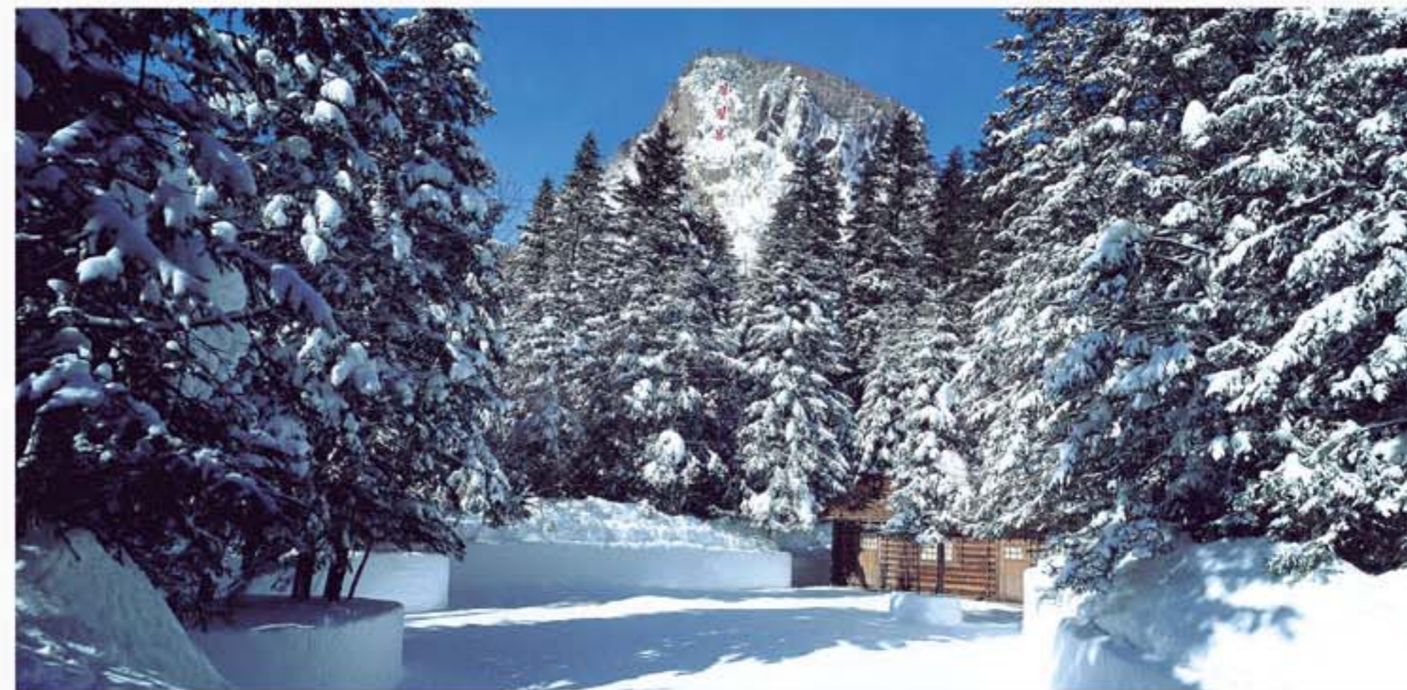
Kim Jong Il's birthplace in the Paektusan Secret Camp