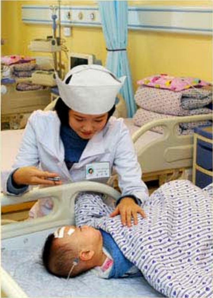
The hospital has departments for new-born babies, resuscitation and intensive care and other professional therapy