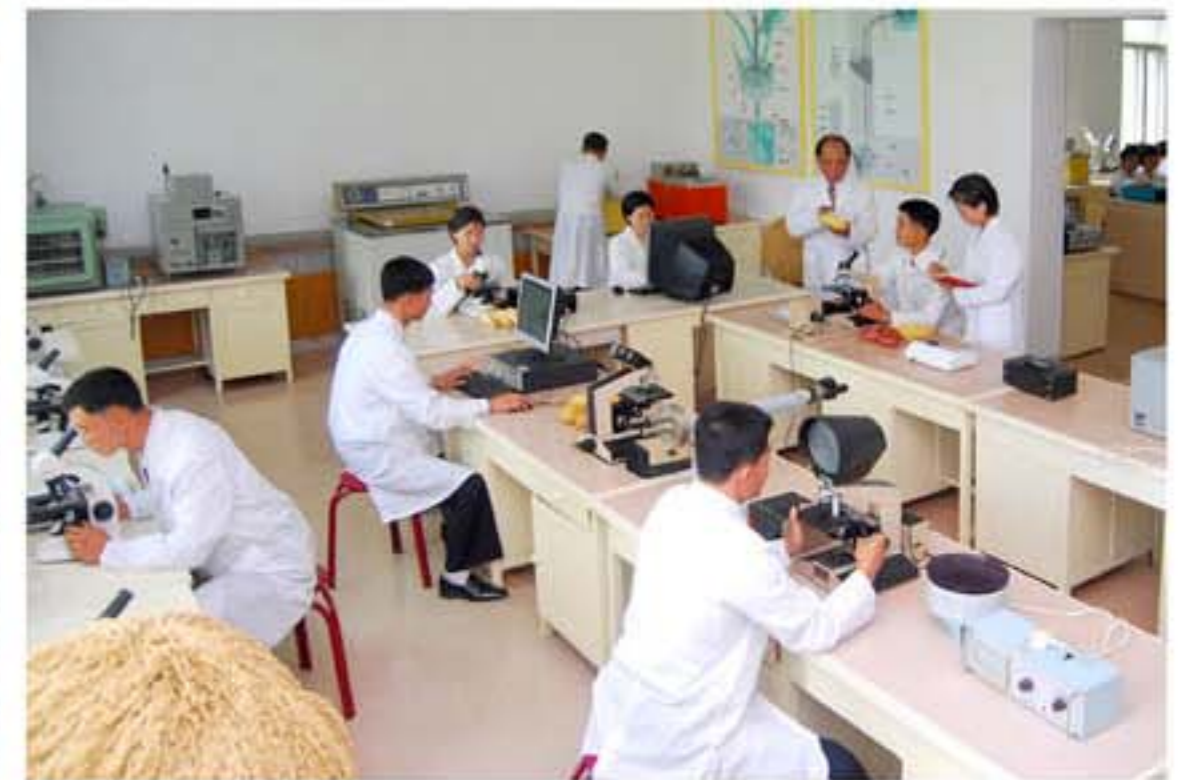
The college is directing its effort to training students to be competent personnel possessed with high-level sci-tech knowledge and practical ability