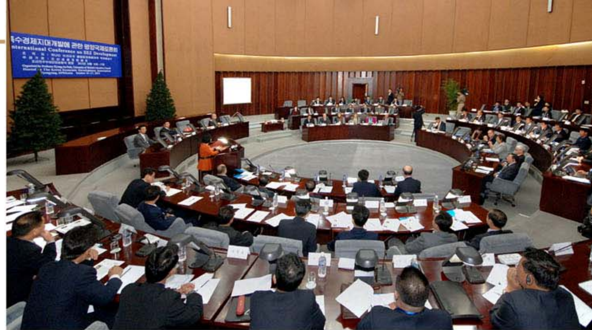
International Conference on SEZ Development held in Pyongyang in October Juche 102 (2013)