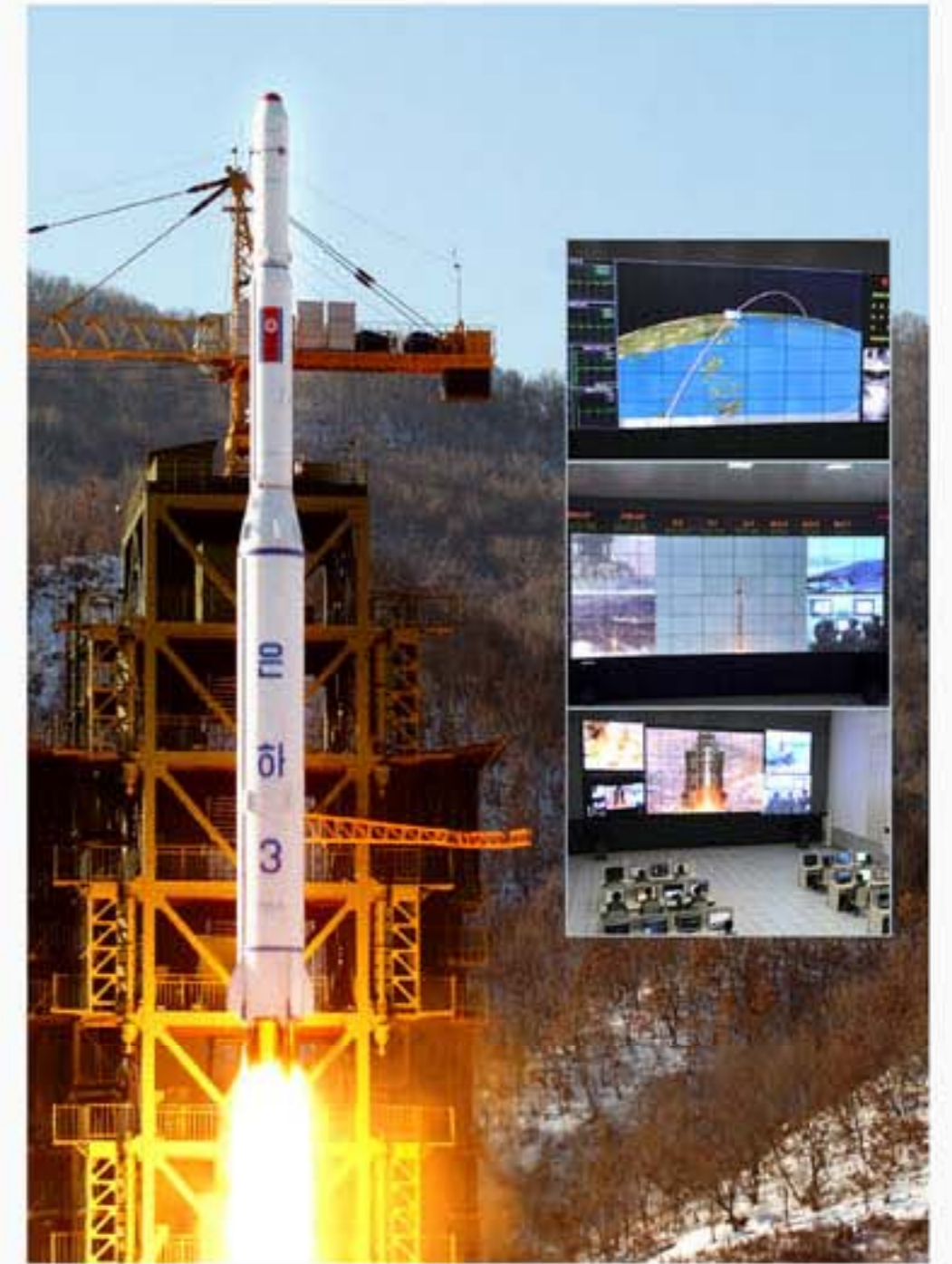
The DPRK demonstrates its status as a satellite manufacturer and launcher and a military power