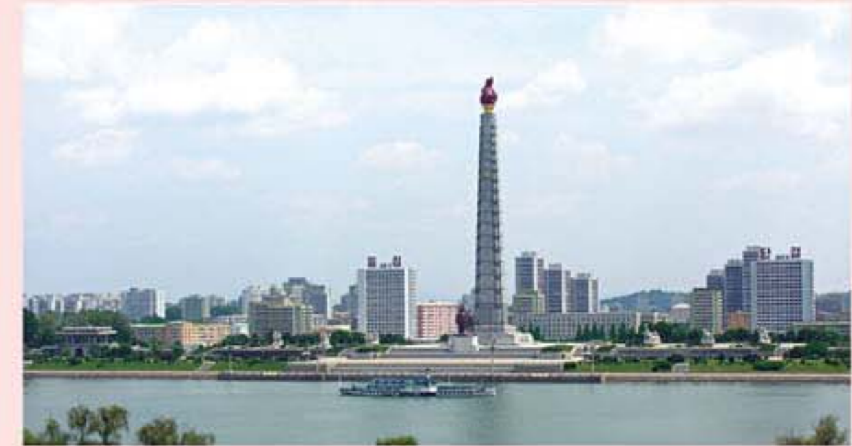
Tower of the Juche Idea unveiled in April Juche 71 (1982) to hand down the immortal exploits of President Kim Il Sung, the author of the Juche idea