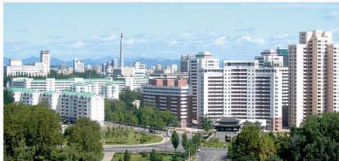
Modern houses have been built in Pyongyang and other urban and rural areas