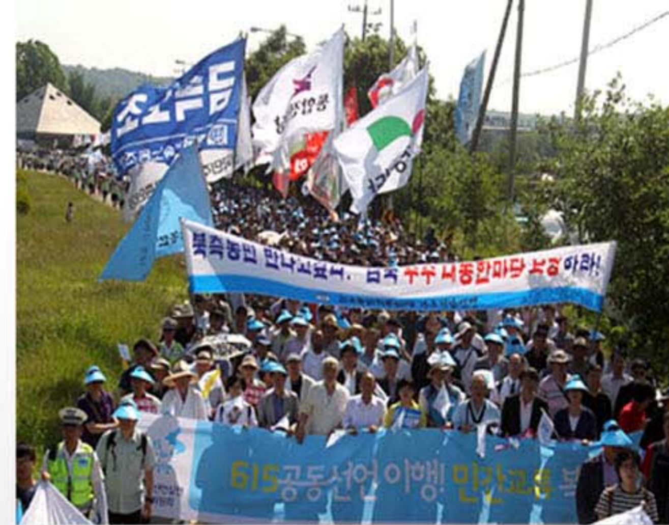
In demand of the implementation of the June 15 North-South Joint Declaration