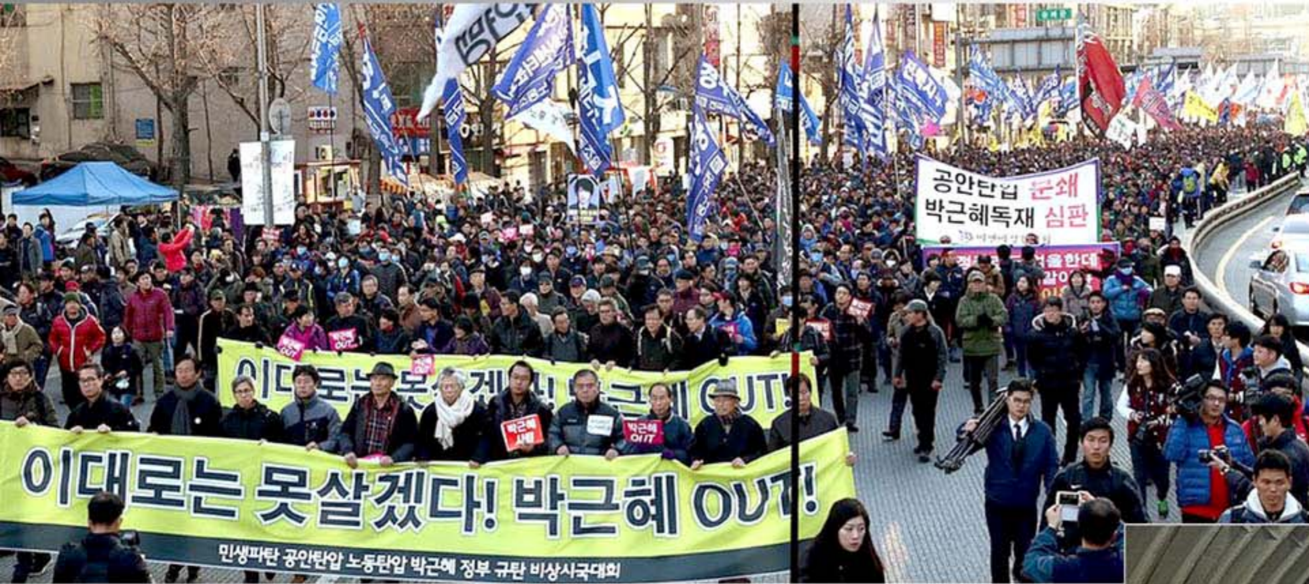
In demand of the resignation of the puppet regime