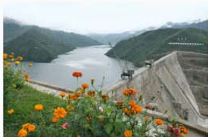
Hydropower stations have been built across the country