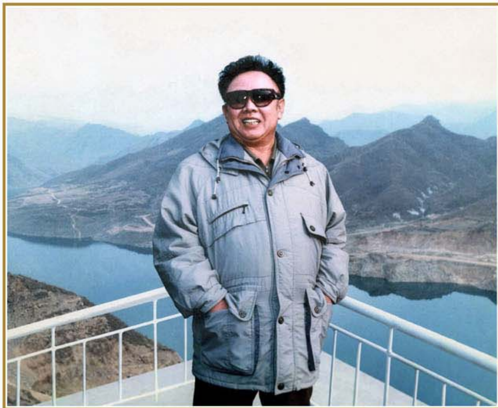
Kim Jong Il on tours of inspection in November Juche 89 (2000)