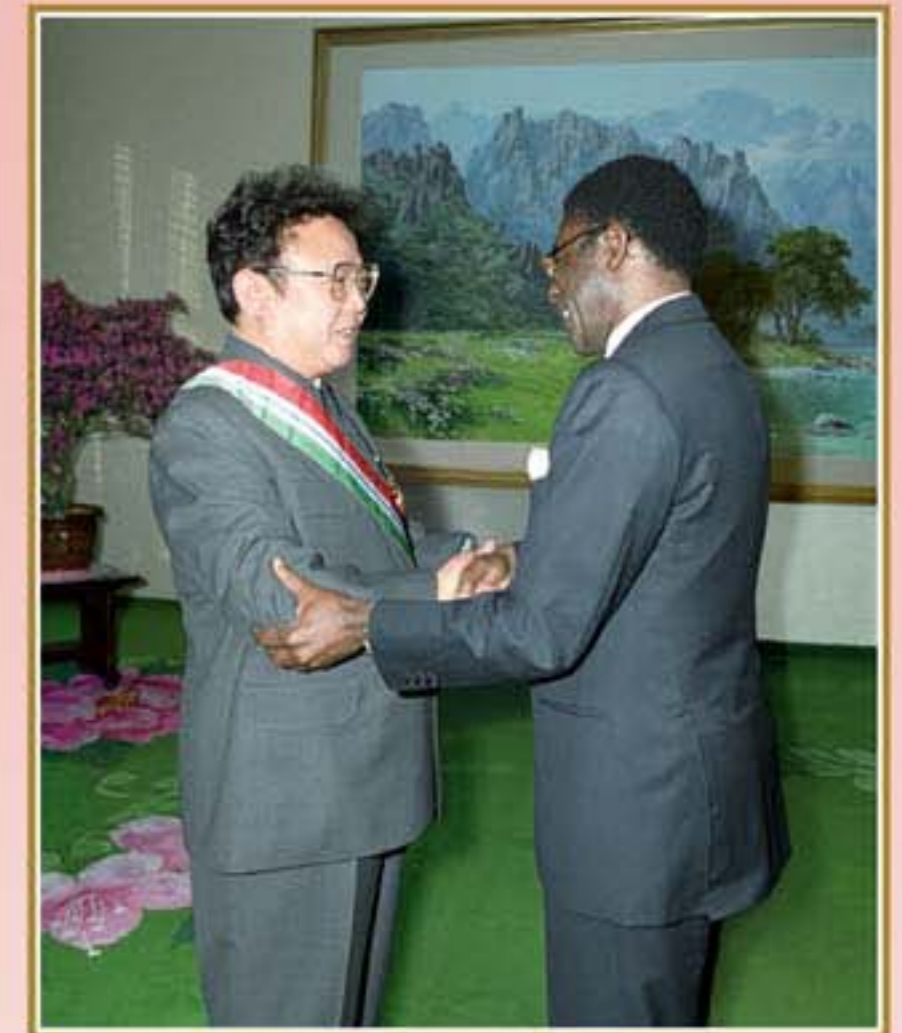
Kim Jong Il is awarded an order by Obiang Nguema Mbasogo, President of the Republic of Equatorial Guinea, in April Juche 81 (1992)