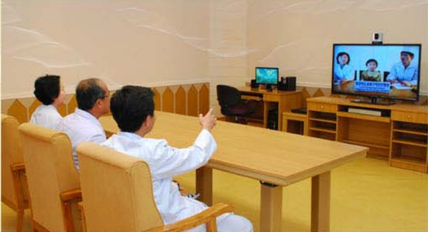
Telemedicine system is available