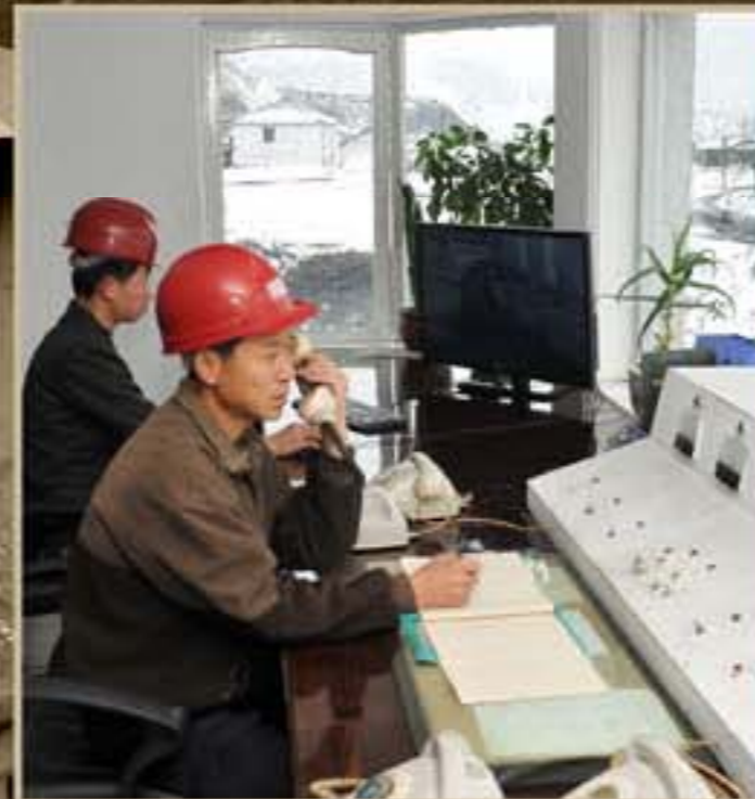
Scrupulous arrangement and command of production (at the Tokchon Coal Mine)