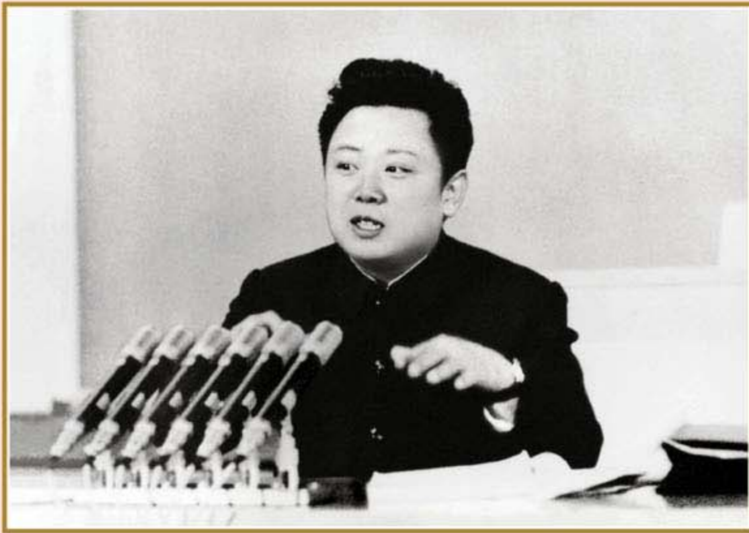
Kim Jong Il makes a concluding speech at the national short course for the information workers of the Workers' Party of Korea in February Juche 63 (1974)

(1974), in which he formulated the revolutionary ideology of the President as Kimilsungism and clarified in an all-round way its historical position, composition and contents. Since then the progressive people of the world could accelerate the cause of independence, the cause of socialism, with confidence on the basis of correct outlook on the world, revolutionary theories and fighting methods in the era of independence.