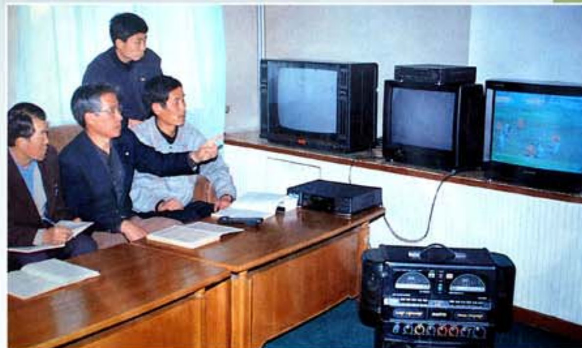
With the researchers of the Sports Science Institute in Juche 89 (2000)