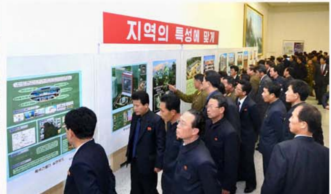
A show and exhibition are held for the participants in the grand short course