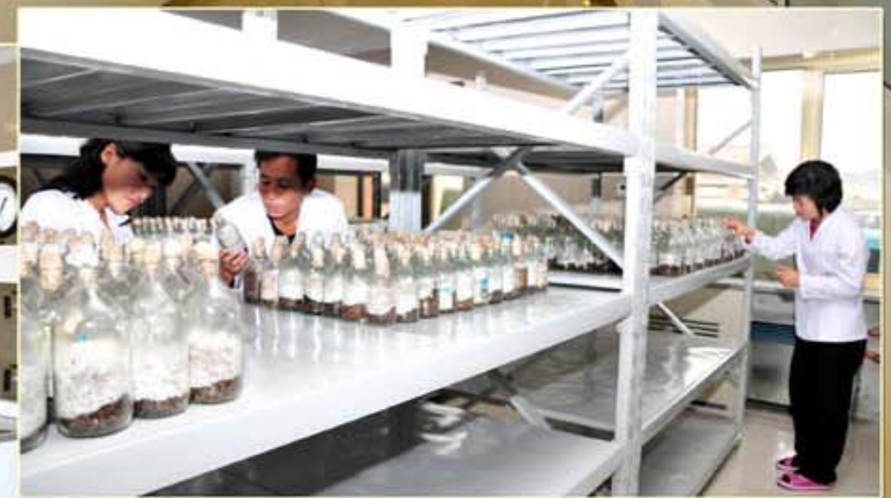
Various laboratories, including the protogene store and laboratory for cultivation, are furnished with latest facilities and conditions for scientific research