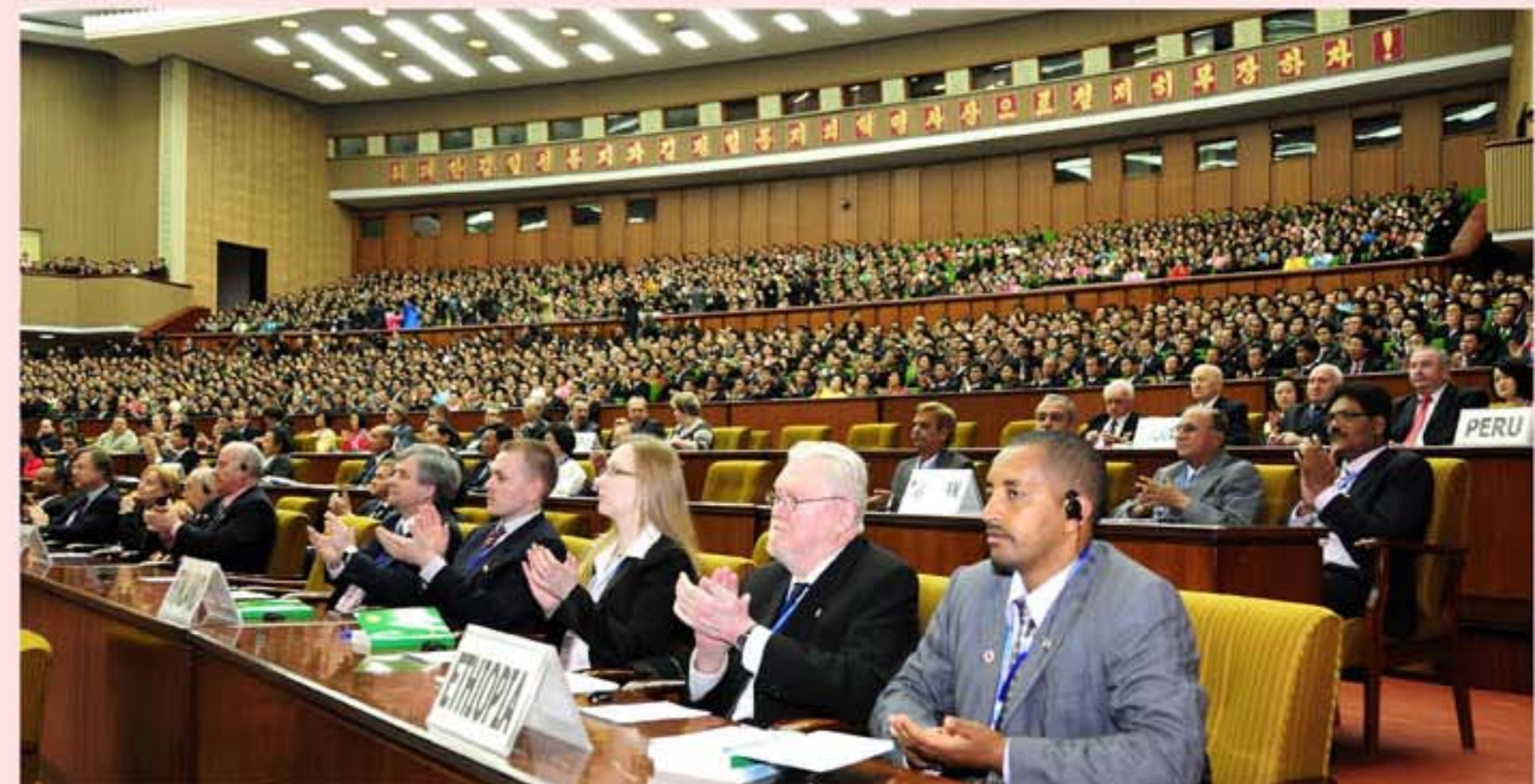
World Congress on the Juche Idea held in April Juche 101 (2012)

Penetrating deep into the reality, Kim Jong Il made public his work on February 19, Juche 63