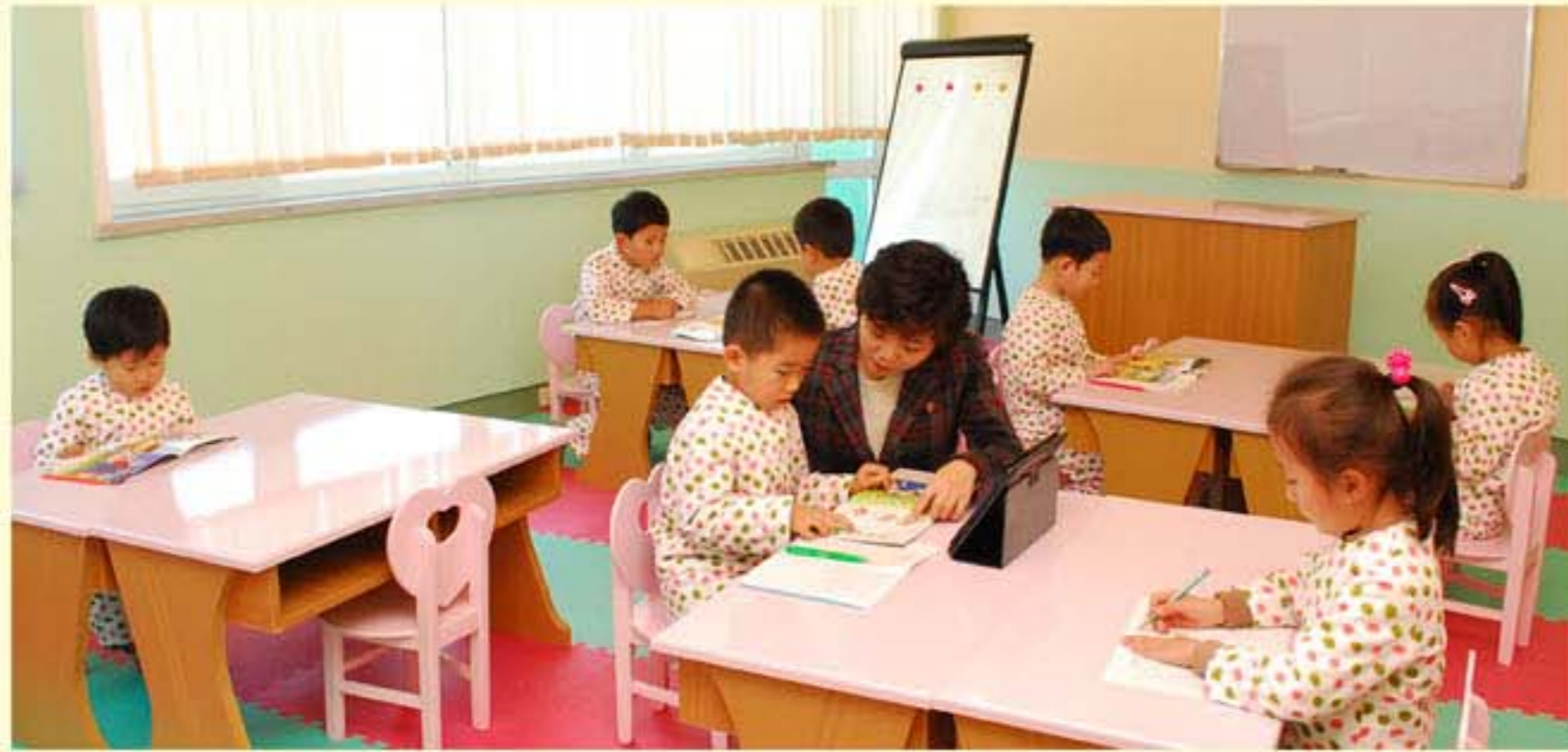
Conditions are provided for education of inpatients from kindergartens and primary and middle schools