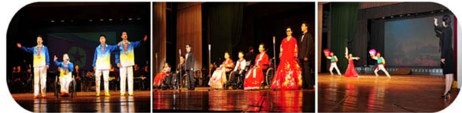
A performance given by members of the art group of persons with disabilities