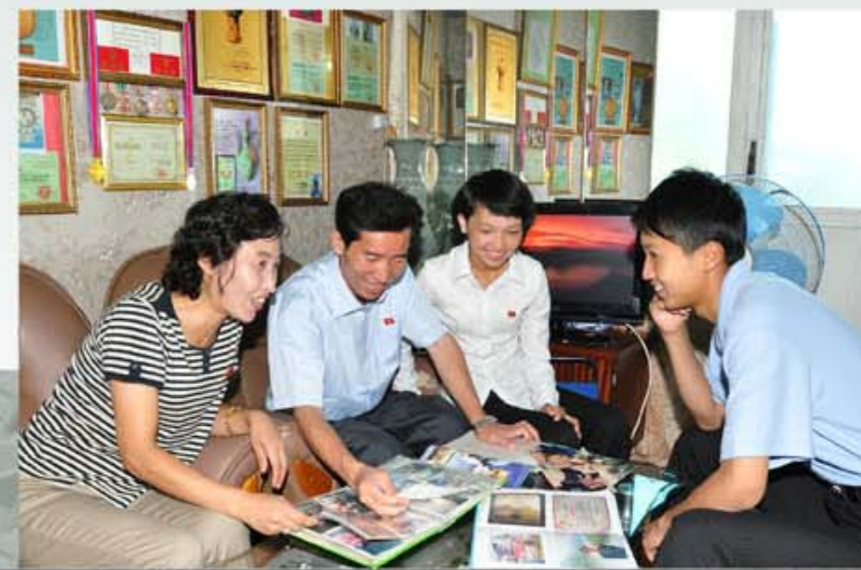
Recollecting his father