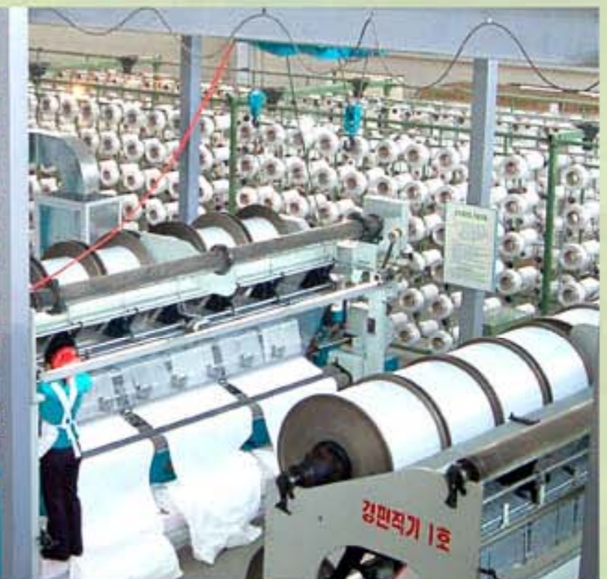
The mill observes technical regulations and standard operating methods to improve the quality of its products