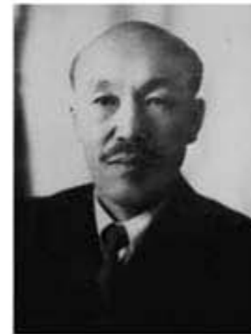
Hong Myong Hui, Chairman of the Democratic Independence Party