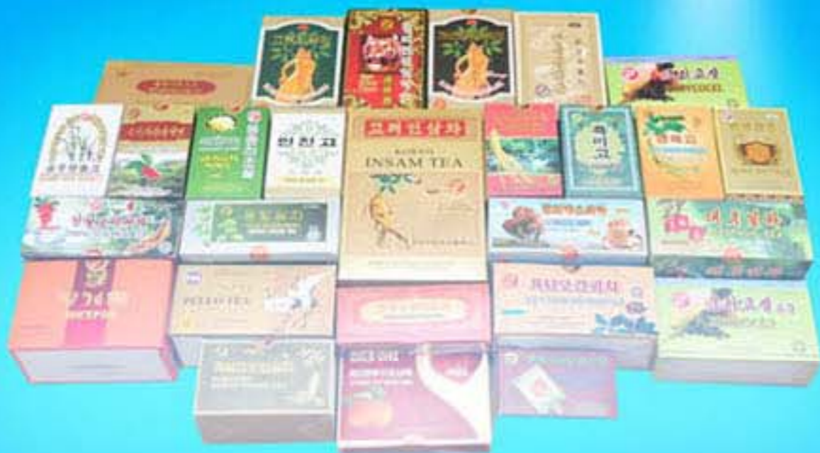
Traditional Koryo medicines such as Kyongokko and Ryukmigo enjoy popularity

Mannyon is a trademark of the Koryo medicines produced in the DPRK. It is well recognized at home and abroad. The Mannyon Pharmaceutical Factory was inaugurated 27 years ago, and it turns out such Koryo medicinal pastes as Kyongokko, Ryukmigo, Injingo, Changchulgo, and famous insam products in the form of tea, decoction, extract, pill and so on. These Mannyon Koryo medicines are famous as their main