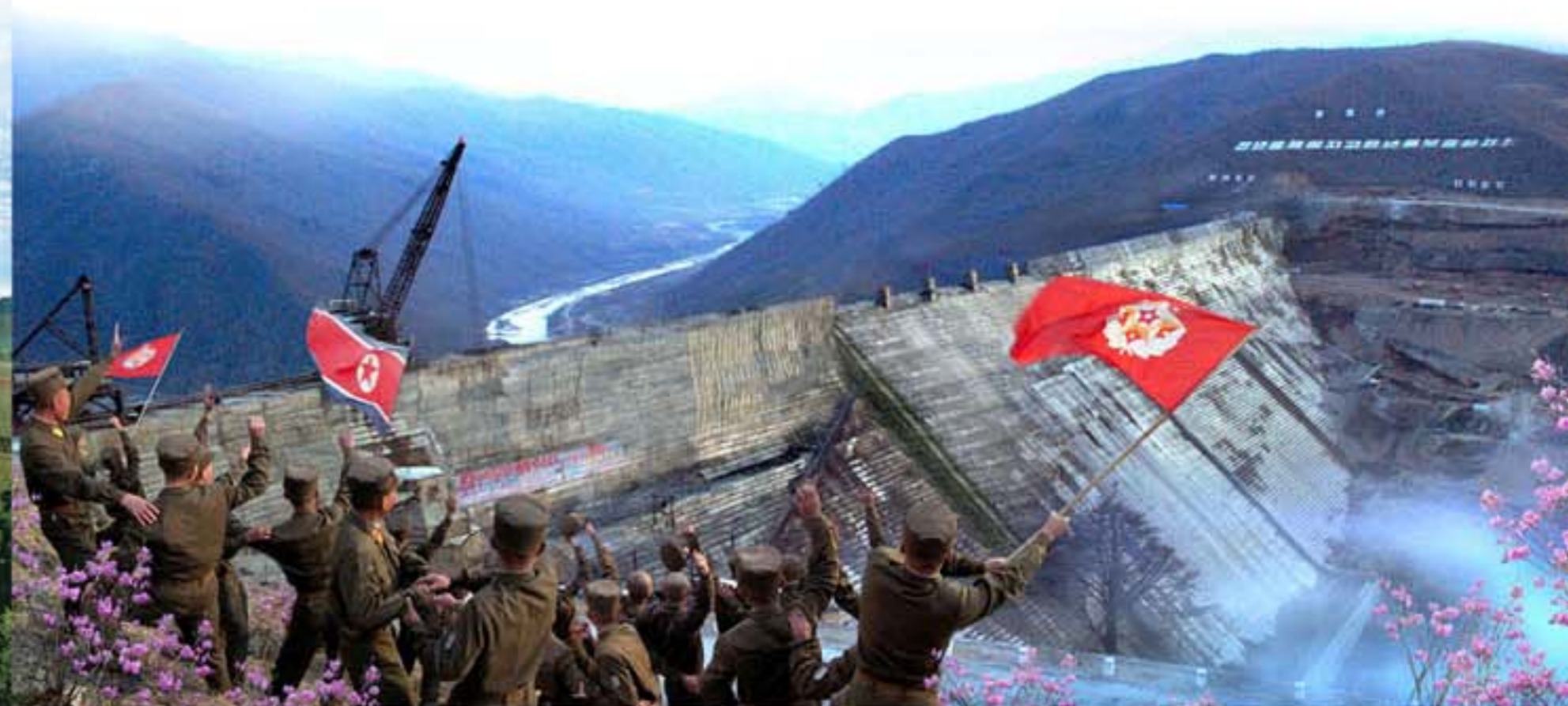
The Korean People's Army plays the role of the hardcore unit and main force both in national defence and socialist construction