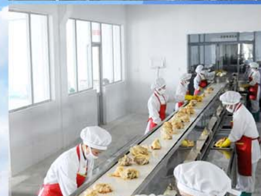
Various vegetable products including pickles and kimchi are turned out