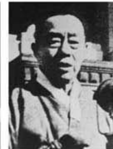
Kim Kyu Sik, President of Federation of National Independence