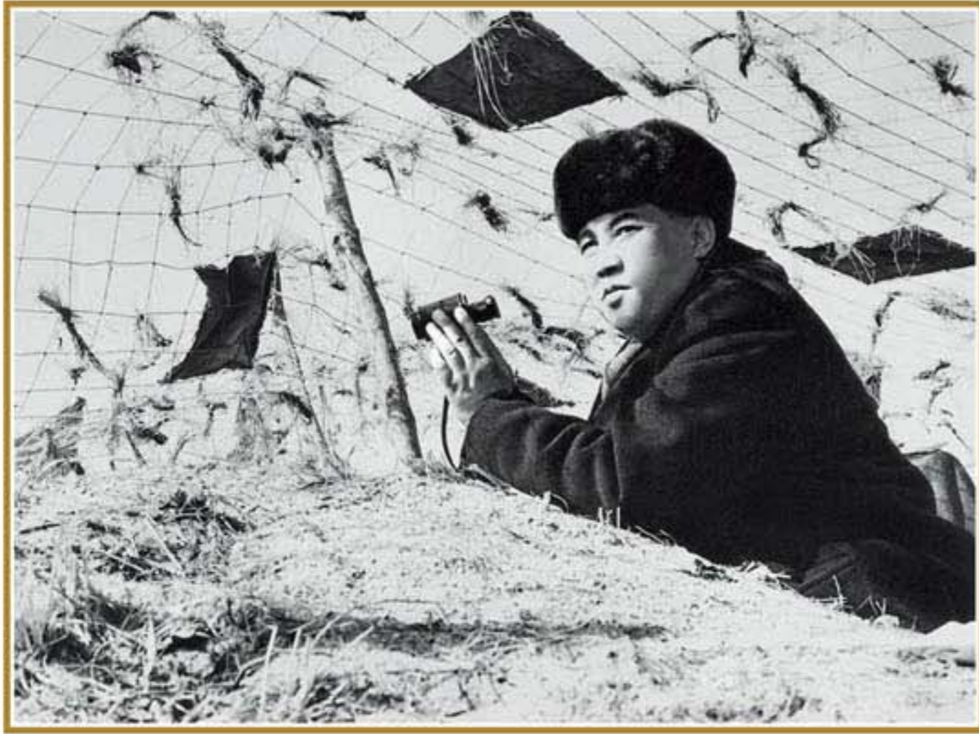
Kim Il Sung inspects a KPA unit defending Mt. Taedok (February 1963)