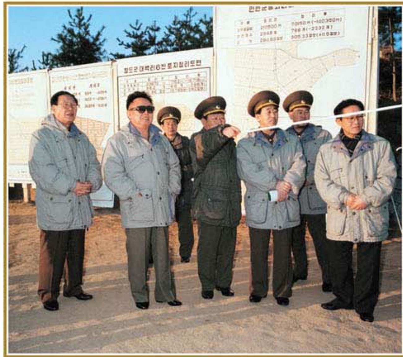
Kim Jong Il provides field guidance to the land realignment project in Kangwon Province (March 1999)