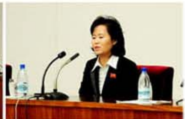
Ko Kyong Hui