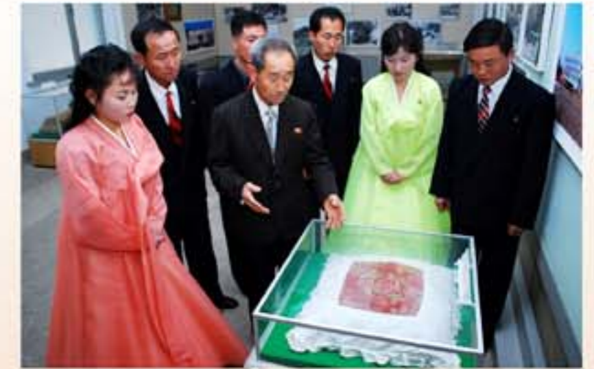
Agricultural workers look round the Wonhwa Revolutionary Museum

Whenever the Day of the Sun, birthday of President Kim Il Sung, comes around, officials and workers of our Wonhwa Cooperative Farm feel greater yearnings for the President.