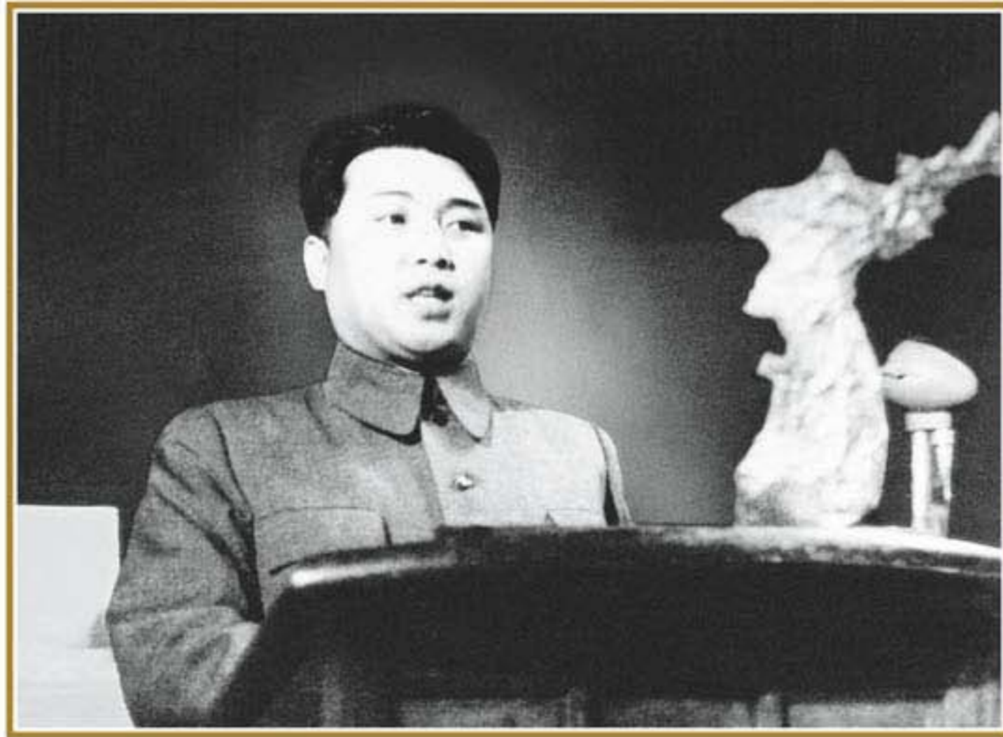
Kim Il Sung delivers a speech in the Joint Conference of Representatives of Political Parties and Public Organizations in North and South Korea (April 1948)