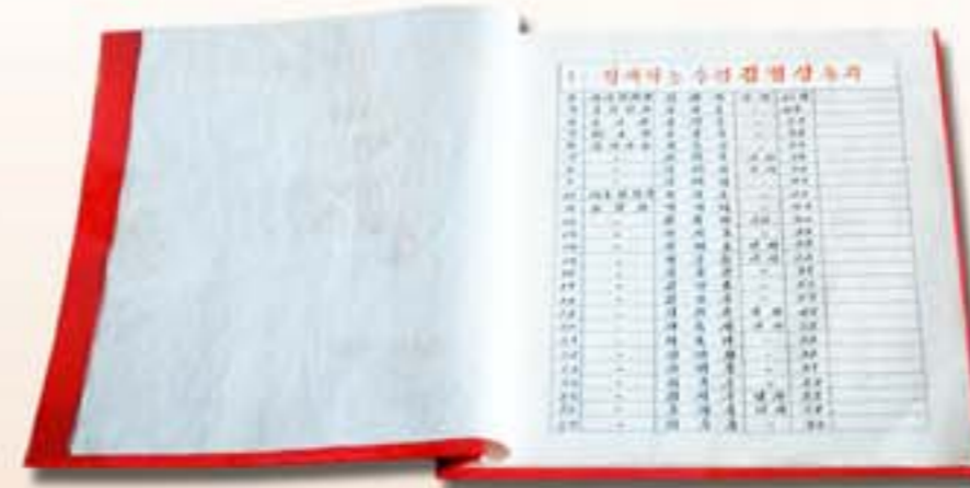
The list on which the name of Kim Il Sung was registered as an honorary member of the farm