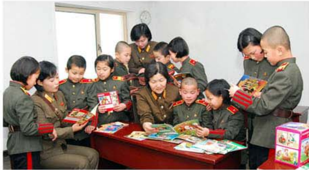
The illustrated books of fairy tales are sent by the respected Marshal Kim Jong Un