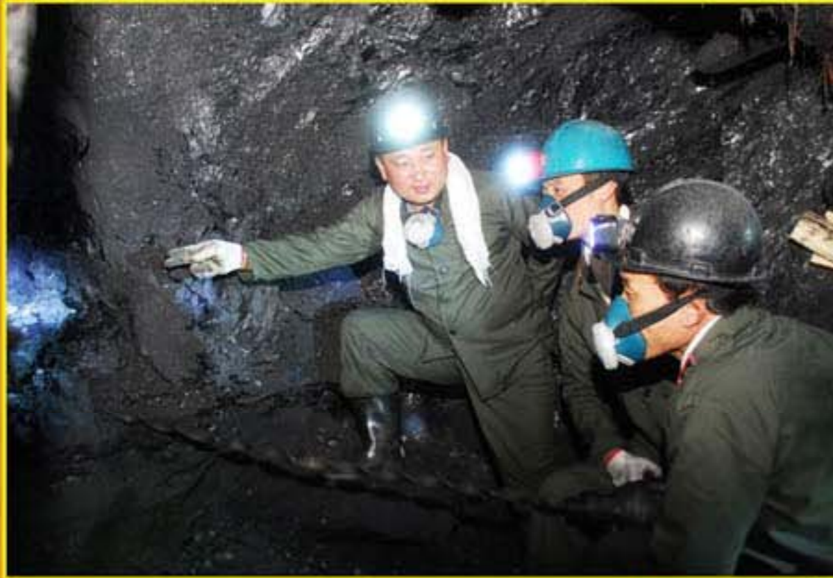
A rational hewing method is introduced in Inpho Coal Mine