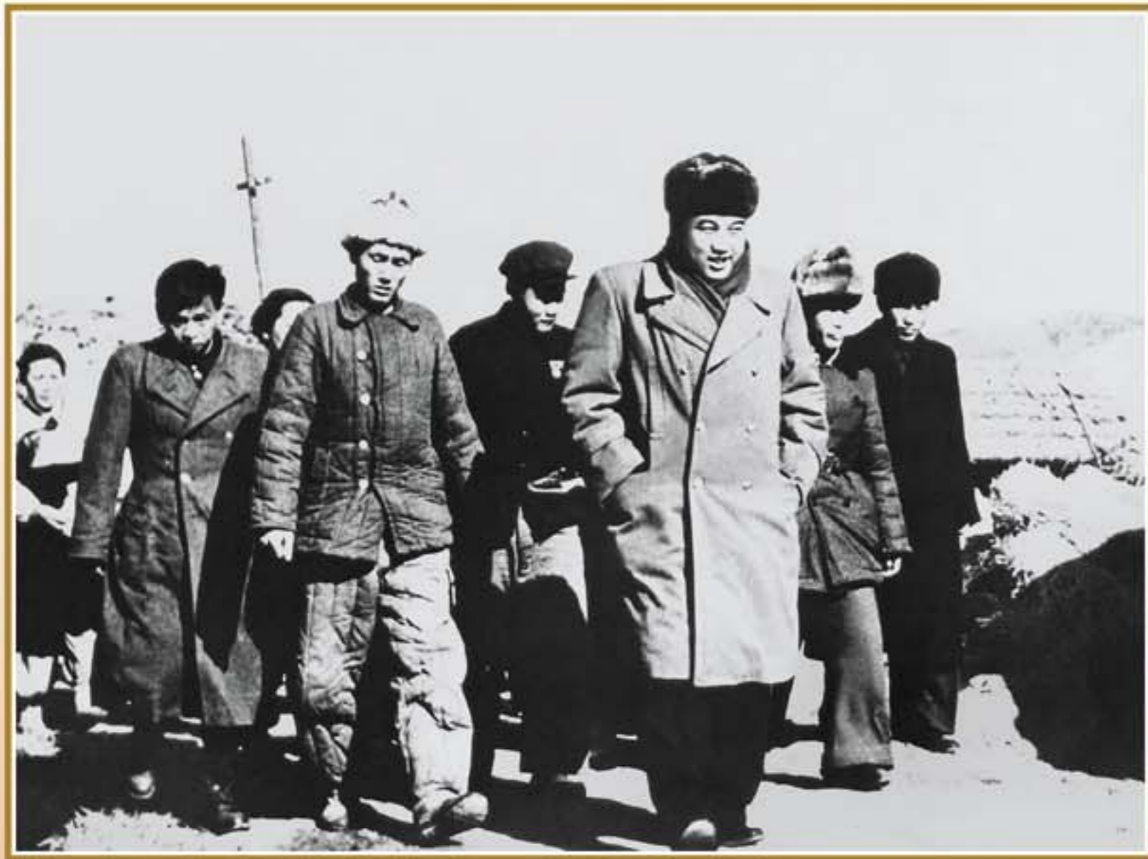
Kim Il Sung gives field guidance at the Wonhwa Cooperative (February 1956)