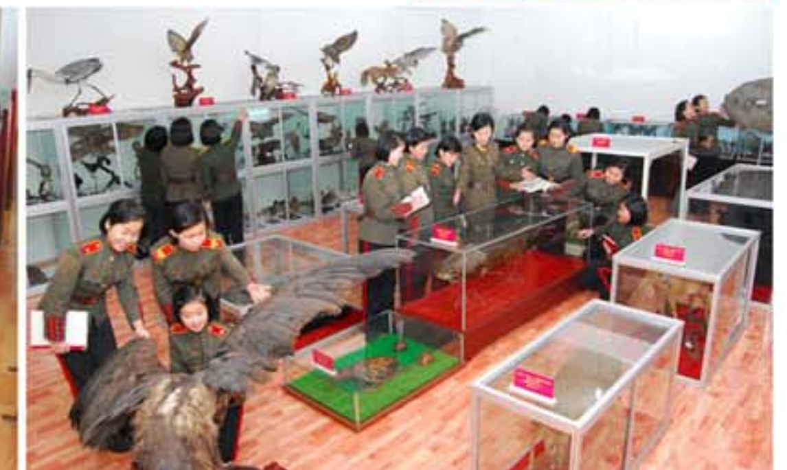
Students acquire broad knowledge at the school furnished with excellent conditions for education