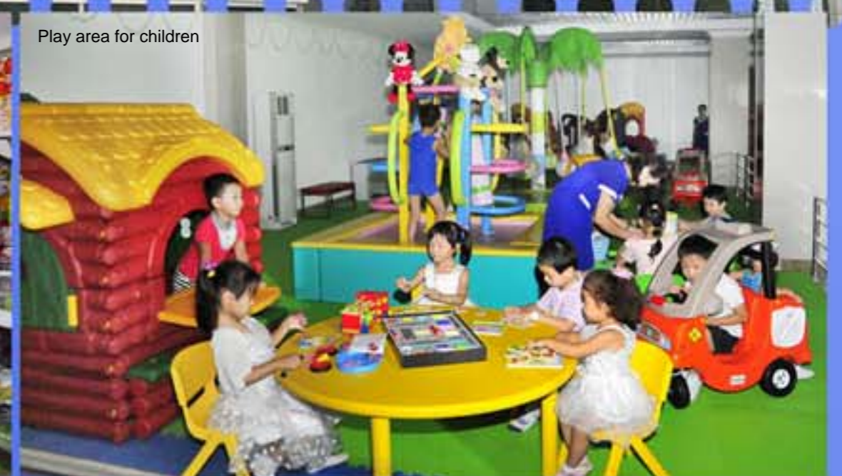
Play area for children