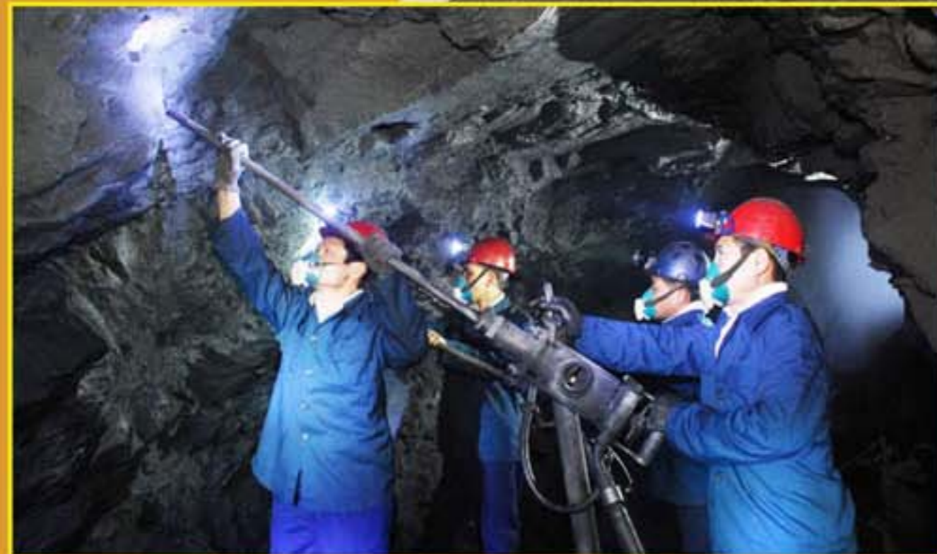
Precedence is given to tunnelling in Joyang Coal Mine