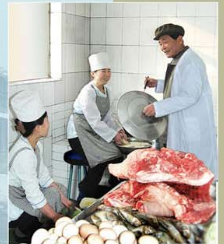
His attention is directed to supply service work for the workers