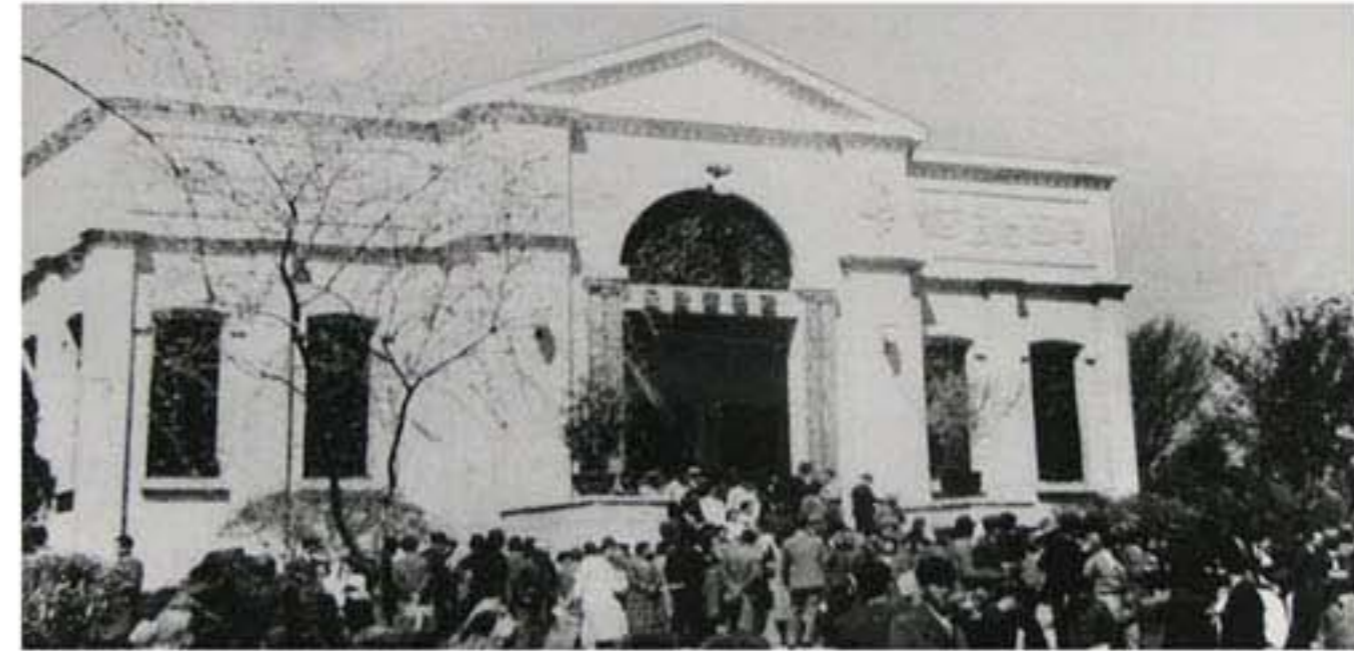
Moranbong Theatre where the joint conference was held