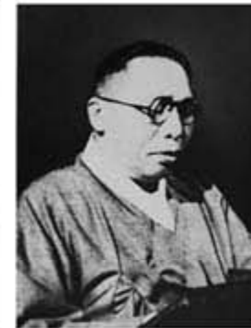
Kim Ku, Chairman of Independence Party of Korea