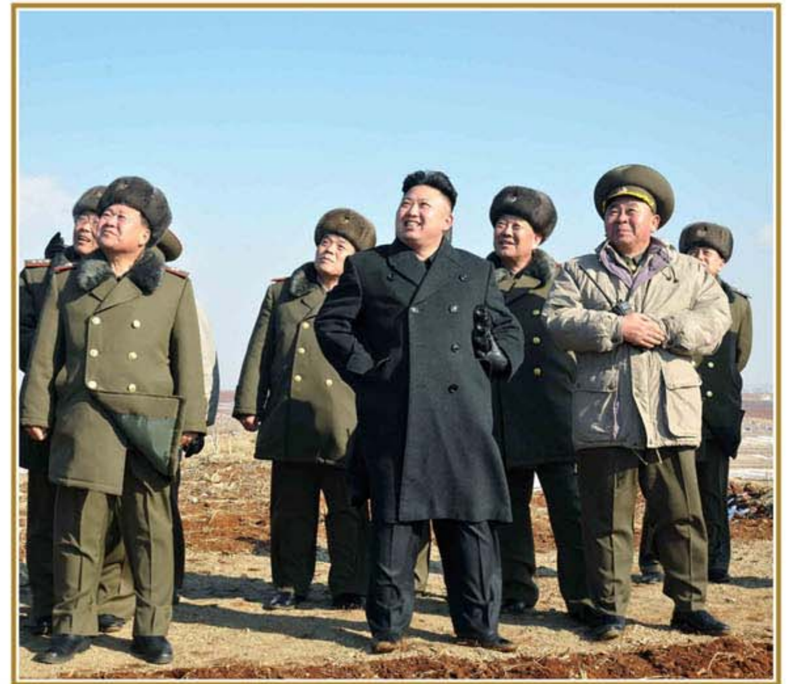
Supreme Commander Kim Jong Un guides the flying drill and parachuting practice of airborne troops of the Aircraft and Anti-aircraft Force and Large Combined Unit 630 of the Korean People's Army (February 2013)