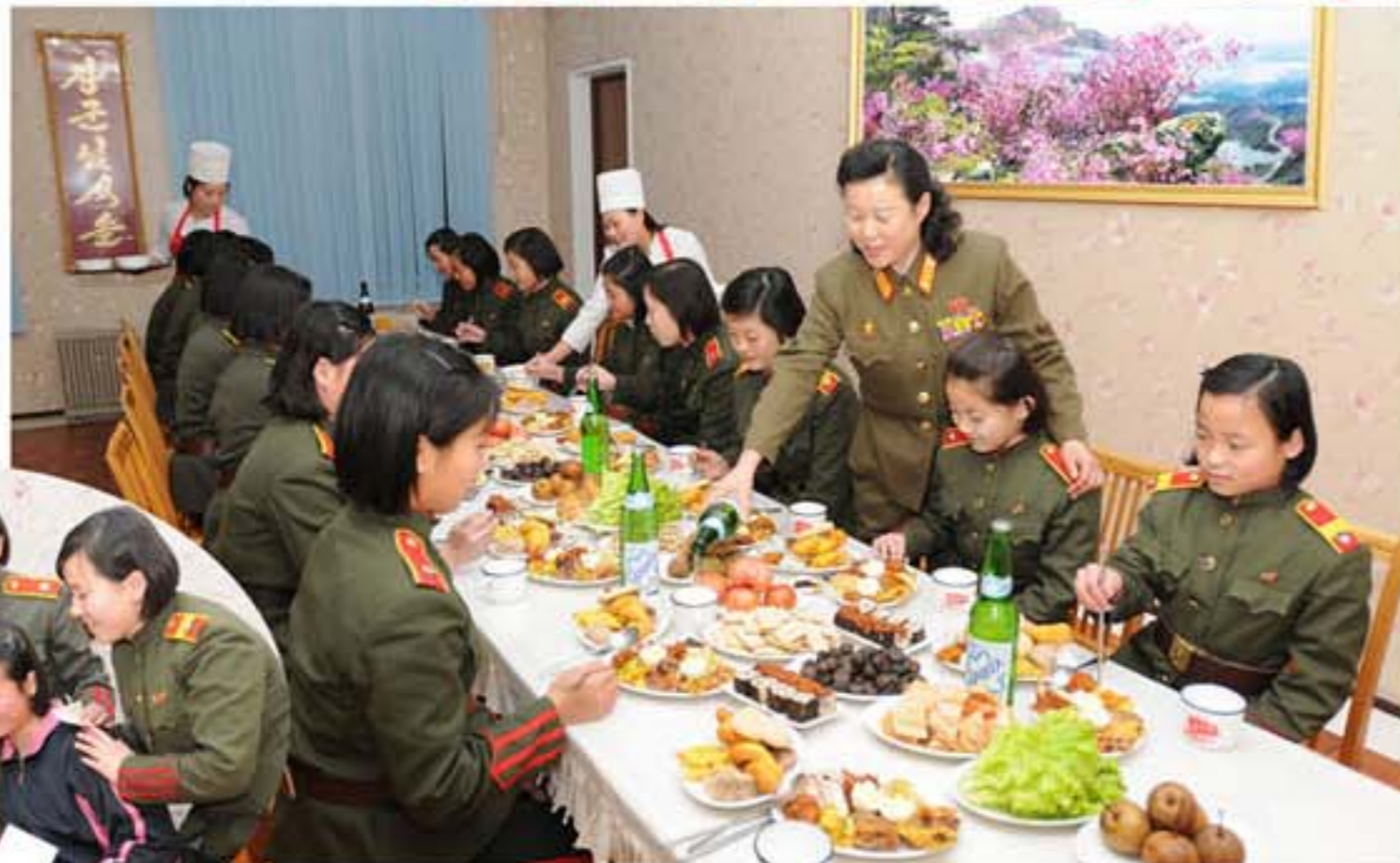
Pleasant evening hours