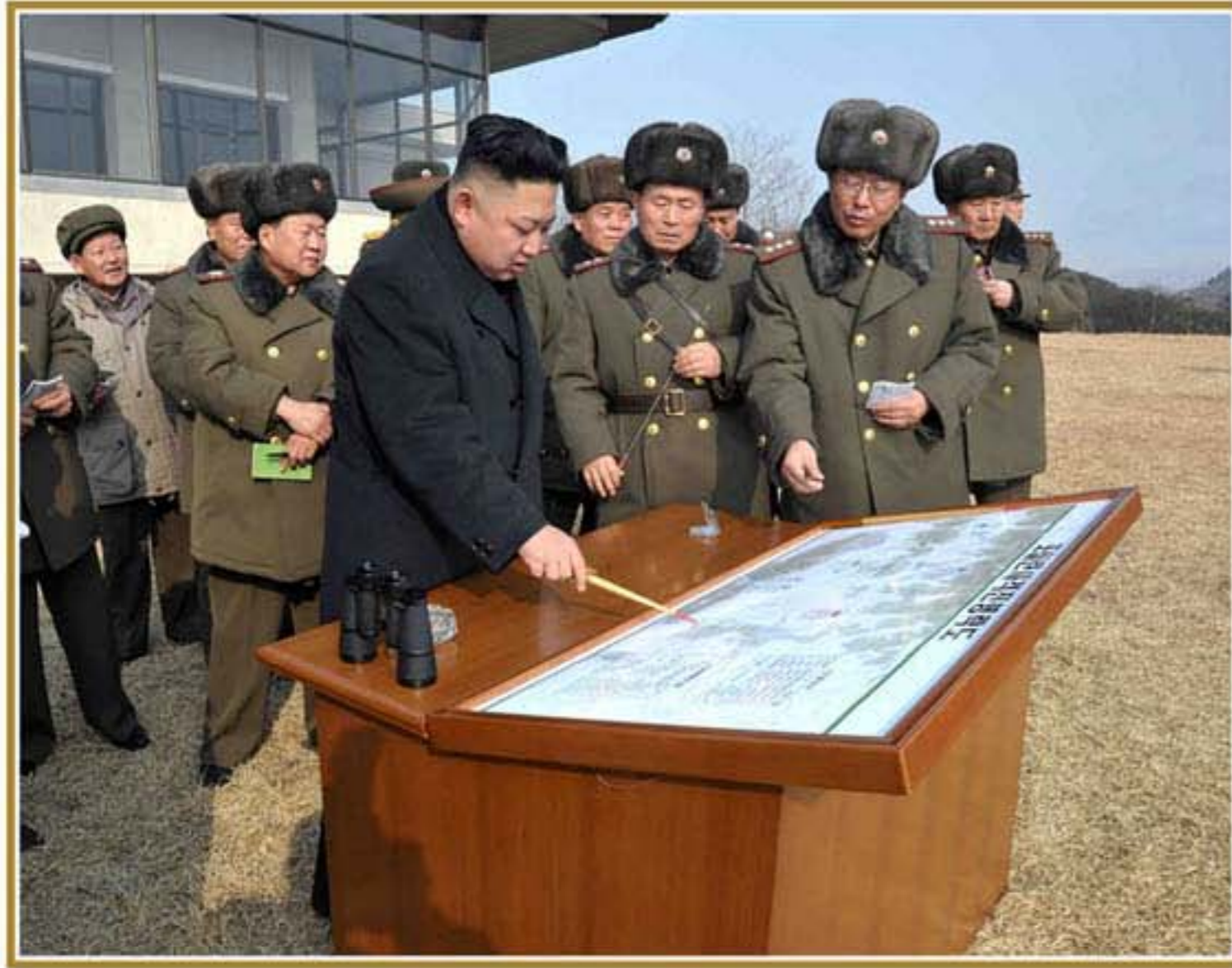
Kim Jong Un guides the artillery firing drill of the KPA (February 2013)