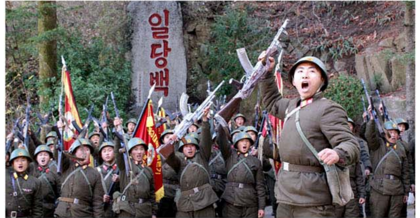
KPA service personnel are full of determination to implement the slogan of "A-match-for-a-hundred"

Penetrating into the changed reality and the demand of the developing revolution in the 1990s, he formulated Songun politics as the basic political mode of socialism and put up the KPA as the main force of the revolution, thus raising its position and role to the top.