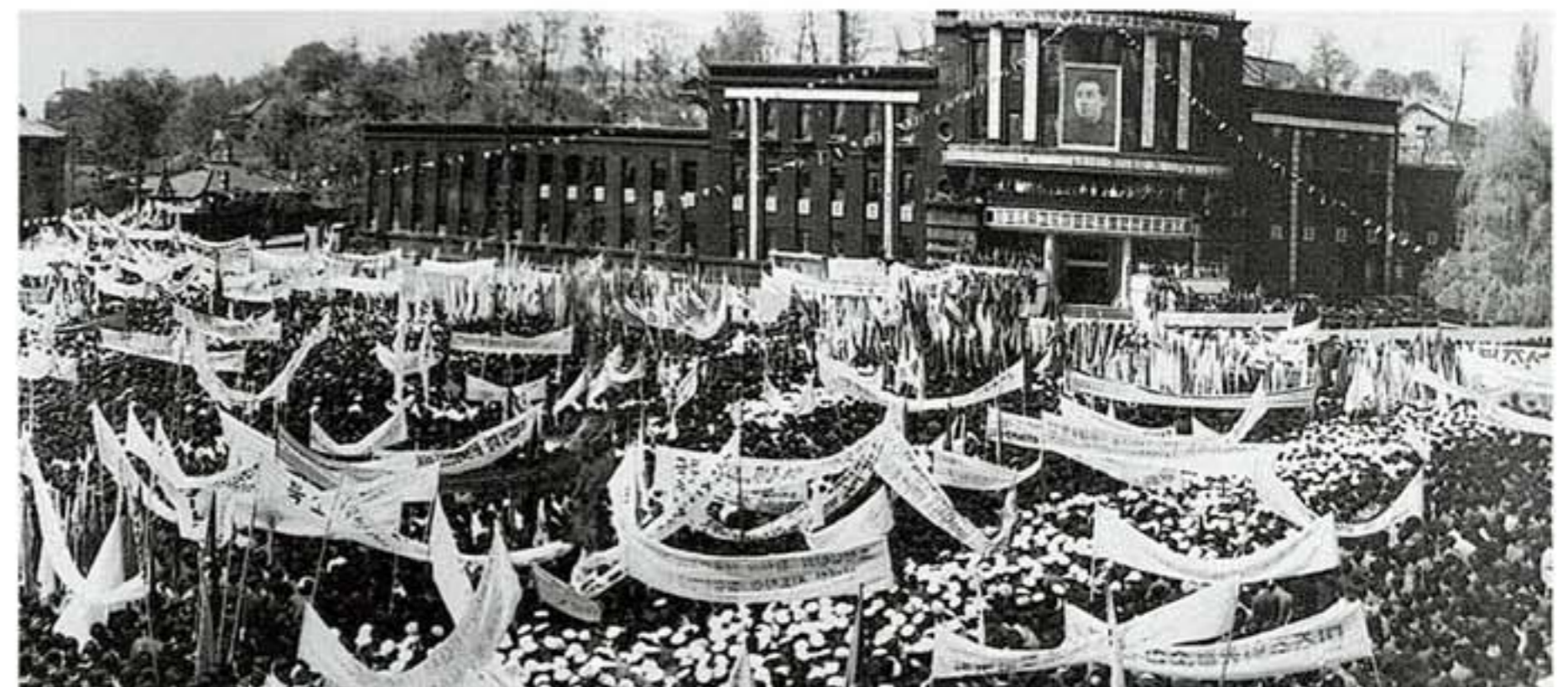
Pyongyang mass rally held in support of the joint conference (April 1948)