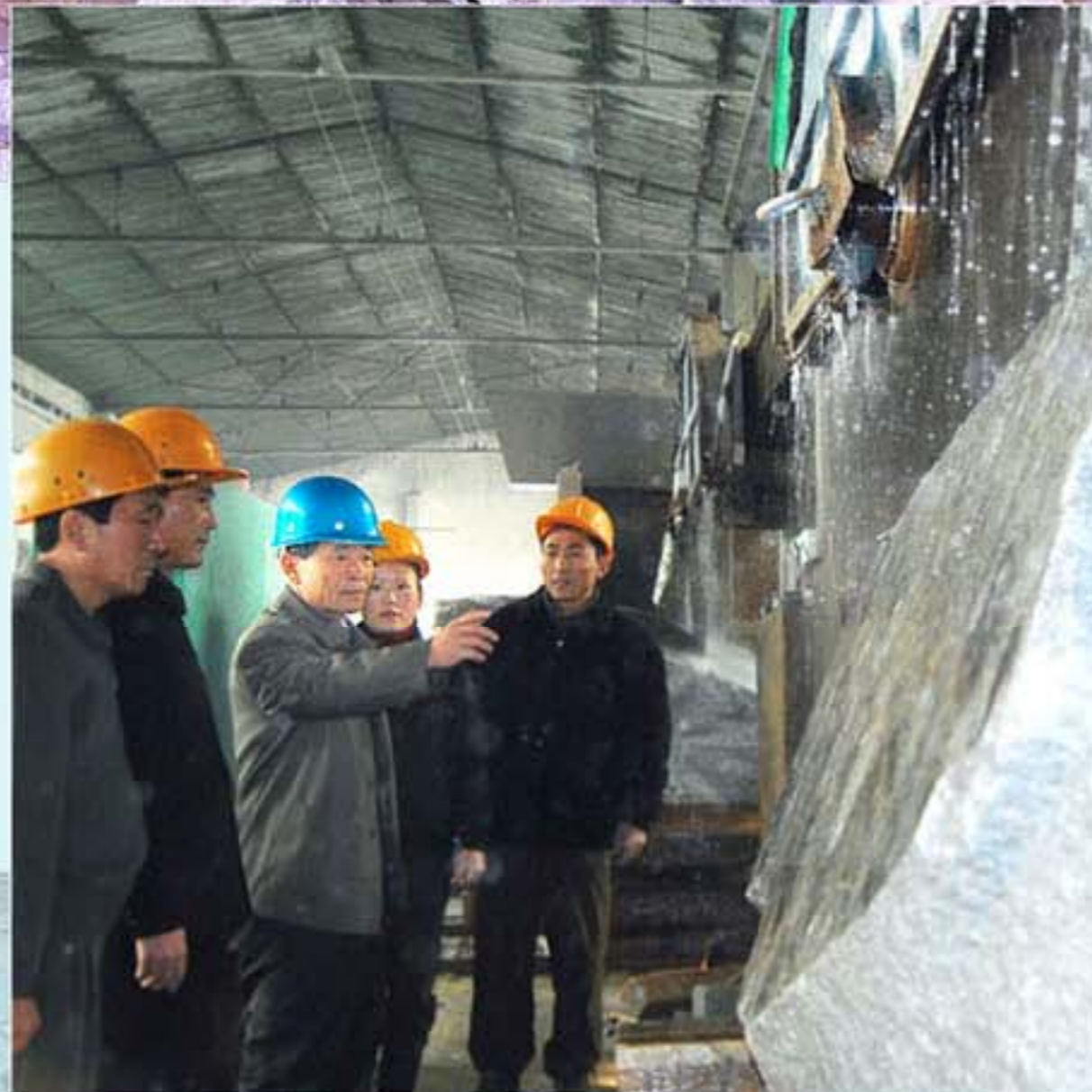
He is always with workers