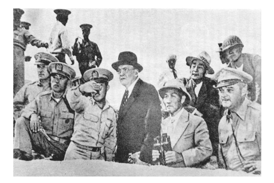
Dulles making final examination of the plan of invasion of the northern half of the Republic in a trench along the 38^{th} parallel (June 18, 1950)