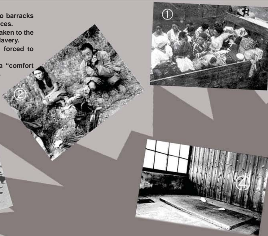
④ An interior of a room of a "comfort station" for the Japanese army.