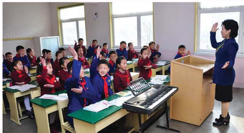
A lesson is given to suit the students' mental quality.