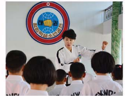
In the training hall.