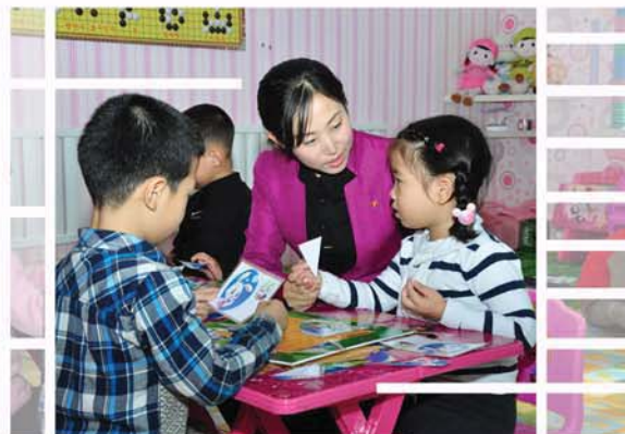
At a picture puzzle lesson.

Situated in the middle of a residential district, it looked as fine as ever.