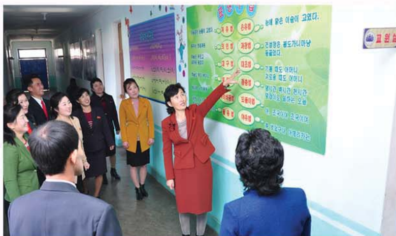
Efforts are put in to improve educational environments and teaching methods.