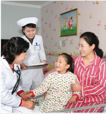
Front Cover: At the Okryu Children's Hospital in Pyongyang