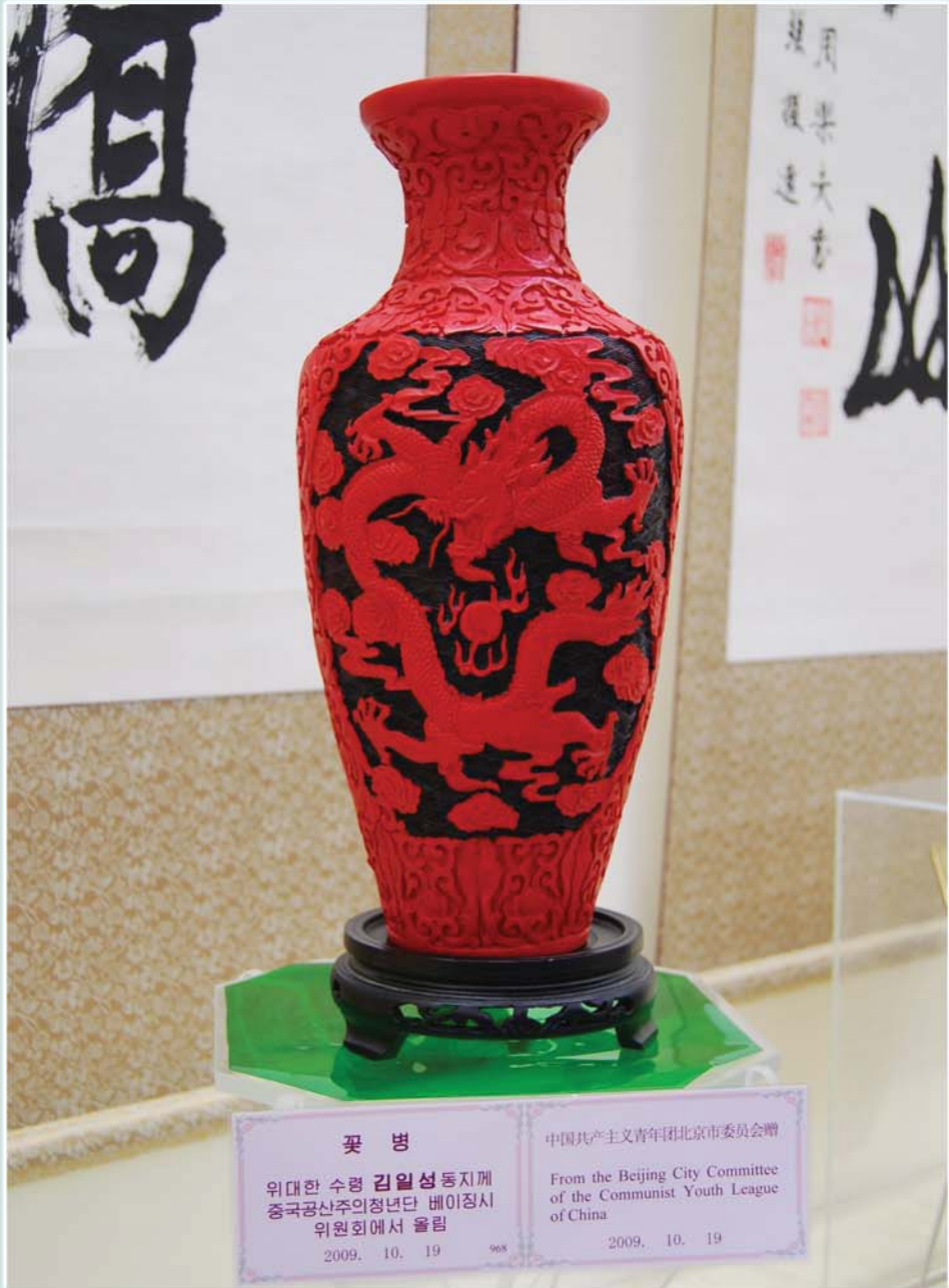
꽃 병 위대한 수령 김일성 동지께 중국공산주의청년단 베이징시 위원회에서 올림 2009. 10. 19 908 中国共产主义青年团北京市委员会赠 From the Beijing City Committee of the Communist Youth League of China 2009. 10. 19

A gift presented to President Kim Il Sung by the Beijing City Committee of the Communist Youth League of China in October 2009