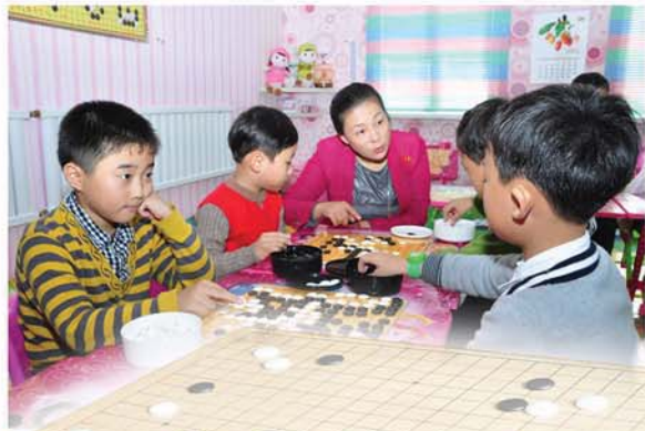
At a paduk lesson.