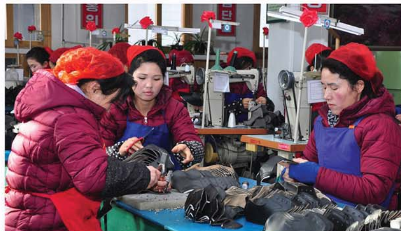
The uppers making process.

The factory thus created over 200 kinds of various shoe patterns and completed their