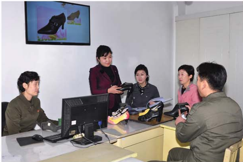
A new product goes through collective review.

RECENTLY, THE SHOES from the Pyongyang Leather Shoes Factory are popular with the people.