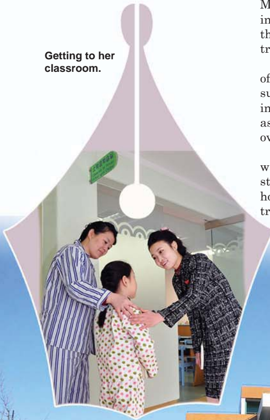
Getting to her classroom.