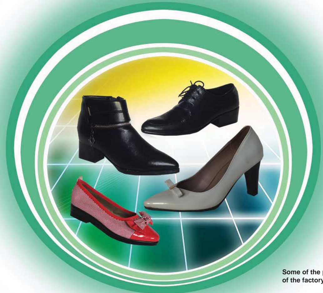
Some of the products of the factory.