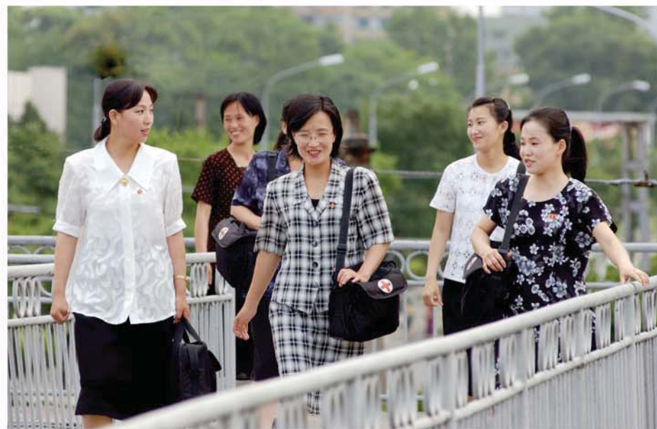
Section doctors visit the residents they are in charge of.