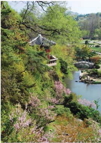
Back Cover: Moran Hill in spring