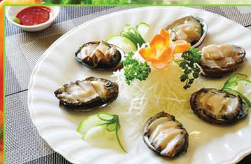
Dishes of the restaurant.