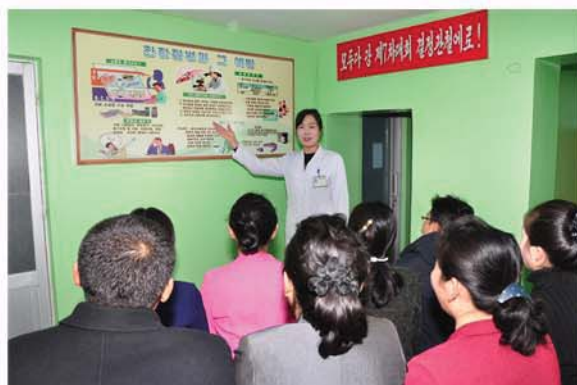
Doctors give publicity to information about hygiene while giving medical treatment.