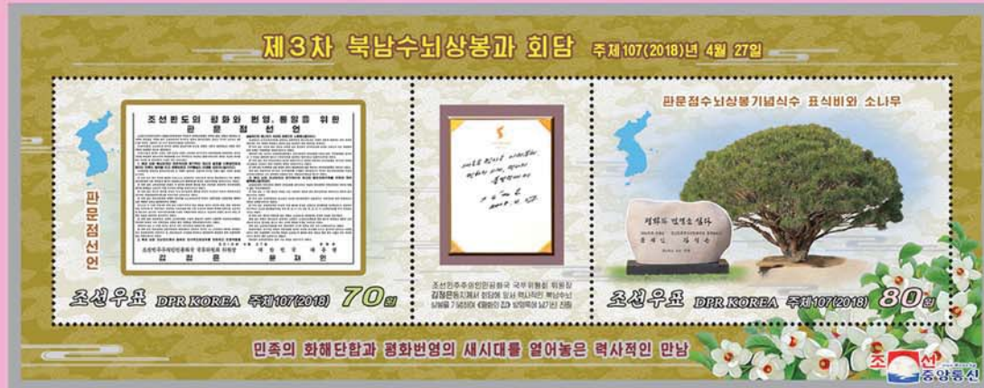
Stamps published in commemoration of the historic inter-Korean summit meetings and talks held last year.

► exchanges were expanded and developed in an all-round way so that national reconciliation and unity could be consolidated. And in January this year the DPRK put forward a new proposal whereby all the fellow countrymen can practically benefit from improved north-south relations. It expressed its willingness to resume the Kaesong Industrial Park and Mt Kumgang tourism without any precondition and in return for nothing, in consideration of the hard conditions of businesspersons of the south side who had advanced into the Kaesong Industrial Park and the desire of southern compatriots who are eager to visit the nation's celebrated mountain. This is of significance in making greater strides in the efforts to boost inter-Korean relations, achieve peace and prosperity and reunify the country.