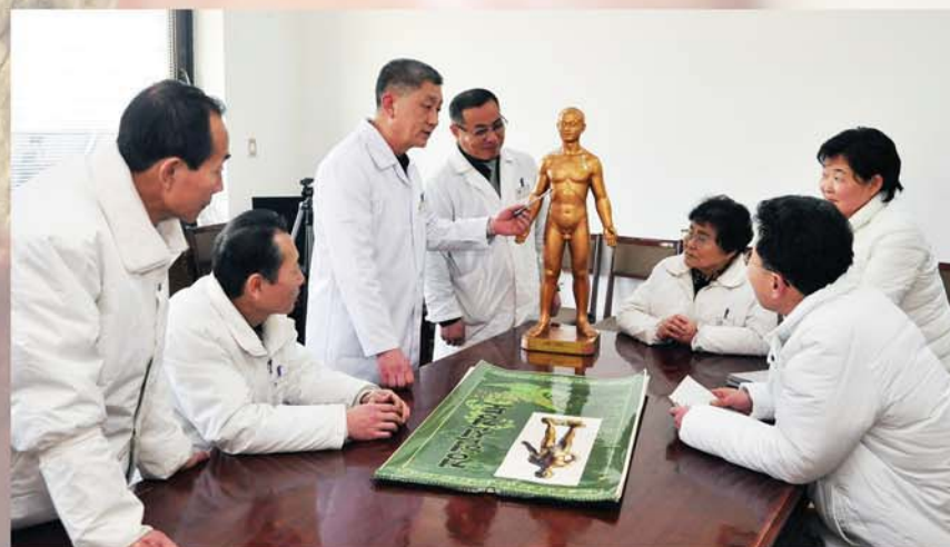
Doctors exchange experience in acupuncture and moxibustion.

► country. Hundreds of competent experts including many holders of academic degrees or titles are conducting Koryo medicine research there.