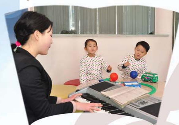
Senior middle school and primary school students, and preschoolers have a lesson in their study rooms.