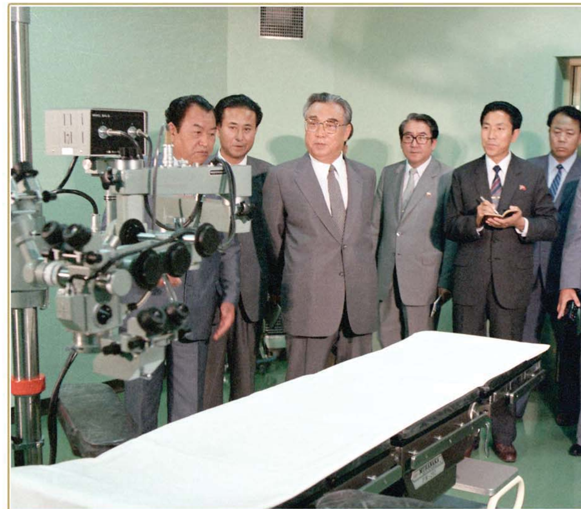
President Kim Il Sung inspects Kim Man Yu Hospital in June 1986.

It newly arranged a hydrazine production process which relied on imported materials no longer, and introduced 80 items of valuable technical innovations. It also made and repaired by itself ▶