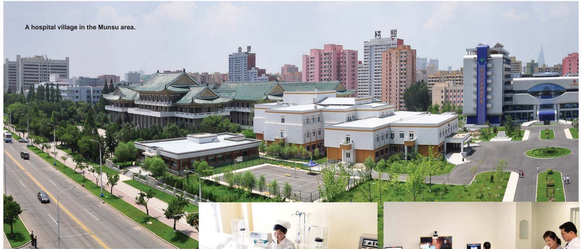
A hospital village in the Munsu area.

And medical workers are making achievements