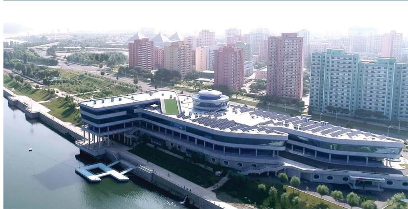
The restaurant is situated on the picturesque Taedong River.