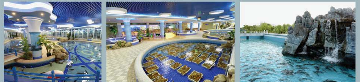
Indoor ponds teeming with sturgeon, Ryongjong fish, salmon, rainbow-trout and other delicious fishes, shellfish and turtles, and an angling site.