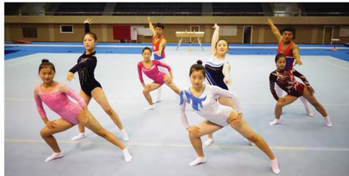
A scene of rhythmic exercises for athletics and a scene of rhythmic exercises for heavy gymnastics.