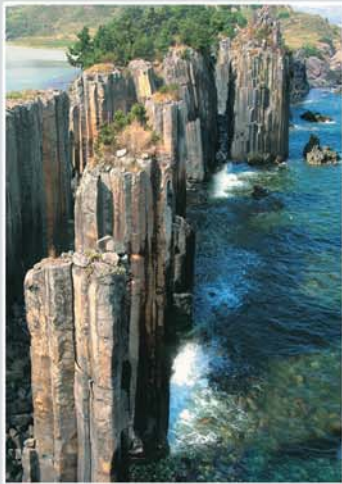
Back Cover: Chongsokjong in Mt Kumgang