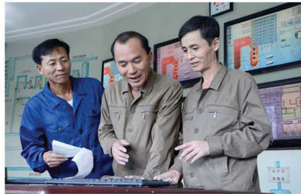
Researchers solve problems arising in practice.

In the course of intensifying the research to solve scientific and technical problems in their individual projects the researchers scientifically proved through a pilot examination that there is no need