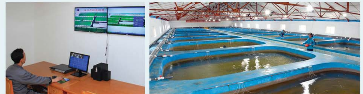
The integrated production control room and the indoor medium-sized fry growing pond of the Rason Breeding Salmon Farm.