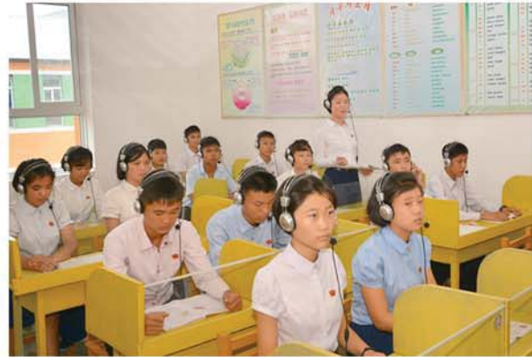
At the foreign language laboratory.