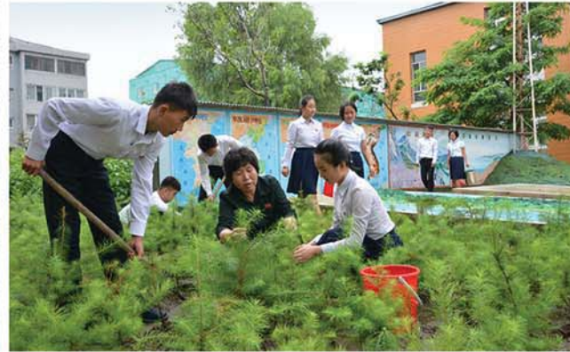
Students develop patriotism tending saplings.