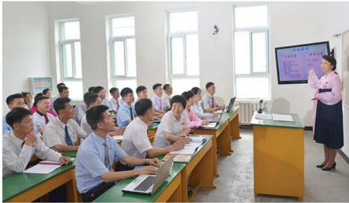
Demonstration classes are held regularly.