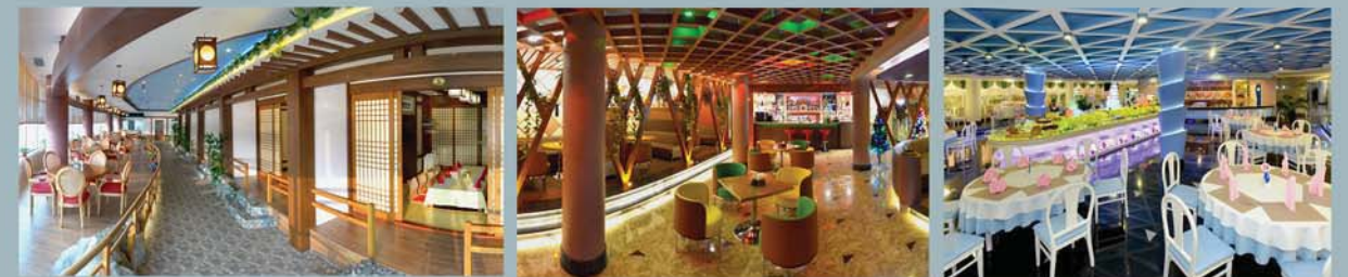
Rooms serving traditional dishes, sushi and the like.