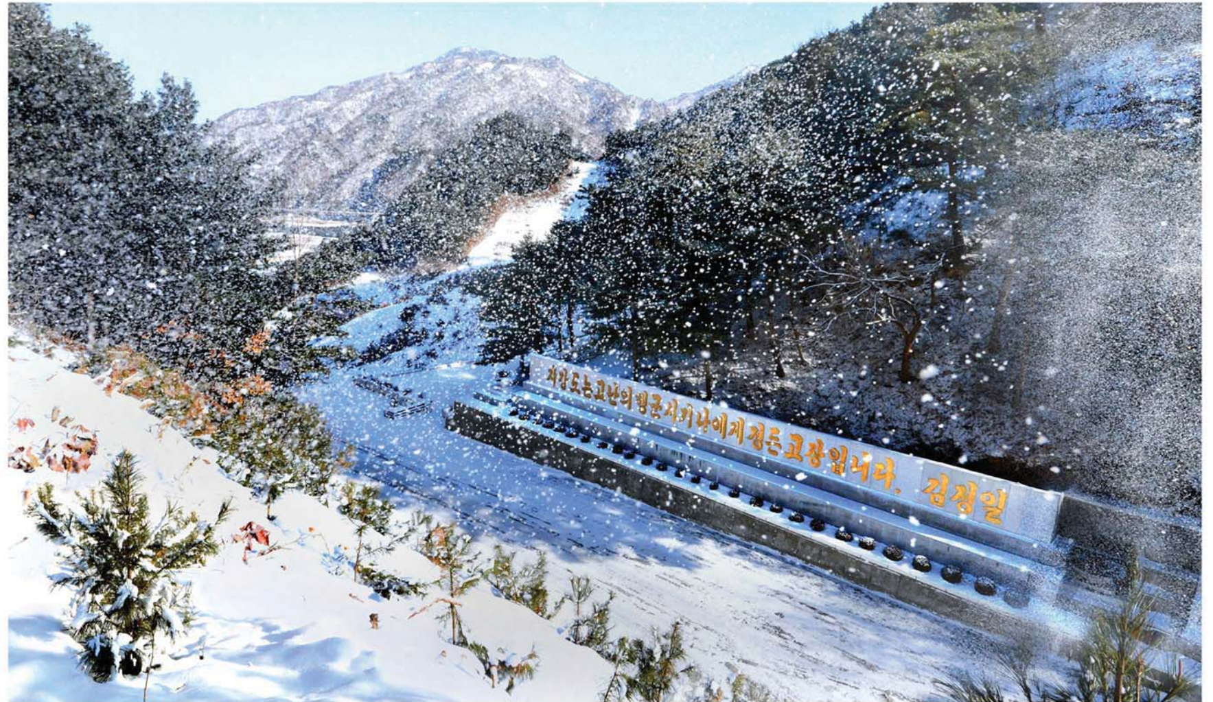
An unforgettable blizzard-swept road in Jagang Province.

Everywhere he visited he encouraged them to give full play