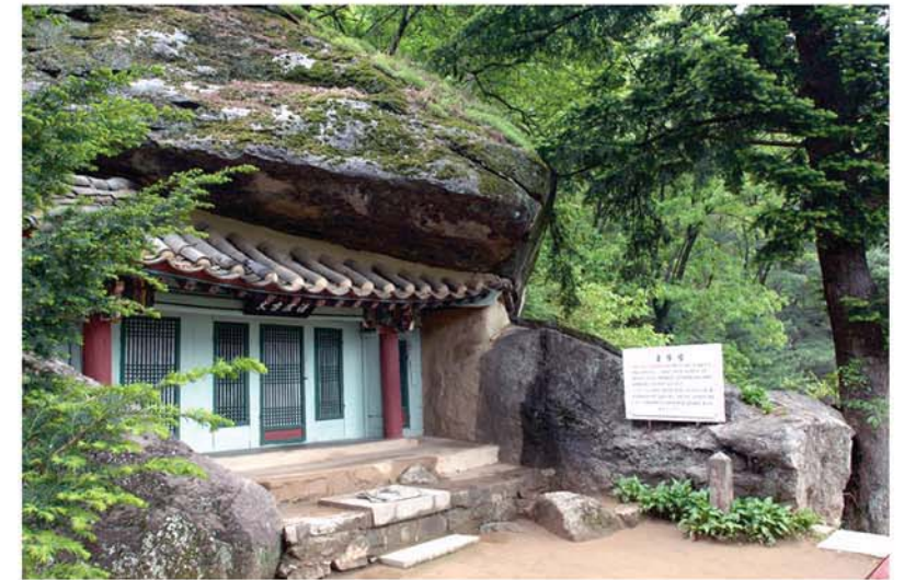
The Kumgang Hermitage.

When you go round the Ryonggak Rock beside the Sangwon Hermitage, you can see a building named Chuksong Hermitage. It was built in 1875 by the corrupt rulers of the feudal Joseon dynasty for the purpose of wishing the king good health. An 8.83 metre-long girder lies across the front floor without pillars. So when