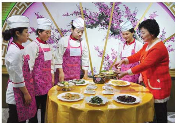
A scene of a dish exhibition.

The popularity of the restaurant is partly attributable to the tastes and quality of its dishes. In the past the restaurant served a noodle made with corn and elm bark powder which is helpful for protect-