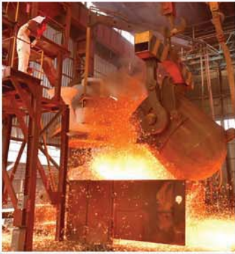
Front Cover: The iron and steel production is increasing at the Hwanghae Iron and Steel Complex after the completion of a Juche-orientation project.