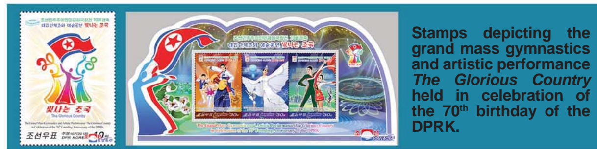
Stamps depicting the grand mass gymnastics and artistic performance The Glorious Country held in celebration of the 70 th birthday of the DPRK.