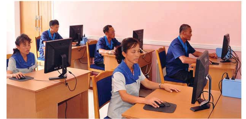
At the sci-tech learning space.