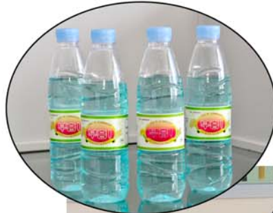
The researchers who have made highly-enriched PK compound nutrient solution.