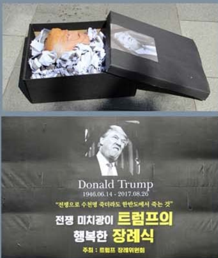
The happy “funeral” of warmaniac Trump held in front of the US embassy in Seoul, south Korea, in August 2017.