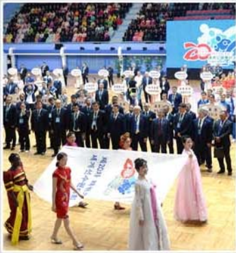
Front Cover: The 20 th Taekwon-Do World Championship takes place splendidly in Pyongyang in September 2017.