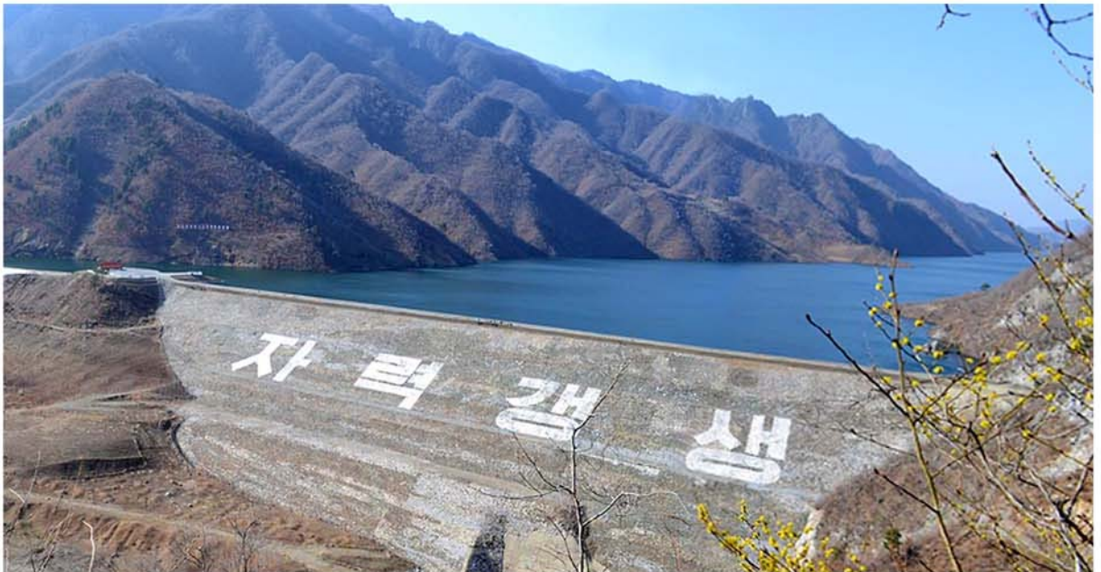
The Wonsan Army-People Power Station built on the strength of the spirit of self-reliance and self-development.

I N KANGWON PROVINCE THERE IS A POWER station the local people call Wonsan Army-People Power Station with pride. It was completed last year.