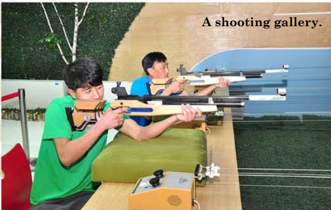
A shooting gallery.