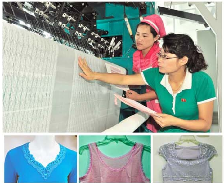
Varieties of laces are made.