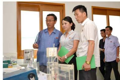
The administrators and teachers endeavour to study and introduce new teaching methods.