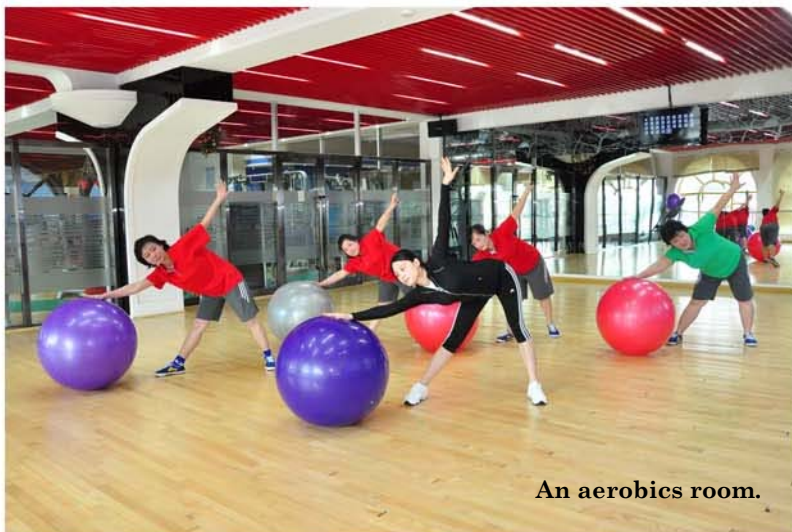
An aerobics room.