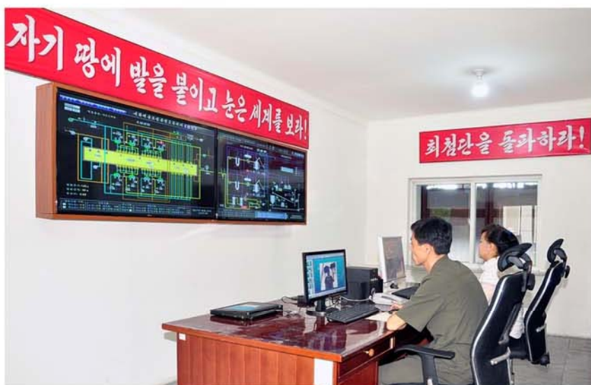
The control room for anthracite gasification and high-temperature air combustion calcination processes.

This, however, required many scientific and technical problems to be solved. Above all, they had to build a process for production of coal briquettes. What mattered was to solve the problem of the relevant bonding agent. There