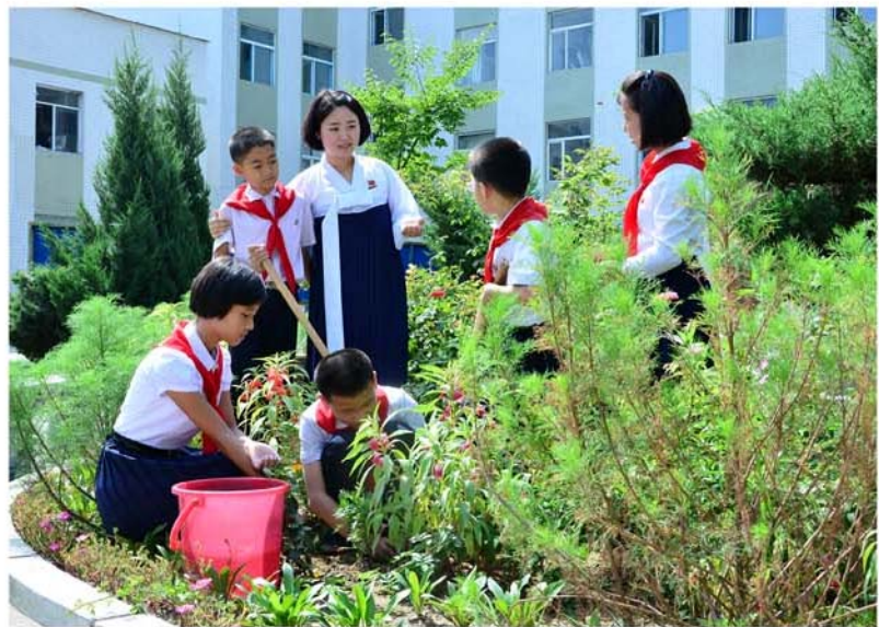
Practice in education.

senior middle schools. We have only made efforts to become models for the future teachers."