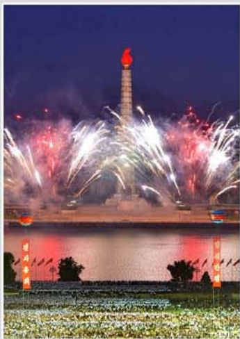
Back Cover: Service personnel and Pyongyang citizens jointly celebrate the complete success in the ICBM-ready H-bomb test.