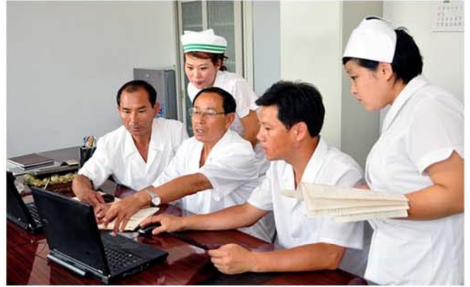
A consultative meeting to save a critical case.

E ARLY IN MAY LAST AN emergency case was rushed to Chollima District People's Hospital in Nampho City.