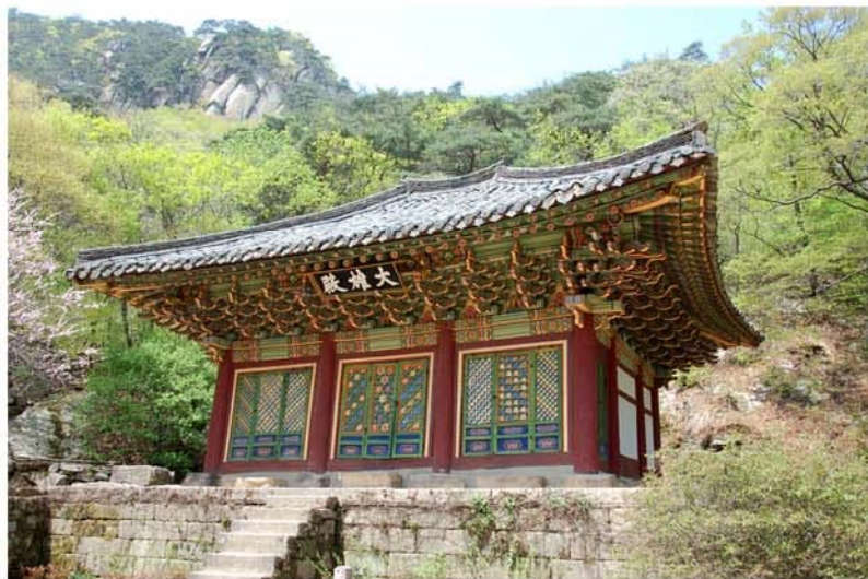
The Taeung Hall at the Kwanum Temple.

The observatory testifies to Koryo's high astro- ▶