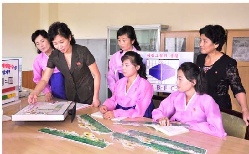
A discussion on education and visual aids.

ing a teaching aid, titled, Be a Well-mannered Pupil . There was a repeated discussion on representing the aid manners in the bus, over the phone, and between friends as suited to children's mentality. They decided to represent these scenes in cuts like a film. As those which pupils learn were portrayed in different styles and methods on the corridor and stair walls, pupils were attracted