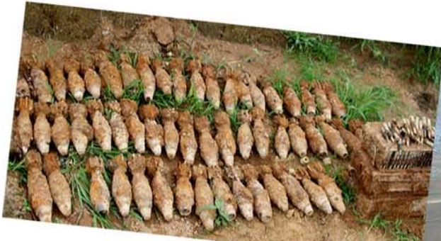
Some of the cleared US-made explosives.