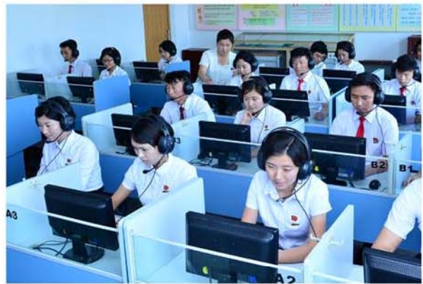
A foreign language lecture.