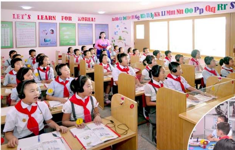
The cognitive faculty of the pupils is rising thanks to the radically improved educational environment.