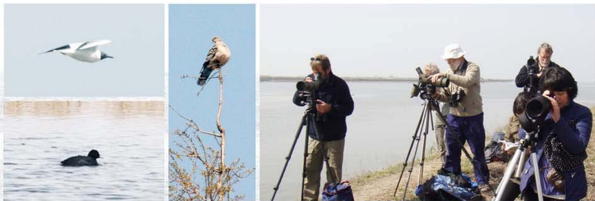
A joint survey of migratory birds is made.