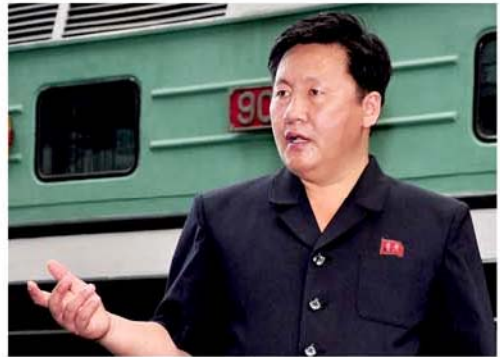
Jo Nam Il.

The Americans have conceived plans for “beheading operation” and “internal harassing operation” for the purpose of making a “conquest” of Pyongyang—that we