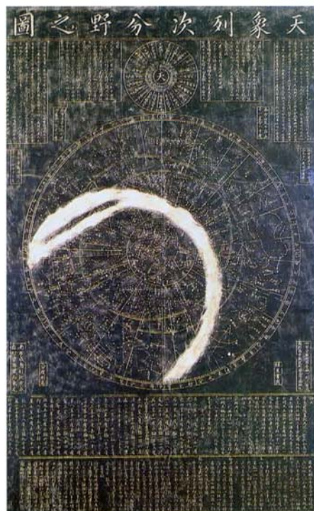
The astronomical chart Chonsangryolchabunyajido .

Medicine of Koguryo, too, was on a high level. Acupuncture and