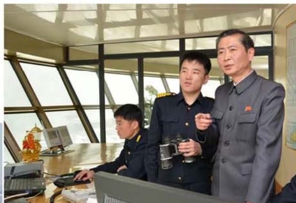
The West Sea Barrage.

In the course of this, they integrated a transmitting system including the mode of information communication and exchange, and improved the power control function of all relevant devices, thus ensuring reliability of data