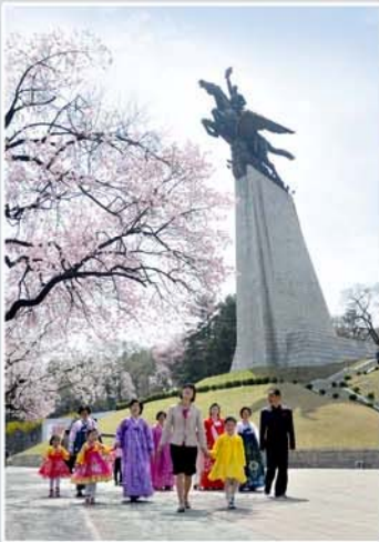
Back Cover: An April spring day