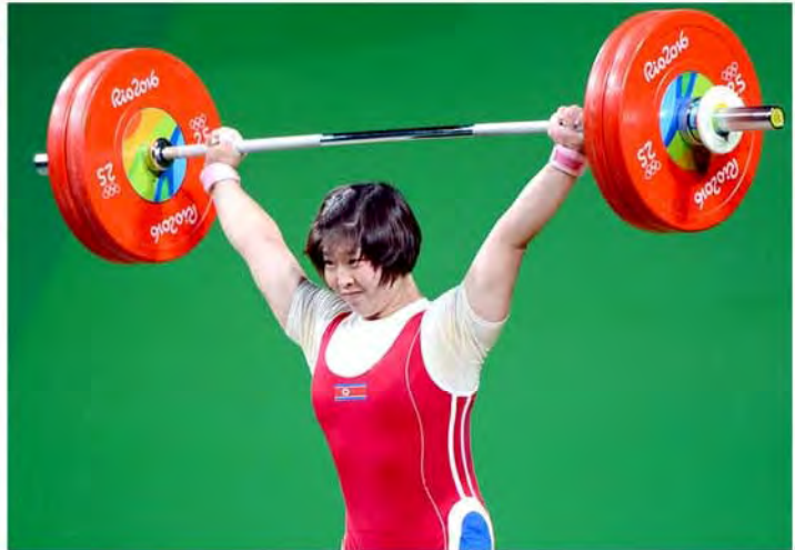
Ri Se Gwang and Rim Jong Sim won gold medals at the 31 st Olympic Games, and many other athletes brought honour to their country from international competitions.

▶ as young coal miners, young miners, young sub-workteam workers, young shock-brigade members and young scientists.