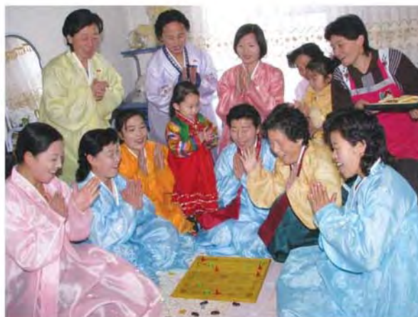
The yut game.