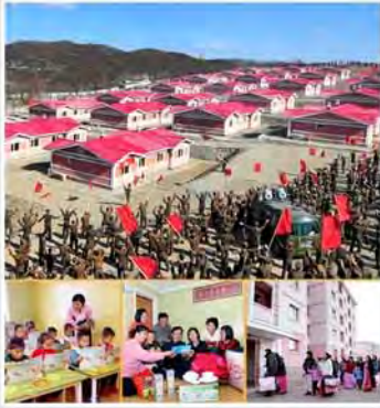
Front Cover: New houses in the flood-afflicted northern areas in North Hamgyong Province