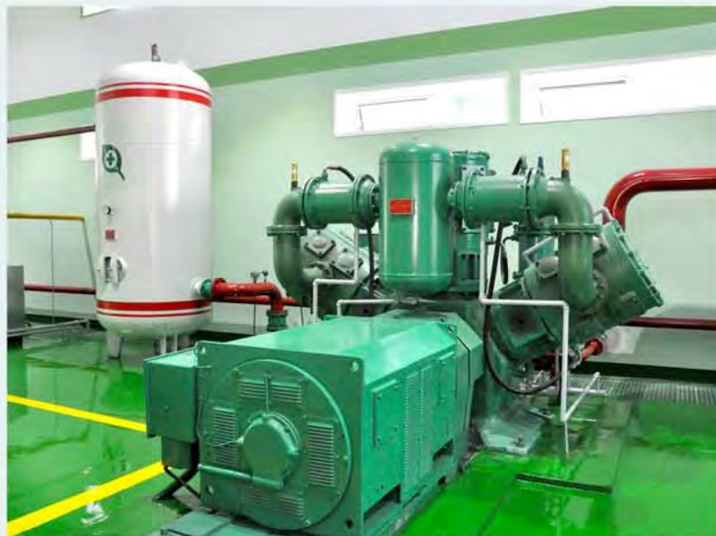
The oxygen separator.

S OME TIME AGO I VISITED the Medical Oxygen Factory located in the suburbs of Pyongyang for coverage. Arriving there, I could see a general view of the cosy, neat factory in a thick grove with fresh air.