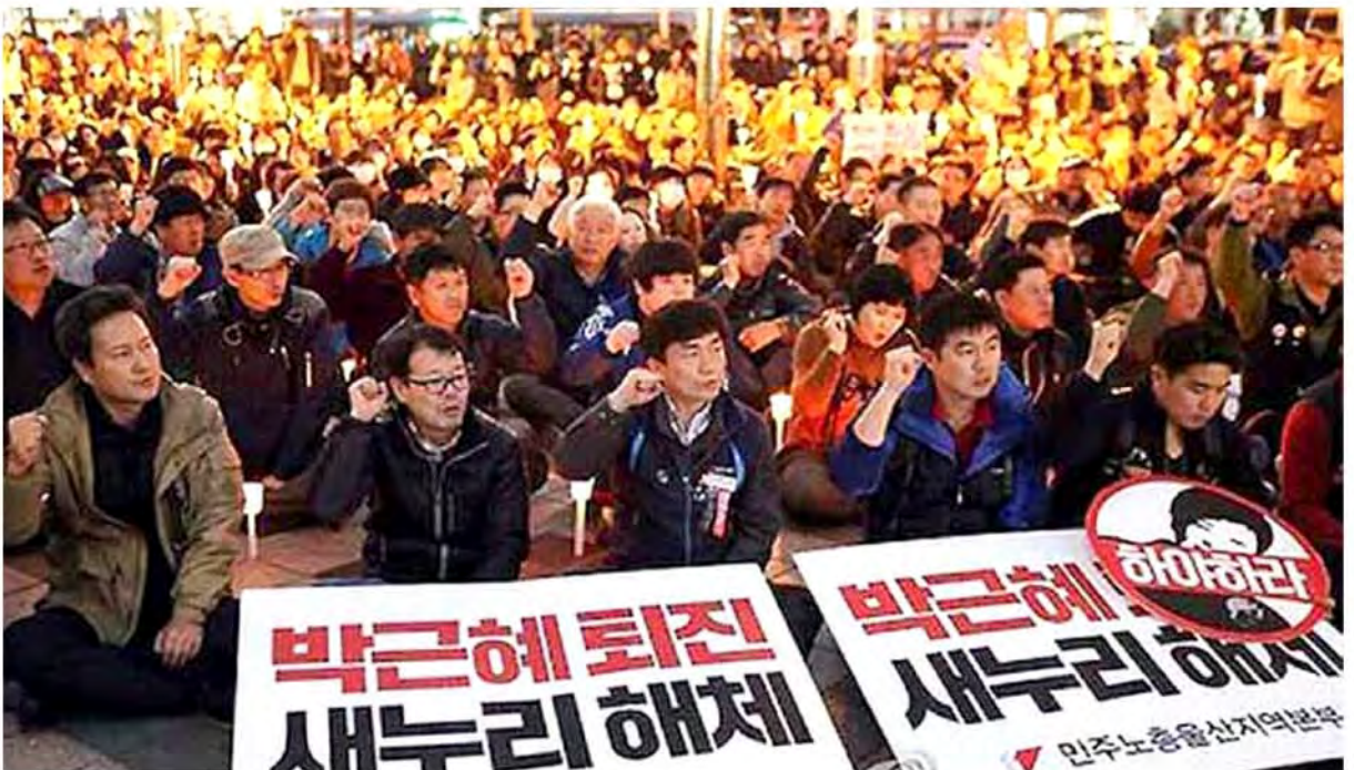
South Korean people wage a struggle against the Park Geun Hye regime.

That’s not all. Asserting the so-called “future-oriented relations” and “new era of cooperation,” Park conspired with Japan, the centuries-old sworn enemy of the Korean nation—it’s a crime. She propelled a mechanism of sharing military intelligence with Japan—which had been a failure of her predecessor’s policy due to the strong opposition of the people of all strata—in the insidious form of making a “promise on sharing intelligence.” She also gave a license to the Japanese “Self-Defense Force” to enter south Korea at will on the pretext of its munitions