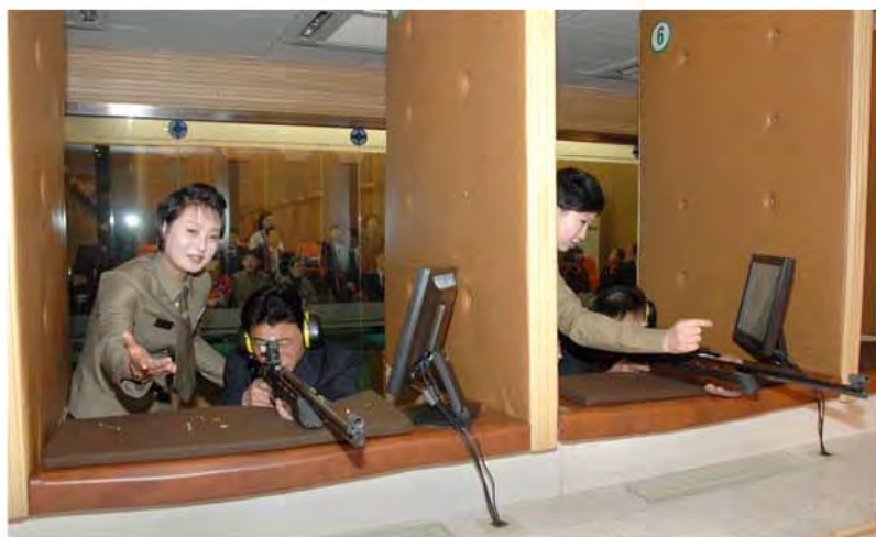
The rifle hall at the Meari Shooting Gallery.

Later, at the Fourth Conference of the WPK, a decision to have Kim Jong Il as the eternal General Secretary of the WPK and to glorify his revolutionary life and immortal revolutionary exploits was adopted amidst the enthusiastic acclamation of all the participants. ▶