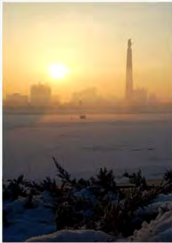
Back Cover: The Taedong River in the morning