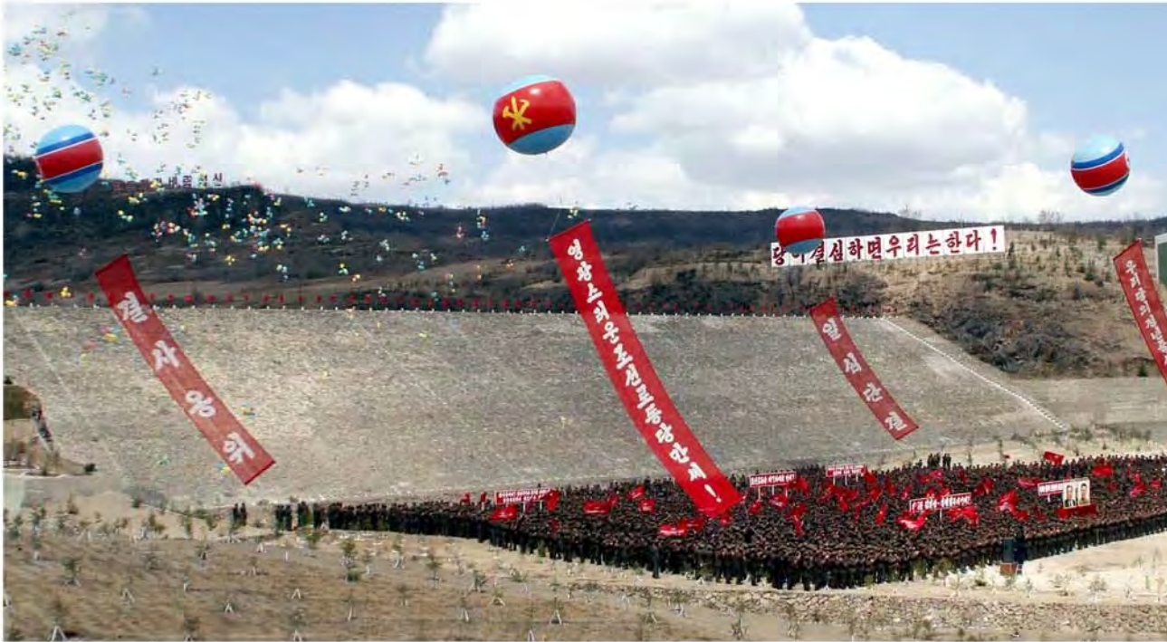
The inauguration ceremony of Paektusan Hero Youth Power Plant No. 3.