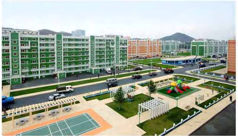
The Wisong Scientists Residential District.

Coming to the 25-m pistol shooting hall, Kim Jong Un suddenly asked the officials in his suite what was the basis on which