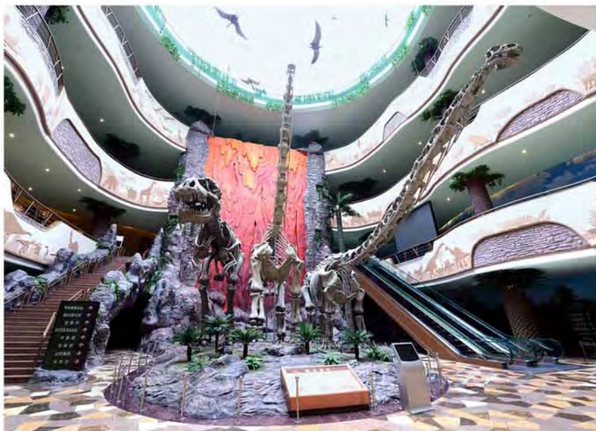
The Natural History Museum.

In addition, great achievements were attained in making the national economy Juche-oriented, modern, IT-based and scientific: The home production of a floating feed maker, the establishment of a Korean-style acrylic paints production process, the home production of spores for yogurt production at the microbiology institute of the State Academy of Sci-