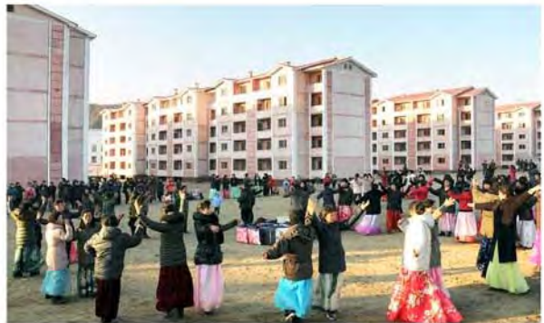
Flood victims move into new houses.

Arriving at their respective sites of assignment, People's Army soldiers and other builders immediately started the construction of houses before setting up their lodgings, and pushed ahead with the