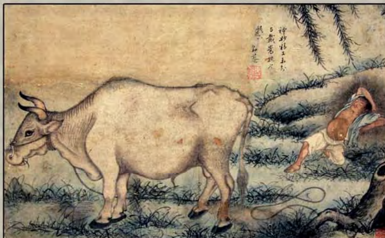
A Cowboy, an old picture created during the time of the feudal Joseon dynasty.

The Korean painting has a long history of development along with the nation's time-honoured history and left a lot of valuable legacies. Mural paintings in the tombs of Koguryo (277 BC-AD 668) are well known to the world as the cream of fine art of Korea in the early Middle Ages, and the paintings by Tam Jing (579-631) and Solgo (8 th century) give a good glimpse of the development of the Korean painting during the period of Three Kingdoms and its