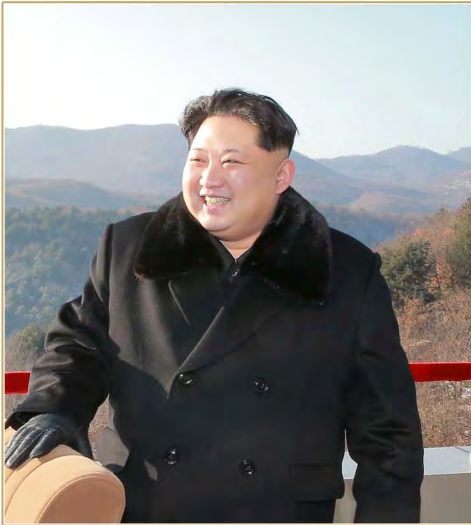
Supreme leader Kim Jong Un (February 2016).

A T PRESENT THE KOREAN PEOPLE ARE ushering in a golden age in building a thriving socialist nation. To build a socialist power was just an intention of President Kim Il Sung and Chairman Kim Jong Il and an unshakable will of supreme leader Kim Jong Un who is now leading the Koreans wisely. The Korean people are recollecting their exploits with deep emotion.