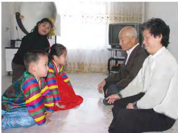
The New Year greeting.

L UNAR NEW YEAR'S DAY IS A FOLK festival which the Korean people celebrated from of old. This custom goes back to the time of such ancient Korean states as Ancient Joseon through Koguryo, Koryo and feudal Joseon dynasty.