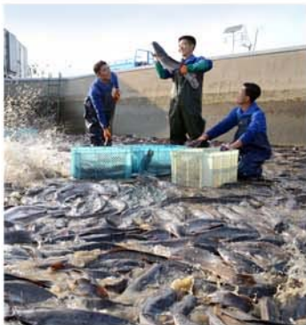
Front Cover: Big Haul of Catfish