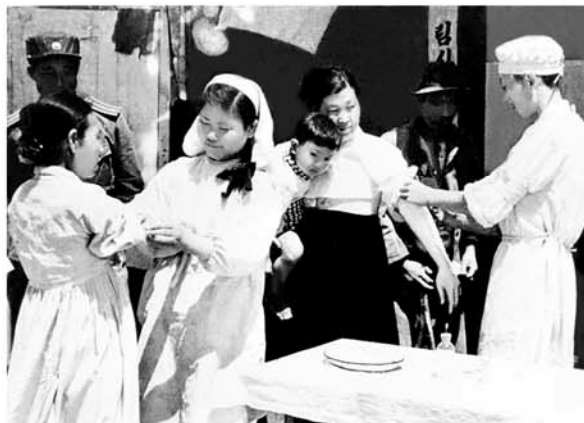
Free medical care system was introduced during the wartime.

Since then the health of the working people and children has been under better protection by the benefit of the free medical service. The right to free medical care is surely given in the DPRK Socialist Constitution and the Public Health Law. Medical care establishments and doctors are to be seen wherever there are working people, and the section