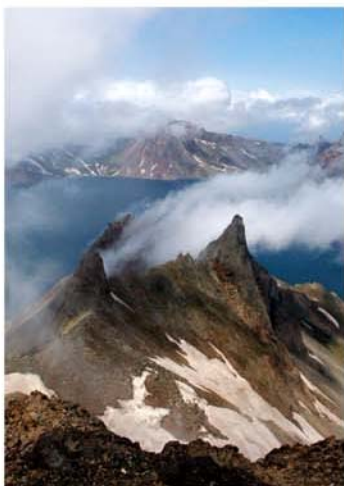
Back Cover: Piru Peak in Mt. Paektu