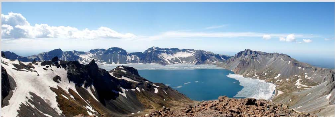
Lake Chon in Mt. Paektu.

The Great Paektu Mountains, which runs from Mt. Paektu to Mt. Halla in Jeju Island, is the main mountain range of the country. As Mt. Paektu is the starting point of the Korean topography and the