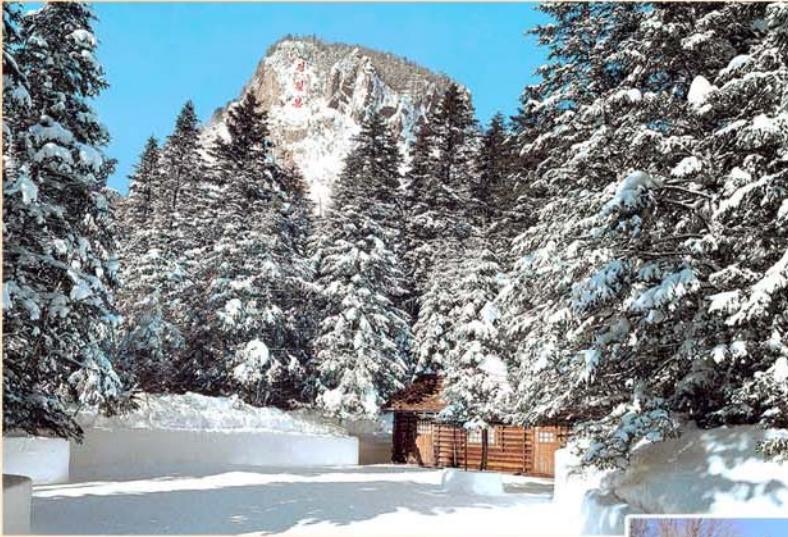
The birthplace of Chairman Kim Jong Il in the Paektusan Secret Camp, and the people on a study tour to the birthplace.