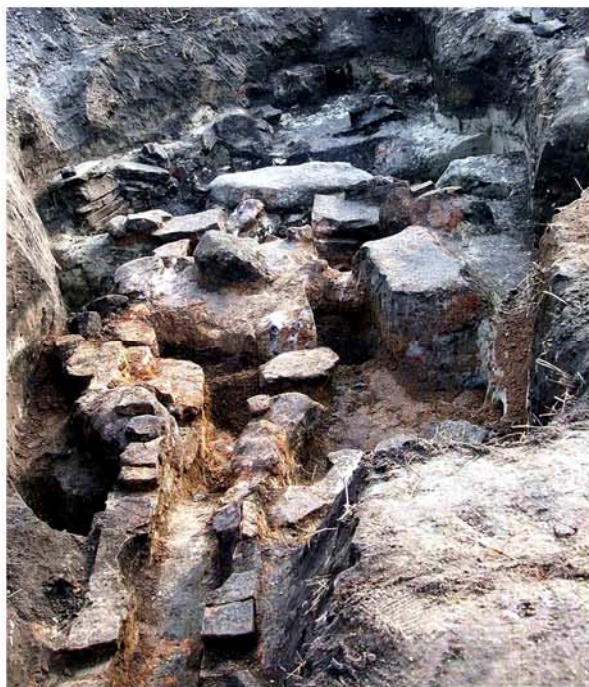
A site of salt manufacture during the time of Koguryo.