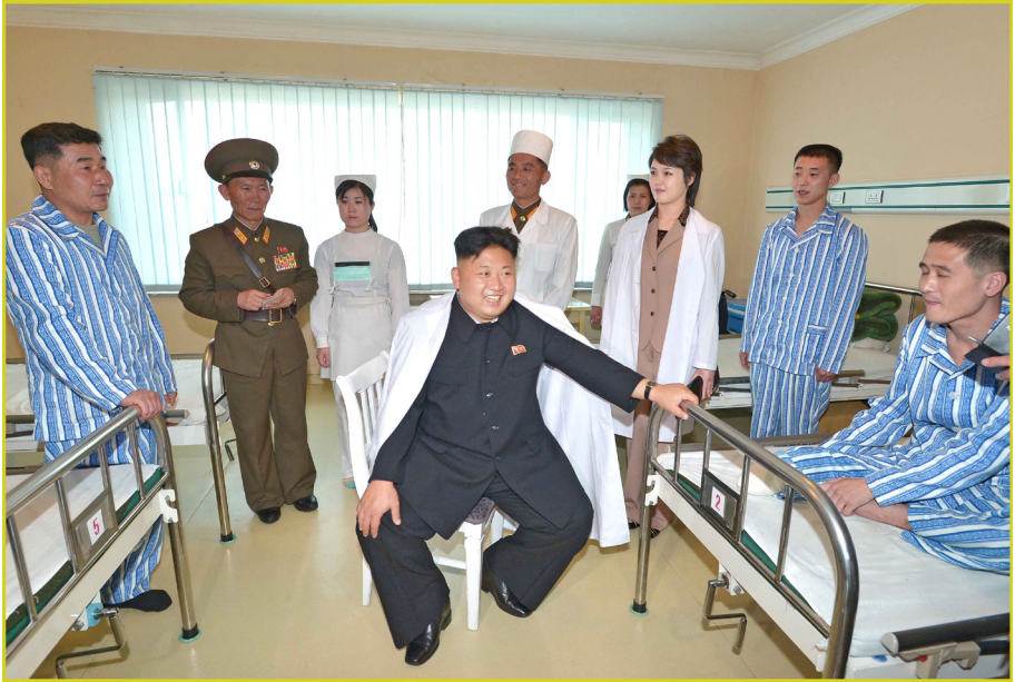
Kim Jong Un talking with the soldiers who got injured during combat drill