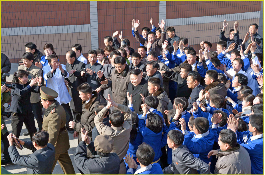
Kim Jong Un visiting the then Pyongyang Municipal Mushroom Farm