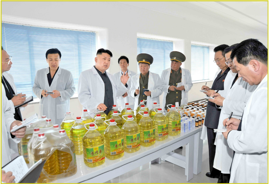
Kim Jong Un visiting the Pyongyang Condiments Factory