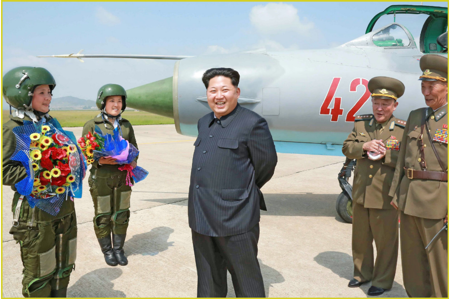
Kim Jong Un meeting women pilots of supersonic fighter jets