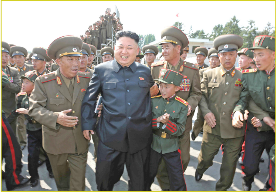
Kim Jong Un visiting Mangyongdae Revolutionary School in celebration of the 68 th founding anniversary of the Korean Children's Union