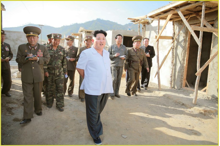
Kim Jong Un giving guidance on the spot over the rehabilitation project of the city of Rason