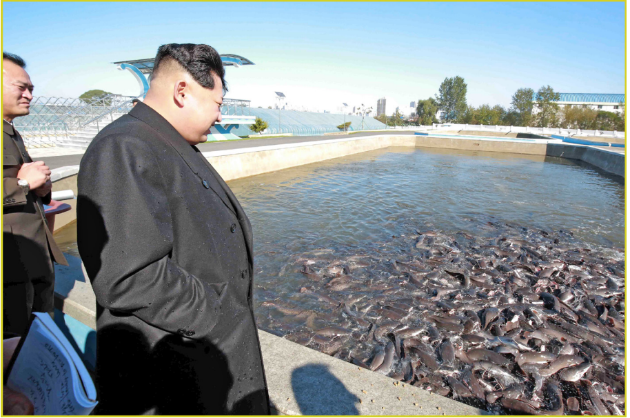
Kim Jong Un visiting the Pyongyang Catfish Farm