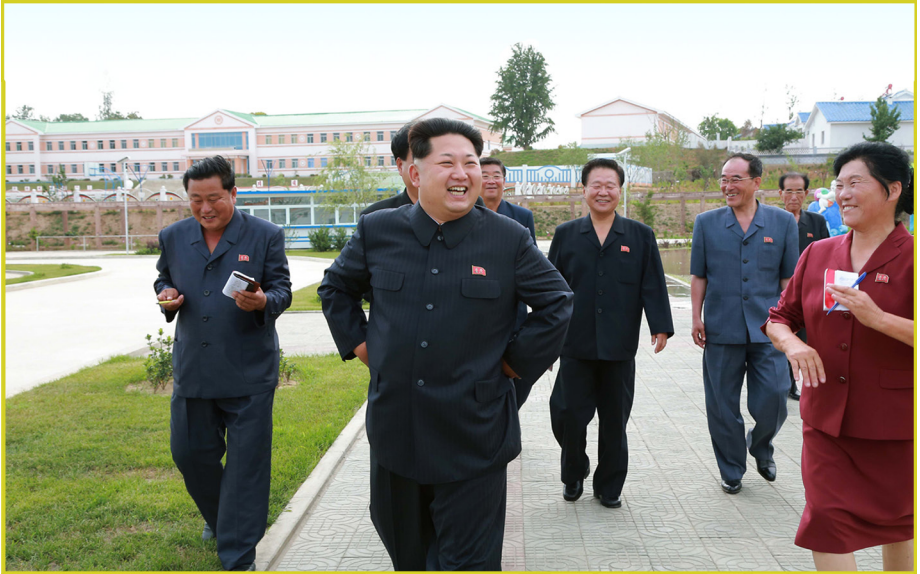
Kim Jong Un visiting the Jangchon Vegetable Cooperative Farm in Sadong District