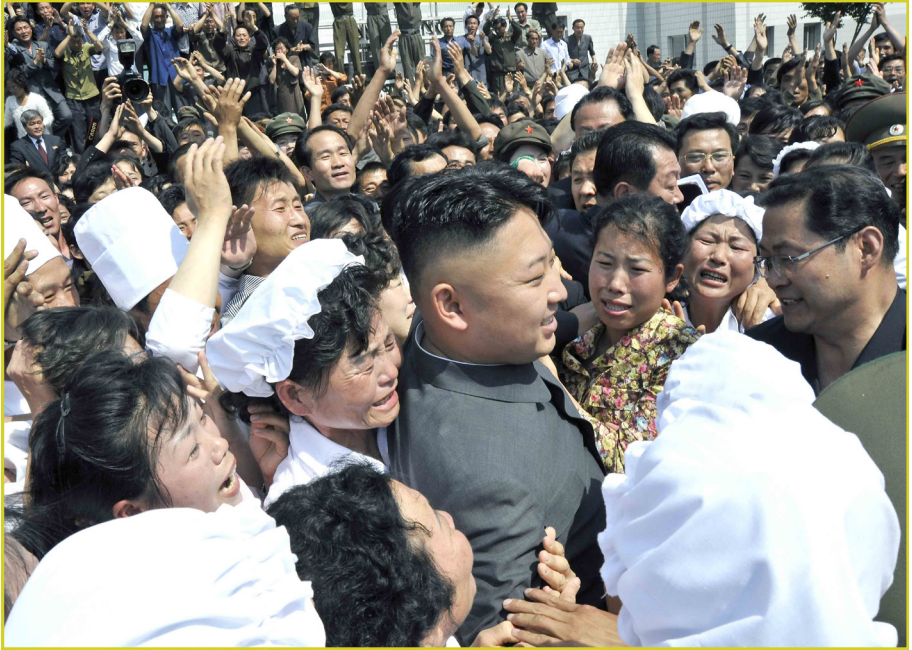
Kim Jong Un visiting the Pyongyang Condiments Factory