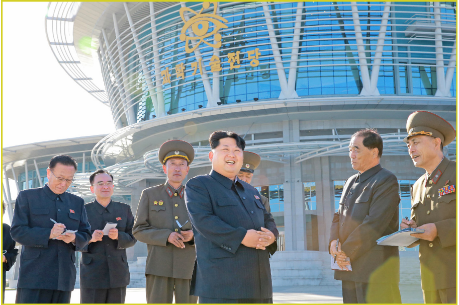
Kim Jong Un visiting the newly-completed Sci-Tech Complex