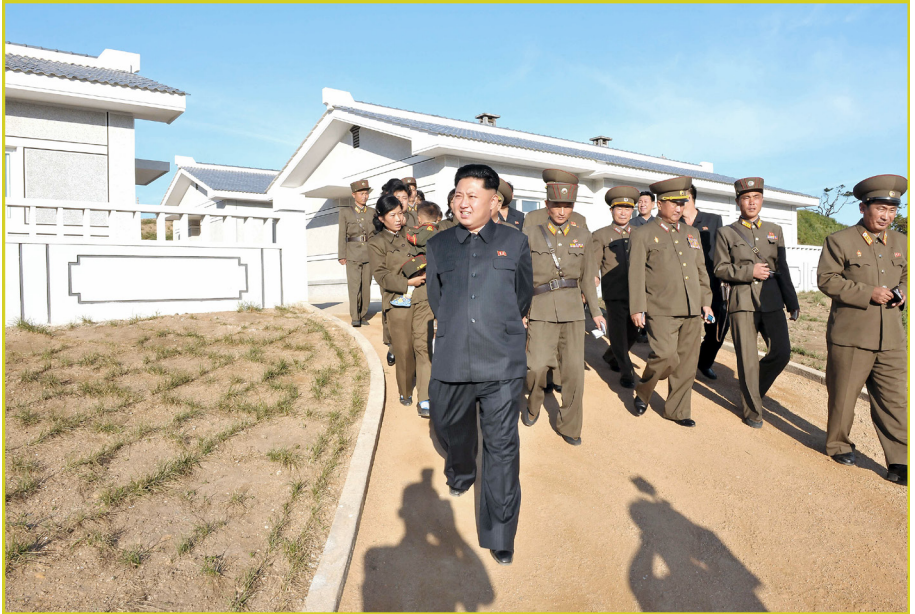
Kim Jong Un looking round the newly-built houses of the officers of Jangjae Island Defending Unit