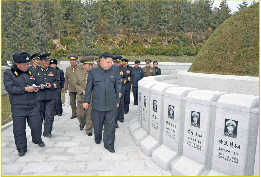
Kim Jong Un visiting the tomb of the sailors who fell in action