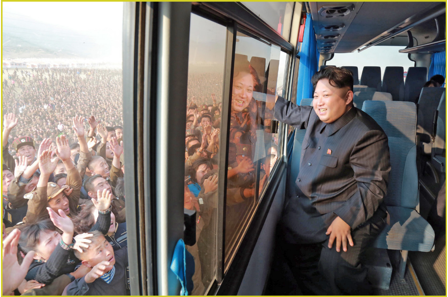
Kim Jong Un waving back to the cheering soldiers