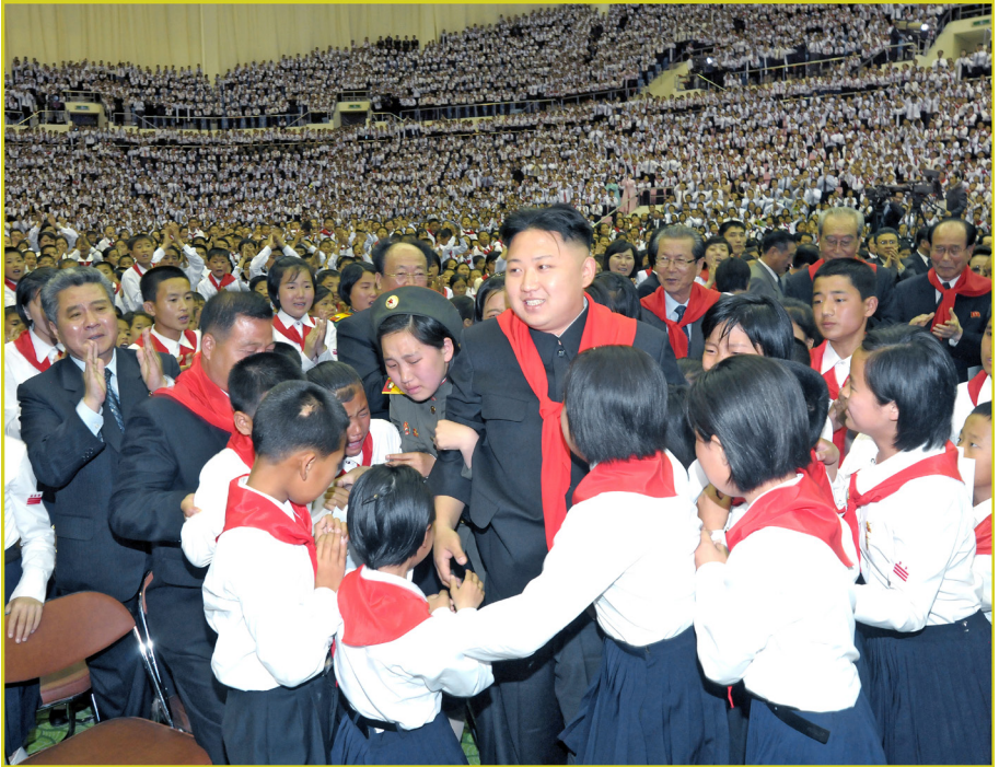
Kim Jong Un with the participants in the celebrations of the 66 th anniversary of the Korean Children's Union