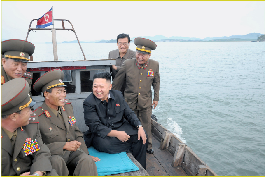
Kim Jong Un on his way to Jangjae and Mu islands