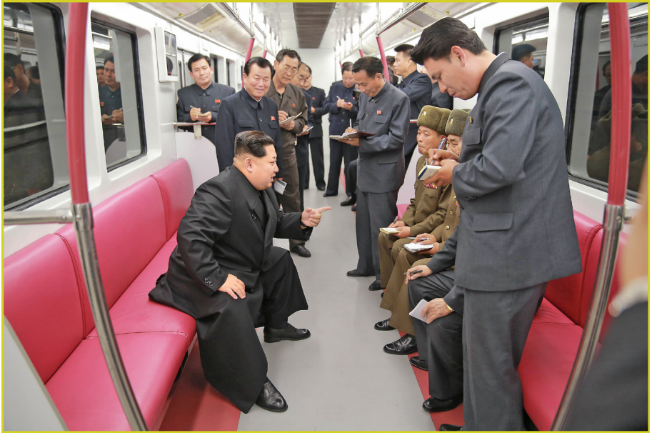
Kim Jong Un acquainting himself with the test-run of the home-made subway train