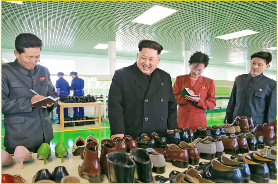
Kim Jong Un visiting the Wonsan Leather Shoes Factory