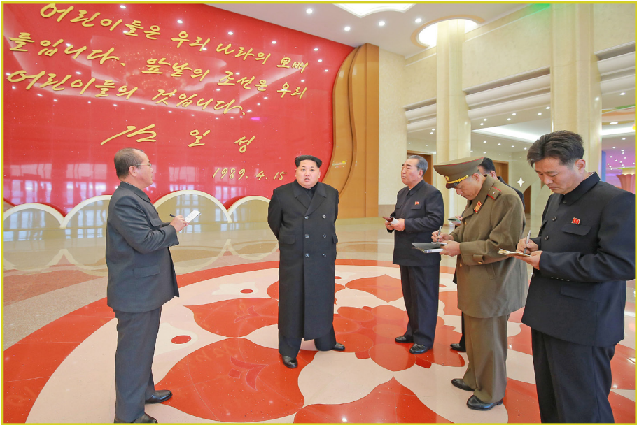
Kim Jong Un visiting the renovated Mangyongdae Schoolchildren's Palace