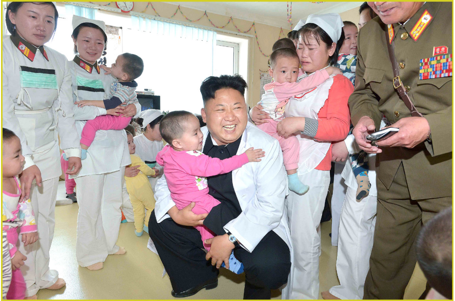
Kim Jong Un visiting the Taesongsan General Hospital