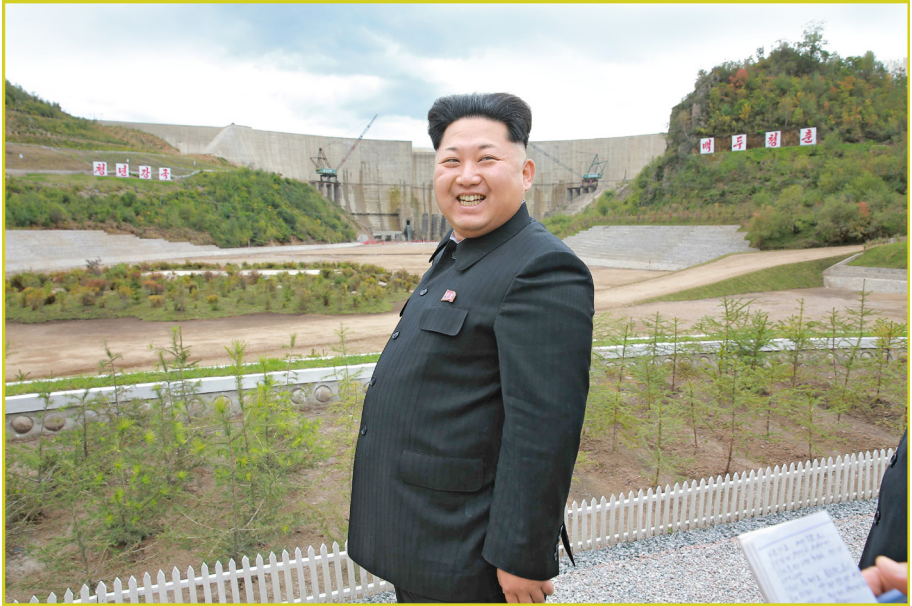
Kim Jong Un inspecting the construction site of the Paektusan Hero Youth Power Station