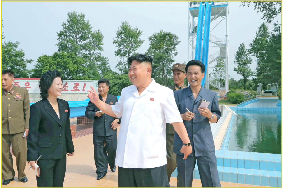
Kim Jong Un visiting the Songdowon International Children's Camp