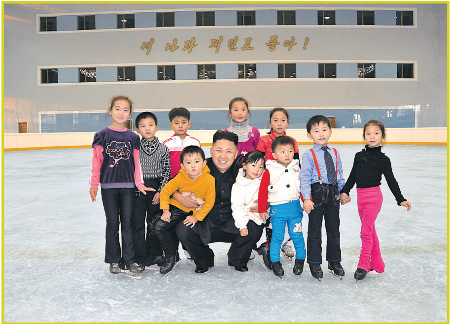
Kim Jong Un having a photo taken with children in the People's Open-air Ice Rink