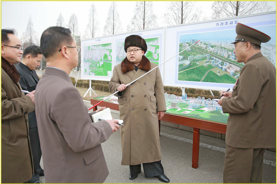
Kim Jong Un setting forth the important tasks in building Ryomyong Street after declaring the start of the construction project