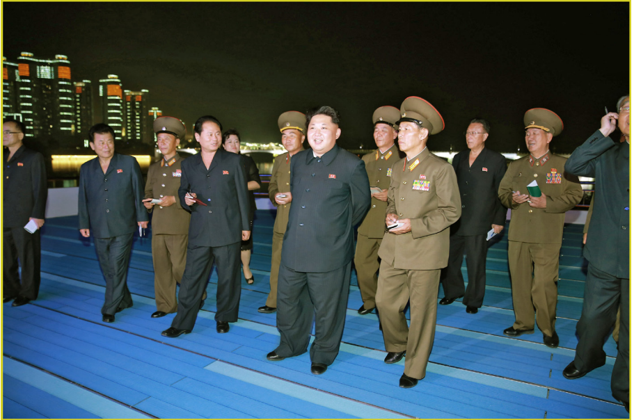
Kim Jong Un looking round the newly-built floating restaurant Mujigae