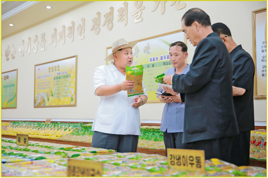
Kim Jong Un visiting Pyongyang Corn-Processing Factory