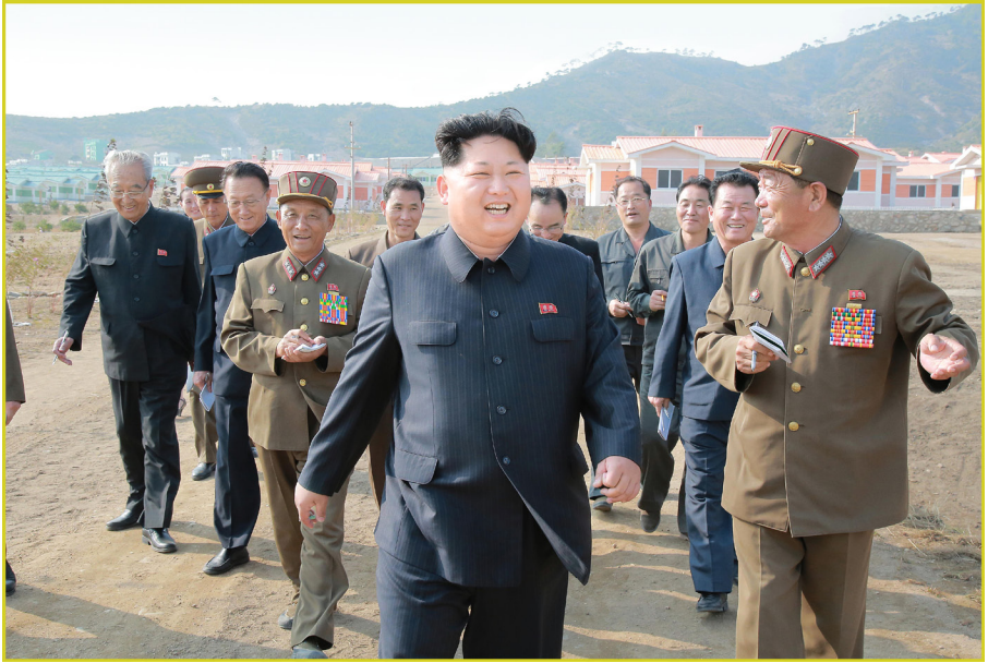
Kim Jong Un visiting the newly-built dwelling houses at the then Paekhak-dong, Sonbong district, Rason