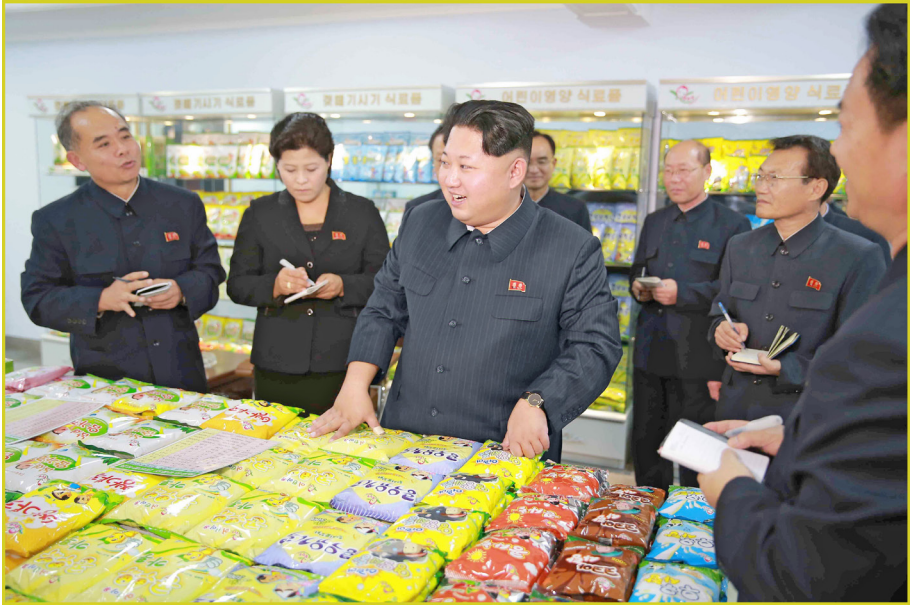
Kim Jong Un visiting the Pyongyang Children's Foodstuff Factory