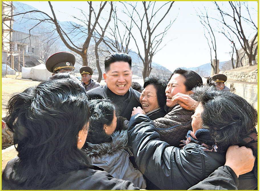
Kim Jong Un with the families of officers of Cho Island Defending Unit