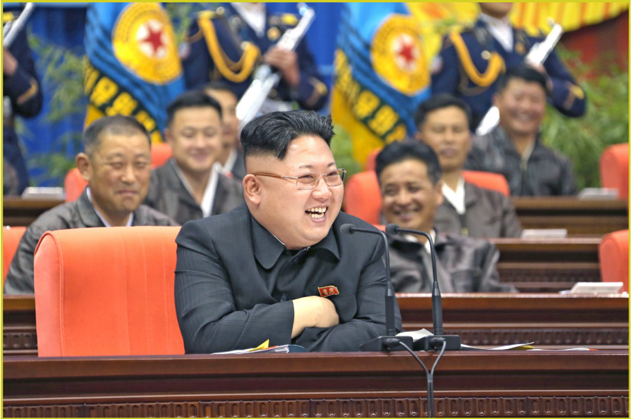
Kim Jong Un at the First Conference of Pilots of the Korean People's Army