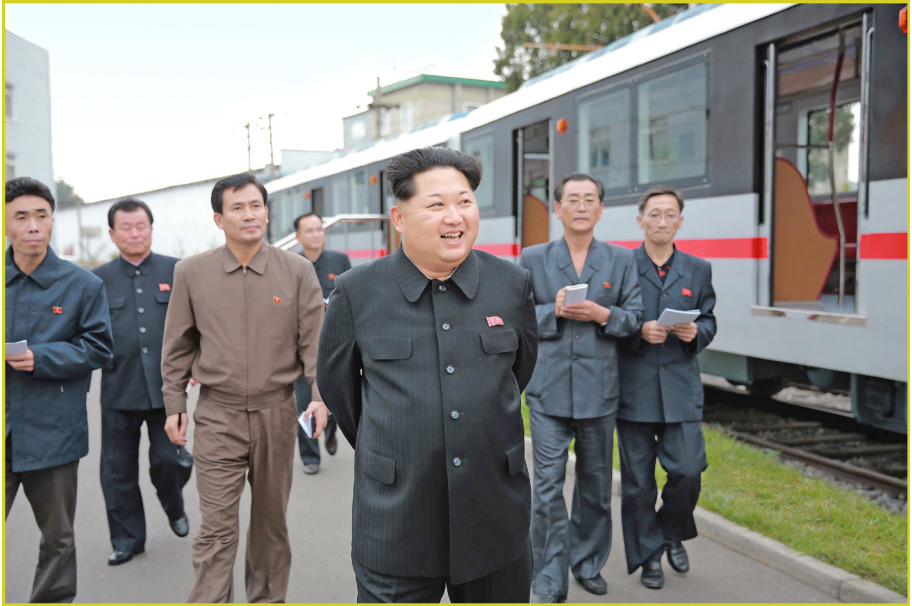
Kim Jong Un visiting Kim Jong Thae Electric Locomotive Complex