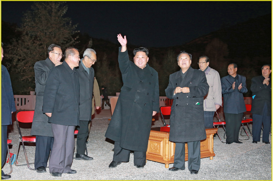
Kim Jong Un acknowledging the cheering young people at the completed Paektusan Hero Youth Power Station