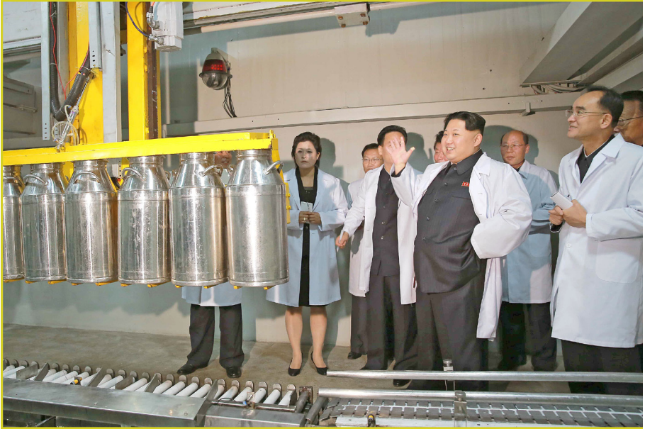
Kim Jong Un visiting the Pyongyang Children's Foodstuff Factory