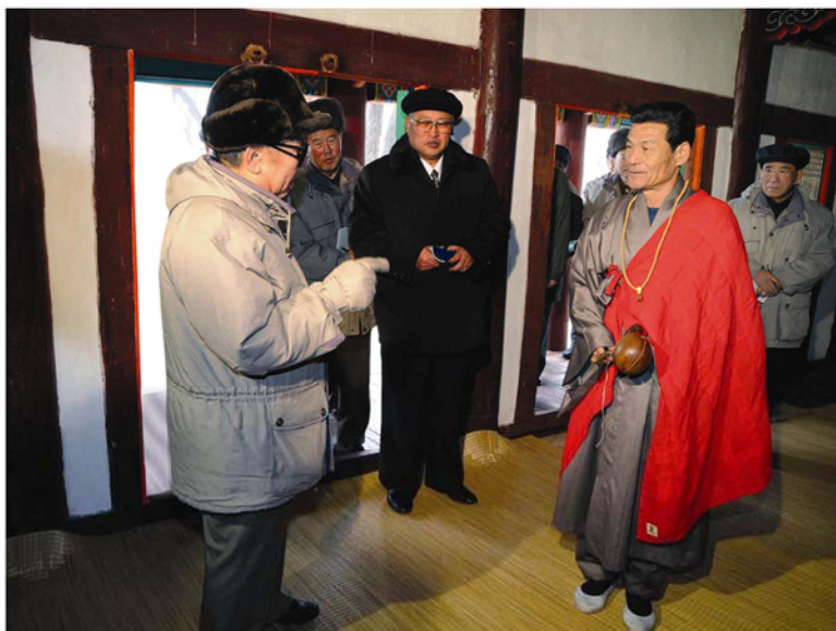
At the Pobun Hermitage in Mt. Ryongak (January 17, 2009)