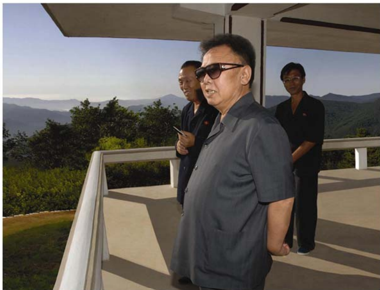
At the goat farm on the Phyongphung Tableland in Hamju County (August 7, 2008)