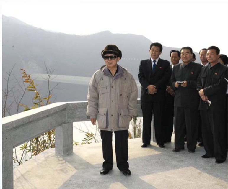
At the Kumjingang Kuchang Youth Power Station (November 6, 2009)