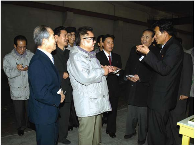
At the Ryongsong Machine Complex (November 12, 2006)