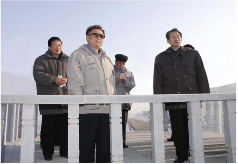
At the construction site of the Samsu Power Station (March 3, 2006)