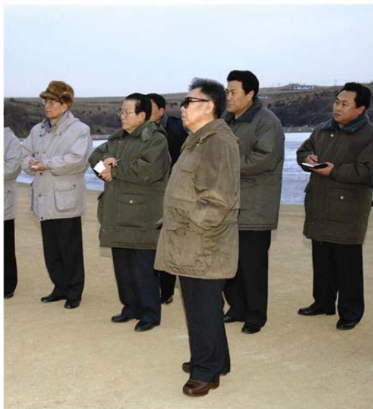
In a fish farm at Lake Jangyon (February 6, 2007)