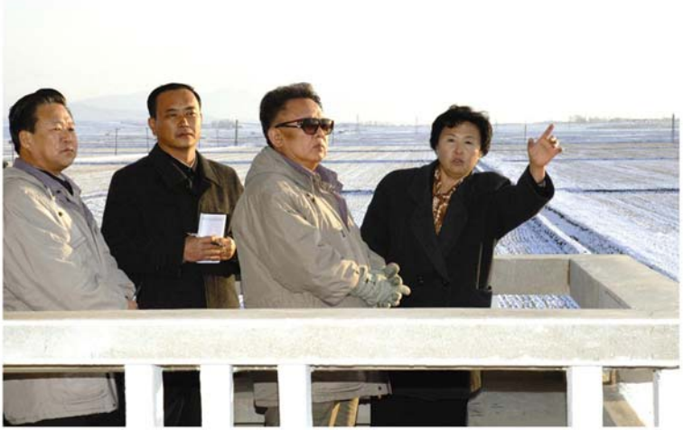
At the Migok Cooperative Farm in Sariwon (December 3, 2006)