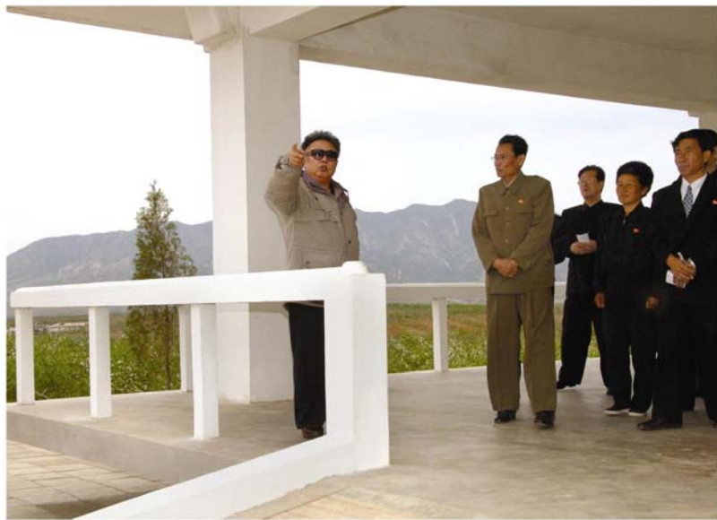
At the Kosan Fruit Farm (May 4, 2008)