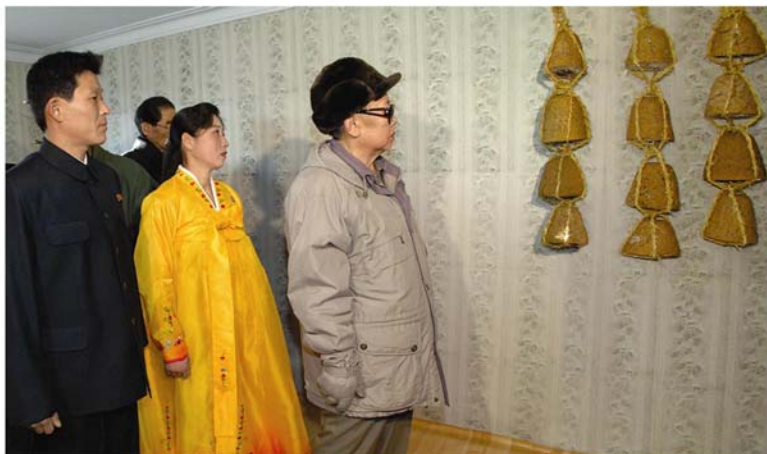
With a newly-wed couple of discharged soldiers at the Wonsan Youth Power Station (January 5, 2009)