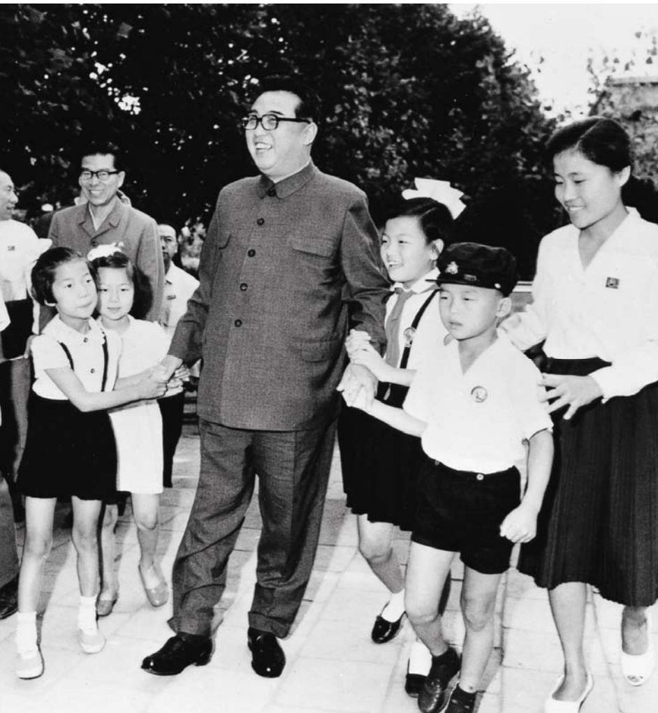
Kim Il Sung on a visit to the Taedongmun Primary School on the day of the start of a new school year (September 1972)