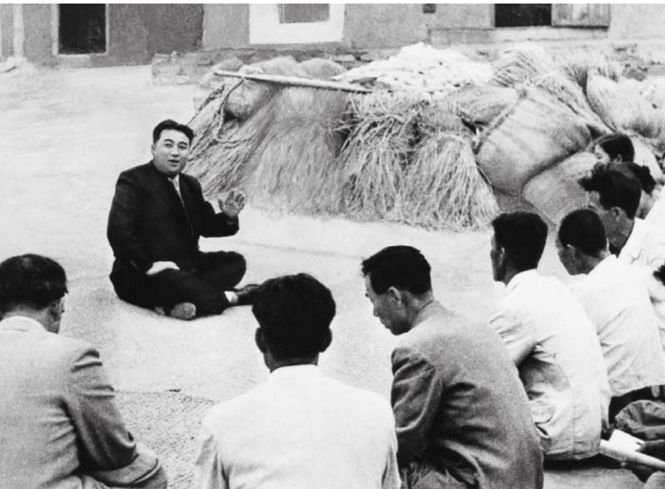
Kim Il Sung talking with the farmers at Chongsan-ri, Kangso County (October 1958)