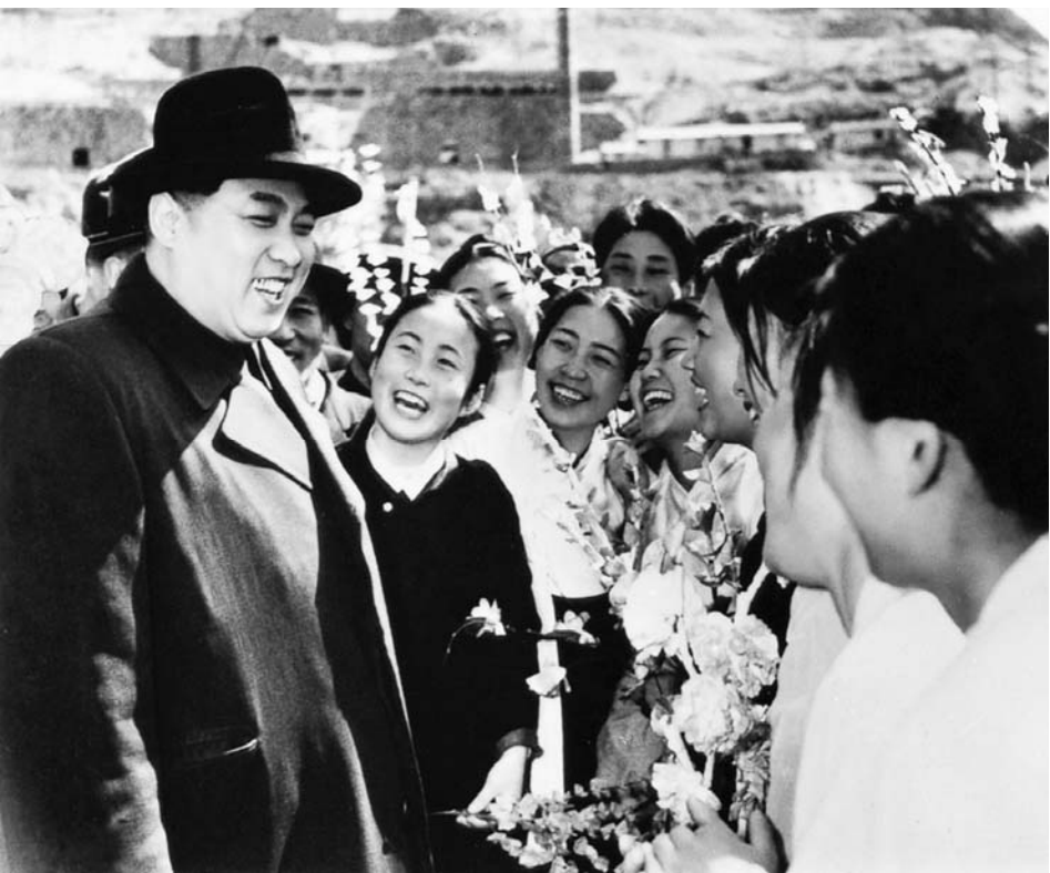
Kim Il Sung among the workers (April 1961)