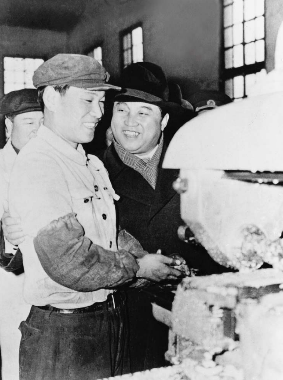
Kim Il Sung inspiring the workers at the Ryongsong Machine Factory to labour feats (March 1959)