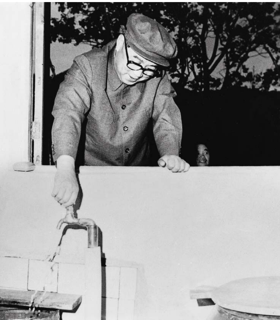
Kim Il Sung inquiring into water supply on his visit to a farmer's house in Kyongsong County, North Hamgyong Province (June 1972)