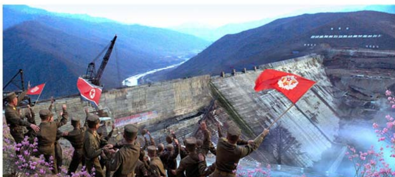
Ryongnim Dam of Huichon Power Station No.1 constructed by soldier-builders (2011)