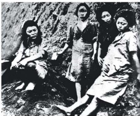
Korean women who are forced to serve as sex slaves at a comfort station of the Japanese army