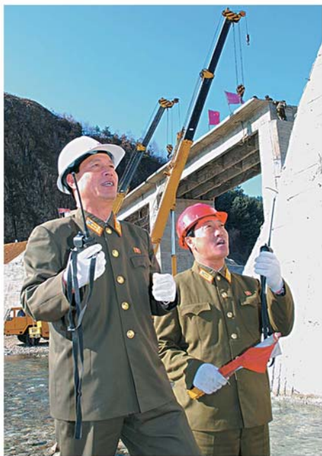
Service personnel seconded to socialist construction