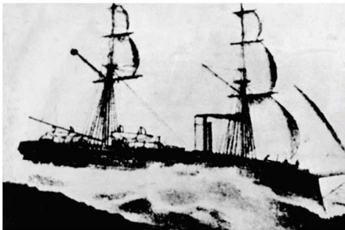
Japanese aggressor ship Unyo which intruded into Kanghwa Island of Korea in August 1875

During their military occupation of Korea, the Japanese imperialists enforced fascist colonial rule, killing Koreans in an indescribably cruel manner