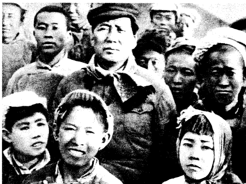
Mao in 1941.

After the 10th Congress, the Left launched a campaign to “Criticise Lin Piao and Confucius,” which brought out the common ideological essence of all revisionists and exploiting classes and the political programme that was bound to be common to all who would restore capitalism in China. The purpose was to make the summation of the recent past serve to arm the masses of Chinese people for the inevitable trials of strength that would follow.