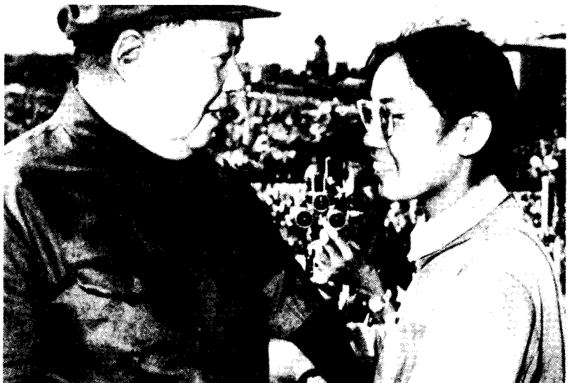
Young student activist pins Red Guard armband on Mao.