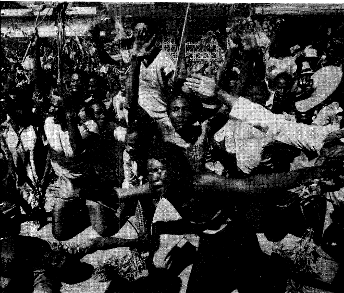
Tonton Macoute brought to justice by the people.

who took part in Duvalier's overthrow are now talking about a time for "forgiveness." The Church says instead of hunting down and killing the criminals, the people need "peace." For them, there was no crisis under Duvalier's regime, but now that Duvalier has been overthrown and the masses are in the streets, they're screaming about "crisis," as if this crisis were a bad thing. But this crisis is a good thing for the people; they're demonstrating and making their will felt — and that's a very good thing.