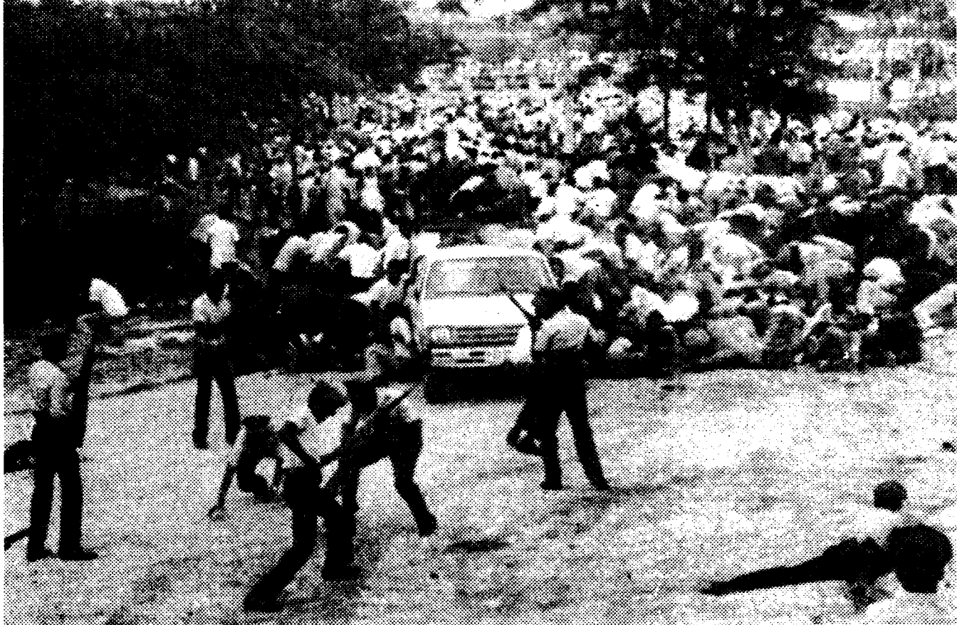
Fort Dimanche massacre.

be to get them to work faster. Then they'd eat a little and drink and then go home. That would be it, that's all they'd get for their work. They wouldn't get paid and they'd get nothing from the harvest.