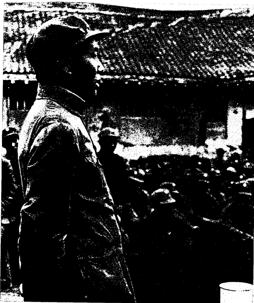
In the Chinese Communist Party's Yen-an command centre, Mao Tsetung placed great stress on the political education of cadres and soldiers.

The lesson of the terrorists' experience is not that the armed struggle cannot be waged in the imperialist countries, but that there are no substitutes for proletarian revolution. The goal of communism—"all mankind voluntarily and consciously changing itself and the world"—makes imperative a conscious political revolution, with the masses themselves in their millions taking up not only the guns that will finally batter and break the military power of the imperialist states, but the understanding that will guide them to do this in a way that will not lead to the replacing of one imperialist exploiter with another. The crisis of the imperialist system is even today preparing the conditions for one of those rare opportunities in the imperialist countries when this may be possible—for days which will mark the future of the world. Whether revolutionaries will be in a position to seize the time, to actually launch revolutionary warfare, defeat the imperialists on the battlefield, and establish the dictatorship of the proletariat in sections of Europe as part of the world revolution depends to no small degree on putting aside the old baggage which has for too long burdened those in the imperialist countries