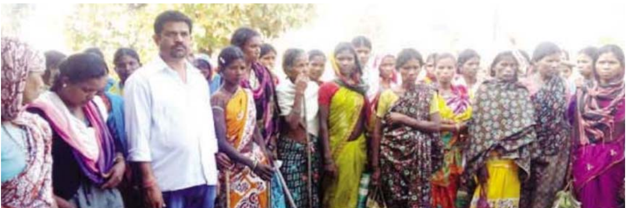
Village women protest in front of police headquarters at Bijapur against police atrocities