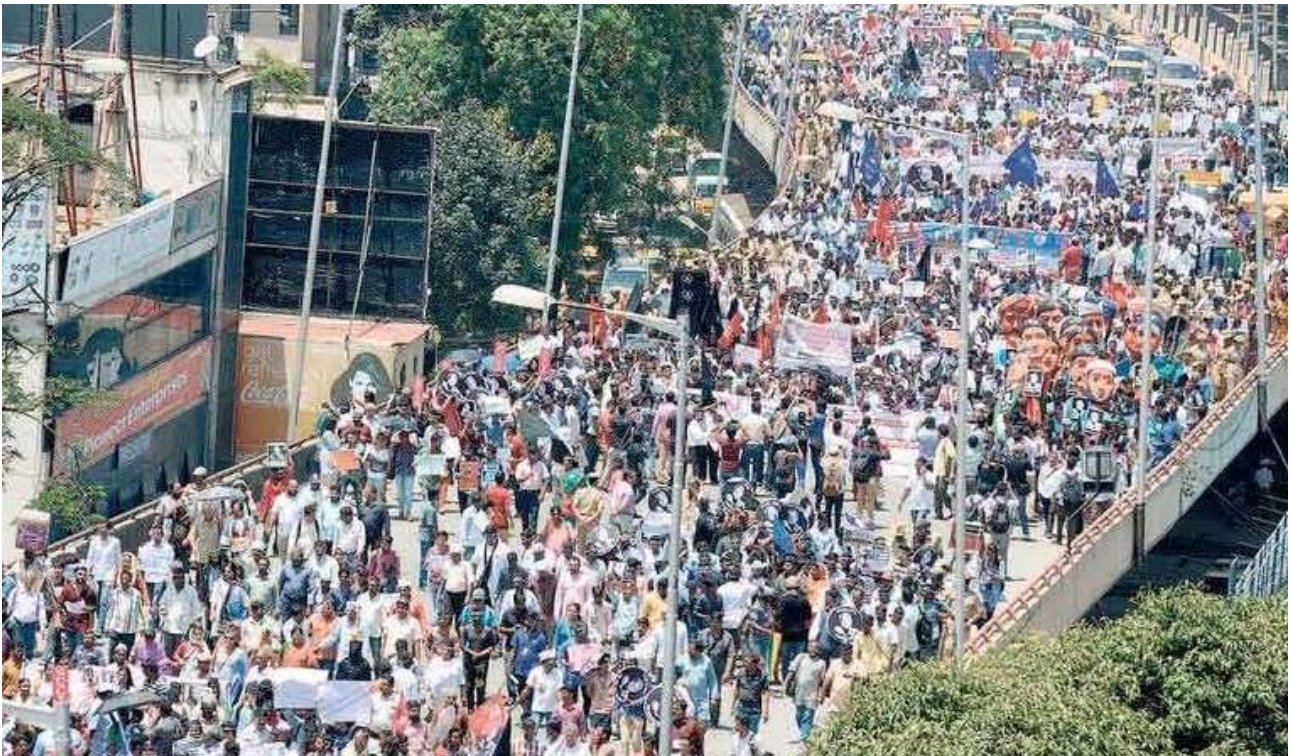
Massive protest rally in Bangalore against the assassination of Gauri Lankesh by RSS-BJP sponsored Hindutva goons

All this has made her a prime target of the Hindutva-fascist organisations flourishing under Modi-Shah-Bhagwat ruling clique. Unable to counter her sharp criticism, they decided to gag her voice forever and at the same time send out a message of dire consequence to all other likeminded democrats and progressives of the country who expressed themselves openly against the saffron terrorists. Though they managed to kill Gauri Lankesh, they failed miserably to throttle the voices against Hindutva fascism, which resounded more loudly following her assassination. Vehement condemnation and