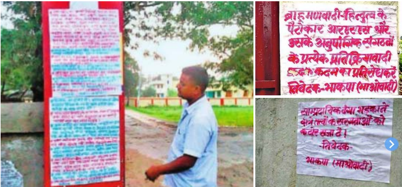
A police jawan looking at one of the posters in front of the police headquarters; Posters were also pasted during Martyrs' Week in Giridih district of Jharkhand opposing Brahminical Hindu-fascism