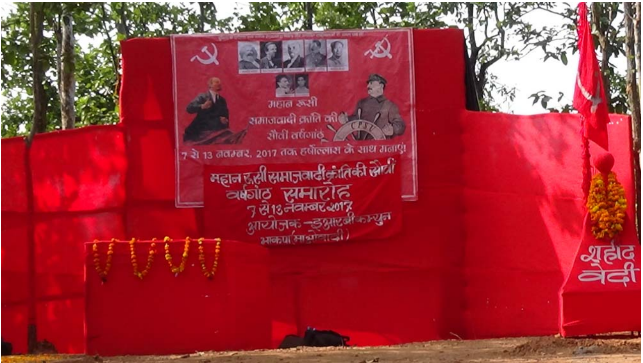
Centenary of the Great October Revolution celebrations in a guerrilla zone in Bihar-Jharkhand

and militarily defeating the ruling classes of not only Tsarist Russia but the alliance of fourteen imperialist powers, the victorious October Revolution demonstrated that that the armed proletariat led by the Communist Party and in alliance with the democratic classes can not only destroy the old state the reactionary classes and defend the Soviet state but can also build a new society by using this new state power. The name of October Revolution will remain etched in history forever as the first victorious proletarian revolution, the starting point for building socialism and a world socialist system.