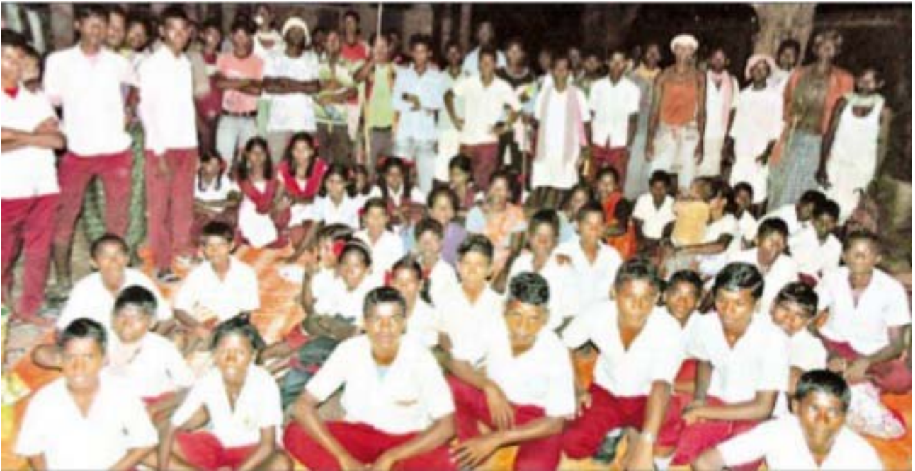
Students and teachers protest in Porahat against arrest of their colleague