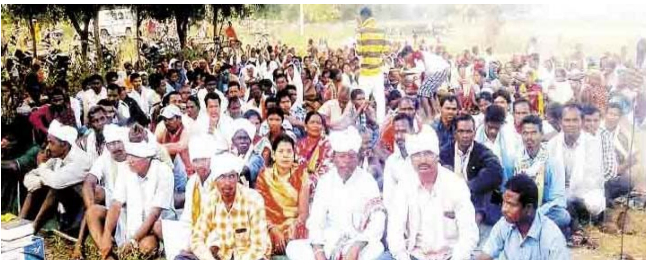
Masses protest against proposed police station in Dilmili village

An Ultra mega steel plant has been proposed in Dilmili village of Darbha block in Bastar district under the aegis of the comprador capitalists, for the security of which a police station there has already been sanctioned by the Indian government. But the