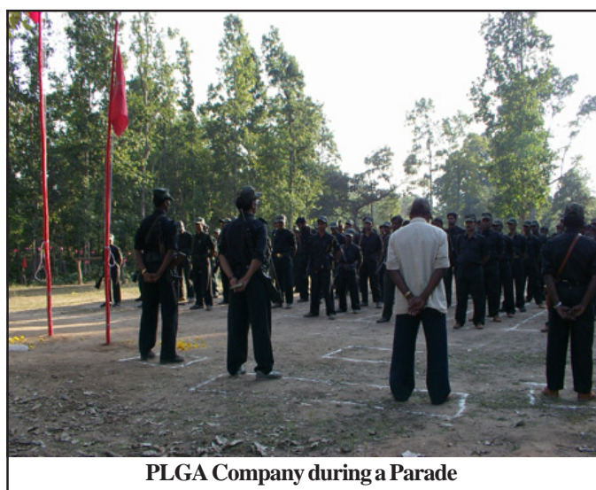
PLGA Company during a Parade

" ... The important difference between a guerilla war and a mobile war is that, in mobile warfare, the troops will be concentrated in relatively large numbers. The troops engaged in mobile warfare, will comprise of regular soldiers who have relatively higher political consciousness, greater discipline and military training..." (pg 103, para 7) The document adopted by CC in 2007 has the following to say on mobile war :