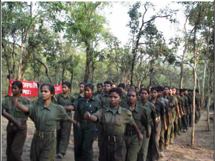
PLGA Women Guerillas March Ahead

Education department : The education department is guiding its sub-departments of political and academic education and is imparting education to the PLGA ranks. They are preparing syllabus based on scientific education to the ideal revolutionary people's schools run by the revolutionary people's governments. They are laying foundation for scientific education. They are contributing tremendously to impart revolutionary political consciousness and understanding to enhance the role of soldiers and people in people's war.