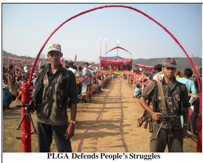
PLGA Defends People's Struggles

It is difficult to conduct even a single work in the guerilla zones and red resistance areas without the protection of PLGA. As the attacks of the enemy are increasing with each passing day this has become even more inevitable. It would be impossible to conduct political classes, plenums, conferences, military camps, mass meetings, propaganda campaigns and resistance programmes without the protection of PLGA. The PLGA takes upon itself the responsibility of providing defence for people's struggles (land struggles, famine raids, attacks on people's enemies, seizure of enemy properties etc). While the enemy is nervous as to when the PLGA would attack, people are able to go about their tasks without any fear. If there is no protection from PLGA then the whole revolutionary activity would itself stop.