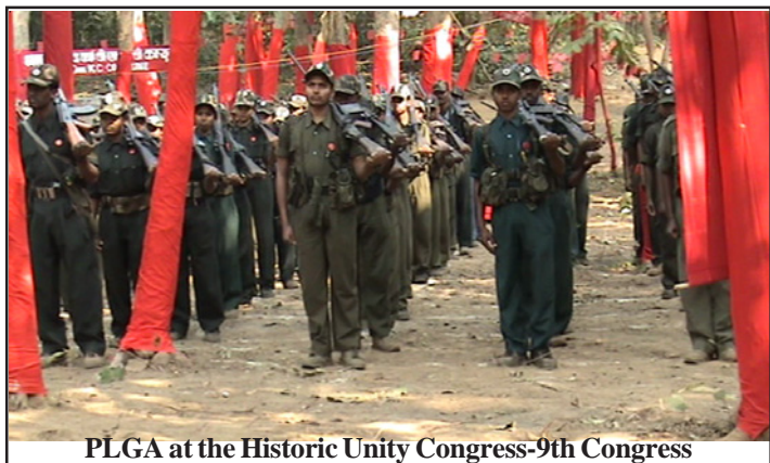
PLGA at the Historic Unity Congress-9th Congress

In order to consolidate PLGA and to expand it, various state/special zone/special area military commissions, regional/zonal/divisional/district, sub-zonal, area commands were formed from top to bottom organizationally to some extent under the leadership of Central Military Commission (CMC). Immediately after the Unity Congress-9 th Congress, Central and Eastern Commands were formed. After the emergence of PLGA, in the past one decade commissions and commands have gained higher level experience in intensifying guerilla warfare