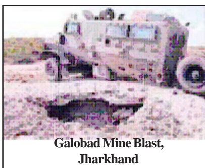
Galobad Mine Blast, Jharkhand

Booby Traps : The Baniyadih booby trap in BJ in 2005 and the Pundri booby trap in DK in 2007 could be considered as model attacks of annihilating the enemy in booby traps. With these the enemy took more stringent measures not to let gelatin fall into the hands of the guerilla forces.