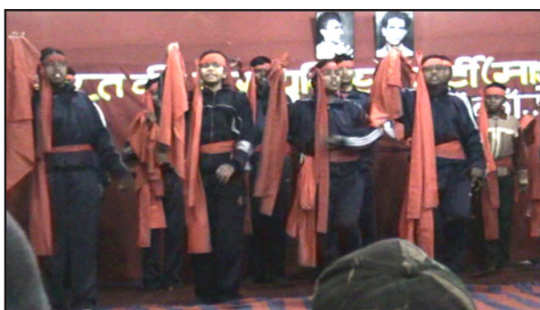
Cultural performances of PLGA

As part of PLGA the armed revolutionary cultural squads are playing an important role in building a revolutionary cultural movement in support of People's war with MLM ideology and politics. PLGA has contributed a lot in giving the revolutionary literary and cultural movement a mass character. As a result, in Bihar-Jharkhand, Andhra Pradesh, Dandakaranya, AOB, West Bengal and Odisha cultural organizations and armed cultural squads developed. Apart from these, in some zones children's cultural squads are also being formed. These are uprooting imperialist and feudal decadent culture from the minds of the people, developing scientific, progressive, democratic and revolutionary culture and revolutionizing people's arts. Particularly, in Bihar-Jharkhand, Dandakaranya, AOB and West Bengal they are carrying out revolutionary ideological and political propoganda and playing a crucial role in involving the masses in the ongoing revolutionary movement and People's War. They are playing an important role in fighting back the enemy's foul propoganda. They are regularly conducting workshops from area level to state level and are improving revolutionary arts. Amidst constant repression this revolutionary cultural movement is carrying on in a lively manner with the cooperation of the people.