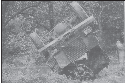
Padedda Ambush on Mireproof Vehicle, DK

In the incident where we fought back Operation Saranda, the lower level Commands under the Central Command and the three types of forces in PLGA were centralized. Better C4 (Command-Control-Communication-Coordination) was implemented here.