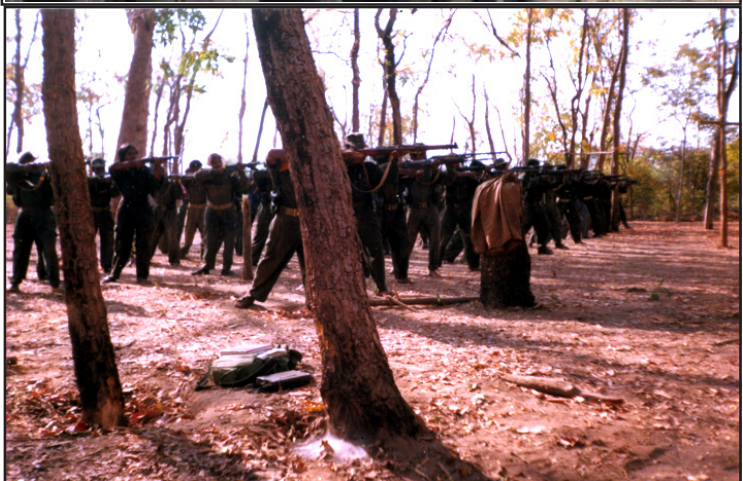
PLGA Weapon Drill