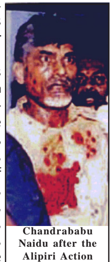
Chandrababu Naidu after the Alipiri Action