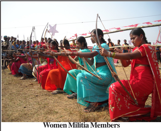
Women Militia Members

and insults' for the survival of the oppressed people, workers and peasants and for the liberation of the country. Overcoming all kinds of hurdles, not letting any disappointment or wavering to enter their ranks, the PLGA fighters and commanders have dedicated their lives to the people in order to advance certainly towards victory. Thus the party, PLGA and the people could achieve self-reliance in guerilla warfare. Without these sacrifices there could be no advancement of the people's war.