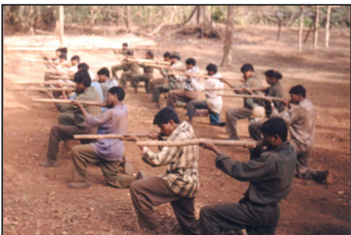
People's Militia under Training

PLGA is standing in support of these struggles. With the support of PLGA, people are getting increasingly mobilized into armed people's organizations like 'Koya Bhoomkal militia' in DK, the 'Jan Militia Squads' in Bihar-Jharkhand, 'Sidhu Kanu militia' in Lalgadh, 'Ghenoba Bahini' in Narayanapatna (Odisha) and 'People's defence militia' in Kalinganagar. They are providing mass base for 'People's War' waged against the 'Green Hunt' of the mercenary, fascist police and paramilitary forces. They are winning many historic successes by fighting back the policies of the exploiting ruling classes. They are proving that only 'people and people's army' can guarantee the victory of the revolution.