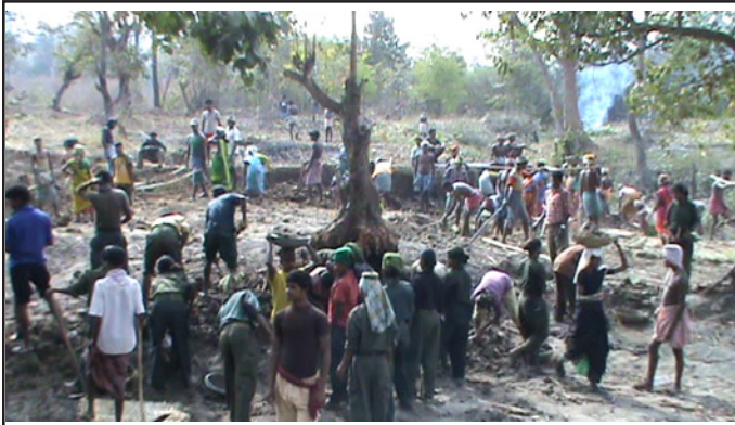
PLGA taking part in land levelling work along with the people