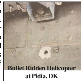
Bullet Ridden Helicopter at Pidia, DK

Booby Traps : The Baniyadih booby trap in BJ in 2005 and the Pundri booby trap in DK in 2007 could be considered as model attacks of annihilating the enemy in booby traps. With these the enemy took more stringent measures not to let gelatin fall into the hands of the guerilla forces.