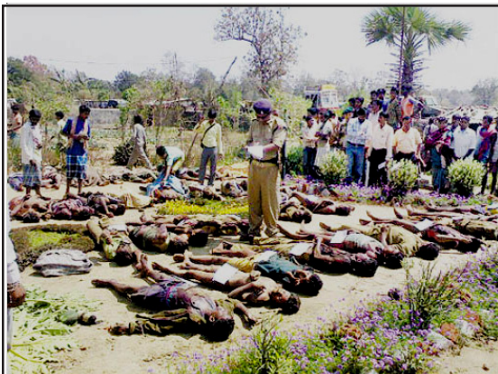
Enemy casualties in the Ranibodili Attack