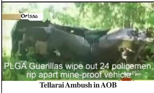
Tellarai Ambush in AOB

Mine warfare : In the past decade the PLGA has excellently applied the mine warfare in the vast guerilla zones. As a result, in 2005 - the Bhimband in BJ, the Padedda ambush in DK on the mine-proof vehicle for the first time, the Karremarka, Vinjaram, Navatola in Gondia; in 2006 - Kotha Cheruvu in DK, Kiriburu and Bokaro in Jharkhand; in 2007 - Banda - 1 in DK, the attack on Janardhana Reddy, the ex-Chief Minister of AP; in 2008 - Adejhari, Cheribeda, Mardapal in DK, Dulvadih area ambush, Vanso two person ambush in Jharkhand, Burudi in West Bengal (BJO), Tellarayi ambush on mine-proof vehicle in AOB, Samaripat in North Chhattisgarh; in 2009 - Kokavada, Ganeshnala (Gidam) in DK, Biramdih in Jharkhand, Palur in AOB; in 2010 - Singavaram, Pedakodepal in DK, Mantriyamba in AOB, Ramgadh-Pingboni in West Bengal - in all these ambushes the PLGA could inflict heavy losses on the enemy.