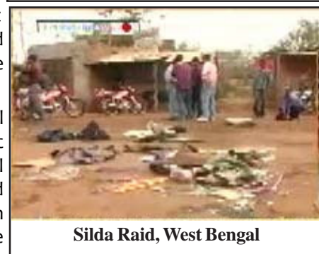
Silda Raid, West Bengal

Many more model raids : Along with these, in 2005 - the raid in Venkatammahalli in AP-Karnataka border, the Bhatgaon raid in North Chhattisgarh, Madhuban multiple raid in 3-U; in 2006 - the Murkinar raid and raids on Salwa Judum sibirs in DK, the Ara raid in N.Chhattisgarh; in 2007 the Nawadih PS & Block raid in Jharkhand, in 2008 the Bermo raid in Jharkhand, in 2009 – the NALCO raid in AOB; in 2010 – the raid on government toll plaza in Bihar are the important raids conducted in this period.