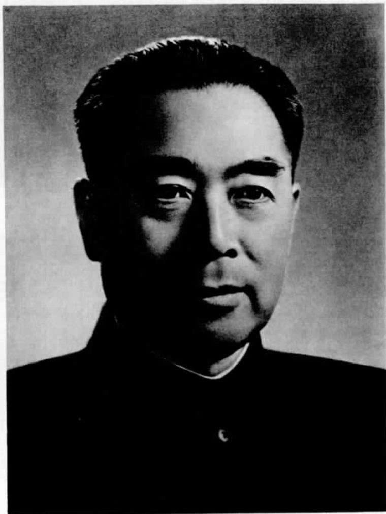
Comrade Chou En-lai, a great proletarian revolutionary of the Chinese people and an outstanding communist fighter.

FOREIGN LANGUAGES PRESS Printed in the People's Republic of China