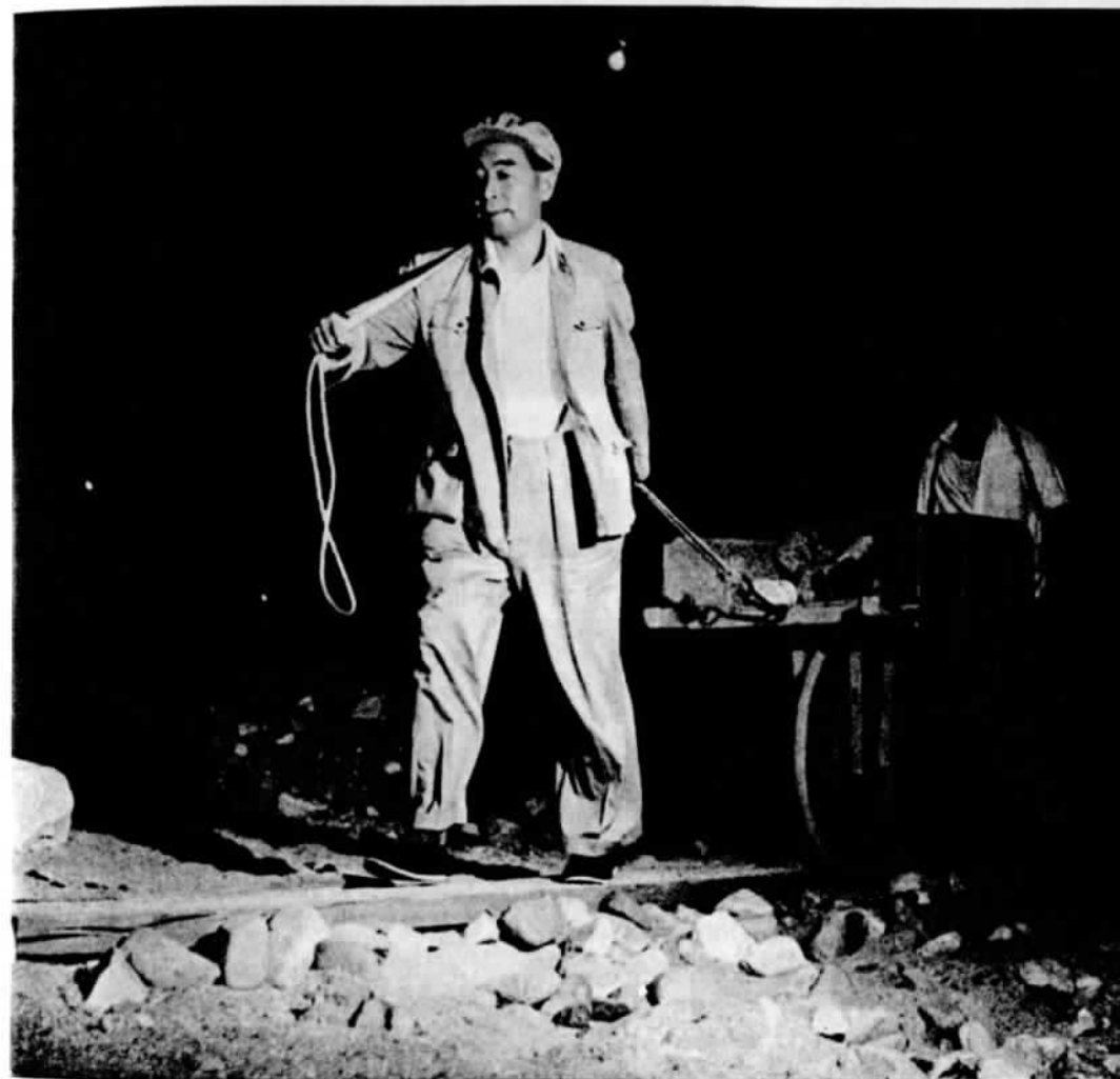
Premier Chou En-lai working at the Ming Tombs Reservoir construction site in Peking.