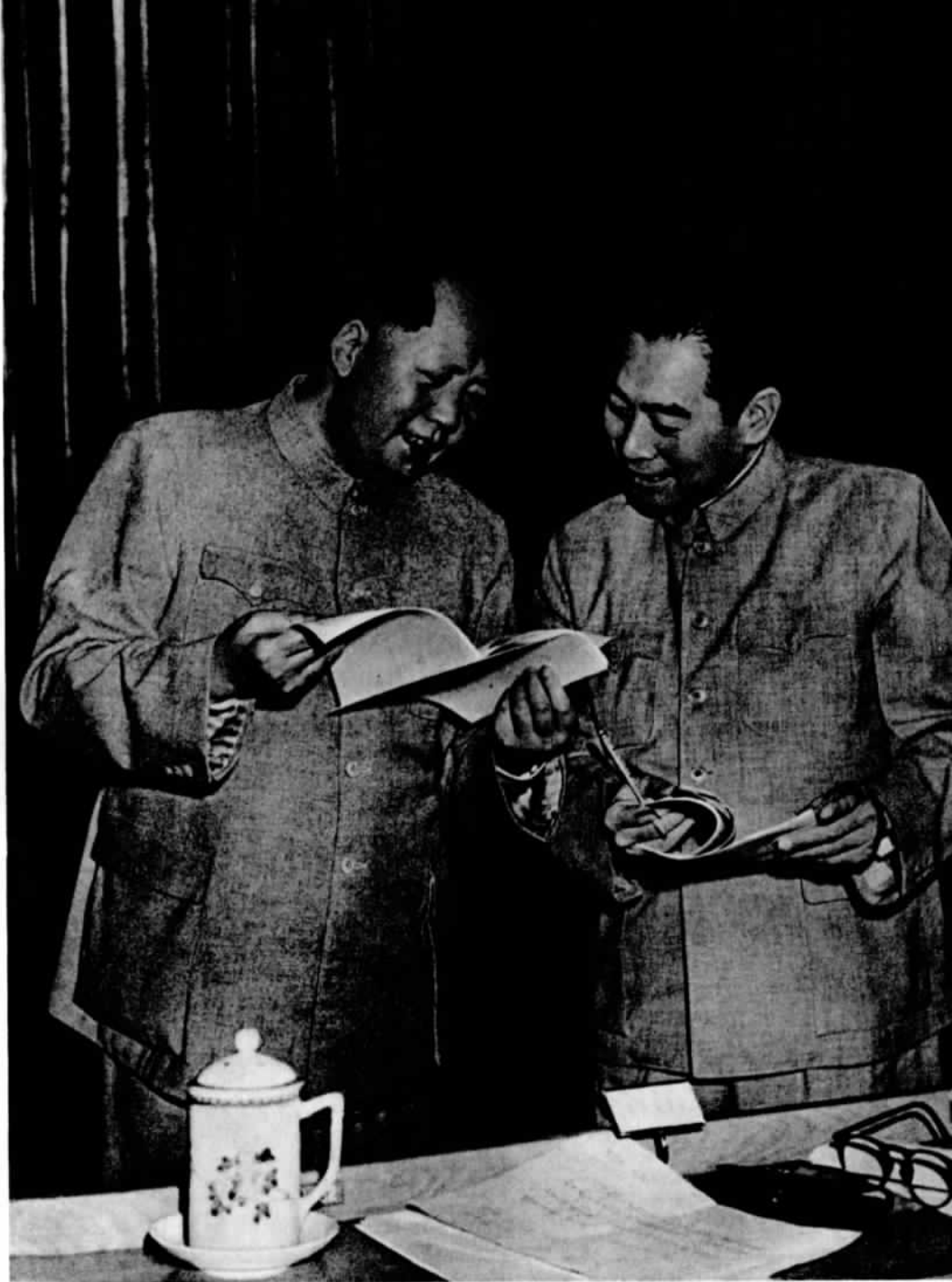
Premier Chou En-lai discussing a document with Chairman Mao at the 24th Session of the Central People's Government Council, 1953.