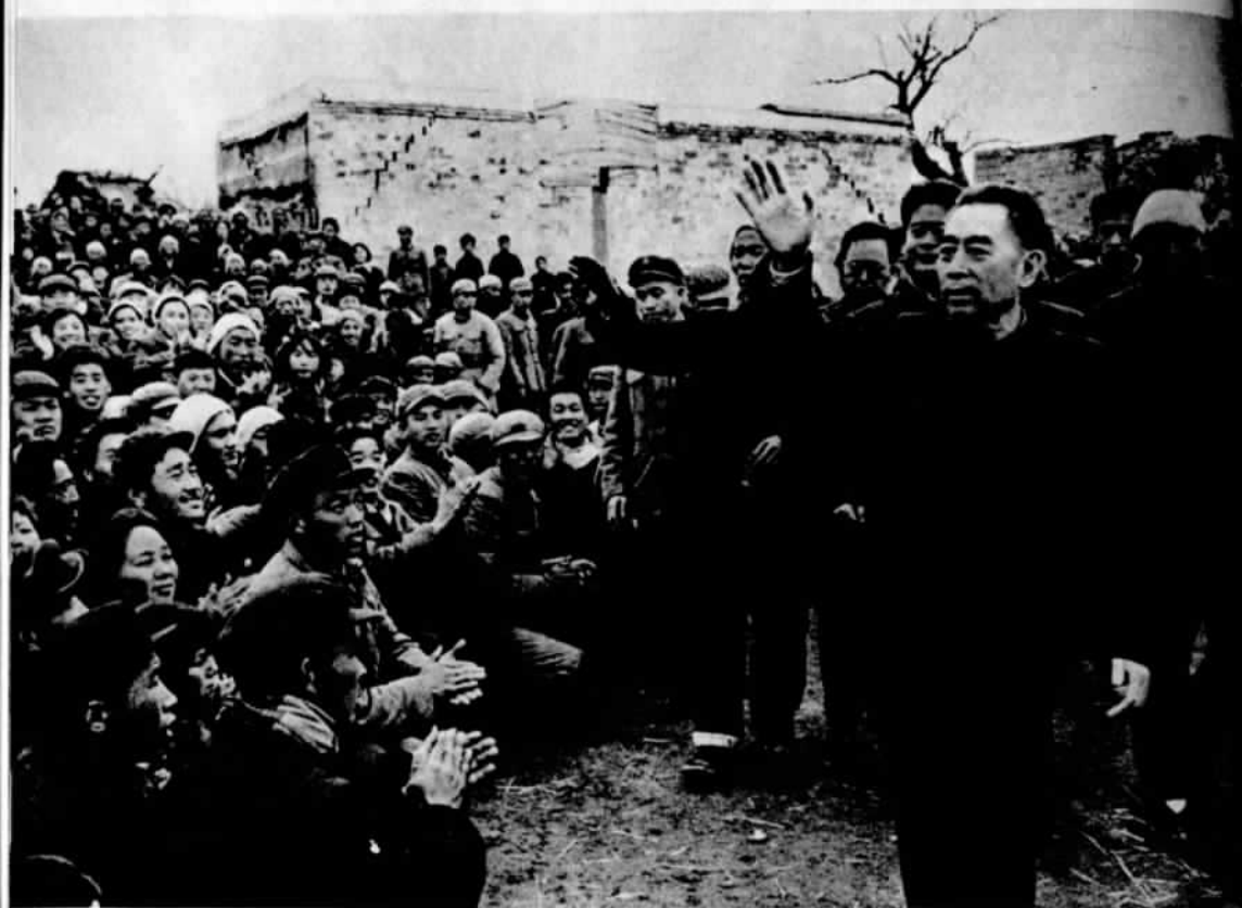
On March 9, 1966, the day after a strong earthquake in the Hsingtai area of Hopei Province, Premier Chou En-lai arrived there to extend warm sympathy to the people on behalf of Chairman Mao and the Party Central Committee.