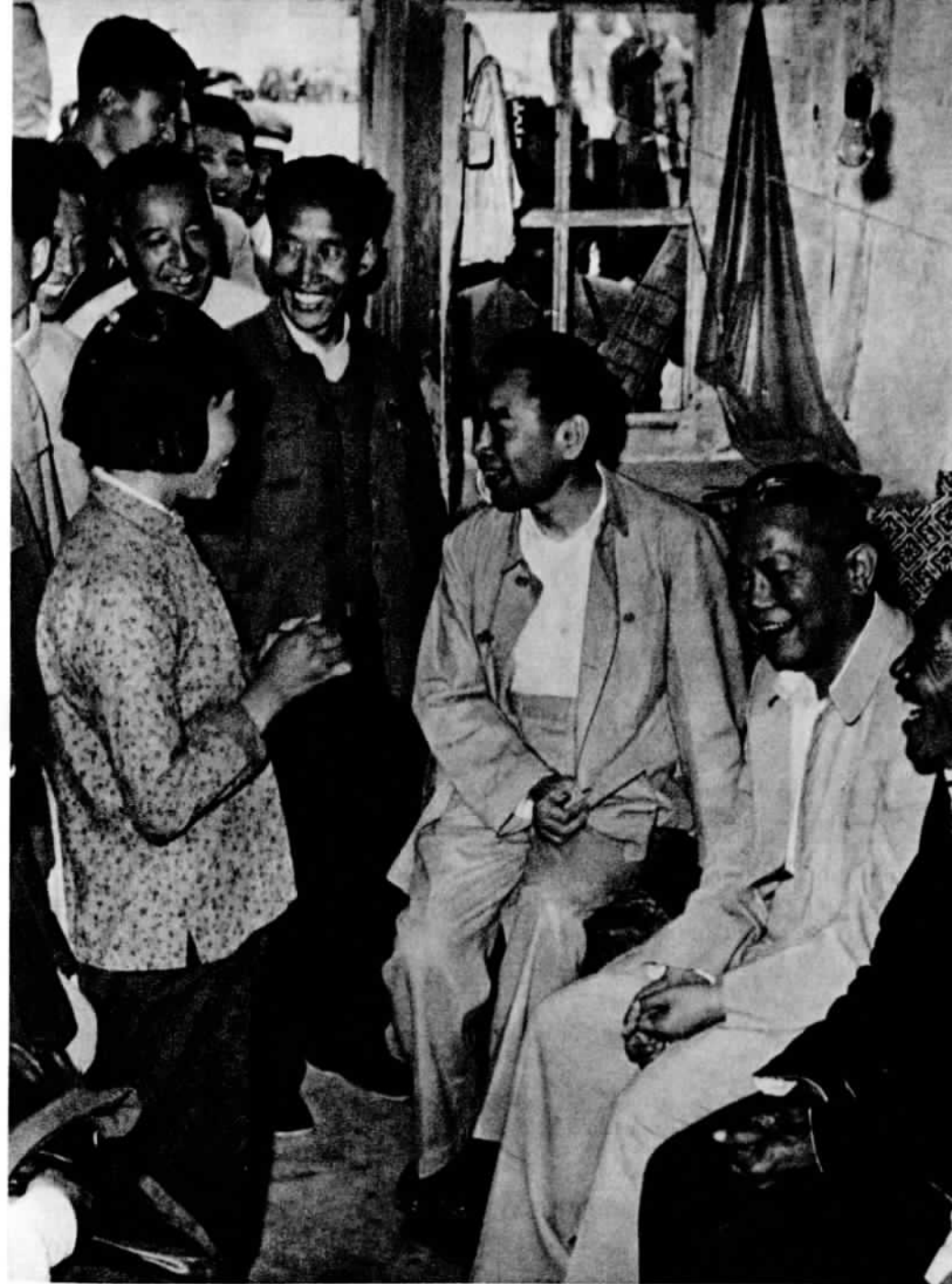
Premier Chou En-lai and Vice-Premier Li Hsien-nien chatting with Comrade Chen Yung-kuei, then secretary of the Party branch of the Tachai Brigade, and other cadres when they visited the brigade in Hsiyang County, Shansi Province in May 1965.