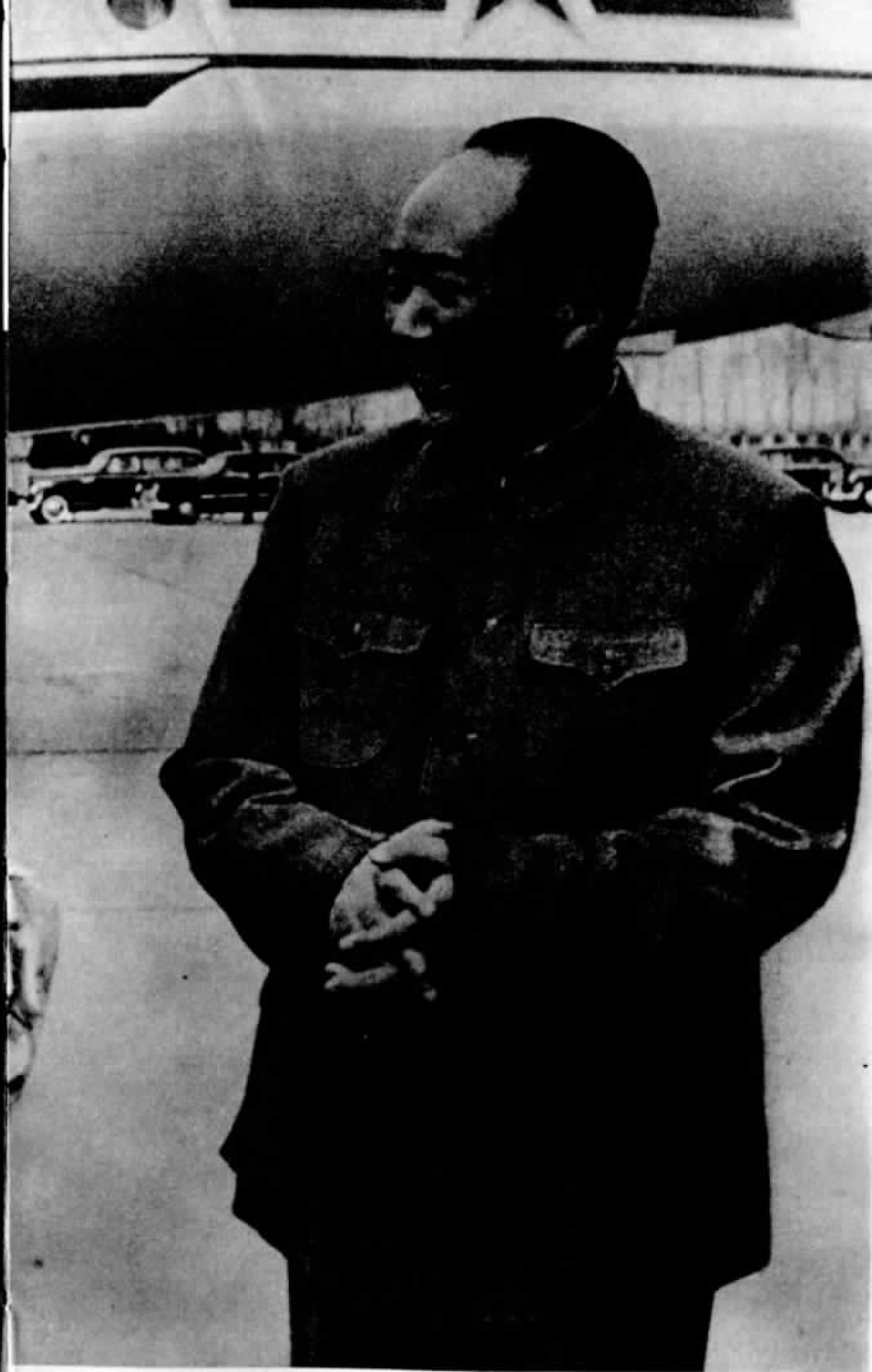
Delegation to celebrations for the 47th anniversary of the October Socialist Revolution. He was given a warm welcome by Chairman Mao, Chairman Chu Teh and the people in Peking on his return from Moscow.