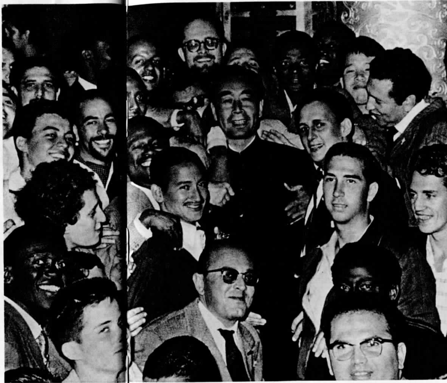
Premier Chou En-lai with friends from Asia, Africa and Latin America.