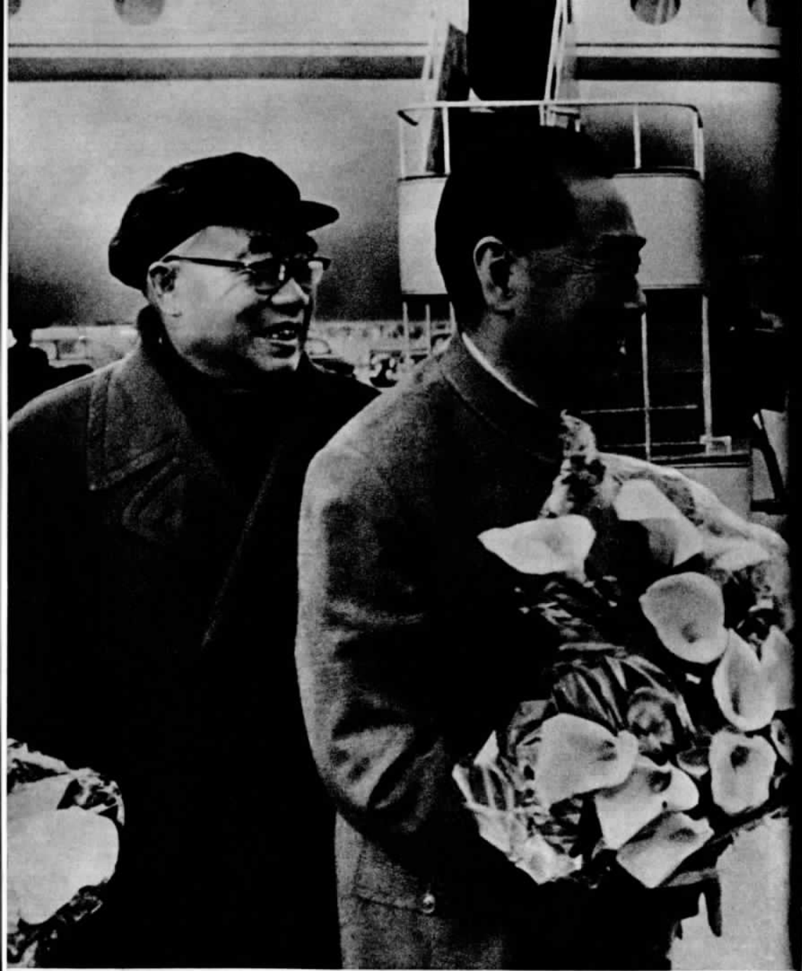
Comrade Chou En-lai resolutely rebuffed the vicious attack on our Party by the Soviet revisionist renegade clique and defended Marxism-Leninism-Mao Tsetung Thought when he was in the Soviet Union in November 1964 at the head of the Chinese Party and Government