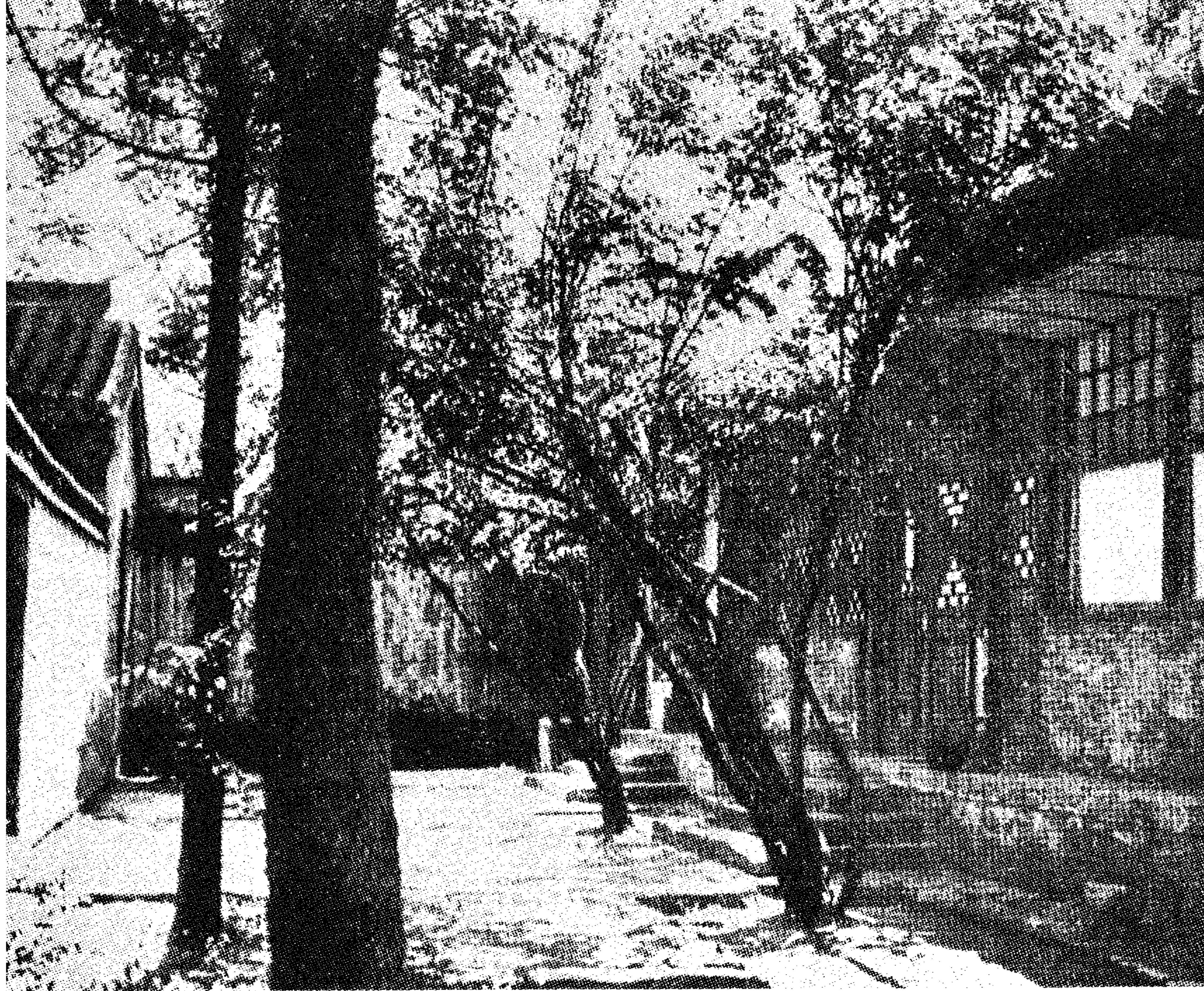
The south wing of No. 11, Badaowan, Beijing, where Lu Xun lived from 1919 to 1923