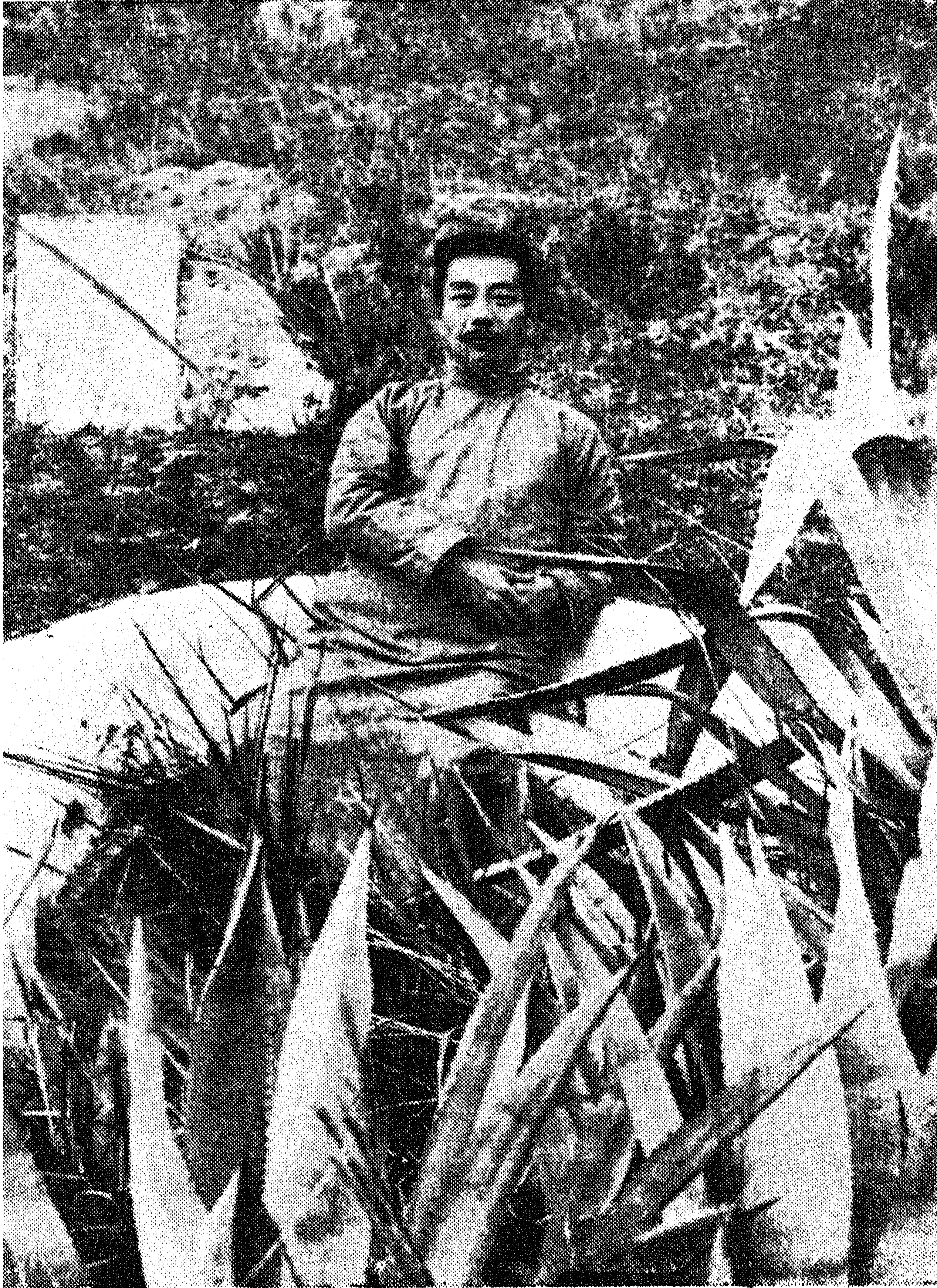
Lu Xun, autumn, 1926, in Xiamen