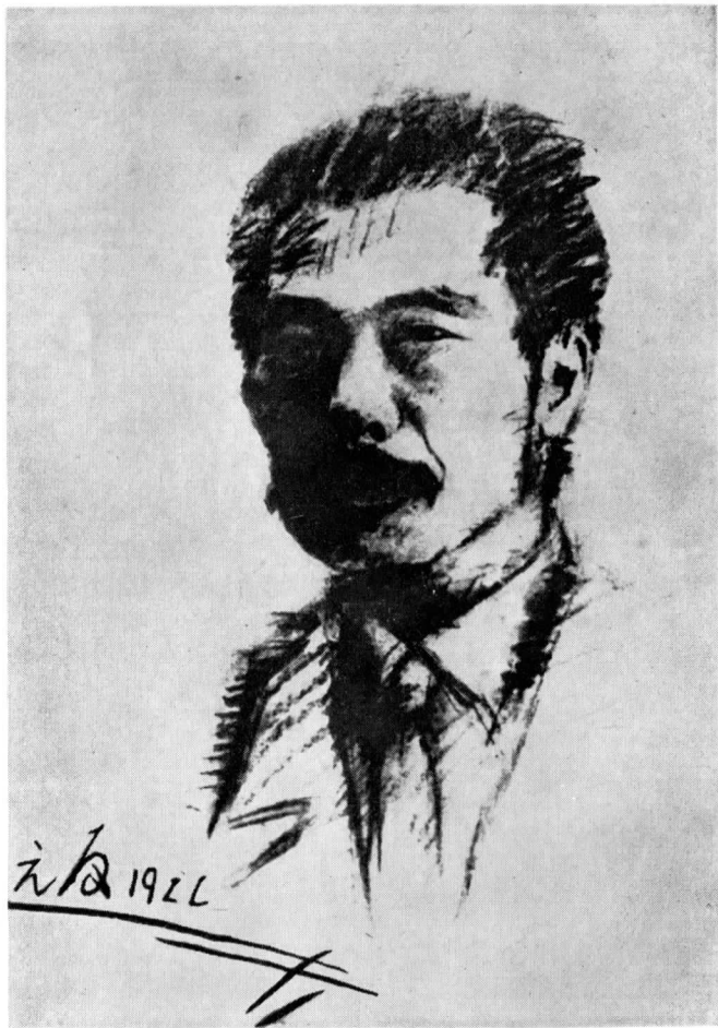
Portrait by Tao Yuan-ching