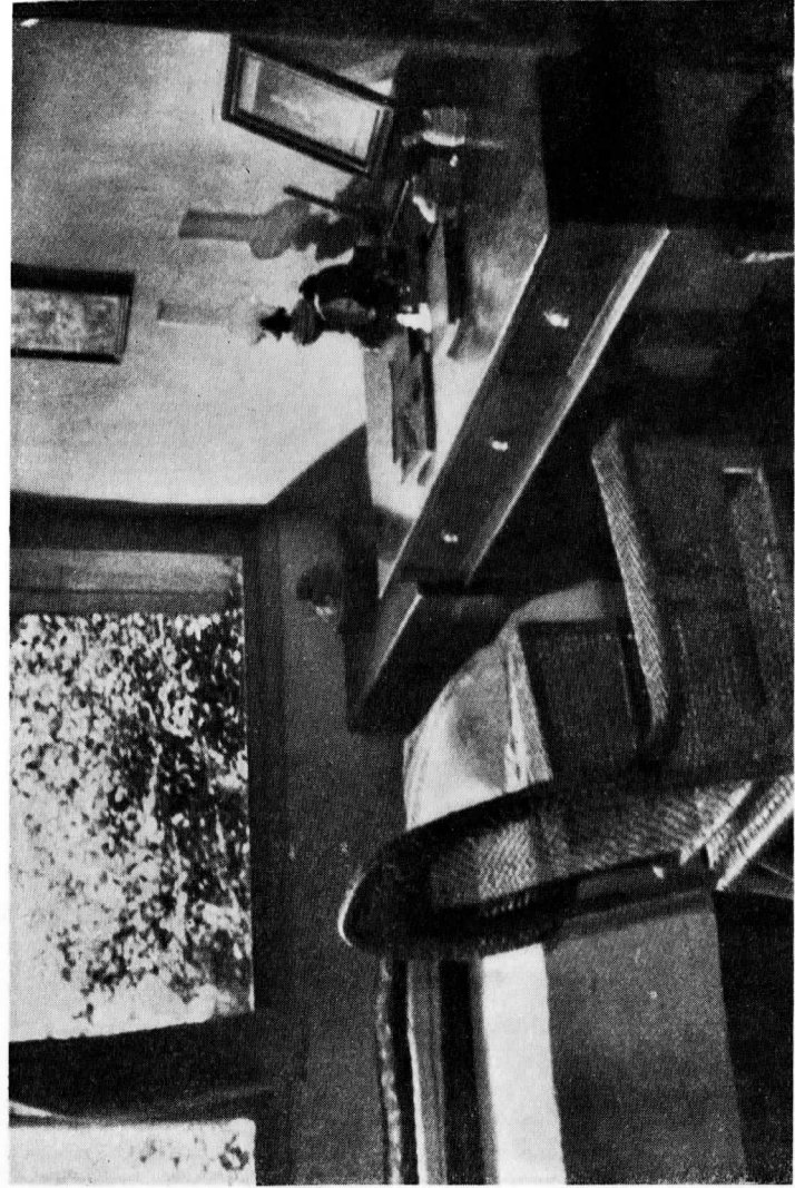
His study in No. 21, Hsiantiao Hutung, near the Fucheng Gate, Peking, where Lu Hsun lived from 1923-1926