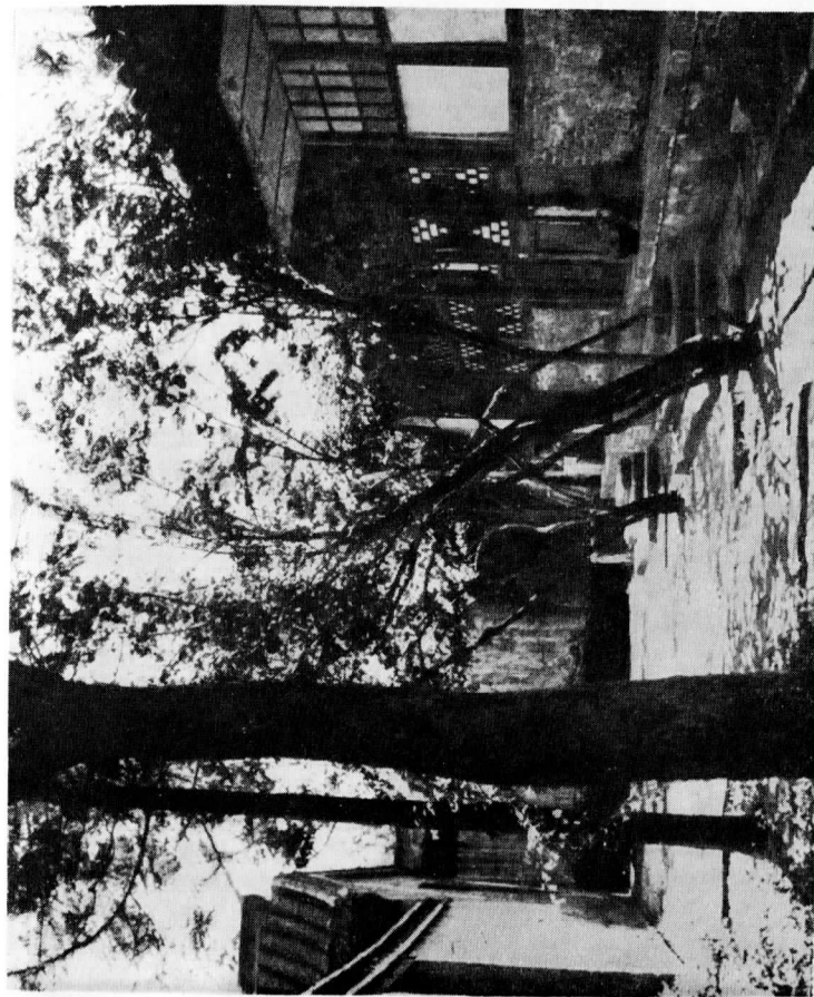
The south wing of No. 11, Pataowan, Peking, where Lu Hsun lived from 1919-1923