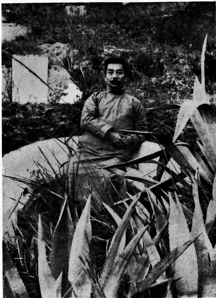
Lu Hsun, autumn, 1926, in Amoy