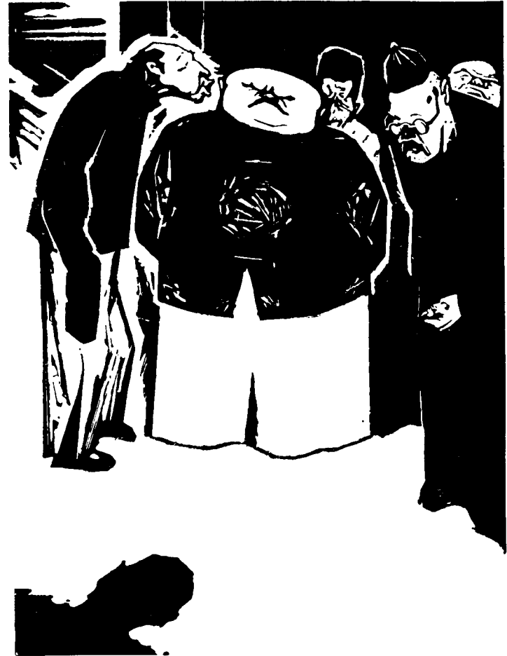
In the midst of them was a man who she knew at once must be Seventh Master. Though he had a round head and a round face too, he was a great deal bigger than Mr. Wei and the others.