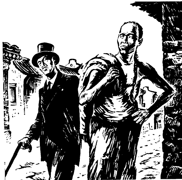
Now this "Imitation Foreign Devil" was approaching.

The men in the wine shop roared too, with only slightly less satisfaction.