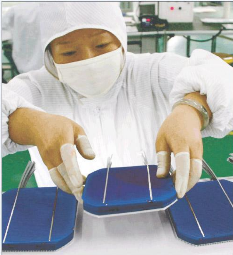
China now controls roughly half the global market for finished solar-power equipment such as the photovoltaic cells (above) used on solar panels.

*Czech Republic, Hungary, Korea, Mexico, Poland, Turkey †Austria, Belgium, Finland, France, Germany, Italy, Luxemburg, Netherlands, Portugal, Spain