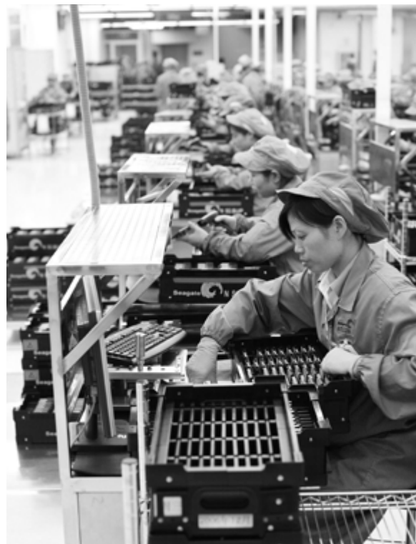
Workers in a Chinese factory in Wuxi.

The birth of an official discourse that connects trade and labour can be dated back to 1998, when the International Labour Organization (ILO) issued the Declaration on Fundamental Principles and Rights at Work. This document highlighted a nucleus of core labour rights and bound all ILO member states to uphold them when engaged in bilateral or multilateral economic cooperation. Since then, a growing number of trade agreements—including the North-America Free Trade Agreement (NAFTA), the US-Dominican Republic-Central America Free Trade Agreement (US-CAFTA), and the previous version of the TPP—have incorporated labour-related provisions, often referring directly to the ILO Declaration. Still, in spite of this nexus between trade and labour, there remain several doubts about the effectiveness of free trade agreements as instruments to