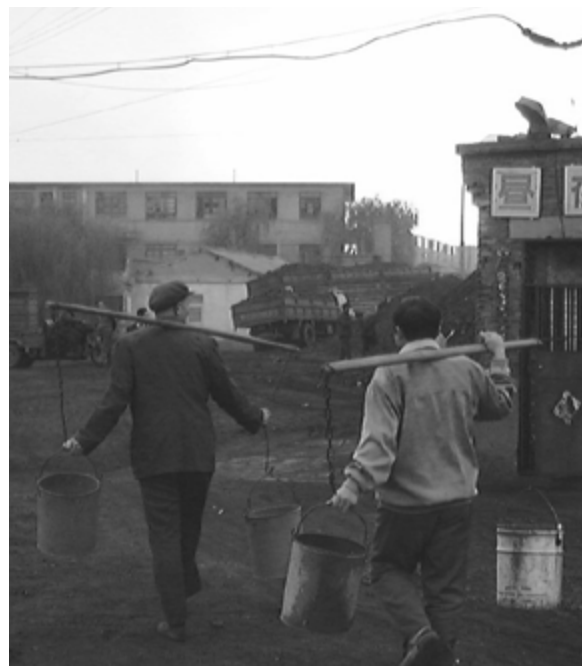
Miners at Lao Ye Temple Mine, Datong, Shanxi

Recently, China's economic predicament has begun to precipitate a widely anticipated crisis of industrial overcapacity . Profit margins in the steel industry are surprisingly low, and workers' wages and conditions are very poor at what has been described as zombie economy . Steel factories and coal mines are reported to have not been paying wages for months and many workers have already been laid off. When I visited a steel plant in the southern city of Kunming in 2012, I found a factory that was barely surviving on a meagre profit and where workers worked long shifts and earned just above the minimum wage.