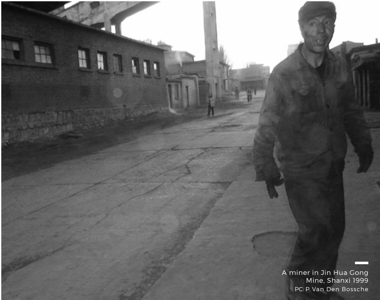
A miner in Jin Hua Gong Mine, Shanxi 1999