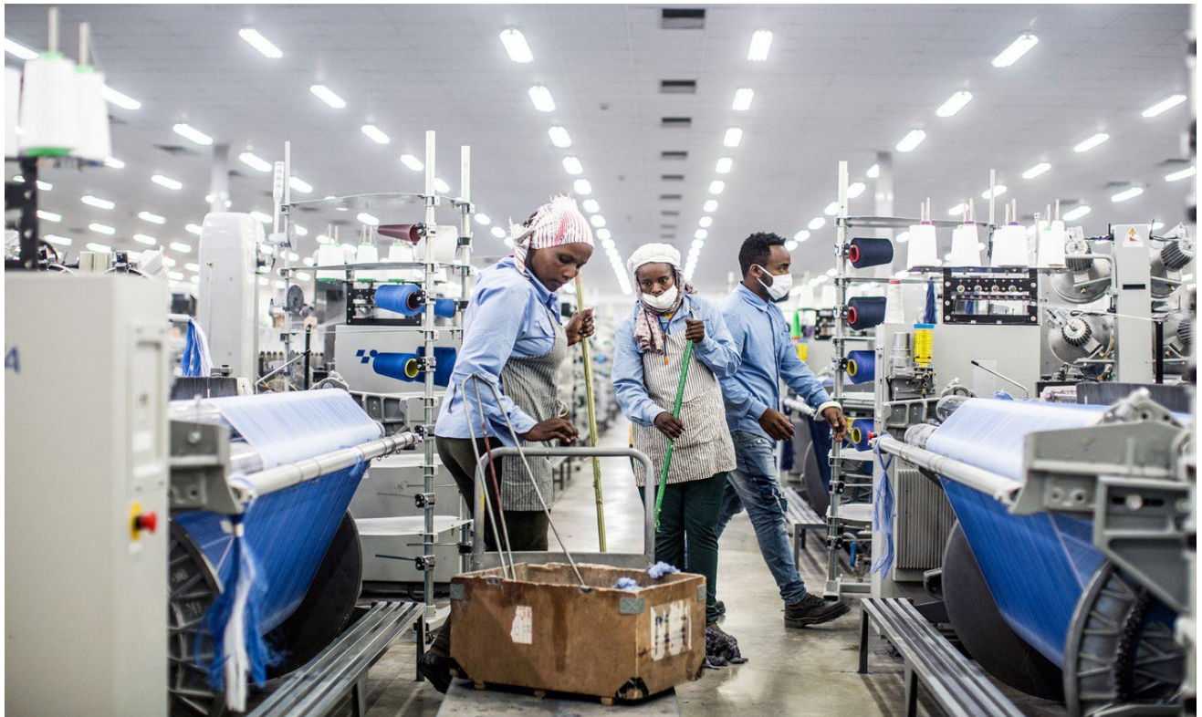
Textile workers at a Chinese-owned factory in the Hawassa Industrial Park.

The project is Beijing's big experiment in outsourcing, and a $10 billion shot in the arm for the African nation—if there isn't a civil war first.