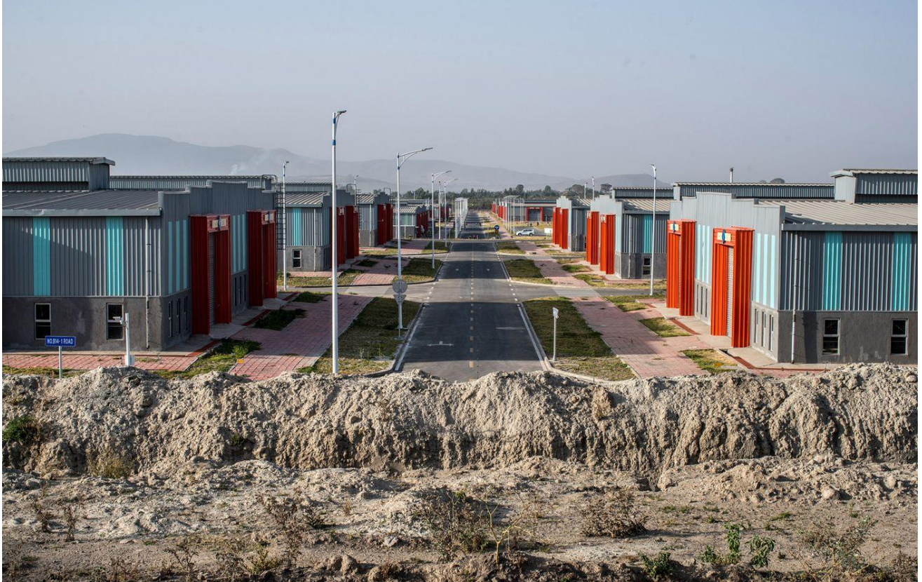
The facility, built on farmland, is the largest of four new textile and apparel centers.