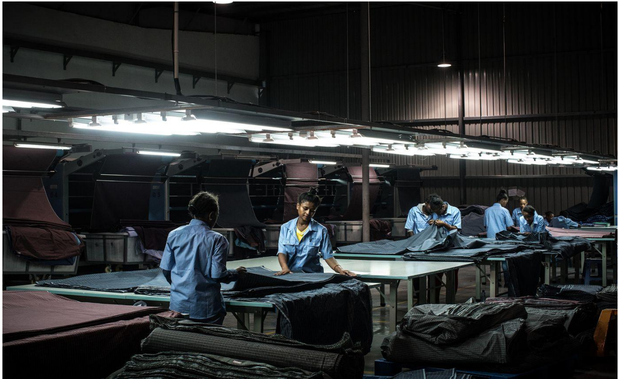
Inspecting finished fabrics.