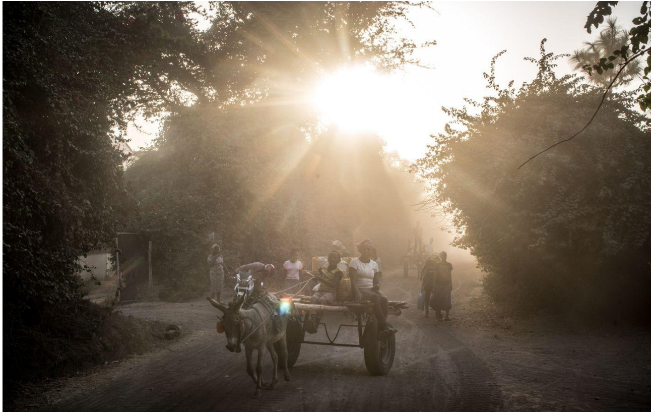
Donkey-drawn carts carry workers home in Hawassa.