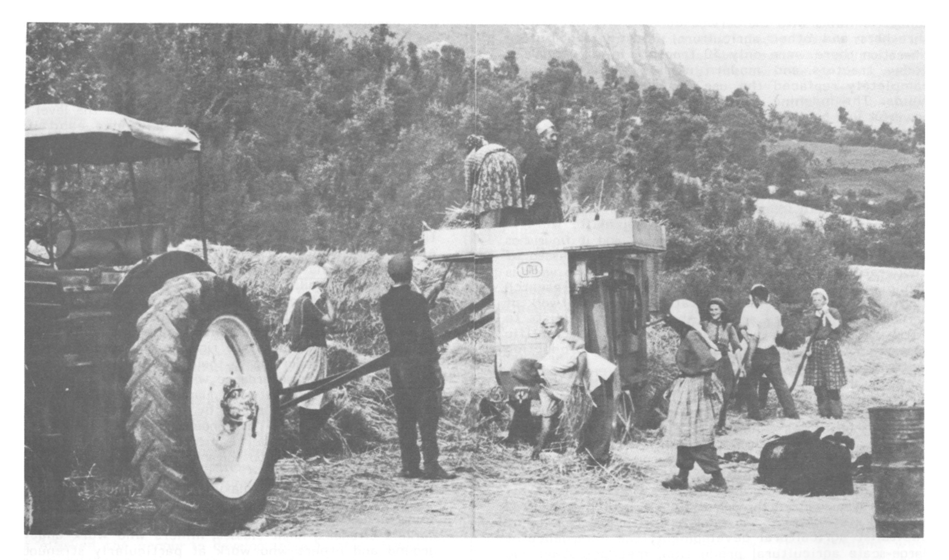
As a result of the socialist transformation of agriculture, production has increased by a phenomenal 500% since liberation.