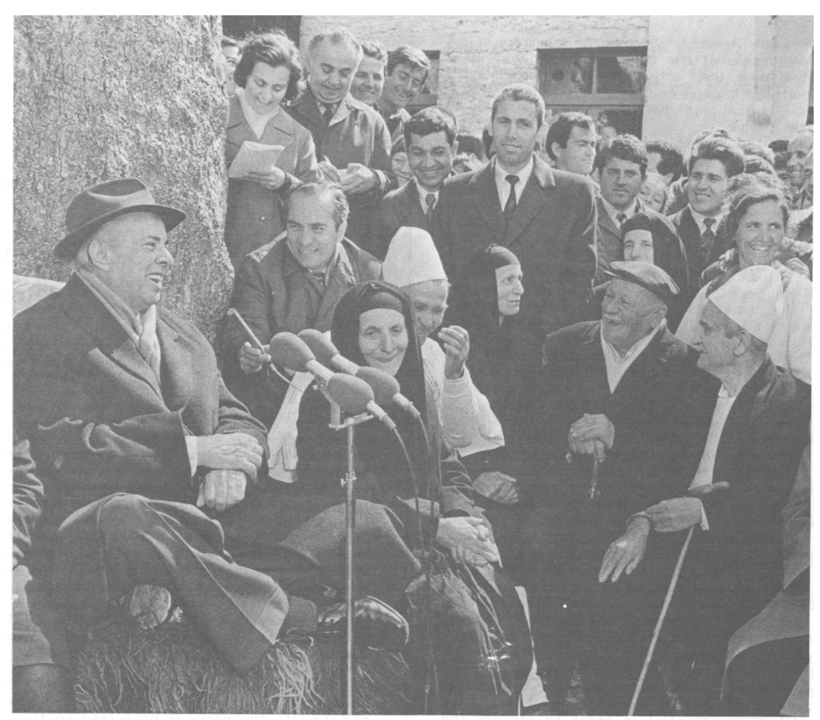
The Party of Labor of Albania, headed by Enver Hoxha, is leading the ongoing revolutionary transformation of socialist society.