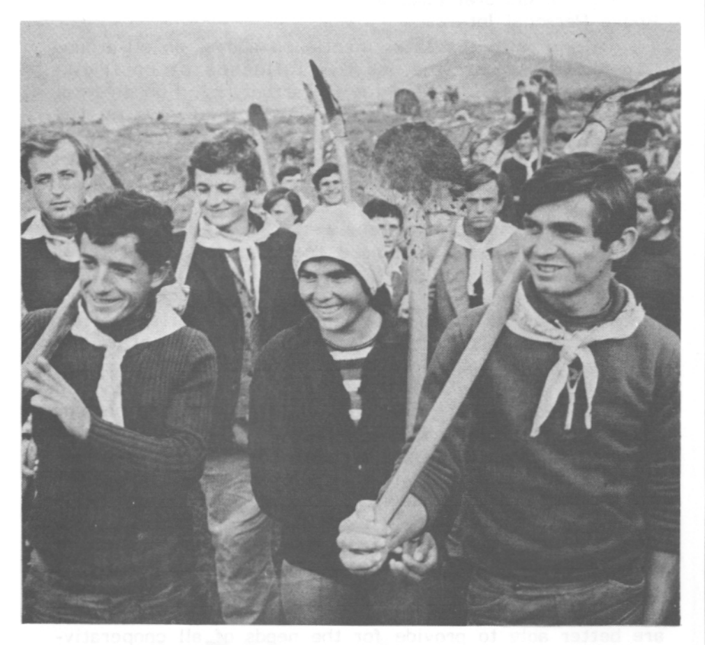
Each year thousands of young people join volunteer brigades to help build new roads, railroads, bridges, factories and houses.