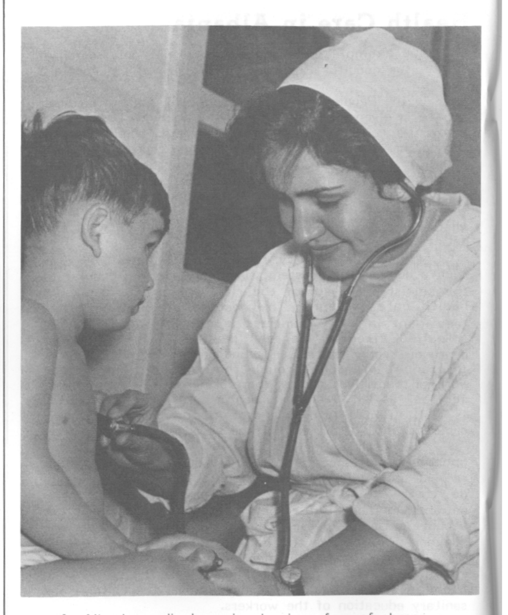
In Albania medical service is given free of charge.

The state compels all enterprises to take the necessary precautions in order to protect the environment from pollution right from the first stages of work on new projects. In addition, the law also charges social organizations as well as every citizen with duties so that the environment may be protected against pollution. It is the people's responsibility to take a stand when violations of this law are noticed, since pollution is a problem related directly to the protection of the health of the working masses. According to the public health legislation in Albania, it is compulsory for every work center to take measures for the prevention of occupational diseases of the workers, in accordance with the work center and the material handled by the workers. The work center must secure the necessary equipment for ventilation or for the suction of harmful gases, smoke and dust during the production process, and to remove in good time all waste and left-over materials which may be harmful to the environment. The work center must also supply each worker with the necessary means and clothing for their protection during production. For their part, the workers are under an obligation to utilize these means of protection during the work hours. Every worker is given periodic medical examinations. Should the prospective worker be found medically unfit for a particular job, appropriate work will be found for that person.