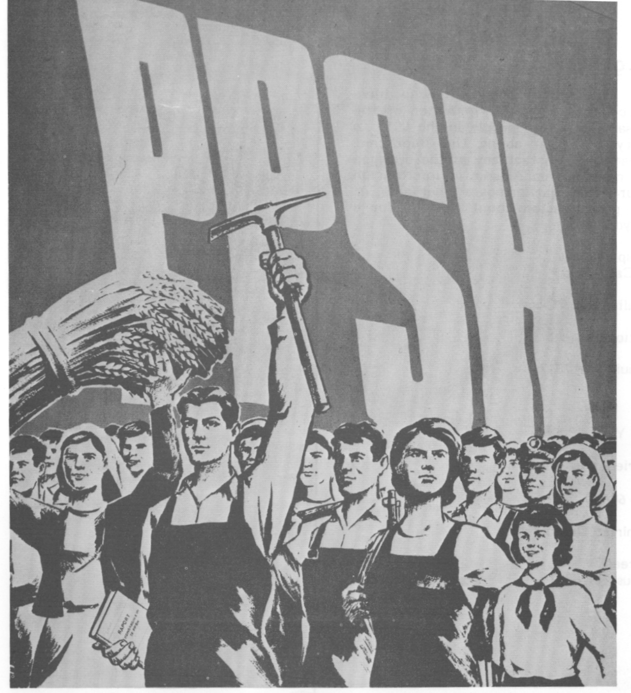
The Albanians are blazing an historic trail and deserve the support of all democratic and progressive people.