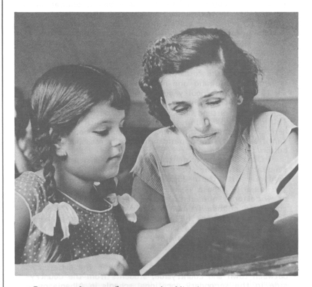
One out of every 3 persons in Albania attends school, one of the highest rates of school attendance in the world.

The reforms have placed the school on the basis of the 'revolutionary triangle'--lessons, productive labor, physical and military training -- with a Marxist-Leninist ideology running through all of them. Its task is to impart to the youth sound, scientific knowledge, to inculcate the Marxist-Leninist world outlook, to give them