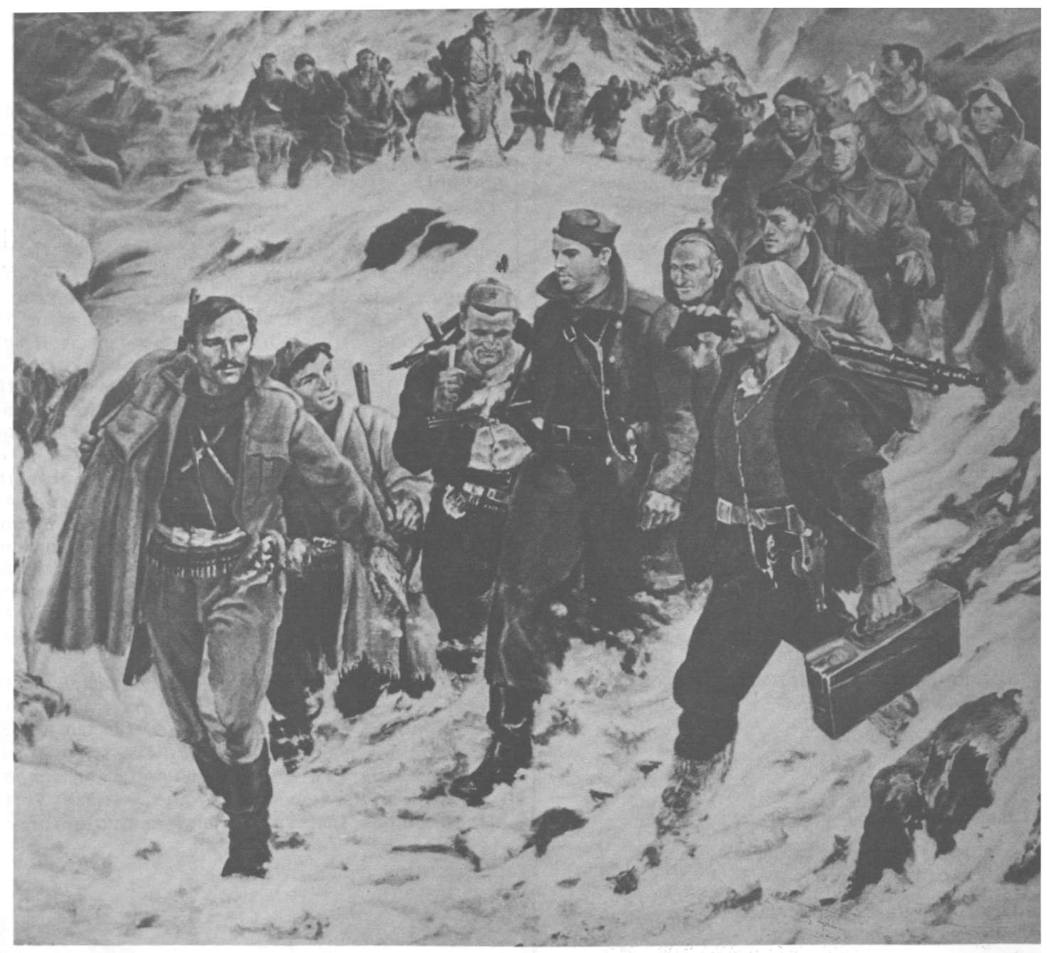
Outflanking the enemy deep behind their own lines, the Albanian National Liberation Army escaped destruction and undertook counter-offensive attacks against the Nazi forces.