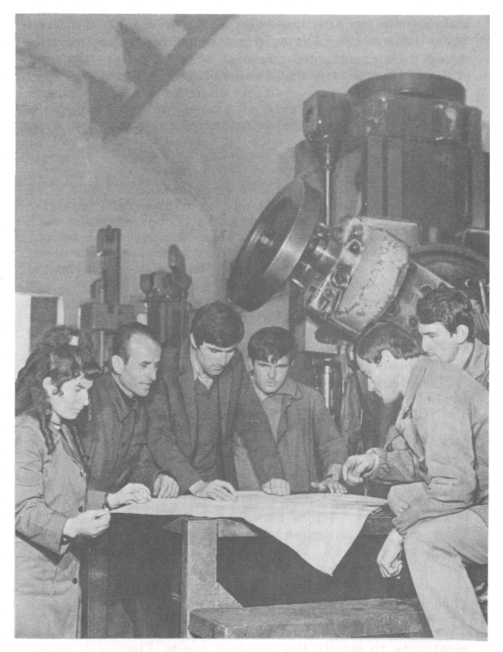
In Albania every worker has a right to his or her job and participates in deciding what is produced and how it is produced.

Socialism is being built in Albania by following the principle of self-reliance. The Albanians have always