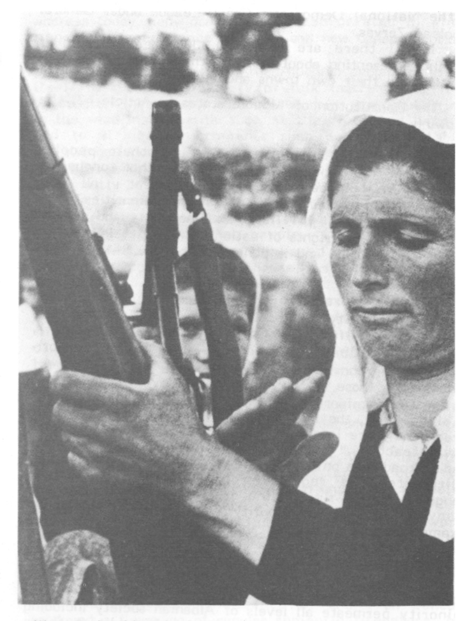
Women in Albania have attained a higher degree of participation in social and political life than in any other country in modern history.

Located in the Dropull area of southern Albania is the center of the Greek national minority, most of whom have been living there for generations, although a few moved there in 1944 because of the right-wing activities