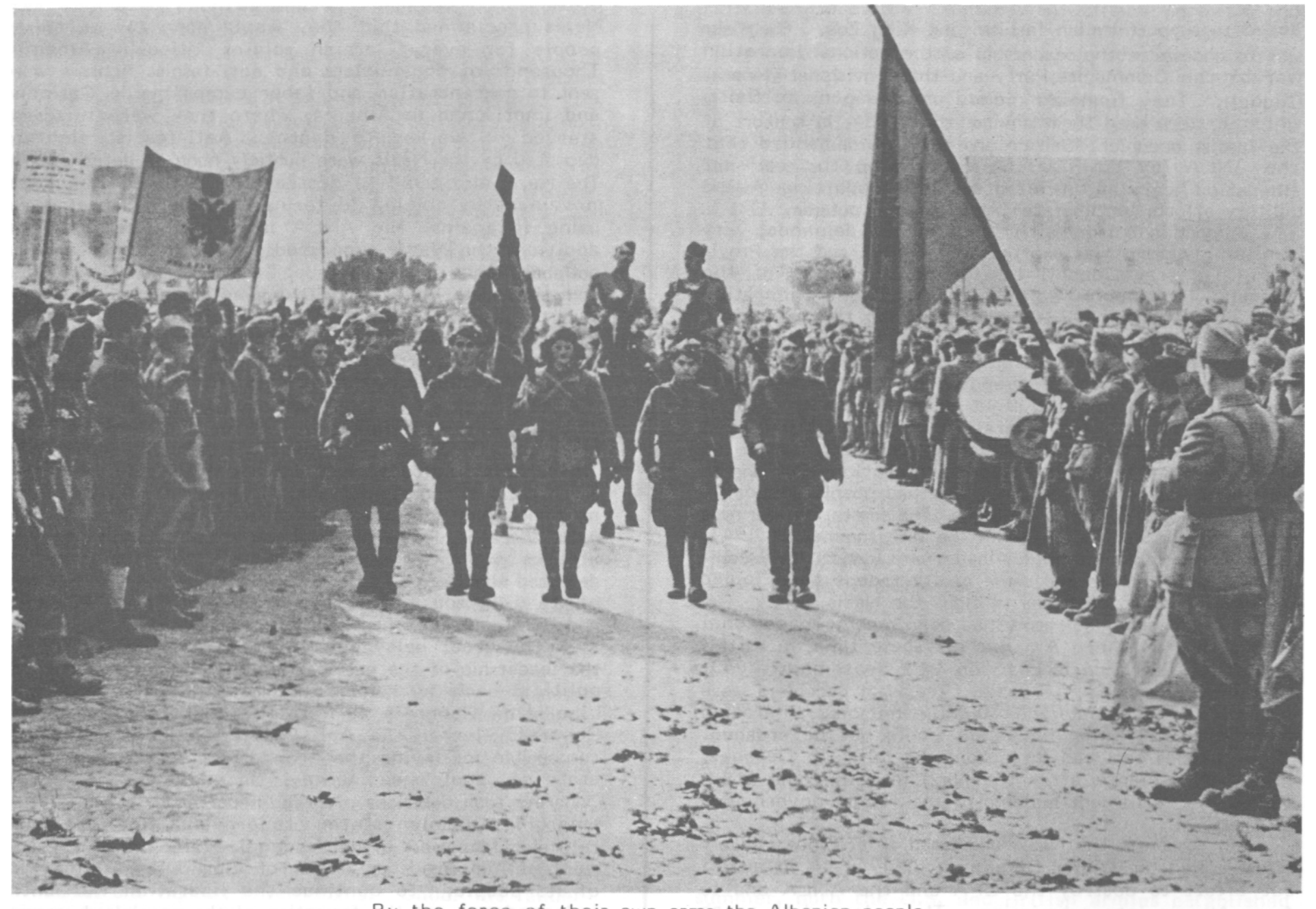
By the force of their own arms the Albanian people expelled the last Nazi troops and proclaimed the establishment of an independent democratic People's Republic of Albania. (ANLA troops march into Tirana, November 28, 1944).