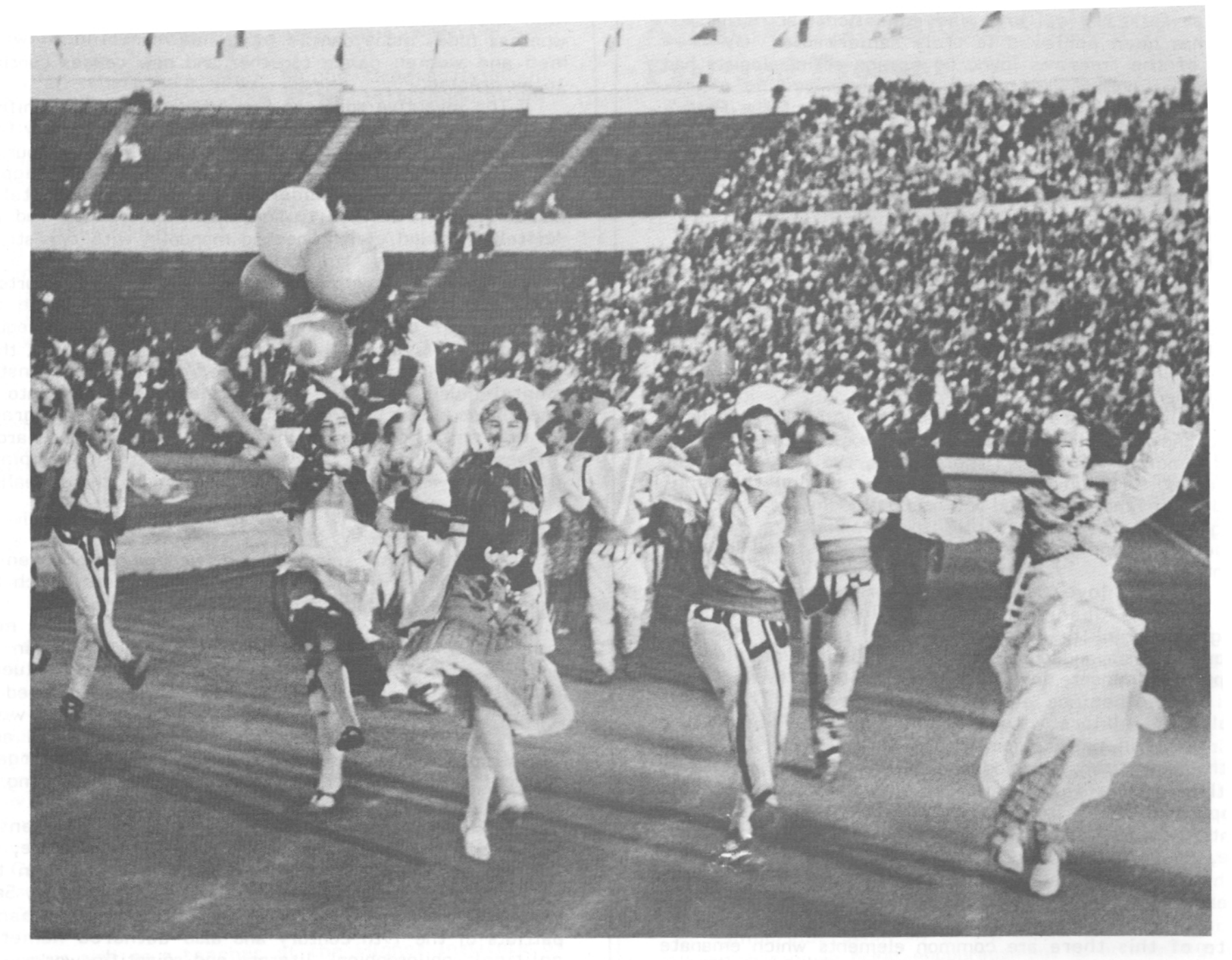
The great wealth of Albania's folk art has been supported and promoted by the people's government.