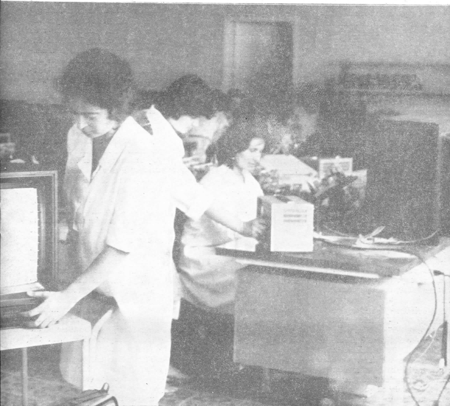
A shop-floor in the Radio-TV plant in Durrës.

In agriculture, the measures implemented under the 1990 plan