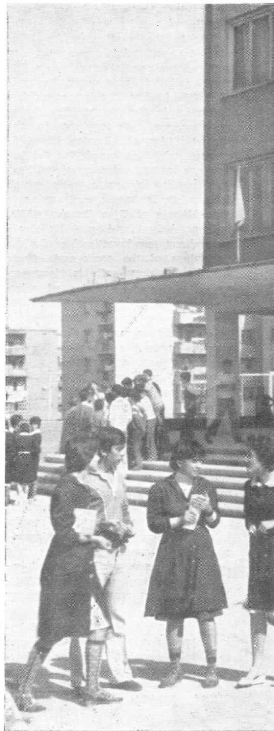
Secondary education is expanding rapidly, including 74 per cent of all pupils from the 8-year schools. In the photo: At one of the secondary schools in the city of Korça.

ges. The teacher's conferences which followed in the regions of Korça, Vlora and Tirana set down a series of tasks for the organization of the educational work, putting the struggle against illiteracy on the order of the day. This problem was treated, at the same time, in the organs of the partizan units. An article entitled