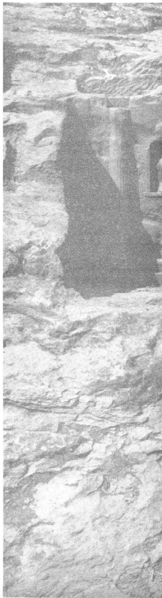
Lower Selca in Pogradec — Monumental tombs hewn in stone, 3rd century B.C.

Doubtlessly linguists had and would for a long time have precedence in the studies of the problems that interest us. The question here was not only about a powerful tradition, but also about the fact that the materials at disposal were mainly of a linguistic character, while archaeological and ethnographic research lagged still behind. So, one of the conditions to come out of this situation was for this research to develop at more rapid rates, putting the study of the culture of the autochthonous inhabitants at the centre of attention, disregarding the traditional orientation which recognized only the culture of the higher strata, the Roman or Byzantine «imperial culture», in the Illyrian regions. Precisely this mistaken starting-point had led to the opinion of the complete Romanization of the Illyrians. The Albanian students carried out this new important orientation with a rich harvest of results, which enable us today to pose the problem of the ethnic and cultural continuity and the autochthony of the Albanians