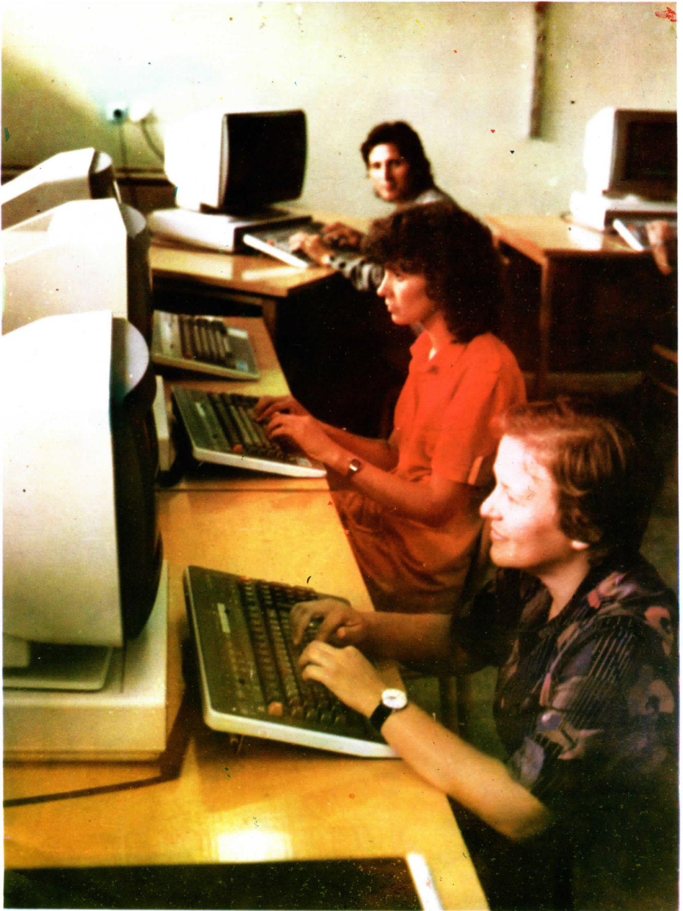
At one of the scientific-research institutions in the capital.