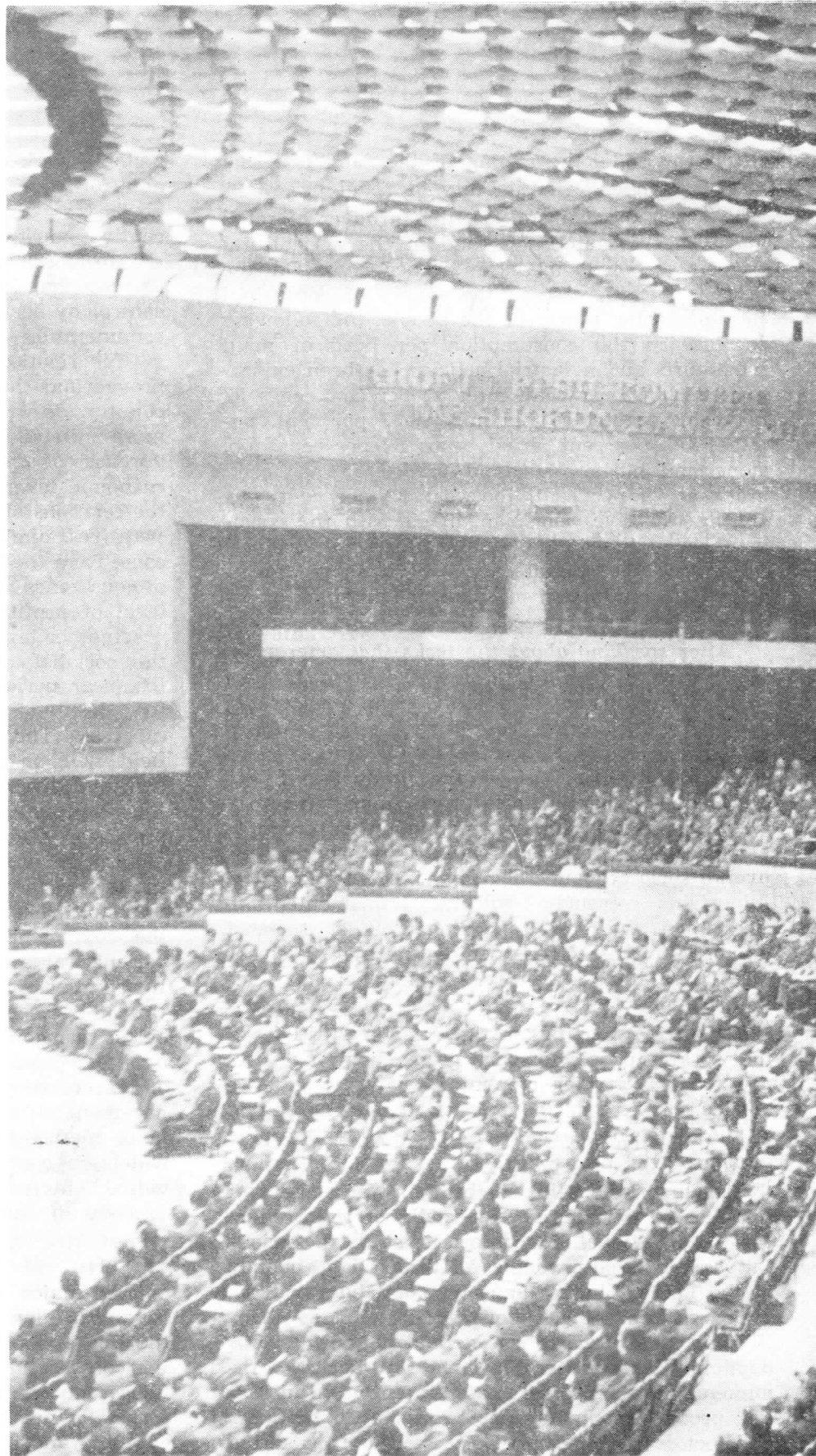
View of the hall.