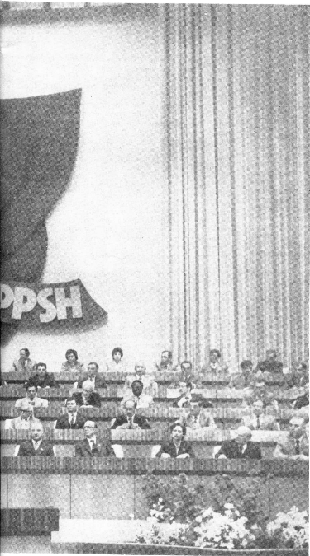
View of the Presidium of the Congress.