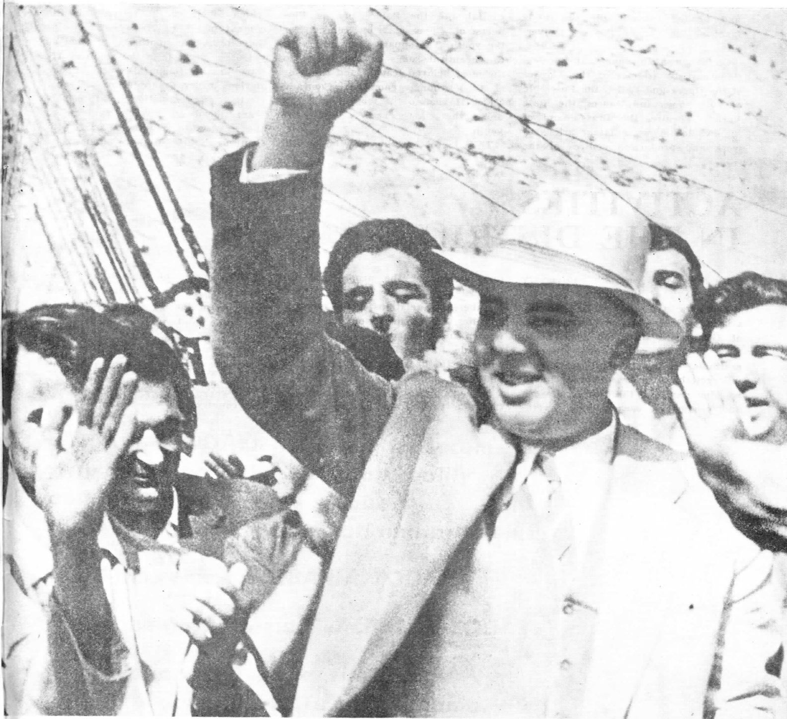
Our unforgettable leader among the builders of the hydropower station at Vau i Dejës in 1967.