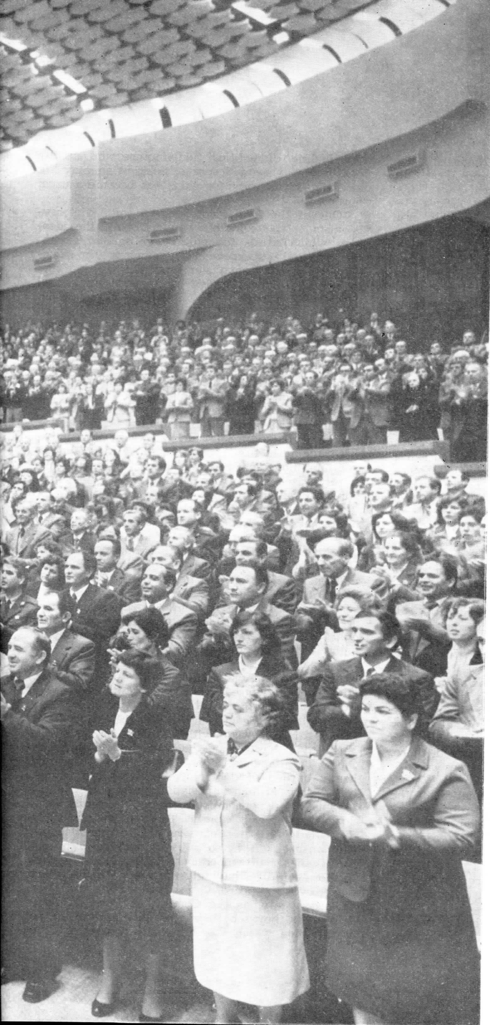
The delegates unanimously endorse the report delivered by Comrade RAMIZ ALIA and enthusiastically applaud to the glorious Party of Labour of Albania.