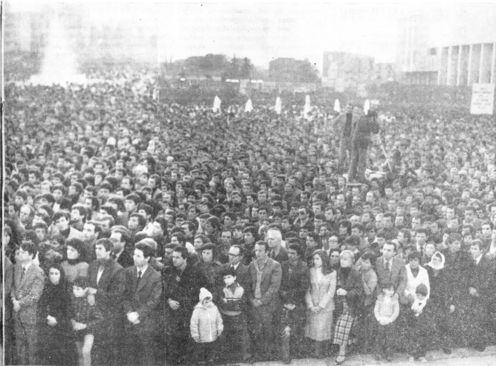
attentively the speech delivered by Comrade Adil Çarçani to the meeting organized on November 8, on the occasion Congress of the PLA and the 45th anniversary of its founding

Our Party and people came to the 9th Congress with a very rich balance of successes and victories in all fields. In struggle with the difficulties of the imperialist-revisionist encirclement and blockade, with the influence of the world economic crisis and with the vagaries of the weather, the working masses, under the leadership of the Party and relying completely on their own forces, fulfilled with success the fundamental tasks of the 7th Five-year Plan of the development of the economy and culture. This is a great victory of historic importance, a living expression of the correctness of the line of the Party, the strength and vitality of true socialism.