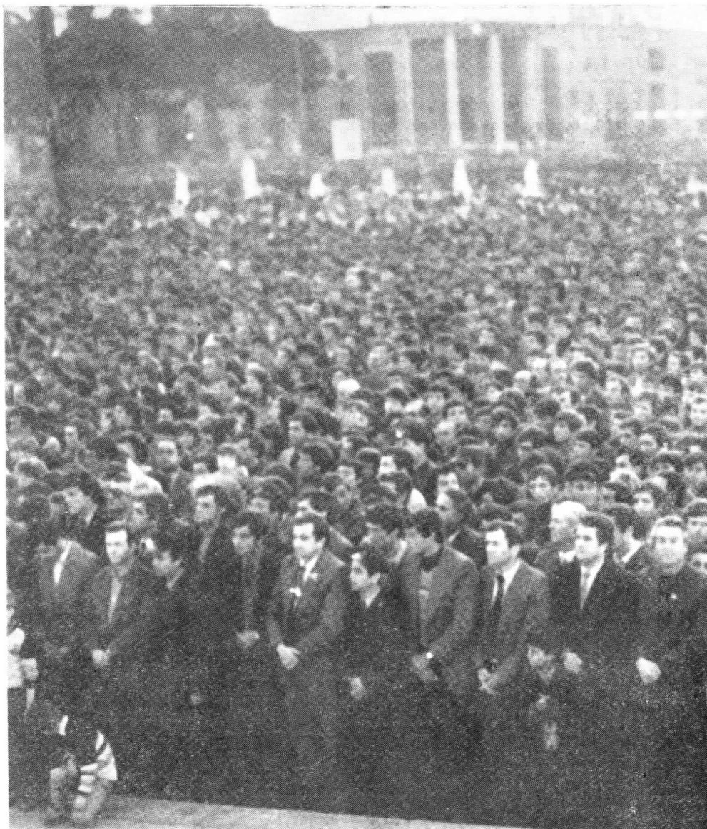
Thousands of people from the capital, gathered in Skanderbeg Square, following the successful completion of the

The 9th Congress of the Party which was a great and wonderful Congress, as is our Party and the people who gave birth to it, crowned its proceedings with complete success. It endorsed the directives of the 8th Five-year Plan and elected with complete unanimity the Central Committee of the Party and Comrade Ramiz Alia, the close collaborator and worthy and loyal continuator of Comrade Enver Hoxha's revolutionary work, as its First Secretary.