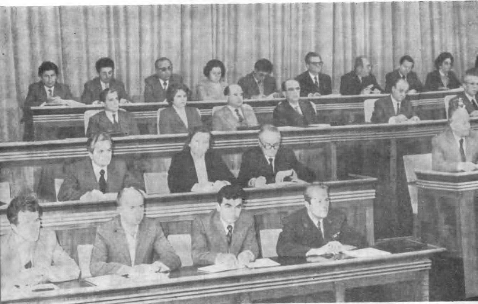
The Presidium of the 4th Session of the 10th Legislature of the People's Assembly

The 4th session of the 10th legislature of the People's Assembly was held from 26 to 27 December 1983.