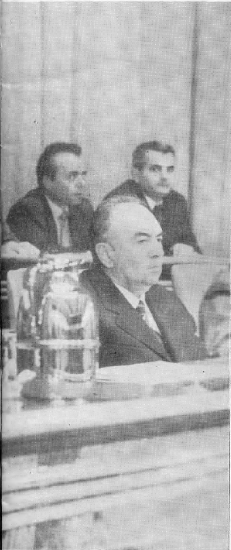
In the first row: Comrades Enver Hoxha, Ramiz Alia and Adil Çarçani

A special target of the draft plan of 1984 is the solution of the problem of finding occupation for the active work force connecting this also with the major tasks that emerge about the increase of the productivity of labour. Next year about 27 thousand work places will