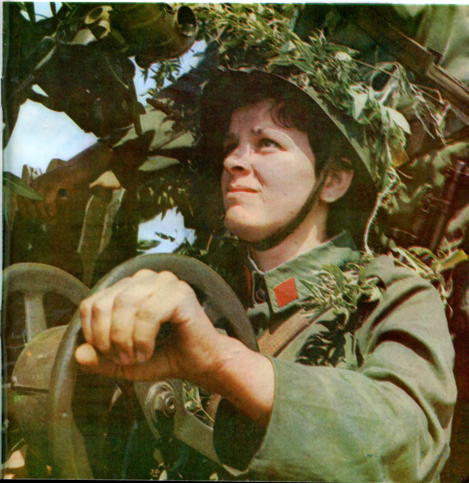
Attentive in training and ready to defend the PSRA.