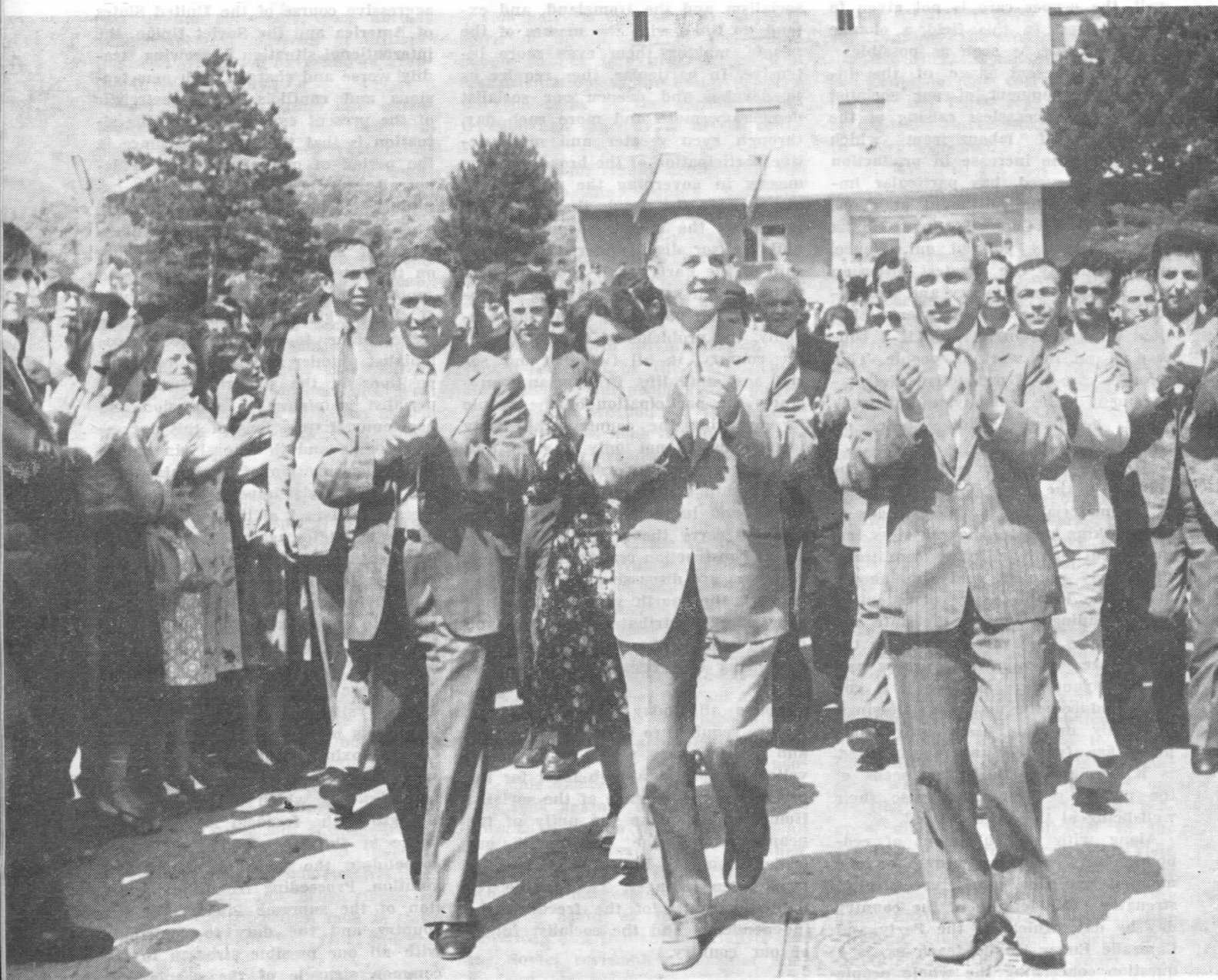
Comrade Ramiz Alia during his visit in the district of Tropoja.

to have their own homeland and state. We are with the peoples of Latin America who want to rid themselves of the barbarous intervention of the American imperialists and the yoke of reactionary oligarchies in the service of Washington. We support the African peoples who are fighting neo-colonialist oppression and exploitation. The Albanian people are following the resistance of the courageous Afghani