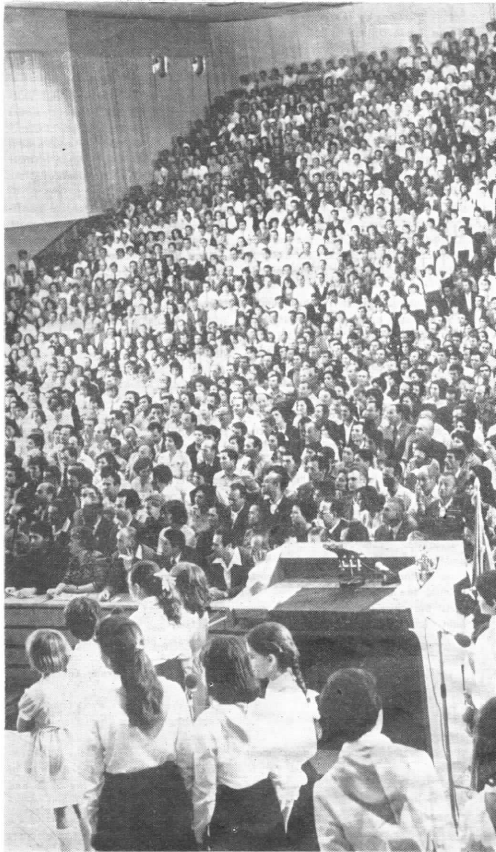
A moment of the greeting of the young pioneers.