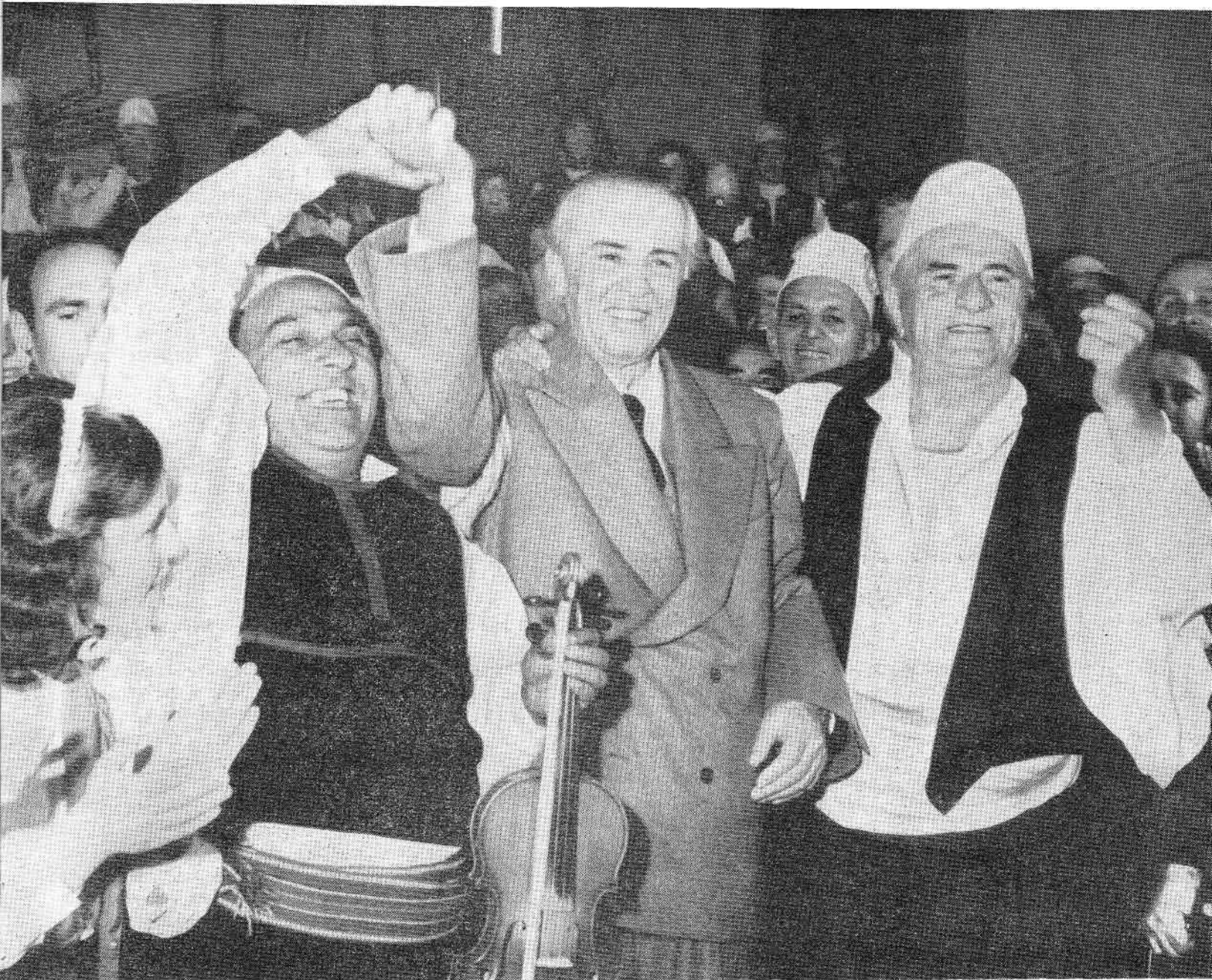
Among the amateurs of the House of Culture of Gjirokastra.

to maintain and even increase its wealth, that is, to oppress the peoples it is already oppressing, and to oppress other peoples who are awakening, while the other, the Soviet revisionists, want to grab the wealth of the peoples, everywhere in the world, to enslave them so that the Brezhnevs and company can feed and fatten themselves on them. Between these two imperialists there are agreements and contradictions, there is even struggle, but at whose expense? At the expense of the peoples. But the peoples cannot tolerate the situation and are standing up to fight; and this fight will mount, step by step.