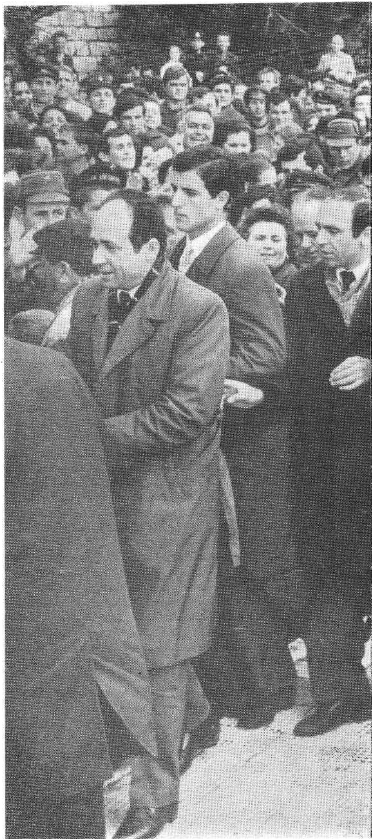
Comrade Enver Hoxha enthusiastically hailed by thousands of inhabitants of Saranda.

Comrade Enver Hoxha showed great interest in the scientific work and gave some very valuable instructions for the future. «You archaeologists and scientists,» said com-