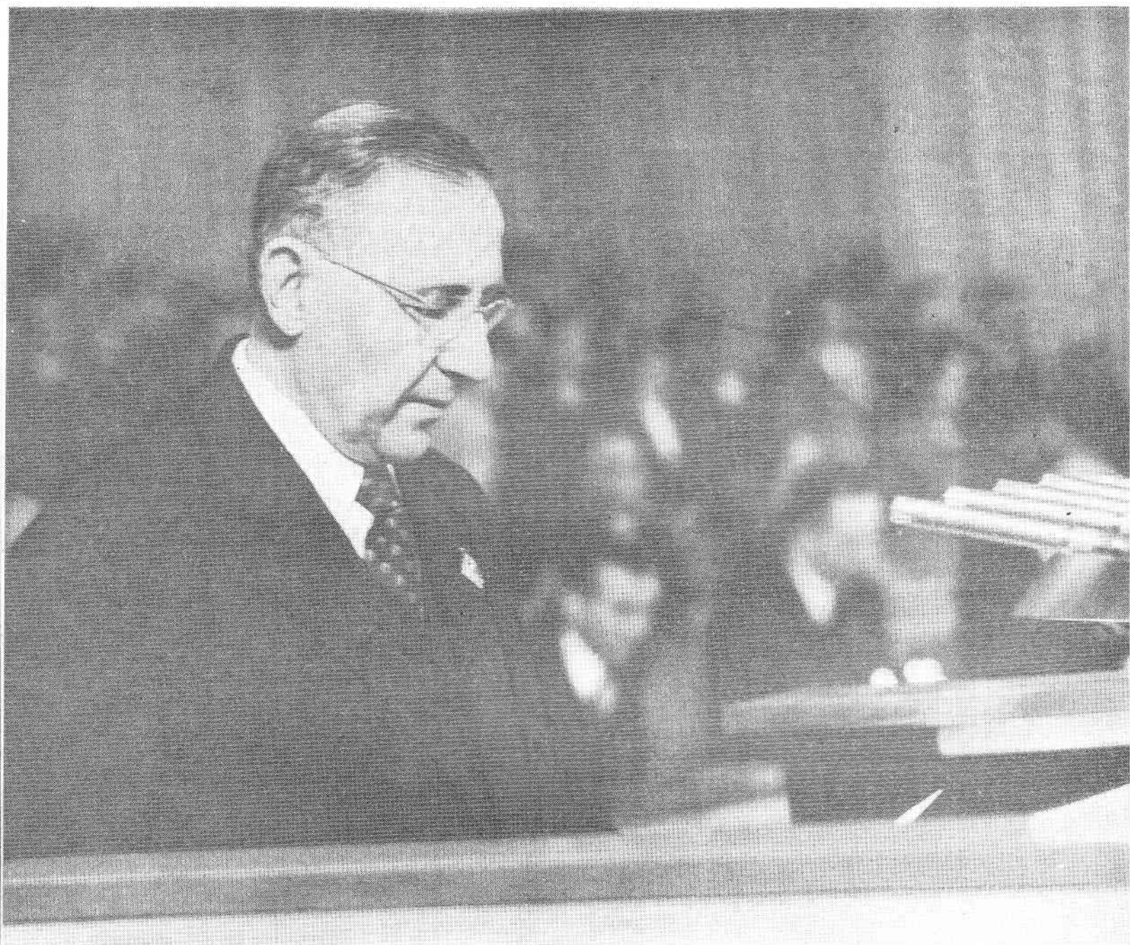
The Member of the Political Bureau of the Central Committee of the PLA and the Chairman of the Council of Ministers of the PRA, Mehmet Shehu submitting his report