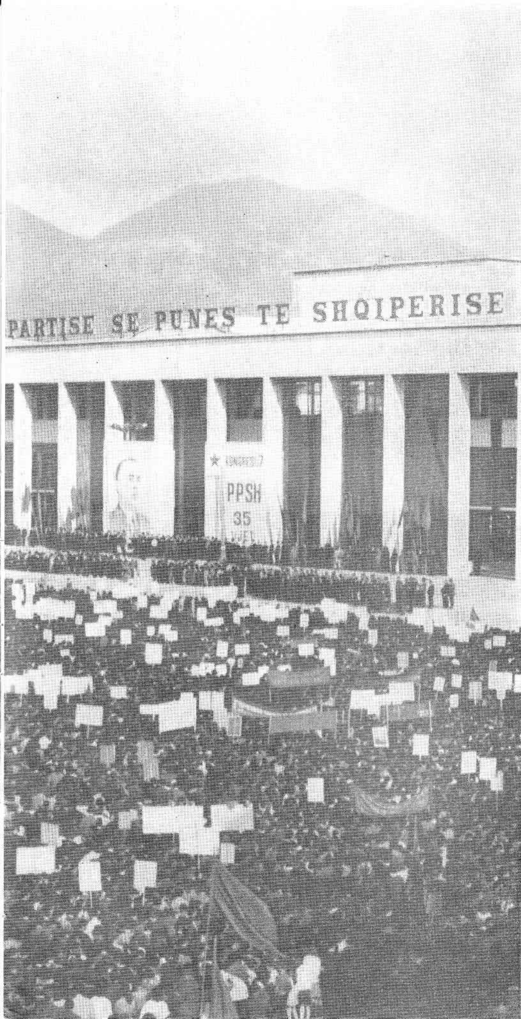
A view of the great rally organized in Tirana on the occasion of the 35th anniversary of the founding of the PLA and its 7th Congress.