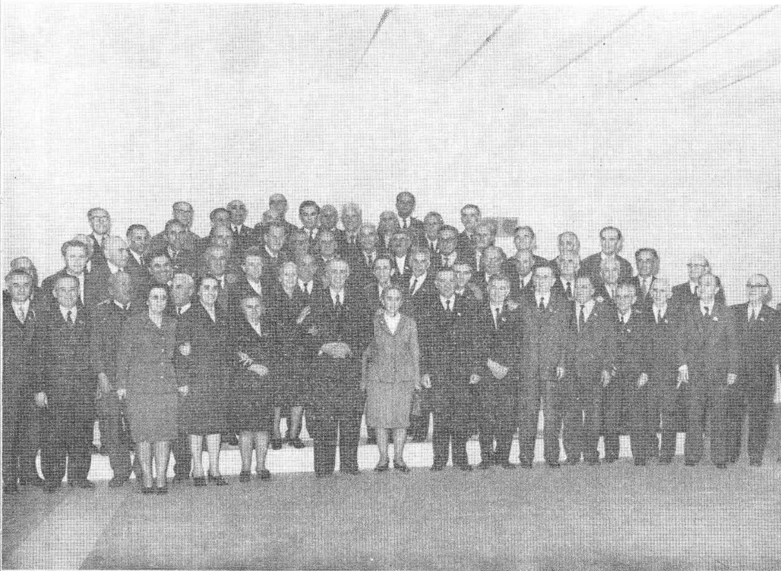
Comrade Enver Hoxha among a group of comrades, members of the Party since 1941