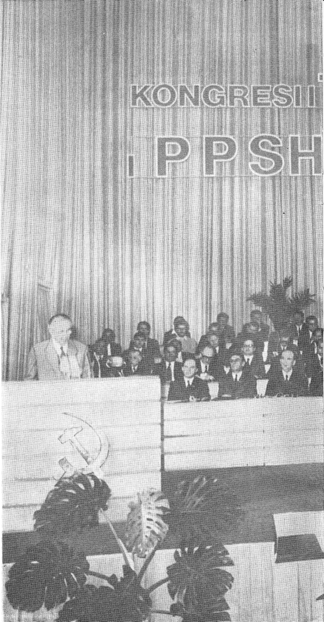
A view of the presidium of the 7th Congress of the PLA, with comrade ENVER HOXHA submitting the Report on the Activity of the Central Committee of the PLA.